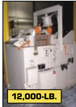
Rowe Cradle Straightener