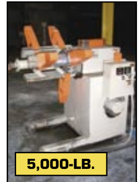
5,000-Lb. Dallas Reel