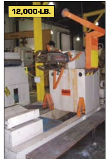
Dallas Reel & Coil Car