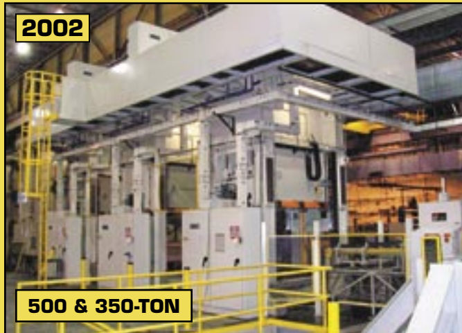
Capitol Technologies Hydraulic Presses

Formerly of MAYTAG Stamping Equipment of a Major Appliance Manufacturer Featuring (40) as Late as 2002 Minster, Bliss, Verson, Niagara, and Capitol SSDC, Hydraulic, Gap Frame, and OBI Presses up to 500-Ton, Press Feed Line Equipment, 30,000-Lb. Rico Die Handler, Mayfran Underground Scrap Conveyor System