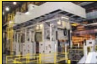
< Capitol Technologies Hydraulic Presses