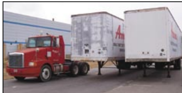
Volvo Tractor & Trailers