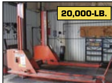
Autoquip Lift Truck Repair Platform