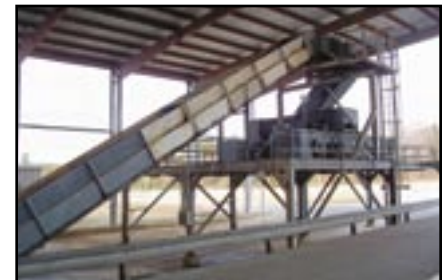
Mayfran Scrap System

Can't make it to the auction in person? Bid live online at