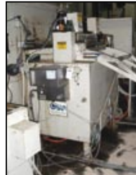
Cooper Weymouth Servo Feed