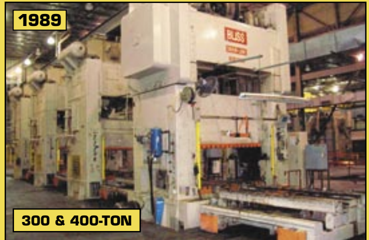
Bliss 300 & 400-Ton SSDC Presses