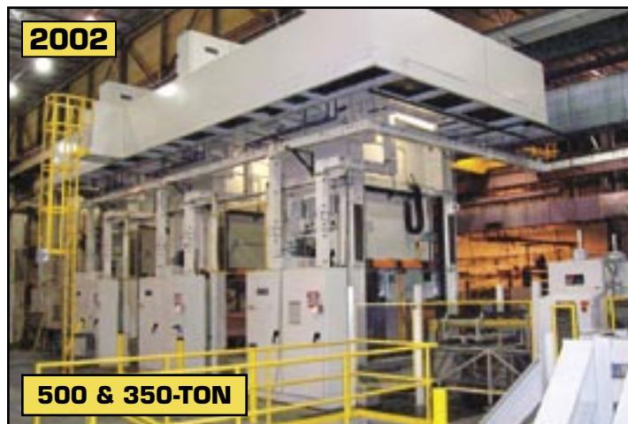
Capitol Technologies Hydraulic Presses

2002 – Union Tool Corp. Stack Feeder , 40" x 40" Max. Blank size, 29" x 29" Min. Blank size, 14" Max. Stack height, 6,500# Max. Stack weight