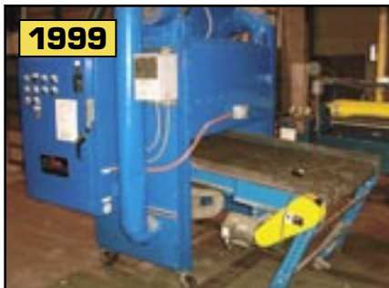
Dri Quick Oven