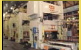
> Bliss 300 & 400-Ton SSDC Presses