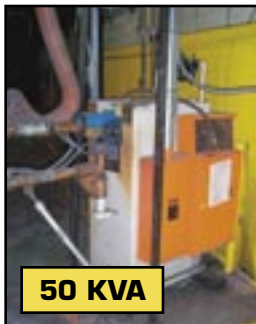
Peer Spot Welder

2002 - 30,000# Rico Electric Die Handler , MDL. #RDHFPRDD-300, 5' x 10' Capacity, Type E, S/N R-12552 5,000# Hyster Propane Forklift , MDL. #550XL, S/N C187V01534M 6,000# Yale Electric Forklift , S/N N778414 3,000# Yale Electric Forklift , S/N N470871 (2) 4,500# Crown Electric Stand-Up Forklifts , MDL. #45RRTT, S/N 1A108128, 1A108144 3,500# Yale Electric Stand-Up Forklift , MDL. #NR035AAML, S/N N470595 3,000# Hyster Electric Stand-Up Forklift , MDL. #R30E, S/N D118H01607N Volvo Tractor , MDL. #DD94, VIN #4V1VDBRF3SN714547 45' Budd Trailer 45' Stoughton Trailer