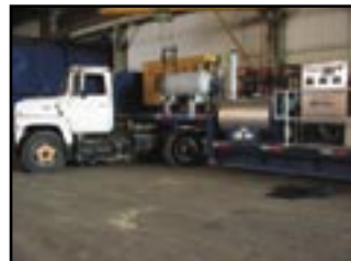
Ford Diesel Truck