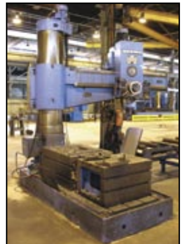
Radial Arm Drill