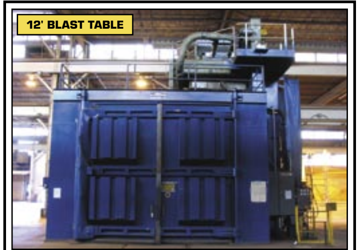
12' BLAST TABLE