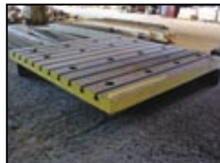
8' x 8' T-Slotted Table