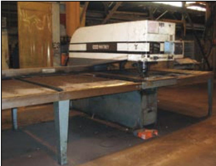
Whitney 2548 Fabricator