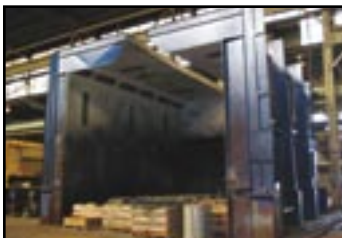
25' x 30' x 20' Paint Booth