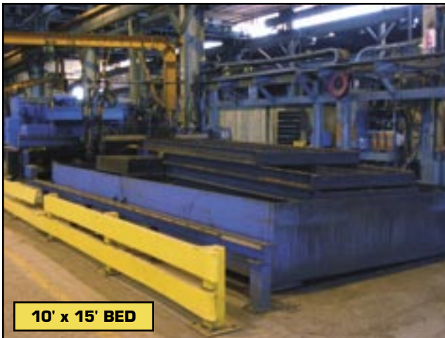
10' x 15' BED