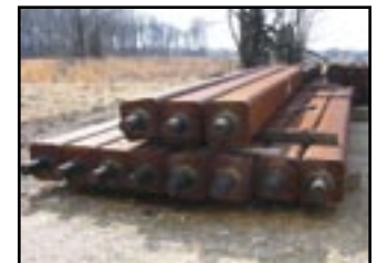
Large Qty. Scrap Metal