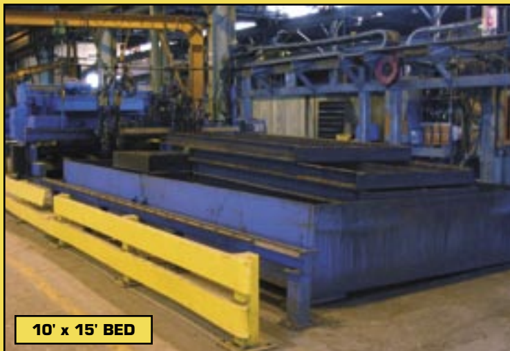
MG Systems 5-Head Plasma Cutting System