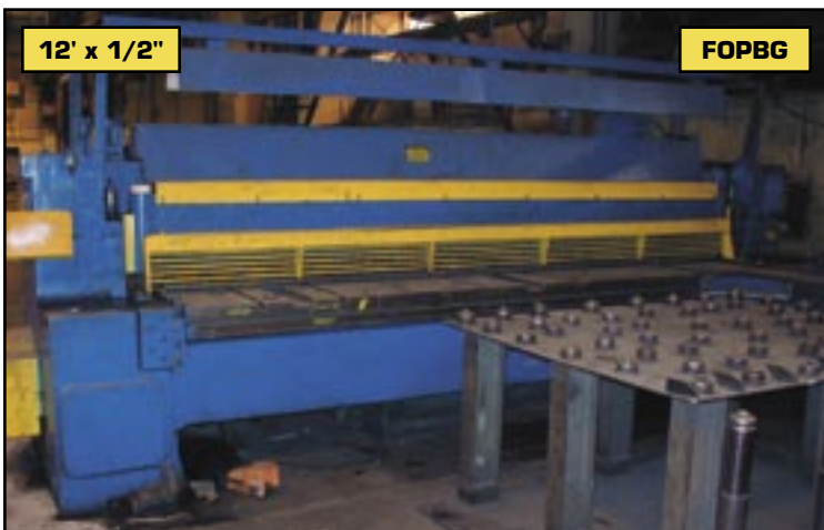
12' x 1/2"