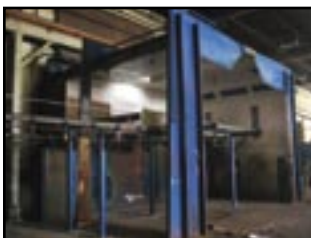
30' x 20' x 18' Paint Booth