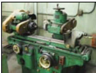
Landis 12" x 28" Universal

Heavy Duty Floor Type & Bench Top Drill Presses