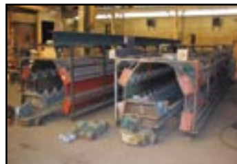
Ceramic Infrared Ovens