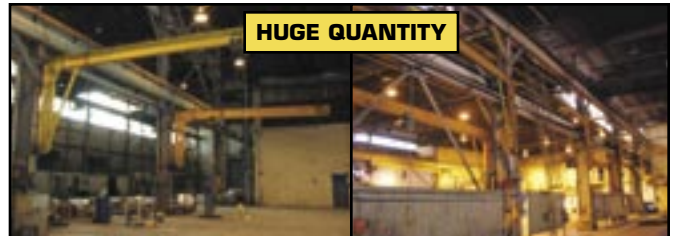
Over 50 Jib Hoists Available – 2,000–6,000 LB, 10'–30'