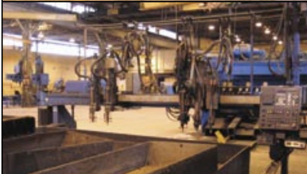
MG Systems 5-Head Plasma Cutting System

Pangborn Blast Cleaning Machine & Dust Collection System , MDL. NF, Approximately 22' x 22' x 15' High Blast Chamber, 12' Diameter Blast Table, Pit Mounted Abrasive Collection System, Built in Top Mounted Dust Collection System to Outdoor 16-Chamber Bag House, 50 HP Blower, S/N 2222NF-701