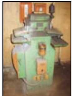
Diamond Wheel Grinder