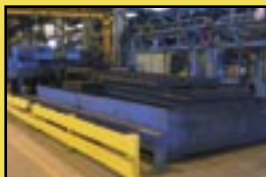
MG Systems 5-Head Plasma Cutting System