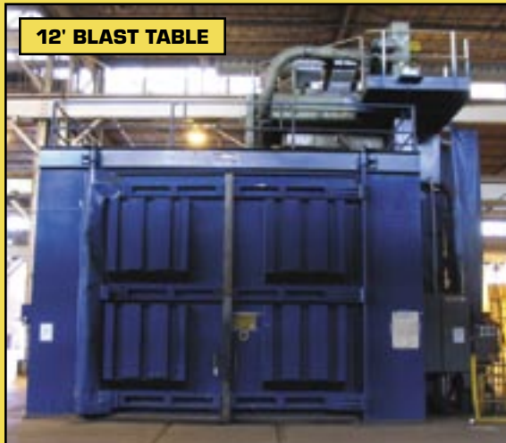
Pangborn NF Shot Blast Cleaning System

Major Metal Fabrication Facility Featuring MG Plasma Cutting System, Plate Bending, Heavy Duty Brakes & Shears, Metal Shop, & Much Much