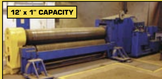
Bertsch Plate Bending Roll