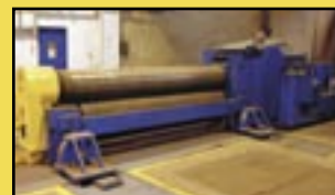
Bertsch Plate Bending Roll