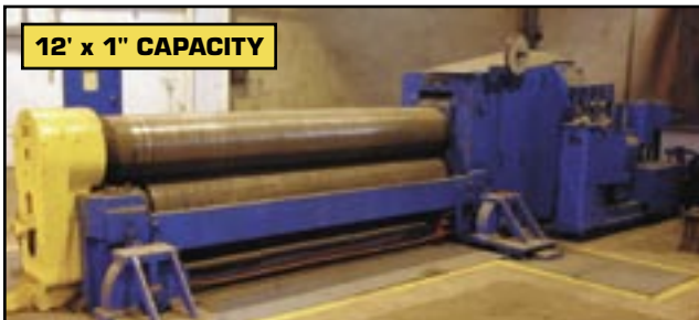
12' x 1" CAPACITY