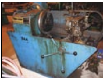
Oster 784 Pipe and Bolt Machine