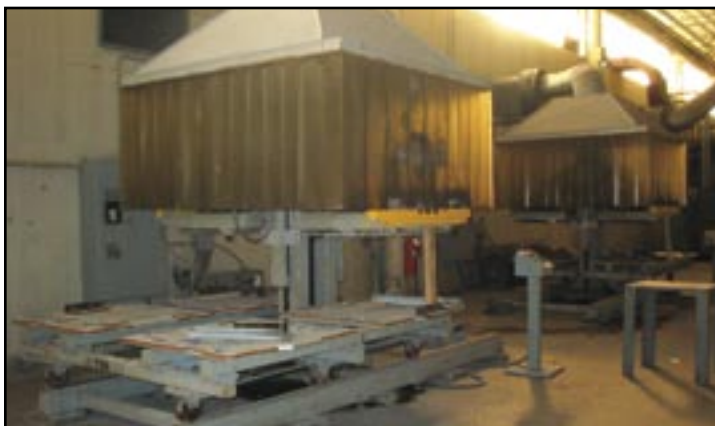
4-Station Core Drilling Machines