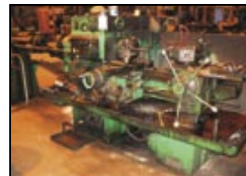
Warner & Swasey Turret Lathe