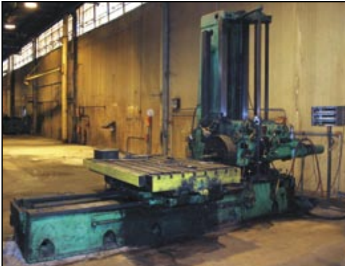
Giddings & Lewis 340-T Horizontal Boring Machine