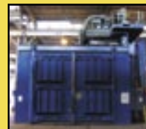
< Pangborn NF Shot Blast Cleaning System

NOW OFFERING IN-HOUSE FINANCING & LEASING. Call 818.508.7034