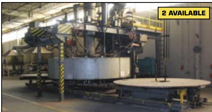
Core Welding Machines, w/12' Rotary Tables

Single Station Core Pack Drilling Machine