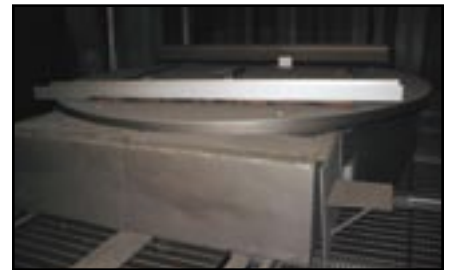
12' Blast Table