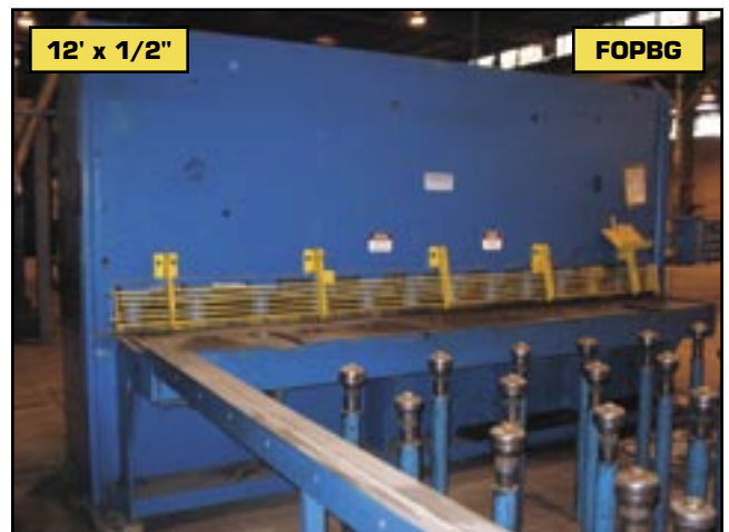
12' x 1/2"