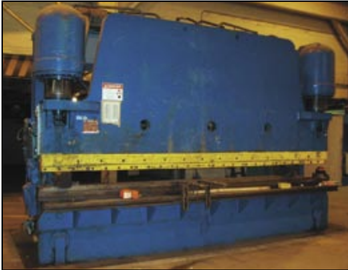
Pacific 600-Ton x 16' Hydraulic Press Brake