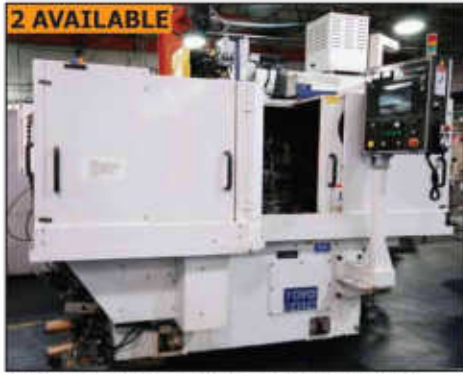
2 AVAILABLE TOYO T-117N CNC centerless internal grinder