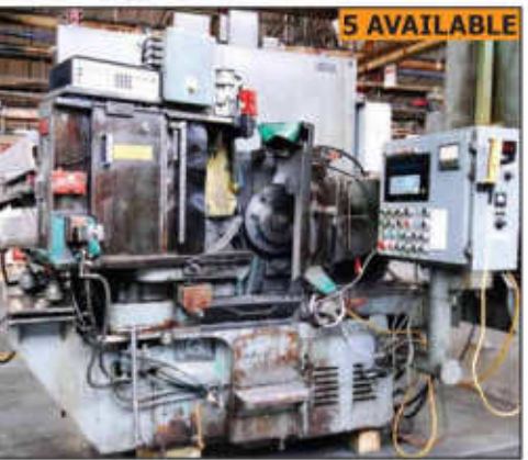
5 AVAILABLE CINCINNATI #1 centerless grinder