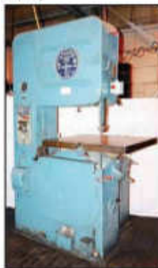
DOALL 26 vertical band saw