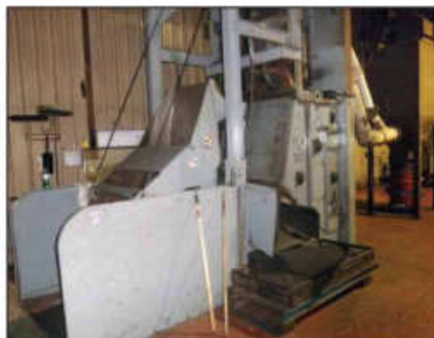
WHEELABRATOR TBS-6 abrasive shot blast with dust collector (SOLD BY PHOTO ONLY)