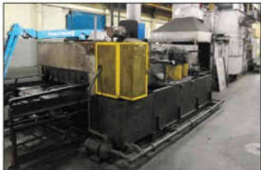
BLAKESLEE tunnel type parts washer