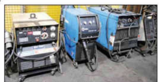
Partial view of welders available

This brochure is only a partial listing. PLEASE VISIT OUR WEBSITE