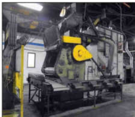
WHEELABRATOR TUMBLAST shot blast cabinet.