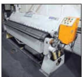
SAMPSON pan brake