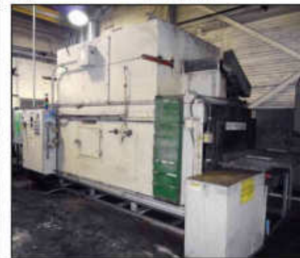
DESPATCH electric tempering oven