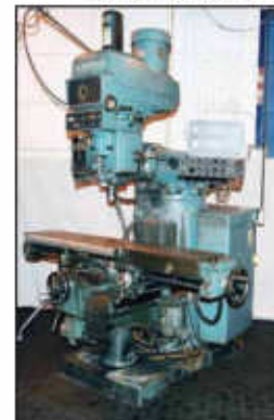
BRIDGEPORT SERIES II vertical mill