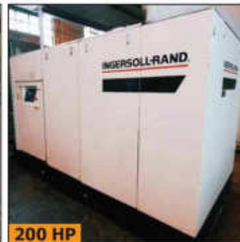
200 HP INGERSOLL RAND air compressor