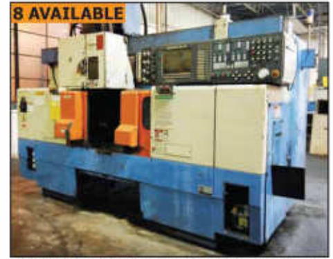
8 AVAILABLE MAZAK MULTIPLEX 410 twin spindle, dual turret, CNC turning centers