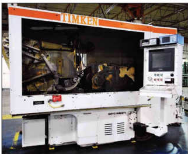
CINCINNATI #2 micro centric centerless grinder