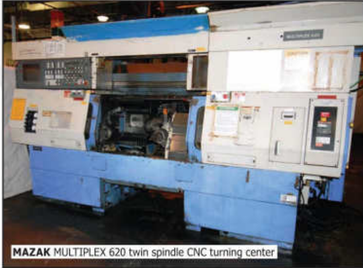
MAZAK MULTIPLEX 620 twin spindle CNC turning center

Surplus Assets from the TIMKEN CANADA LP ST. THOMAS FACILITY