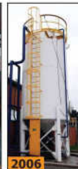
2006 CLEMMER storage tank

FOR MORE DETAILED LISTINGS AND PHOTOS. www.corpassets.com