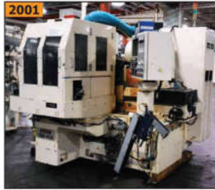
2001 SEIBU TSG-455 NC-RM CNC high precision double disk grinder