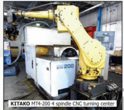
KITAKO MT4-200 4 spindle CNC turning center