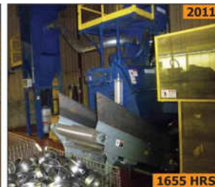
WHEELABRATOR TMS-7-1-25 abrasive shot blast with dust collector (SOLD BY PHOTO ONLY)