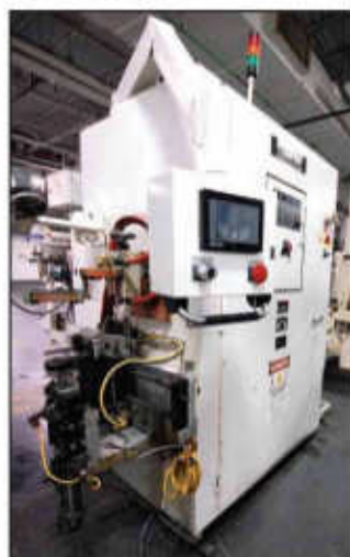
AJAX MAGNETHERMIC induction bearing tempering machine