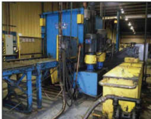
MART TORNADO 60 batch washer (SOLD BY PHOTO ONLY)