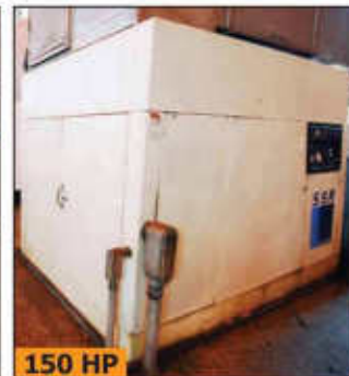
150 HP INGERSOLL RAND air compressor