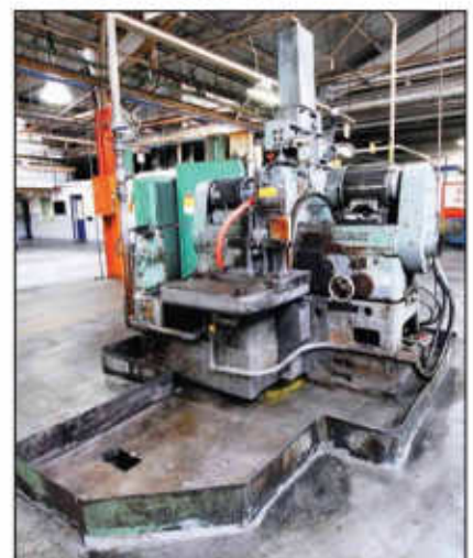
GARDNER 2H30 double disk grinder