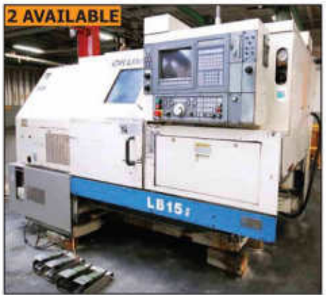
2 AVAILABLE OKUMA LB15II CNC turning center