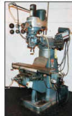
BRIDGEPORT SERIES I vertical mill