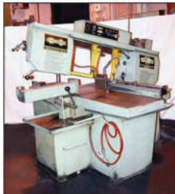
HYD-MECH S-20 horizontal band saw