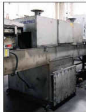
STOELTING AQUAFORCE washer