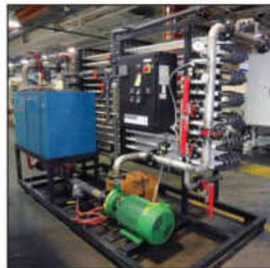
KOCH KONSOL78 filtration system