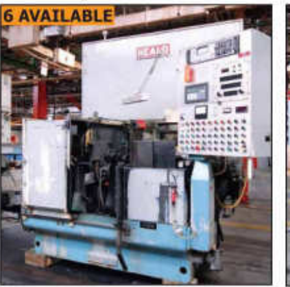
6 AVAILABLE HEALD ICF 90 centri-matic grinder