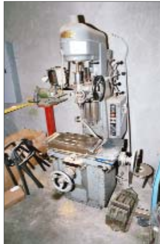
Moore MDL. 1 1/2 Jig Bore