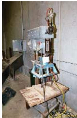
Jet Multi Speed Two Head Drill Press