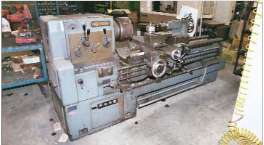
Mori Seiki, MDL. 216 Engine Lathe