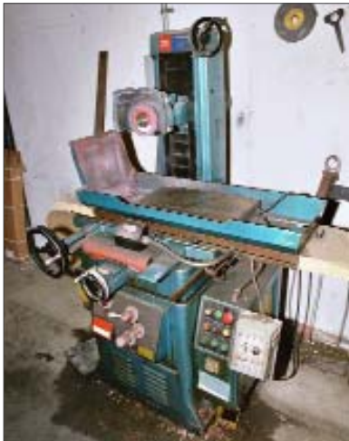
Falcon, MDL. 2A Surface Grinder