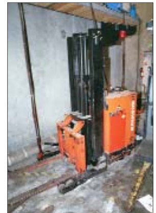
Raymond Stand Up Reach Fork Lift