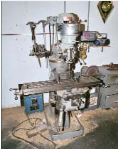
Bridgeport, 9" x 42" Table