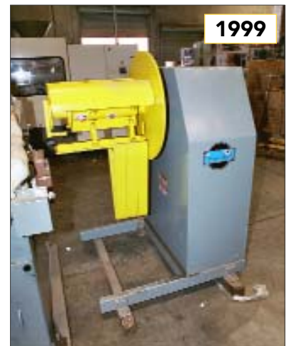
COE, MDL. CPR-PO-4018 Coil Reel