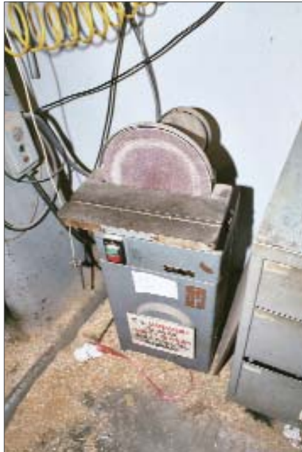
Rockwell 10" Disk Grinder

Arbor Press • Tool Cabinets • Machine Vices • Mass Quantity of 50 Taper Tool Holders With Rack • Die Lift Cart • Diamond Double End Wheel Grinder • Rotary table with 6" Chuck • Strapping Cart • Electric Motors & Much More!