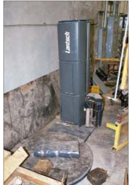
Lantech, MDL. Q- Series pallet Wrapper