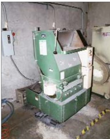
Nelmor, MDL. 61220M1840222196 Plastic Grinder