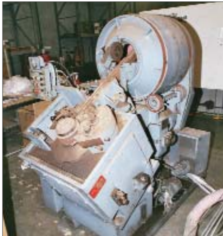
Hartford PTR MDL. 6-1200 Thread Roller