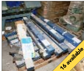
Safescan Electronic I-beams