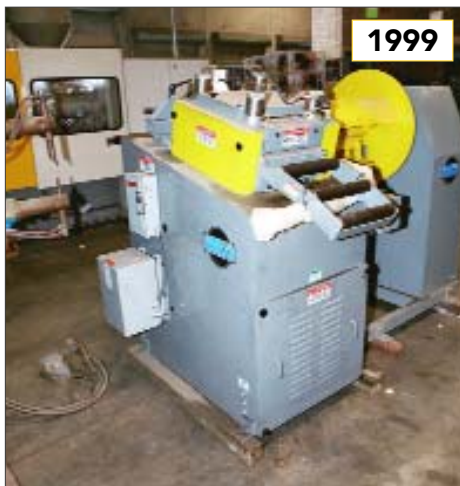
COE, MDL. CPPS-SM-112 Straightener