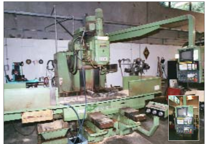
OKK, MDL. MHA 600-L Vertical Machining Center