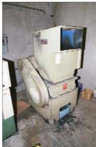
IMS, MDL. LP286-SC Plastic Grinder