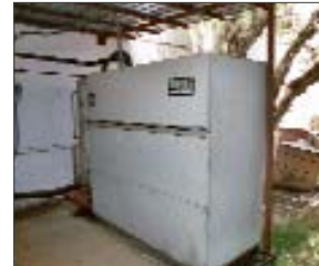
Liebert System 3 Air Dryer