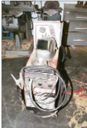
Lincoln Electric Wirematic 250 Arc Welder