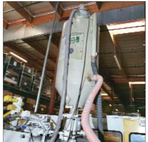
Con-Air Franklin Hopper