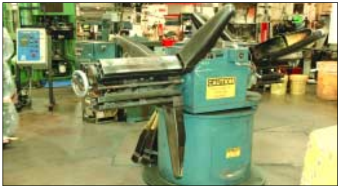
COOPER WEYMOUTH 4,000# X 12" WIDE, DOUBLE END REEL