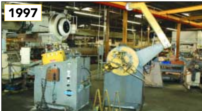
1997 COE 6,000# X 12" WIDE, REEL MDL. CPR-PO-6024