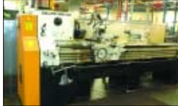
LEBLOND MAKINO ENGINE LATHE