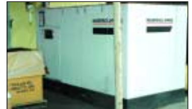
200 HP INGERSOLL-RAND AIR COMPRESSOR