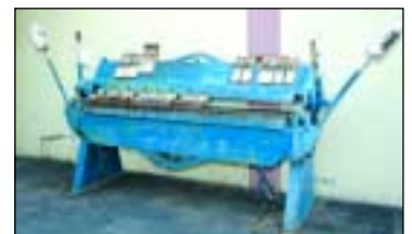
DRIES & KRUMP FINGER BRAKE