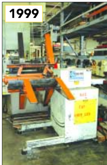
1999/95 6,000# DALLAS, MDL. DPR-624