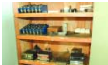
MISCELLANEOUS COLLETS & MAGNETIC CHUCKS