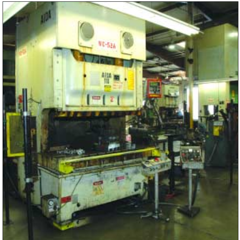
110-TON AIDA, MDL. PC-10(2)