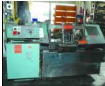
WELLS HORIZONTAL BAND SAW, MDL. W-9