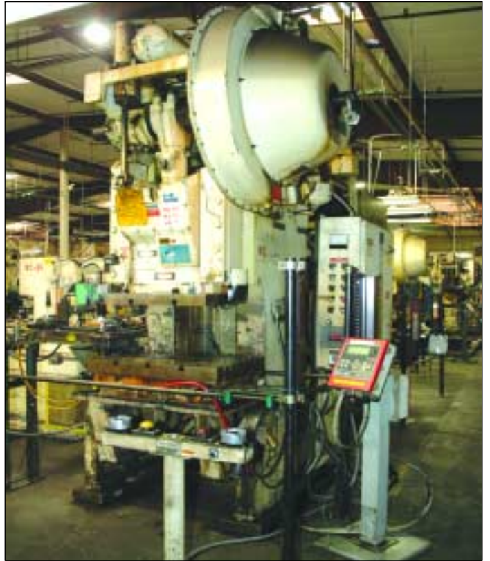
75-TON BLISS, MDL. C-75