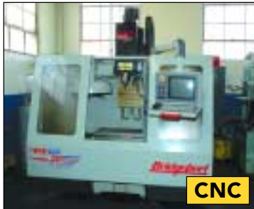
BRIDGEPORT VERTICAL MACHINING CENTER, TORQ-CUT 30