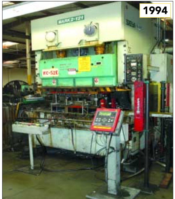
1994 121-TON SEYI-SUTHERLAND DOUBLE CRANK, MDL. MARK 2-121