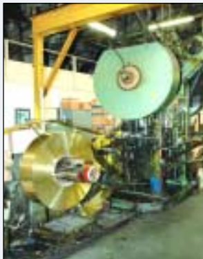
DOOR KNOB LINE