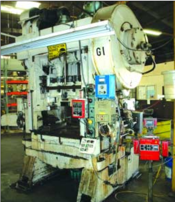
100-TON BLISS STRAIGHT SIDE PRESS, MDL. 6100