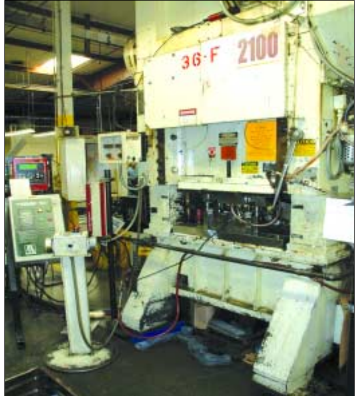
100-TON JOHNSON STRAIGHT SIDE PRESS, MDL. S2-100-36-24FW-A