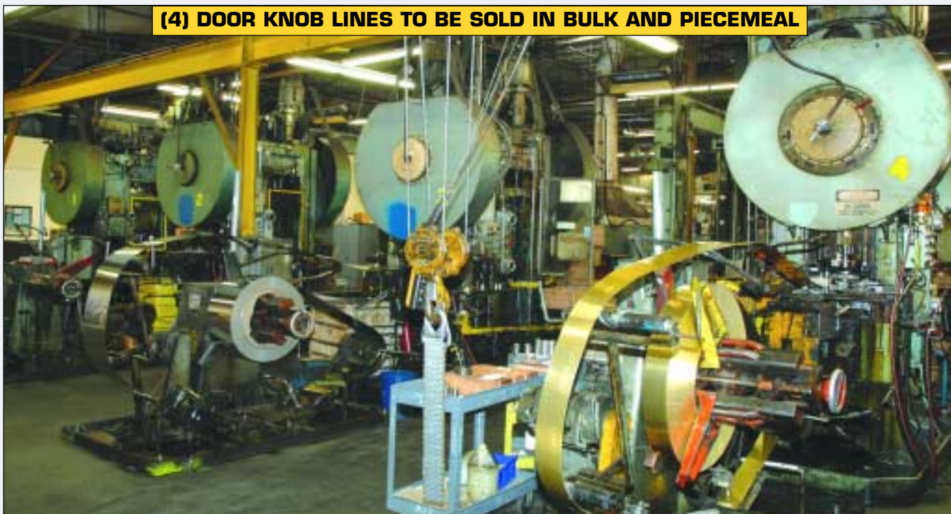
CUSTOM DESIGNED ROTARY PIERCE & DRIFT MACHINES