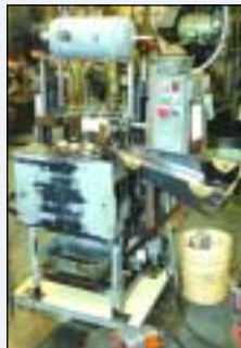
DOOR KNOB LINE