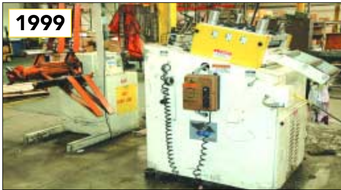
1999/95 6,000# DALLAS, MDL. DPR-624 & COE STRAIGHTENER