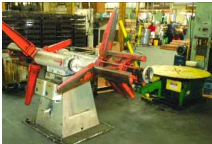
COOPER WEYMOUTH 2,500# X 12" WIDE, DOUBLE END REEL