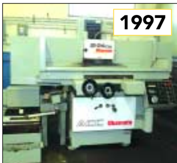
1997 OKAMOTO 12X24 DX GRINDER