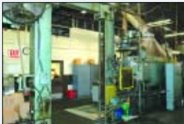
DOOR KNOB LINE