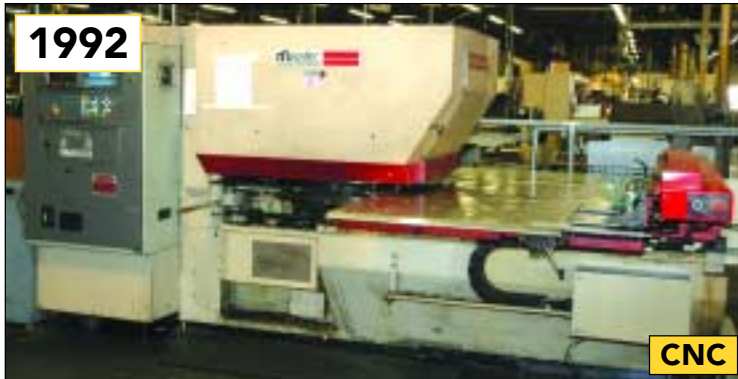
1992 22-TON WIEDEMANN, MDL. CENTRUM 2000Q