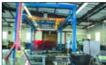
2-TON HARRINGTON CRANE