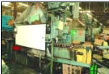
DOOR KNOB LINE