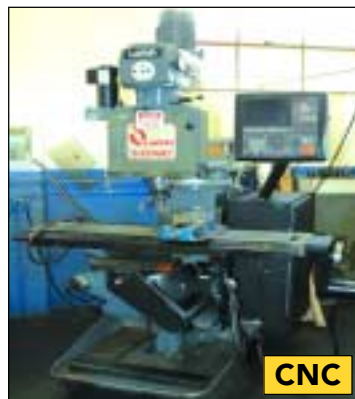
LAGUN CNC VERTICAL MILL