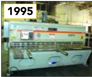
1995 ACCURSHEAR HYDRAULIC SHEAR, MDL. 625010