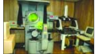
J&L CLASSIC 14T COMPARATOR & CMM