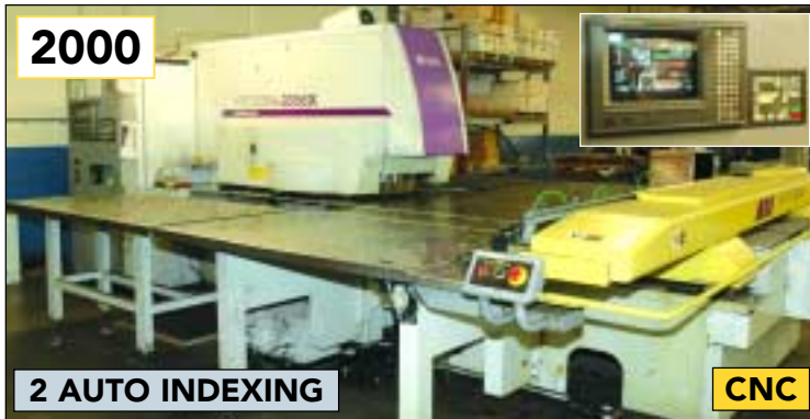
2000 33-TON WIEDEMANN, MDL. VECTRUM 3056ALPHA-UX