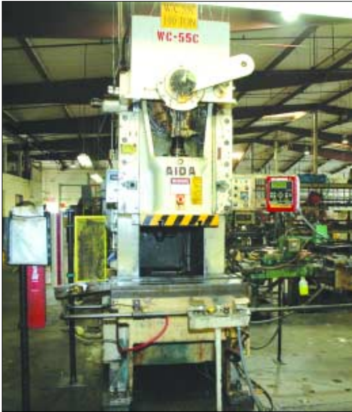
110-TON AIDA DOUBLE CRANK, MDL. C2-110(2)