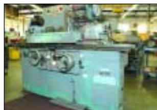
SIGMA OD GRINDER