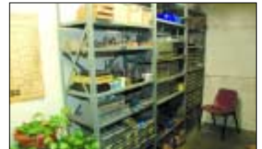
MISCELLANEOUS BITS, TOOLING