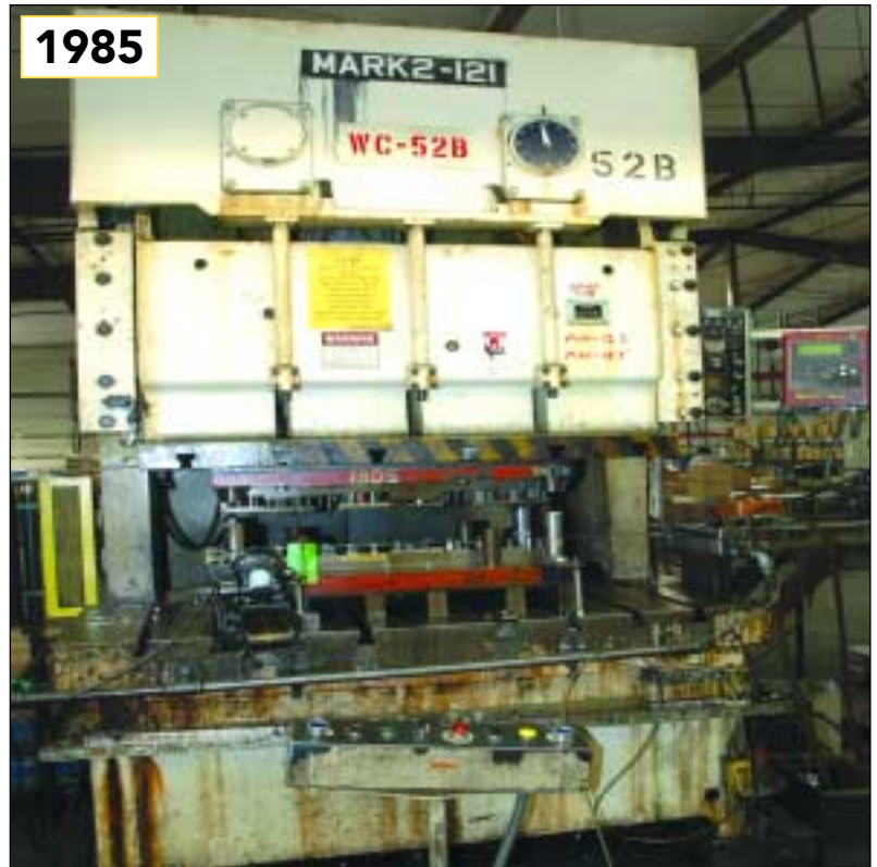
1985 121-TON HELLER SUTHERLAND DOUBLE CRANK, MDL. MARK 2-121