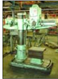
CINCINNATI BICKFORD RADIAL ARM DRILL