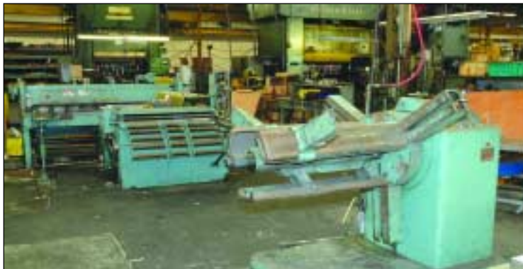
WYSONG CUT-TO-LENGTH LINE