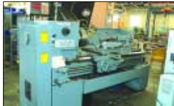
LEBLOND REGAL SERVO SHIFT ENGINE LATHE