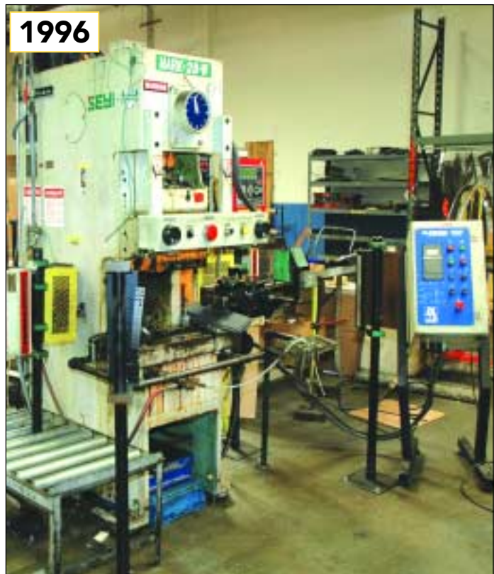
1996 28-TON SEYI-SUTHERLAND, MDL. MARK-28