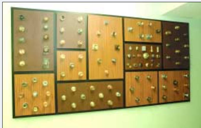
FINISHED DOOR KNOBS

SECONDARY EQUIPMENT: Custom Rotary Machines to Pierce and Drift Doorknobs; Custom Machines to Slot and Lug Doorknobs.