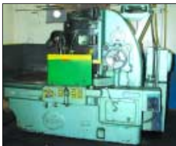
BLANCHARD 36" ROTARY SURFACE GRINDER