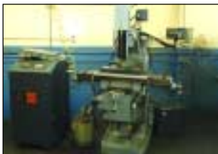
CNC EDM HOLE POPPER