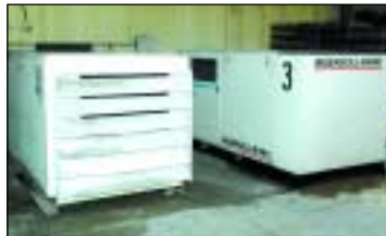
1000 HP INGERSOLL-RAND AIR COMPRESSOR