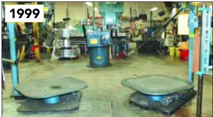
1999 6,000# COILMATE PALLET UNCOILER, MDL. CM6048