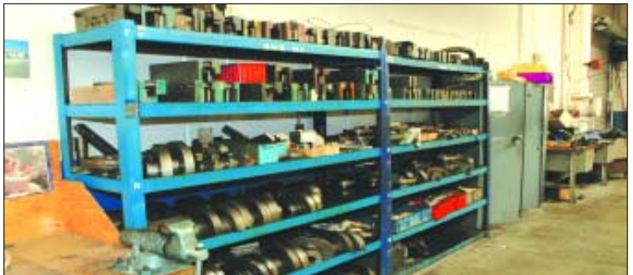
VIEW OF FOUR SLIDE TOOLING

••• LARGE QUANTITIES OF FOURSLIDE TOOLING •••