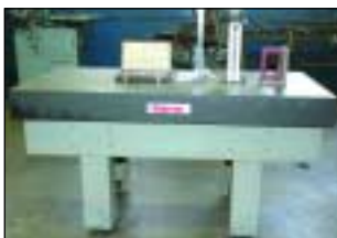
GRANITE SURFACE TABLE & INSPECTION EQUIPMENT