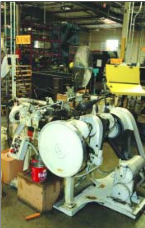
NILSON FOURSLIDE, MDL. 0-F