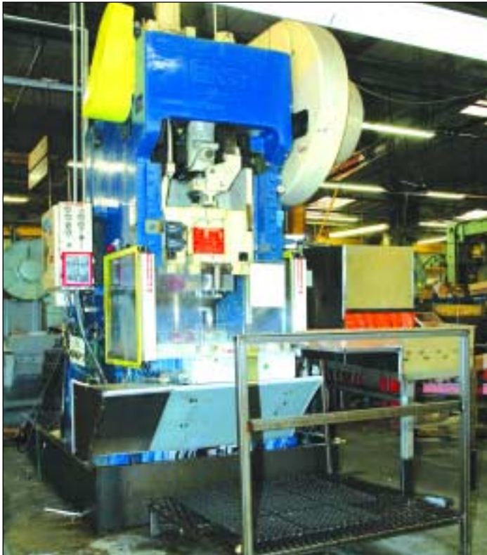
75-TON BLISS OBI PRESS