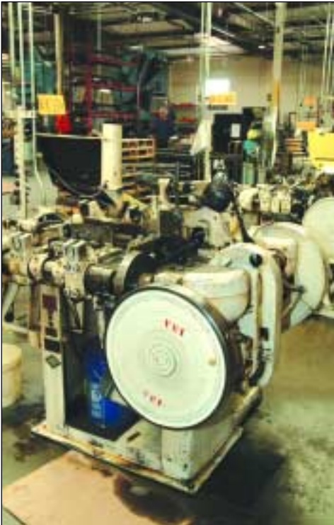
12-TON NILSON FOURSLIDE, MDL. 2-F