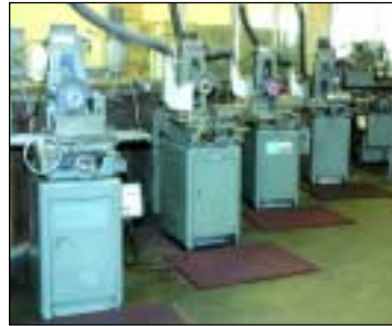
VIEW OF SURFACE GRINDER