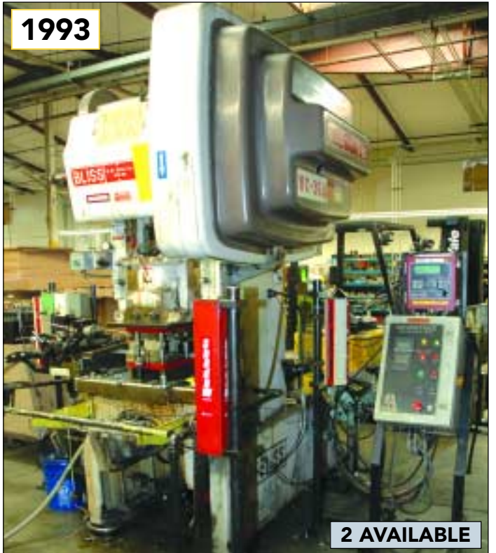
1993 60-TON BLISS OBI PRESS