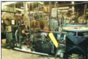
DOOR KNOB LINE