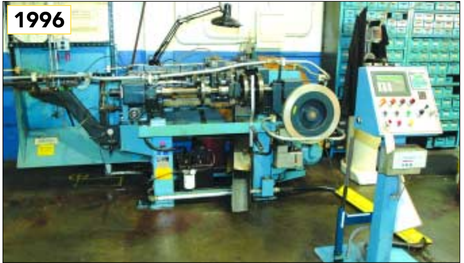
1996 US BAIRD/NILSON, MDL. 752 AUTOMATIC WIRE STAMPING & FORMING