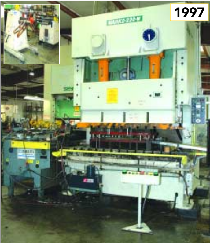
1997 220-TON SEYI SUTHERLAND AUTO STAMPER DOUBLE CRANK, MDL. MARK 2-220-W