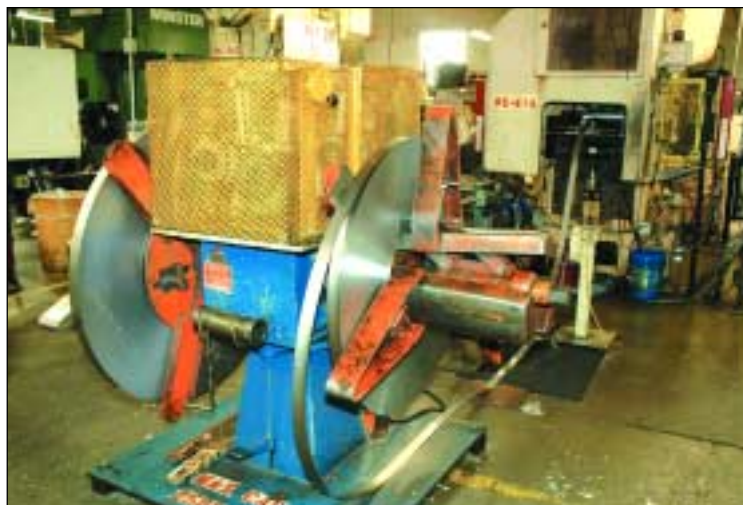
2,500# AMERICAN STEEL LINE DOUBLE END, MDL. 70