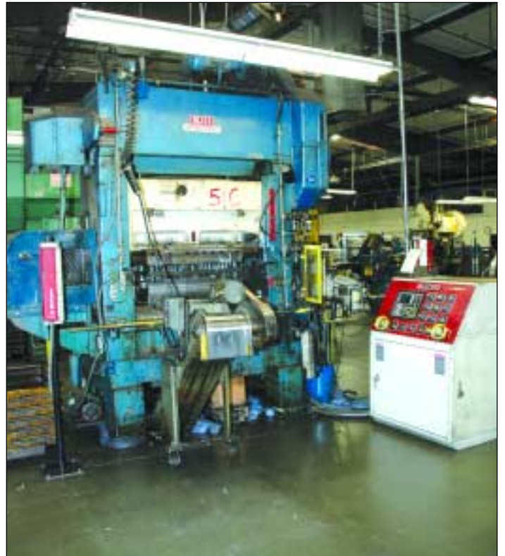
100-TON BLISS STRAIGHT SIDE PRESS, MDL. HP2-100-48-30

TO SCHEDULE AN AUCTION OR APPRAISAL, CALL 818.508.7034