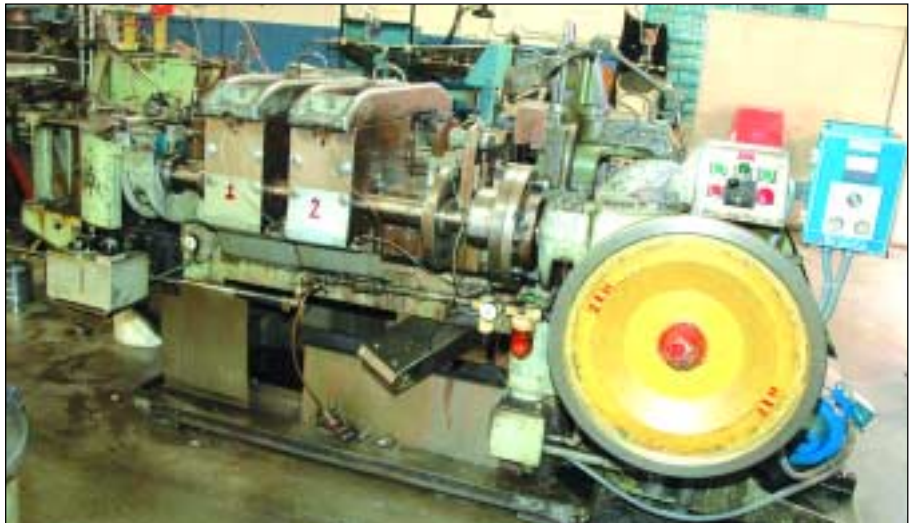
US BAIRD, MDL. 35 MULTI-SLIDE