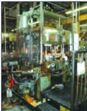
DOOR KNOB LINE