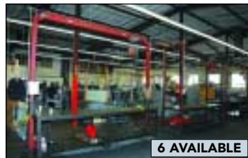
1-TON BRIDGE CRANE