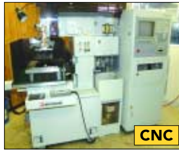
MITSUBISHI CNC EDM, MDL. FW90