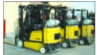
VIEW OF FORKLIFTS