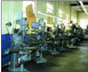
VIEW OF VERTICAL MILLS