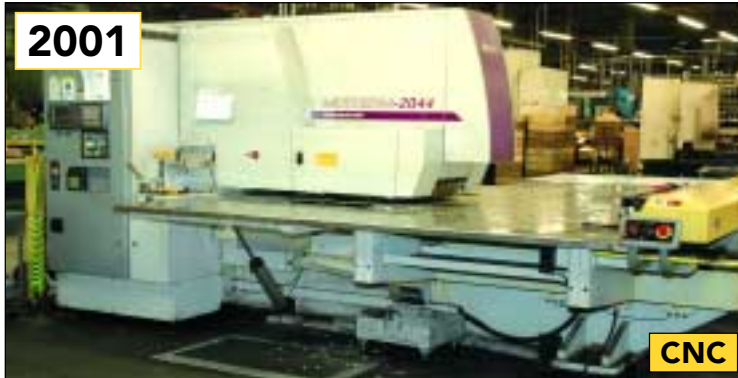
2001 22-TON WIEDEMANN, MDL. MOTORUM 2044