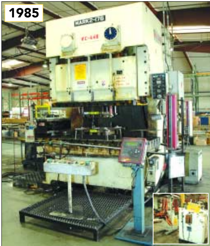
1985 176-TON HELLER-SUTHERLAND DOUBLE CRANK, MDL. MARK 2-176