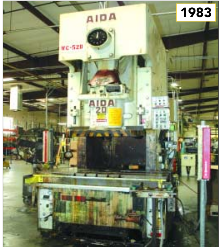
1983 220-TON AIDA, MDL. CI-20(2)