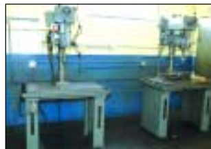
VIEW OF CLAUSING DRILLS