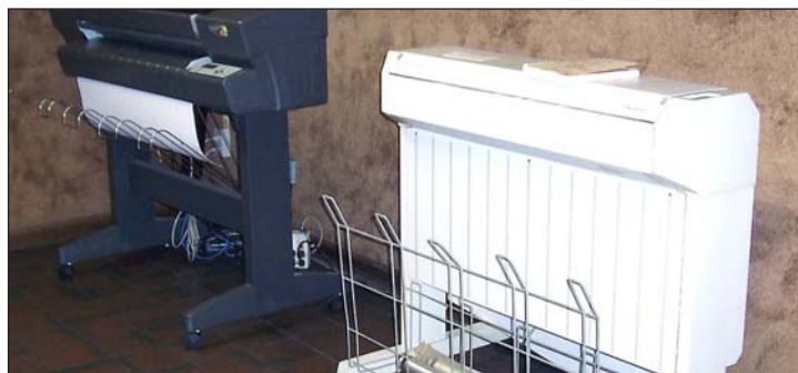
CALCOMP DRAWING MASTER PROFESSIONAL SERIES B&W PLOTTER AND CALCOMP COLOR INKJET PLOTTER