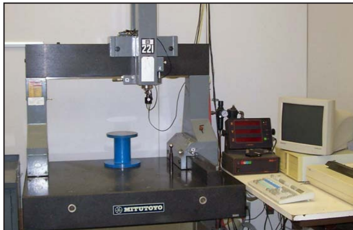
MITUTOYO CMM, MDL B221

OFFICE FURNITURE: Chairs, Desks, File Cabinets, Tables, Shelf Units, Cabinets