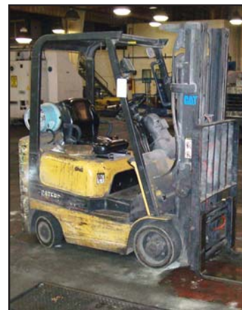
CATERPILLAR 3,500# FORKLIFT