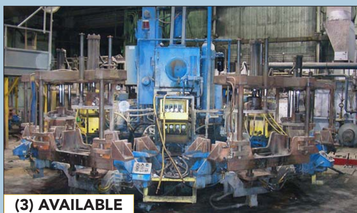
SIX STATION INDEXING CAROUSELS AND TOOLING ENVELOPES