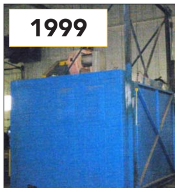
BLUE SURF BOX OVEN