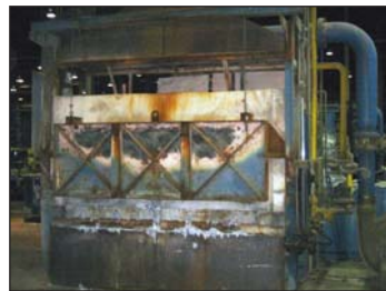
FRANK W SCHAFER ALUMINUM MELTER - (2) AVAILABLE