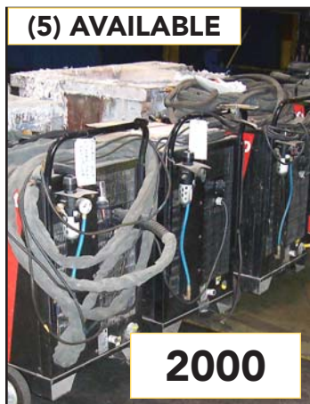
PLASMA POWER SOURCES