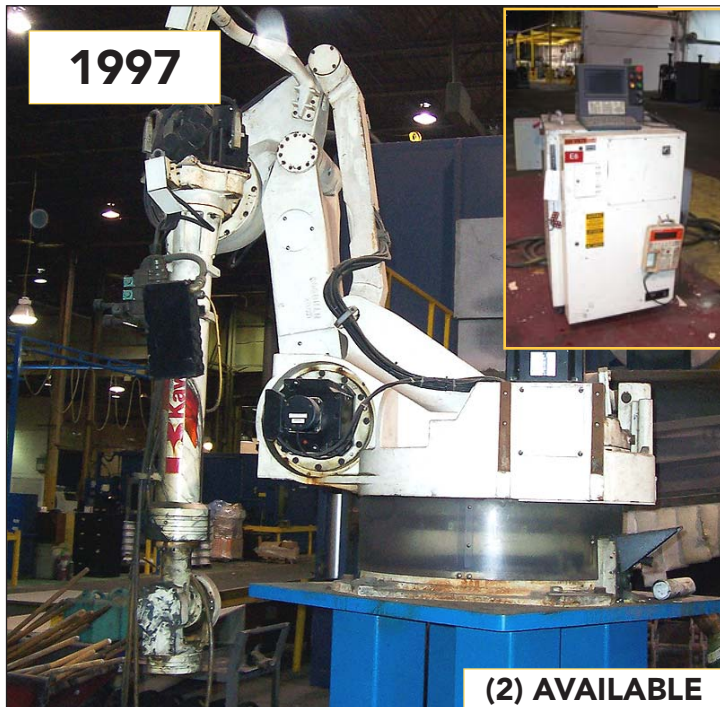
KAWASAKI LOAD & UNLOAD ROBOTS W/CONTROL UNIT