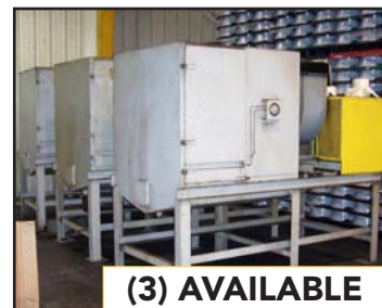
KIRK AND BLUM MIST COLLECTORS