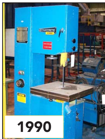
STARTRITE VERTICAL BAND SAW