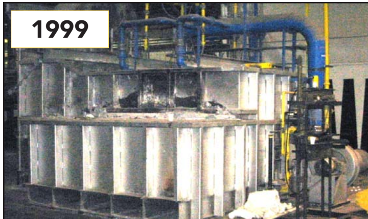
INDIANA REFRACTORY ALUMINUM MELTER