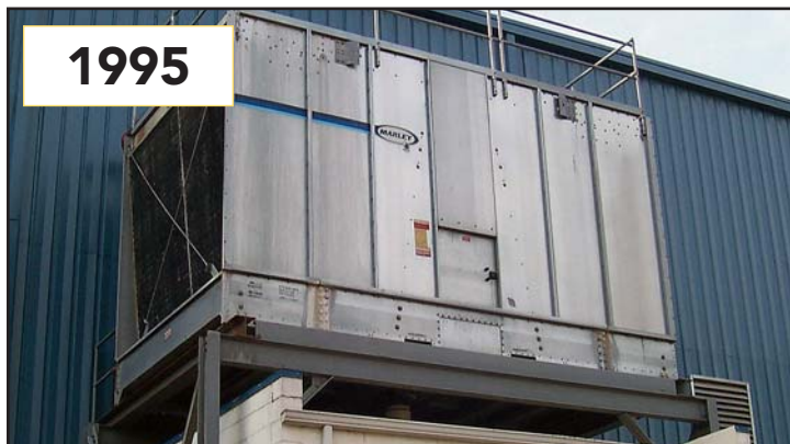
MARLEY COOLING TOWER