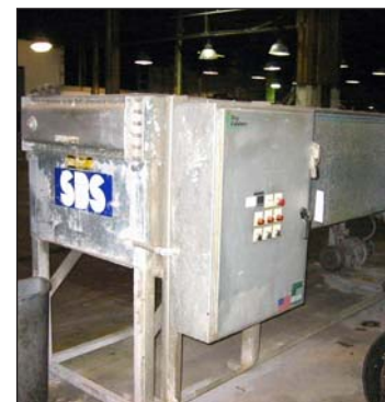
SBS / DRY COOLER HEAT EXCHANGER