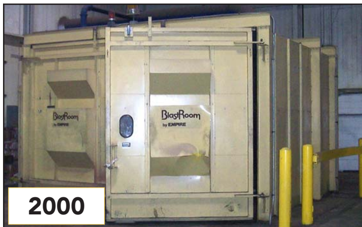
EMPIRE SHOT BLAST ROOM