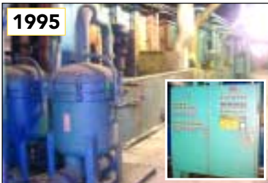
1995 RANSAHOFF WASHER-RINSE-DRYER