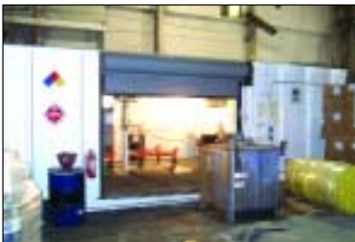
SPRAY APPLICATION BOOTH