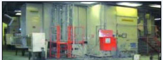
MULTI-MILLION DOLLAR STATE OF THE ART POWDER COAT LINE

For Additional Information or to Download Auction Brochure go to Website or Call: