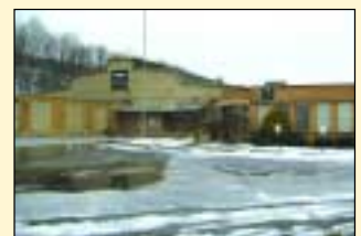
WORLD KITCHEN BUILDING