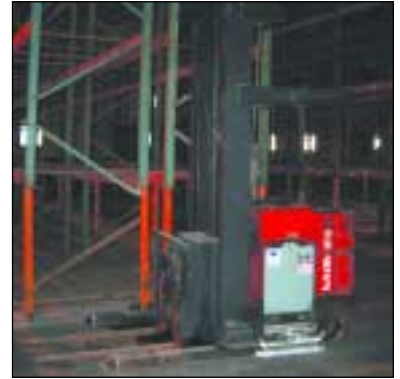
3,000 LB. RAYMOND ELECTRIC LIFT, MDL. 31DR30TT