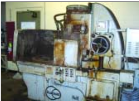
BLANCHARD ROTARY GRINDER, MDL. 18