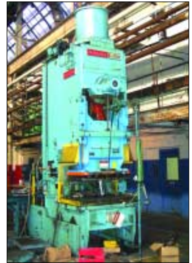
150-TON NIAGARA OPEN BACK INCLINABLE PRESS, MDL. E-150