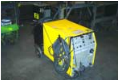
HELIARC 352 WELDER