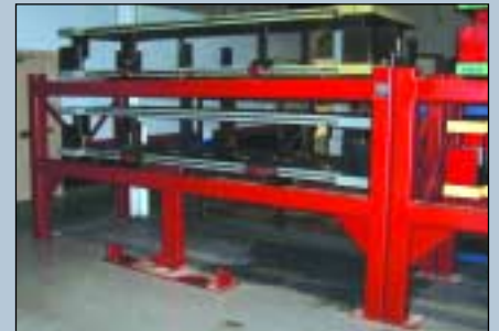
LTS DIE STORAGE RACKS