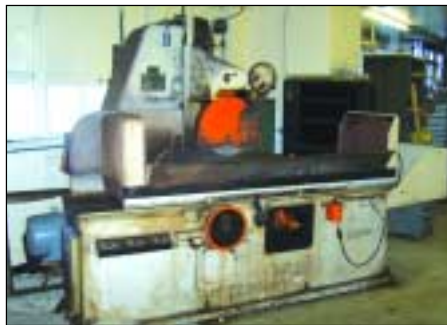
THOMPSON HYDRAULIC SURFACE GRINDER