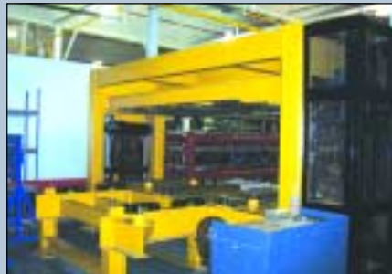
REAR VIEW ALLEGHENY MATERIAL HANDLING DIE MANIPULATOR/SEPARATOR, MDL. DS-200-144/50