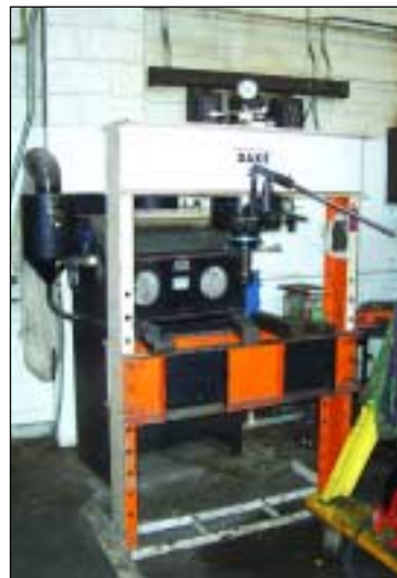
DAKE H-FRAME SHOP PRESS