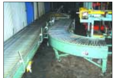
700' HYTROL MOTORIZED CONVEYOR SYSTEM LINES