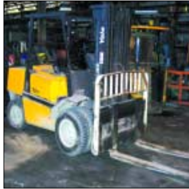
10,000 LB. YALE FORKLIFT, MDL. GLP100MFNSBE093