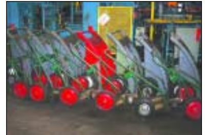
DOLLIES & CARTS