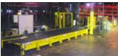
LANTECH PALLET WRAPPER, V-SERIES