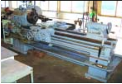
MONARCH ENGINE LATHE