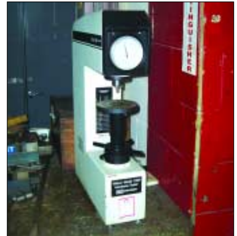
ROCKWELL/WILSON HARDNESS TESTER