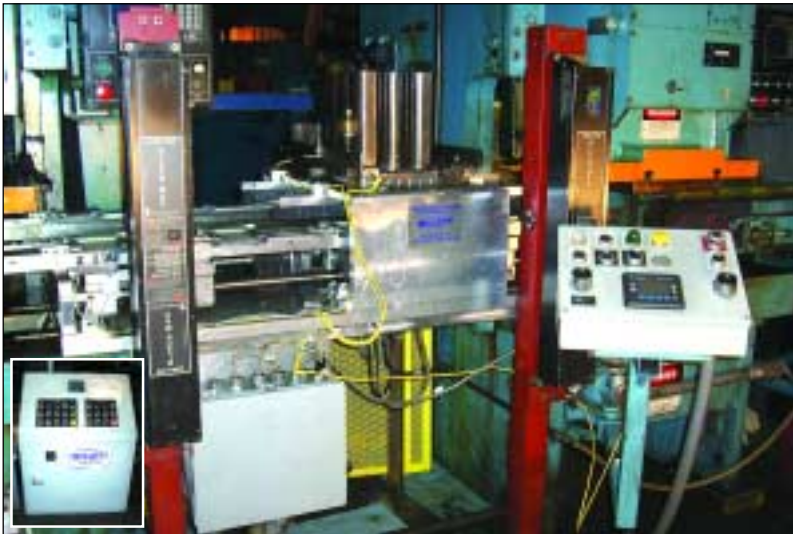
MS WILLETT SERVO TRANSFER SYSTEM