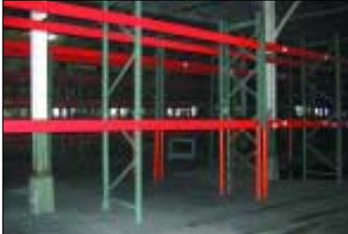
APPROX. 800 SECTIONS PALLET RACKING