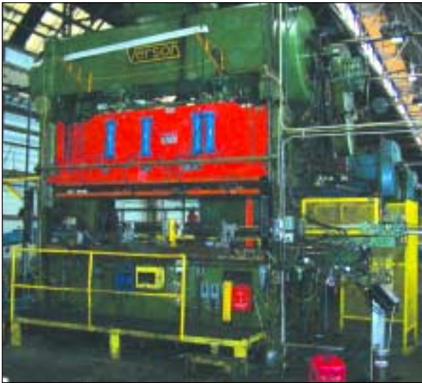
250-TON VERSON STRAIGHT SIDE DOUBLE CRANK, MDL. 250-B2-144