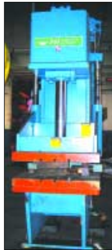
1997 50-TON PH HYDRAULIC GAP PRESS