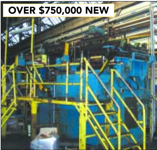
200-TON BRANDES HIGH SPEED DIEING PRESS