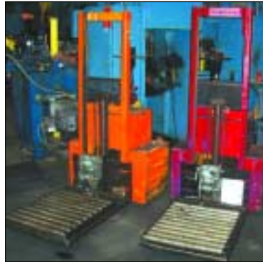
BIG JOE ELECTRIC LIFTS