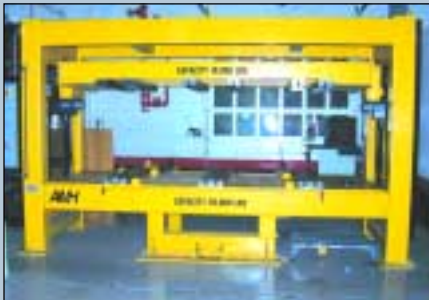
FRONT VIEW ALLEGHENY MATERIAL HANDLING DIE MANIPULATOR/SEPARATOR, MDL. DS-200-144/50