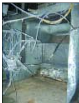
BINKS PAINT SYSTEM