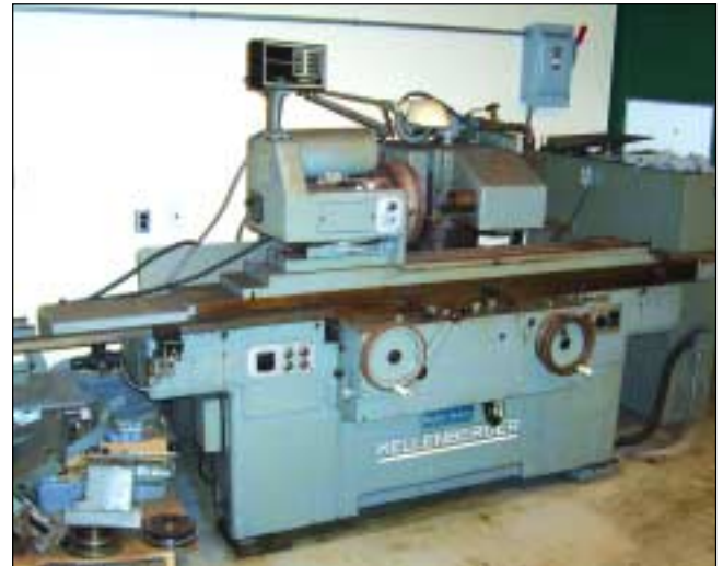
KELLENBERGER ID GRINDER