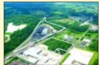
AERIAL VIEW LOOKING NORTH

••• Real Estate Sale Subject to Owner Confirmation ••• ••• Subject to Prior Sale •••