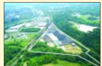
AERIAL VIEW LOOKING SOUTH