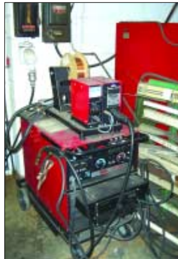
LINCOLN MDL. DC400 ELECTRIC WELDER