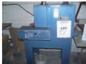
Heavy Duty Paper Drill