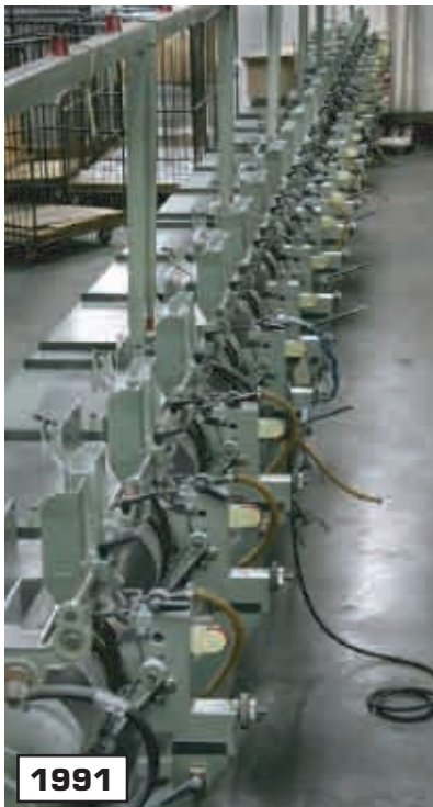
1991 Muller Martini Perfect Binding Line