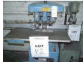
Challenge 3 - Spindle Paper Drill