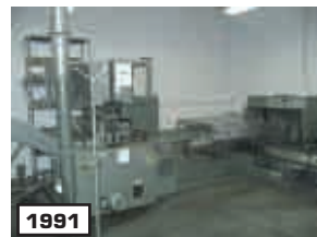
1991 Muller Martini 251 Trimmer