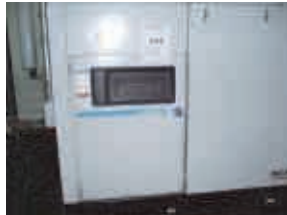
Ingersoll-Rand Rotary Screw Air Compressor