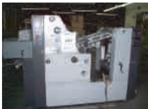
Hamada Sheet-Fed Perfecting Offset Duplicator