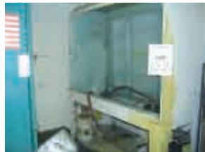
Plastic Silk Screen Spray Booth