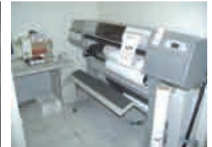
Digital Proof Printer