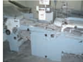
MBO 28"x47" Programmable Paper Folder