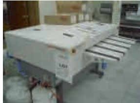
38" Plate Processor