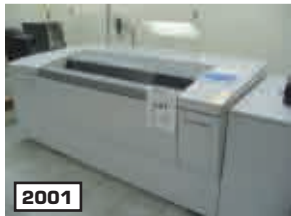
2001 CREO/Scitex Computer-to-Plate System