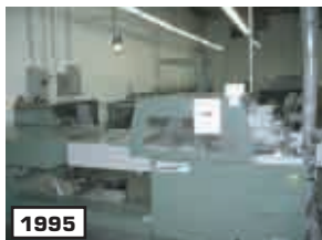
1995 Muller Martini 360 Trimmer