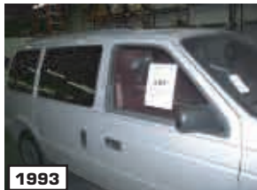
1993 1993 Dodge Caravan Minivan