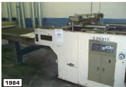
Sakurai UV Coating Line