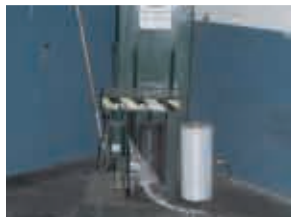
Pallet Stretch Wrapper