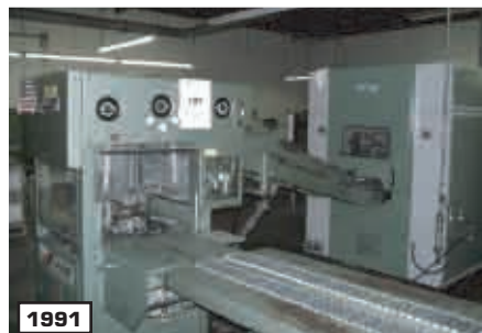
1991 Trimmer & Stacker For Perfect Binder