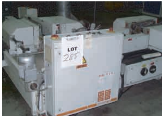
Gammerler 4-Knife Trimmer