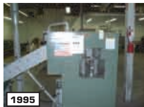
1995 Muller Martini Apollo Counterstacker