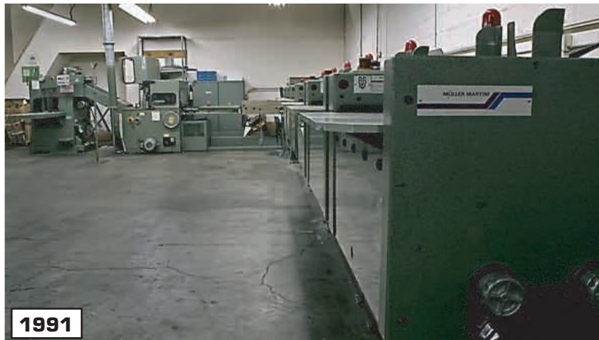
1991 Muller Martini 335 Saddle Stitching Line