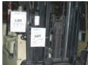
1997 LPG Clamp Truck