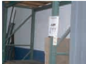
Heavy Duty Pallet Rack