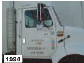
1994 1994 International 810 Tractor