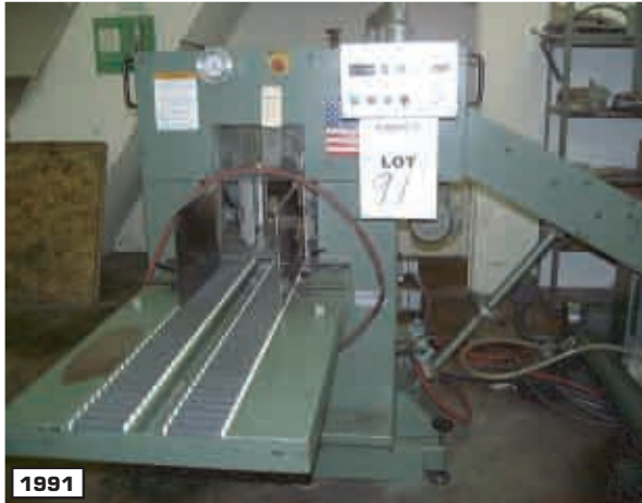
1991 1991 Muller Martini Apollo Counterstacker

Desks, Chairs, Tables, File Cabinets, Sofas, Modular Workstations, Bookcases, Conference Table, Reception Station, Copiers, Fax Machines, Typewriters, Calculators, Refrigerator, Pedestal Fans, Computers and Peripherals.