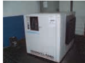
Ingersoll-Rand Compressed Air Dryer