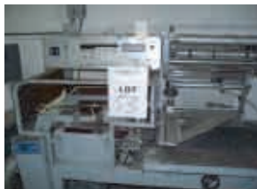
Shrink Wrap Former