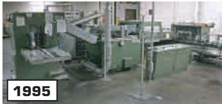
1995 Muller Martini 335 Saddle Stitching Line