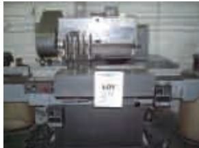
Multi-Spindle Heavy Duty Paper Drill