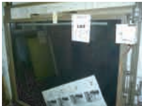
Wall Mounted Silk Screen Tilting Vacuum