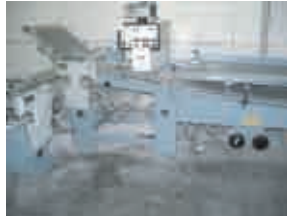
MBO 26"x40" Programmable Paper Folder