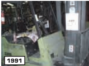
1991 LPG Forklift Truck