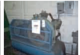
Plastic Wrap Former