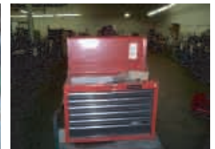
Standing Tool Chest