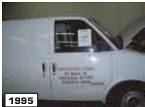
1995 1995 Chevrolet Astro Minivan