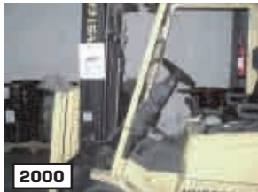
2000 LPG Forklift Truck