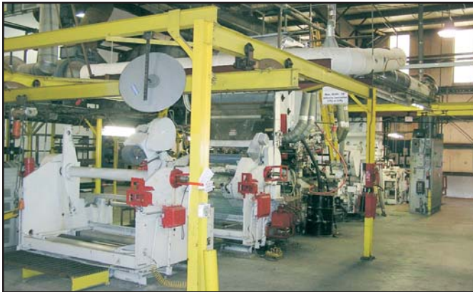
SHELDAHL 50" adhesive & extrusion laminating line