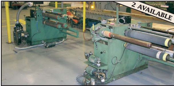
STANFORD 142 roll doctors