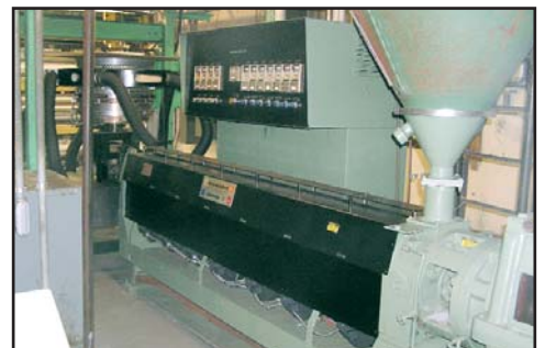
View of DAVIS STANDARD extruder with hopper

This brochure is only a partial listing VISIT OUR WEBSITE FOR MORE DETAILED LISTINGS AND PHOTOS www.corpassets.com