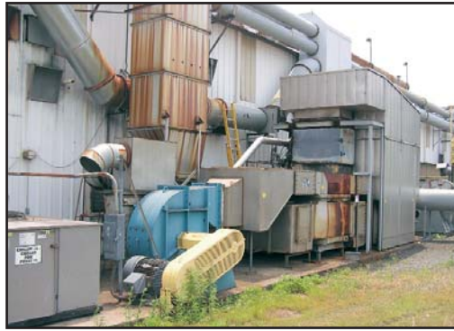
View of PILAR 20,000 CFM fume oxidizer incinerator

CAT EP20KT 4000 lb. electric forklift, s/n ET858 50947 YALE 4000 lb. electric forklift with roll clamp attachment (2) ALLIS CHALMERS ACE-308 EV EE 36V electric forklifts, s/n AC0520142, 03H120339 GRAY MILLS HANDI KLEEN parts washer LANTECH stretch wrapper, 60" capacity