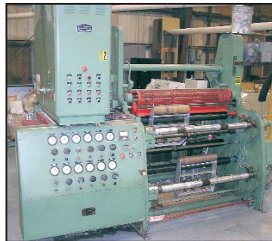
ELDEC DB 50M duplex slitter