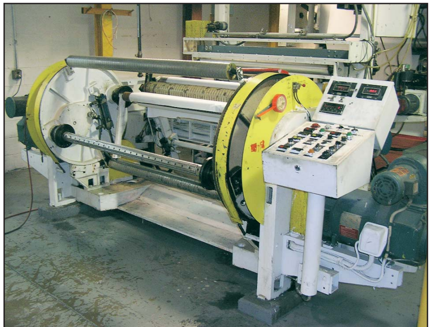
View of W&H OLYMPIA 726 turret rewind

1982 WINDMOELLER & HOELSCHER OLYMPIA 726 SM 6 color central impression flexographic printing press, s/n 30834, with 55" print width, 57" max. web width, 10 DP gearing w/a repeat range of 11.938" to 31.370", automatic deck positioning, (5) chambered doctor blades, regenerative drives on the unwind & rewind turrets w/flying splicers, COROTEC treater, (74+) plate cylinders & gears