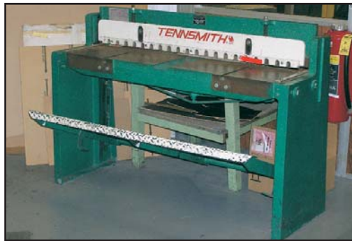
TENNSMITH 16 ga. x 4' foot shear