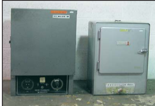
BLUE M lab ovens