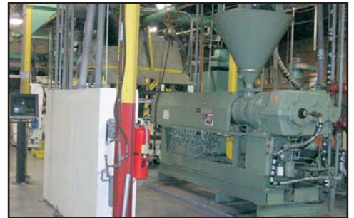
EGAN extruder for cast film line