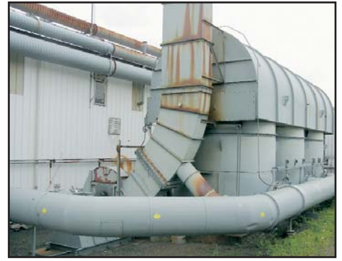
View of REECO 20,000 CFM fume oxidizer incinerator