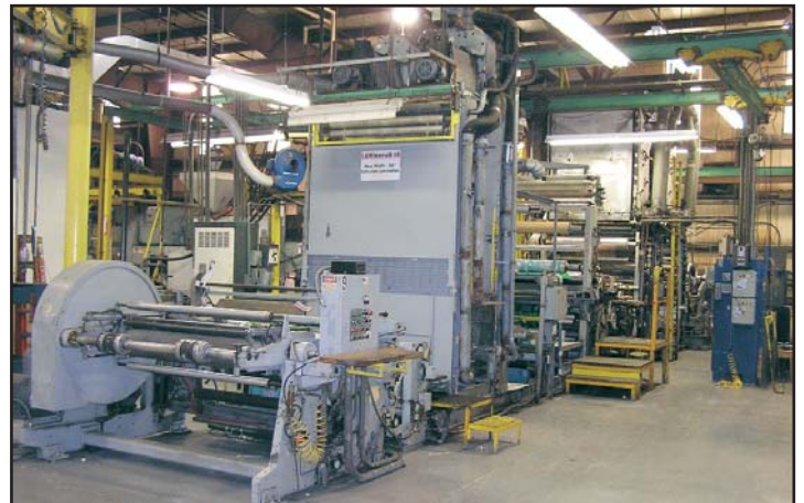
50" extrusion laminating line