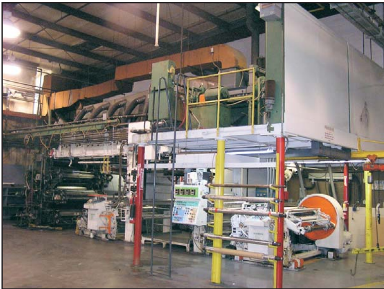
PCMC 6 color flexopress