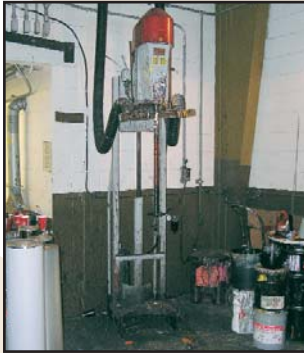
DUNCAN power paint mixer

This brochure is only a partial listing VISIT OUR WEBSITE FOR MORE DETAILED LISTINGS AND PHOTOS www.corpassets.com