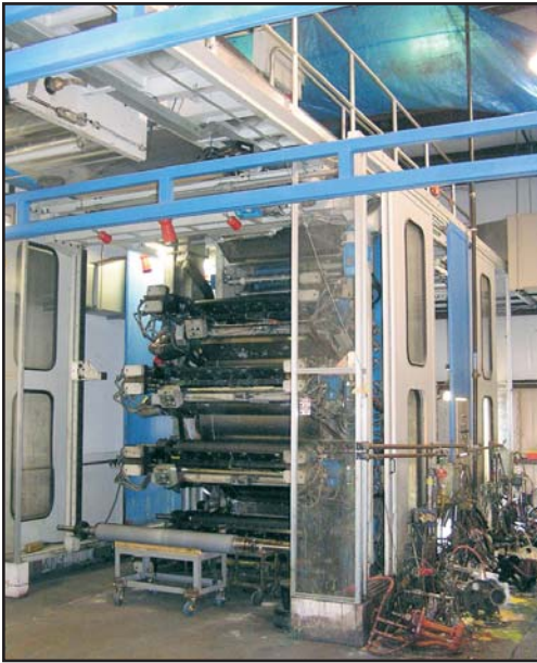
View of VALMAT (MAF) GALAXY 8 color C.I. flexographic printing press