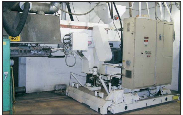
View of SHELDAHL/EGAN 3½" extruder