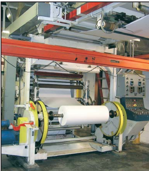
View of W&H OLYMPIA 726 turret unwind