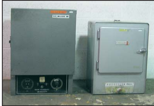
BLUE M lab ovens