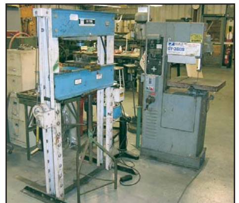
View of shop press & bandsaw

ALSO , die trucks, strapping caddies, dollies, paint mixers, BOSTITCH box staplers, parts washers, ENERPAC hydraulic crimper, ENERPAC hydraulic jacks, GREENLEE tube bender, shop ladders, ELECT hoists, digital & dial floor & platform scales, hand tools, engine hoists, stores inventory including ball bearings, scissor lift reach truck, large qty. adjustable pallet racking, shop fans, DUNCAN power paint mixer, etc.