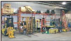
View of factory equipment & material handling equipment