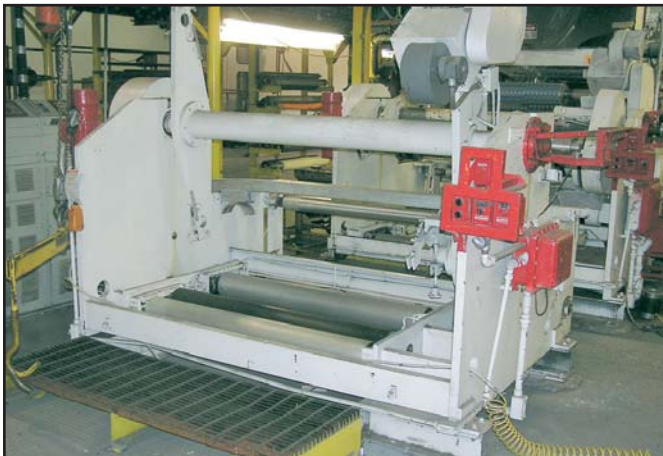
View of SHELDAHL 50" adhesive laminator