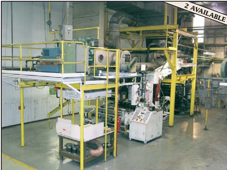
KIDDER 672 6 color flexopress