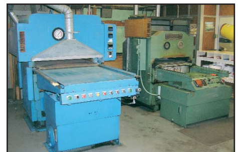
PRECISION plate vulcanizers