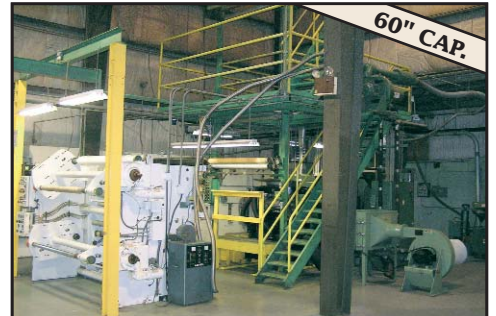
DAVIS STANDARD blown film extrusion line