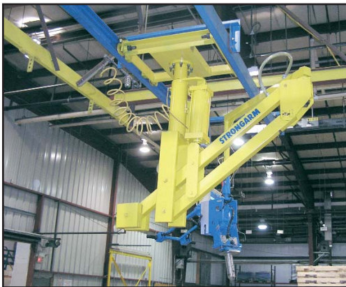
STRONGARM pneumatic roll handling arm