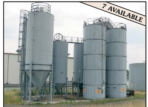
View of material silos

PROXY BIDDING If you are unable to attend this auction, we would be pleased to act as your proxy. Please contact our office at (416) 962-9600 or visit our website for a proxy bid form, terms and additional information.