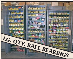
View of stores inventory