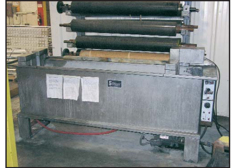
SONICOR ultrasonic wash