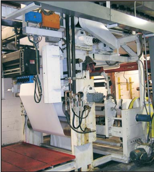
View of W&H OLYMPIA 726 6 color C.I. flexographic printing press