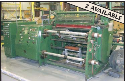
ELDEC DB 50 duplex slitter/rewinder