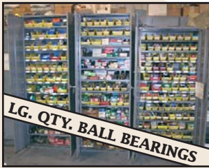
View of stores inventory