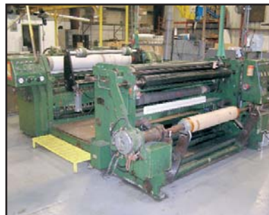
ELDEC CS125 duplex rewind slitter