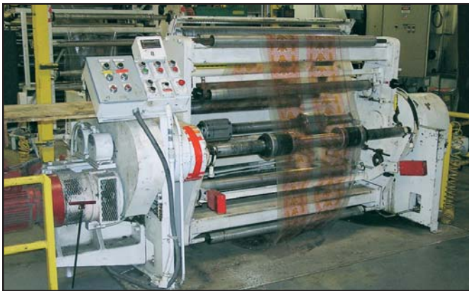
View of SHELDAHL/EGAN 50" extrusion laminator turret rewind

SHELDAHL 50" wide adhesive laminator, with HYDROMATIC MACHINES turret unwinds & rewinds for 40" dia. rolls, corona treater, gas-fired oven, gravure coating head, DC drives & controls