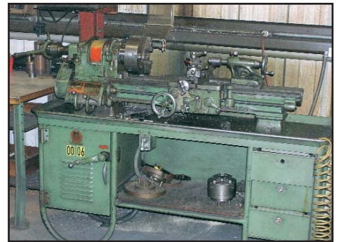
SOUTHBEND toolroom lathe