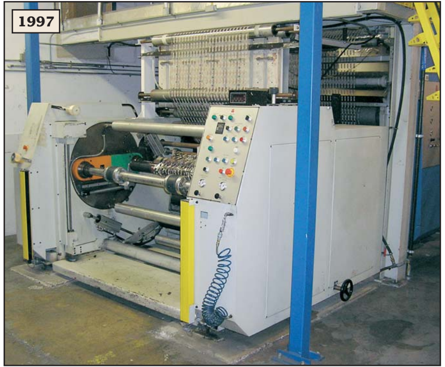
View of VALMAT (MAF) GALAXY 8 color C.I. turret rewind