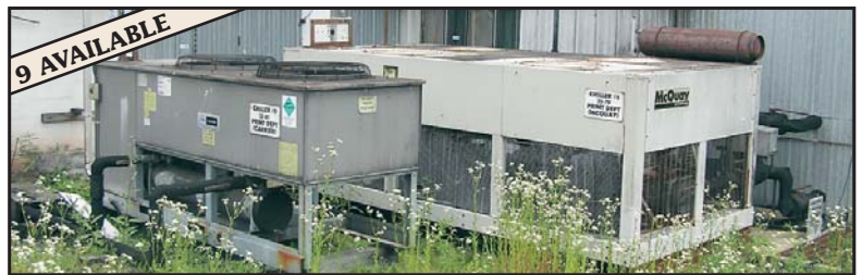
View of CARRIER & MCQUAY air-cooled liquid chillers