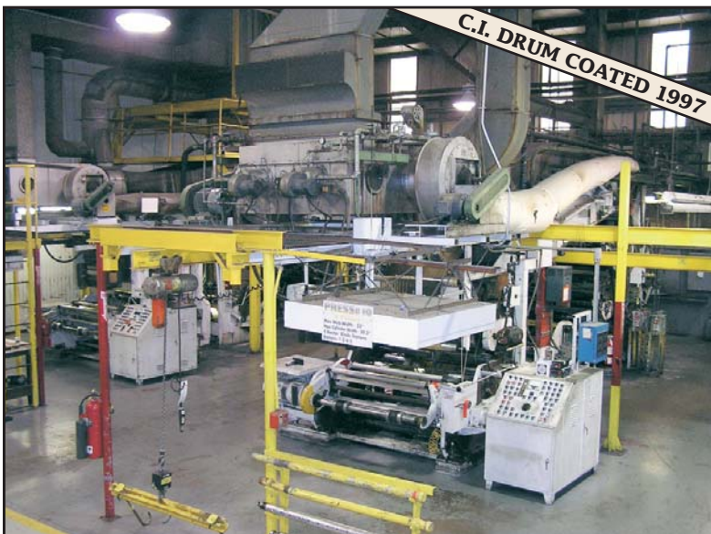
View of KIDDER 672 6 color flexopresses