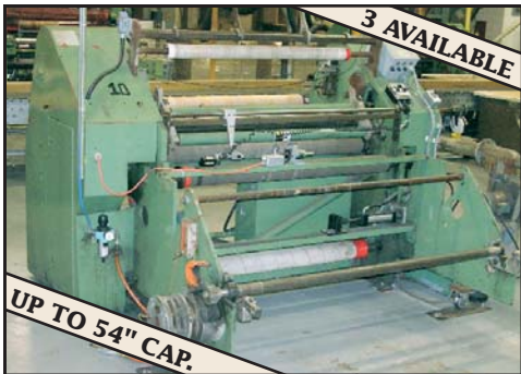
DUSENBERY 635 BL duplex slitter/rewinder