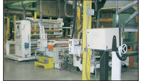
EGAN cast film extrusion line