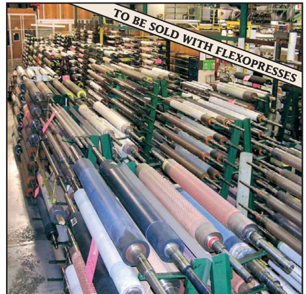
View of plate cylinder shafts

For further information contact us at: 2 St. Clair Ave. W., Suite 1002, Toronto, Ontario, Canada M4V 1L5 Tel: (416) 962-9600 Fax: (416) 962-9601 Email: info@corpassets.com Web: www.corpassets.com Toronto-Chicago