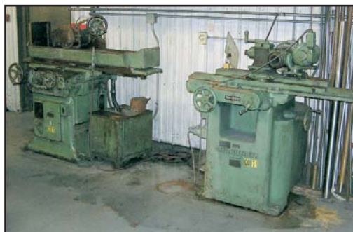
View of grinders