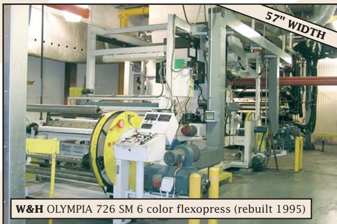
W&H OLYMPIA 726 SM 6 color flexopress (rebuilt 1995)