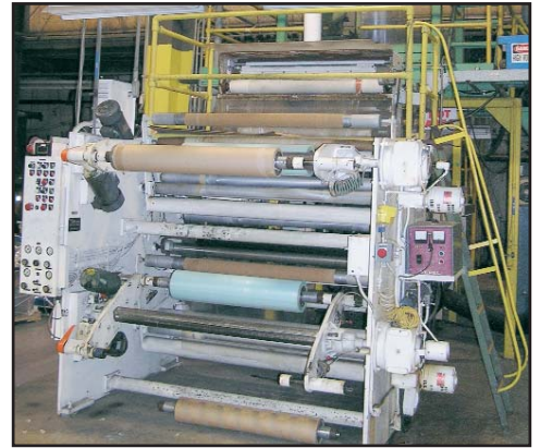
NRM blown film extrusion line

ELDEC CS 125 duplex surface/center rewind slitler, s/n 78-5376, with roll lift unwind for 36" dia. rolls, razor slitting, GWD web guide, rewind arms for 20" and 24" dia. rolls