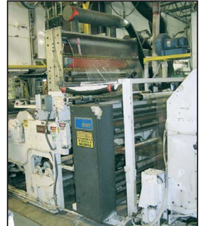
View of SHELDAHL/EGAN 50" OHMART thickness gauge

Please contact our office at (416) 962-9600 or visit our website for a proxy bid form, terms and additional information.