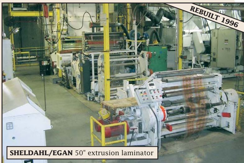
SHELDAHL/EGAN 50" extrusion laminator