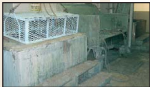
View of dip tanks

This brochure is only a partial listing VISIT OUR WEBSITE FOR MORE DETAILED LISTINGS AND PHOTOS www.corpassets.com