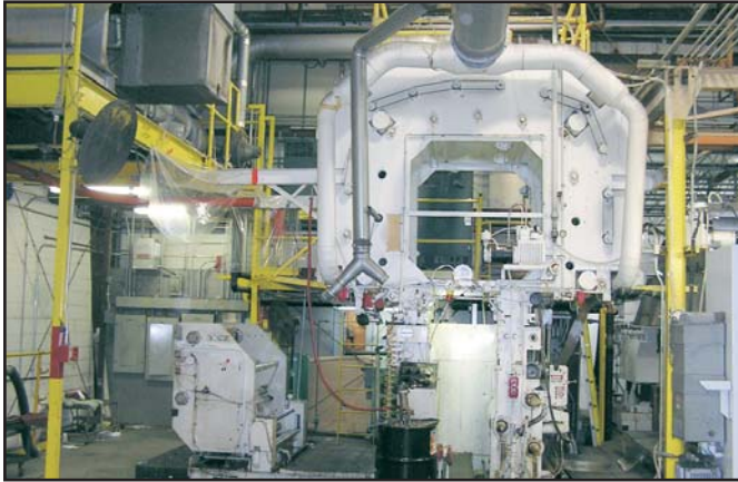
View of SHELDAHL/EGAN 50" SIMON VK gravure coating head w/dryer