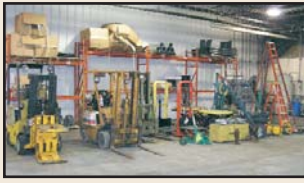
View of factory equipment & material handling equipment