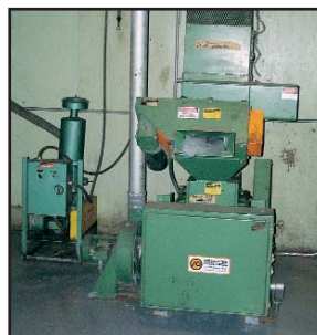
PROCESS CONTROL RFNL14 granulator