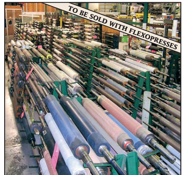
View of plate cylinder shafts

For further information contact us at: 2 St. Clair Ave. W., Suite 1002, Toronto, Ontario, Canada M4V 1L5 Tel: (416) 962-9600 Fax: (416) 962-9601 Email: info@corpassets.com Web: www.corpassets.com Toronto-Chicago