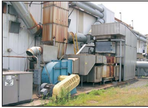
View of PILAR 20,000 CFM fume oxidizer incinerator

CAT EP20KT 4000 lb. electric forklift, s/n ET858 50947 YALE 4000 lb. electric forklift with roll clamp attachment (2) ALLIS CHALMERS ACE-308 EV EE 36V electric forklifts, s/n AC0520142, 03H120339 GRAY MILLS HANDI KLEEN parts washer LANTECH stretch wrapper, 60" capacity