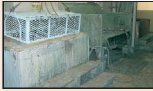
View of dip tanks

This brochure is only a partial listing VISIT OUR WEBSITE FOR MORE DETAILED LISTINGS AND PHOTOS www.corpassets.com