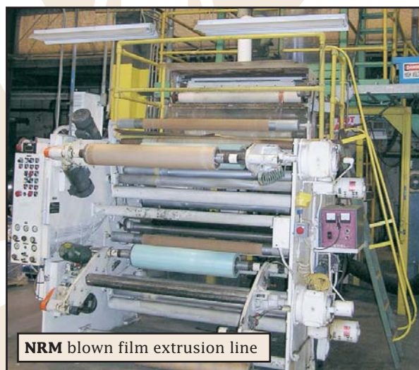
NRM blown film extrusion line