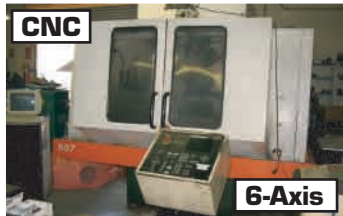
Walter MDL GC-6 CNC Tool Cutter & Grinder