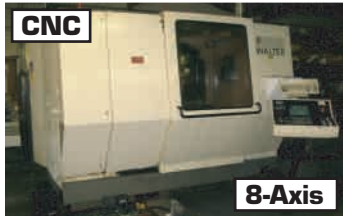
Walter MDL GC-8 Heli-Center