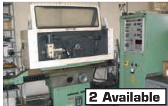
Walter MDL Helitronic 50NC

ALSO FEATURING: Automatic Surface Grinders • Automatic Flute Grinders • ID/OD Grinders • Centerless Grinders • Radius Grinders • Twist Drills • Dumore Tool Post Grinders • Engine Lathe • Vertical Mill • Drill Presses • Vertical Band Saw • Horizontal Band Saw • Arbor Presses • Pantograph Machine • Tappers • Arbor Presses, Speed Lathes • Diamond Wheel Grinders • Double End Grinders • Vertical Belt Grinders • Hand Tools • Table Saw • Radial Arm Saw • Piston Turning and Grinding Machine • Arc Welders • Spot Welder • Inspection Equipment • Optical Comparators • Blast Cabinet • Smog Hogs • High Frequency Parts Washer • Shop Dust Collectors • Electric Motors • Racking • Rolling Stock • Office Equipment And Much More!