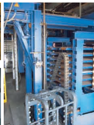
Part Of A Series Of Lamination Presses