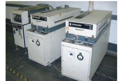
Dynachem Inner Layer Pre Heater