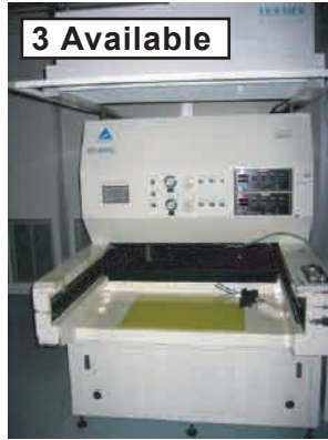
Hi-Tech Exposure Unit, MDL. HTE3000NEL