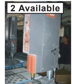
Branson Ultrasonic Welder, MDL. 8400