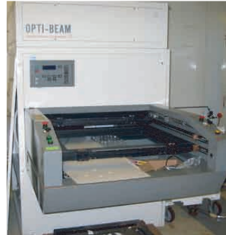
ORC Exposure Unit, MDL. OB7120