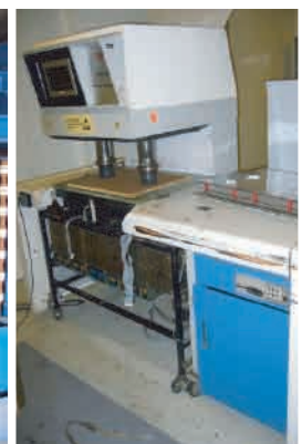
Trace Bed Of Nails Tester