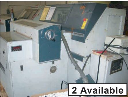
Multi-line Post Lamination Drilling Machine