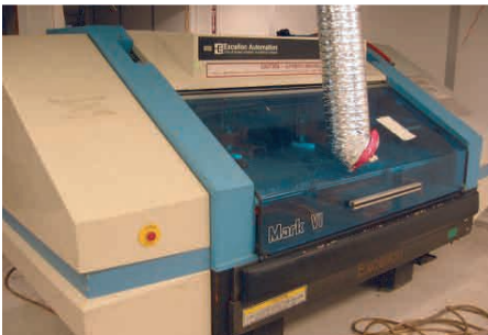
Mark VI Drilling Machine