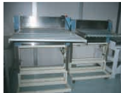
Tacky Roll Machine