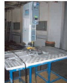
Branson Ultrasonic Welder, MDL. 910IW