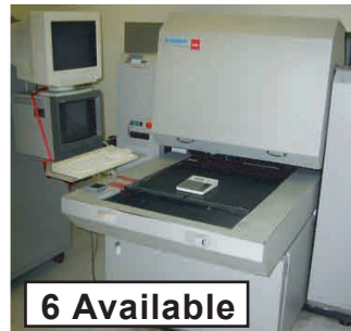
Orbotech Scanner, MDL.PC-1450