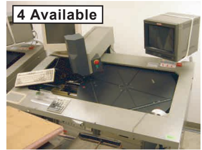
Orbotech Verifier MDL. VRS-4I