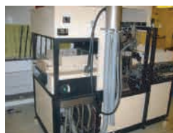
Hikato Cutsheet Laminator 1500 B