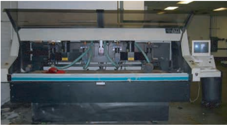
ATI Four Spindle Router