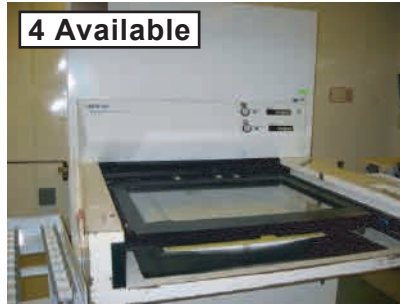
ORC Dry Film Exposure Unit, MDL. HMW 401