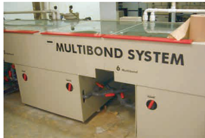
Macdermid DES Horizontal Oxide Line