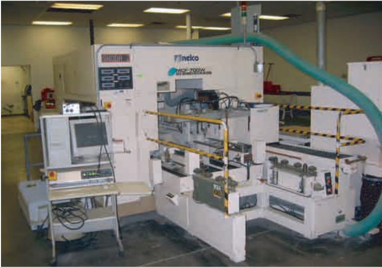
Shoda Shearing & Beveling Line