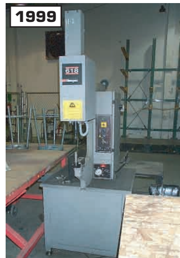
Haeger Insertion Press