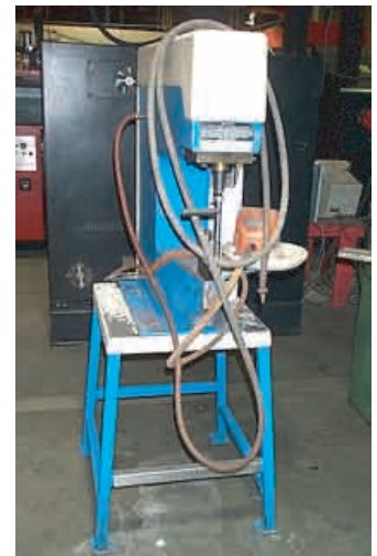
Pemsarter Insertion Press