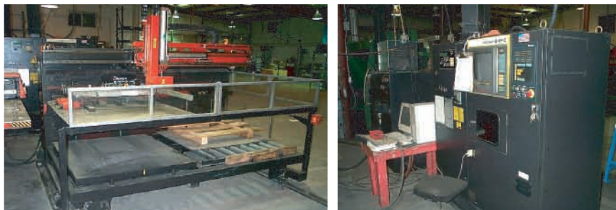
Amada CNC Manipulator