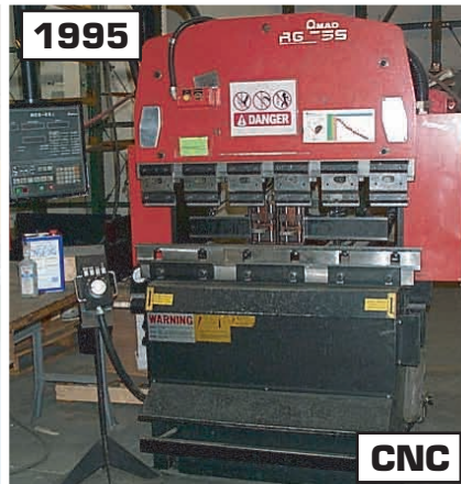
Amada 35 Ton CNC Press Brake