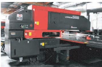
1999 AMADA CNC TURRET PUNCH MDL. #Vipros 568, S/N 56810035

Capacity: 55 TON Max. Sheet Size: 60" x 78.74" (With Reposition): 60" x 157" Max. Axis Travel: X = 78.74", Y = 60" Max. Sheet Thickness: 0.375" Max. Material Weight: 440 Lbs Positioning Speed: 1968 IPM Max. Ram Stroke: 1.256" Max. Hole Diameter: 4.500" Turret Configuration (Thick: 62 Station, 2 A/I) Turret Rotation Speed: 25 RPM Hit Rate: 0.236" Stroke = 320 HPM, 0.315" Stroke = 200 HPM Dimensions (Machine Only) (L x W x H): 197" x 163" x 100" Weight: 44,000 Lbs