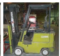
Clark Fork Lift

TO SCHEDULE AN AUCTION OR APPRAISAL, CALL 818.508.7034