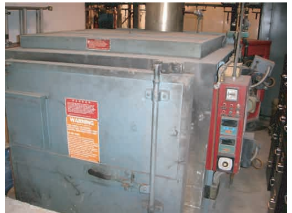
Burn Off Oven