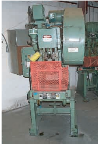
Russell 25 Ton Punch Press