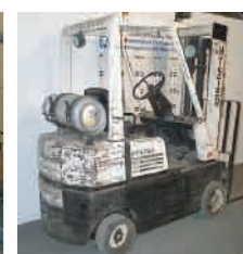
Hyster Fork Lift