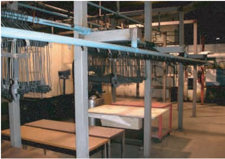
Pacline Enclosed Conveyor System