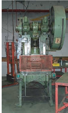
Bliss Punch Press