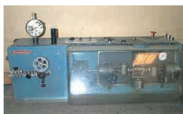
Eubanks Utility Wire Straightener