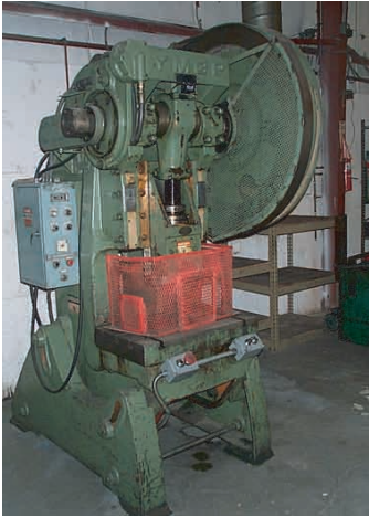
YMGP 55 Ton Punch Press