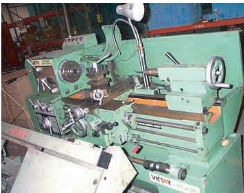
Victor Hi Speed Precision Lathe