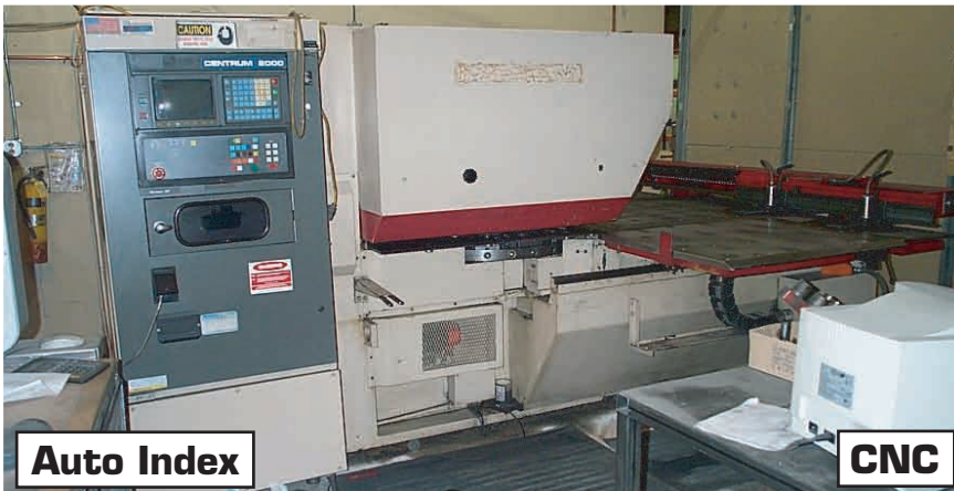
Wiedmann 22 Ton CNC Turret Punch Press