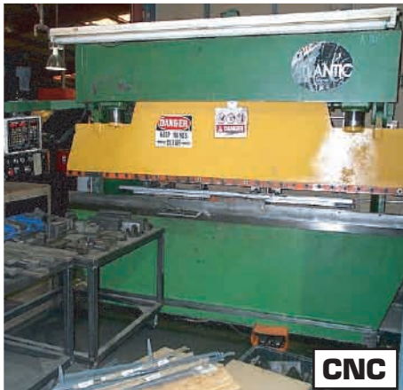
Atlantic 100 Ton CNC Press Brake