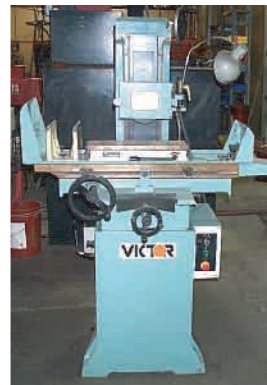
Victor Surface Grinder