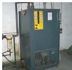
Zeks Air Dryer