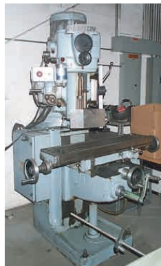
Gorton Master Mill