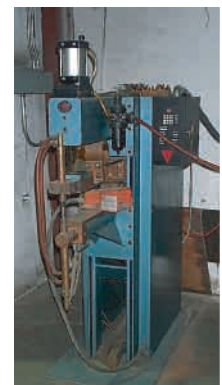
H&H Resistance Seam Welder