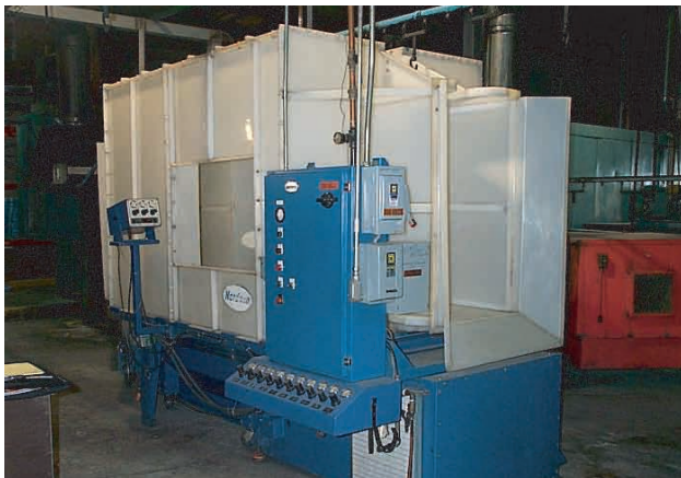
Nordson Horizon Powder Coat System