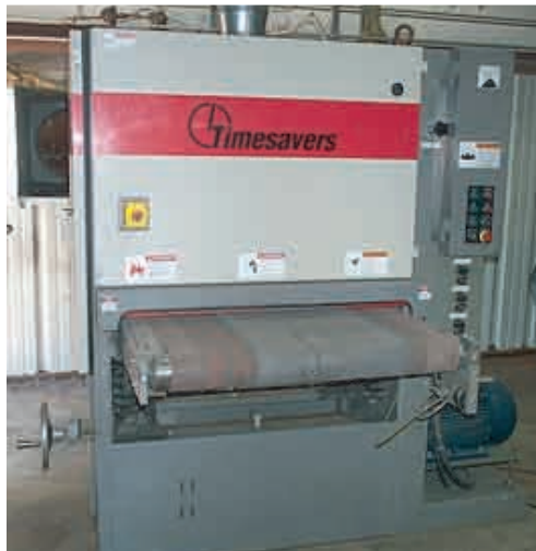
Timesavers Automatic Wide Belt Sander