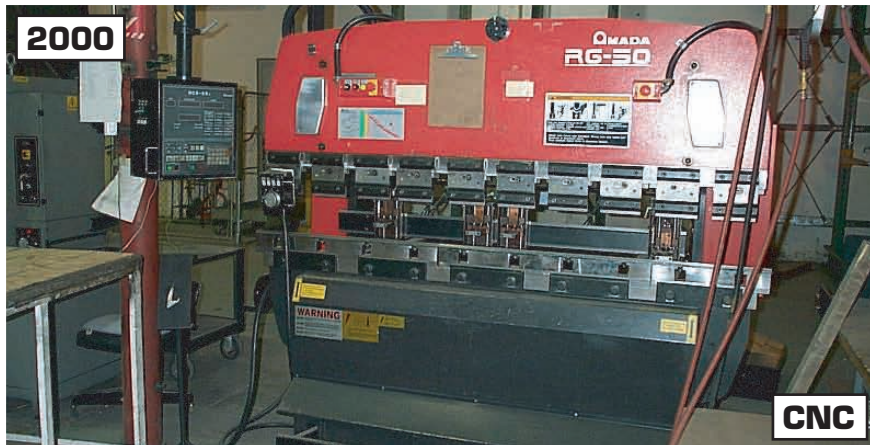
Amada 50 Ton CNC Press Brake