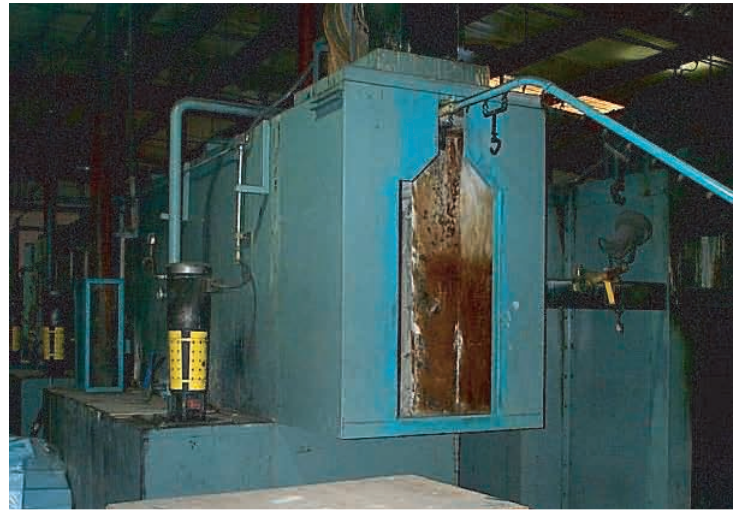
3-Stage Wash System