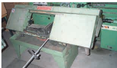
Carolina Horizontal Band Saw