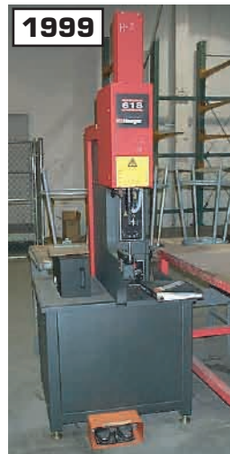
Haeger Insertion Press