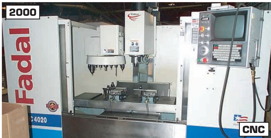
Fadal Vertical Machining Center