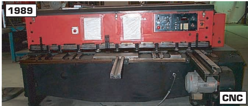
Amada CNC Mechanical Shear