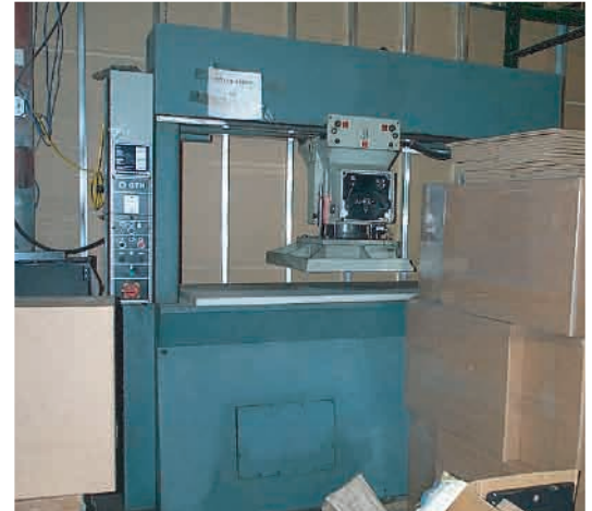
GTH Hydraulic Clicker Press