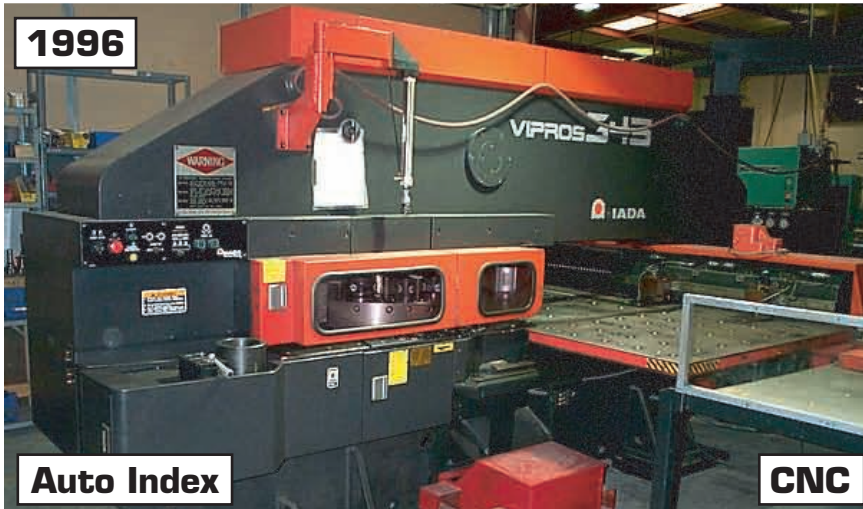
Amada 30 Ton CNC Turret Punch Press