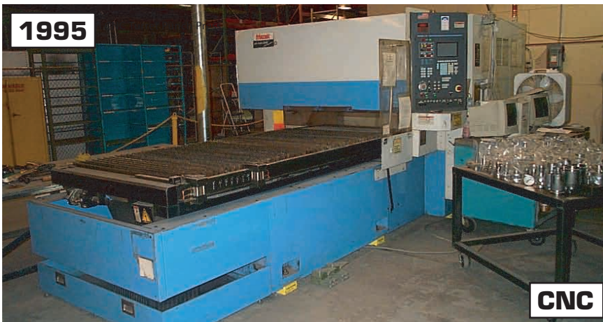
Mazak New Turbo X48 Laser Cutter