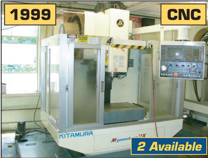
Kitimura Mycenter - 2X Vertical Machining Center