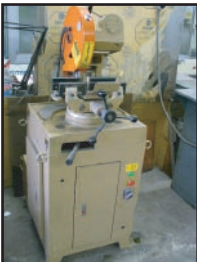
Floor Type Radial Arm