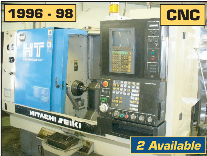
Hitachi Seiki HT-2053 CNC Turning Center