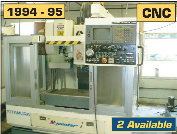
Kitimura Mycenter - 1 Vertical Machining Center