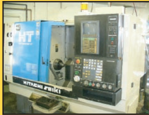
Hitachi Seiki HT-2053 CNC Turning Tables

For a Complete Listing of Upcoming Auctions, Visit www.BIDITUP.com . Register Online and Receive Auction Updates & Information via E-Mail.