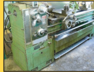
Enco Engine Lathe