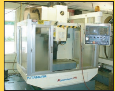
Kitamura Mycenter - 2X Vertical Machining Center

NOW OFFERING IN-HOUSE FINANCING & LEASING. Call 818.508.7034