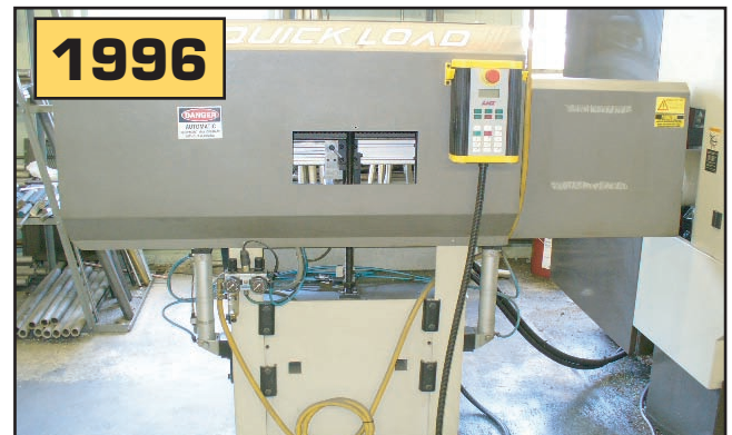
LNS Quick Load Bar Feed

Chavalier Surface Grinder, MDL. FSG 618, 6" x 18" Magnetic Chuck, S/N 02B-4074