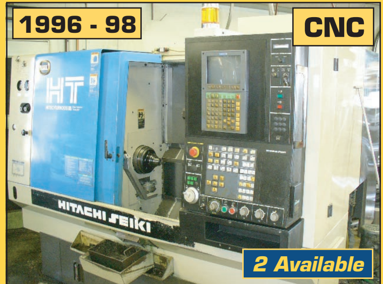
Hitachi Seiki HT-2053 CNC Turning Center