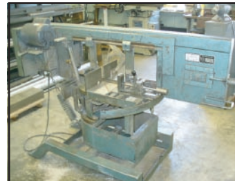
Horizontal Band Saw