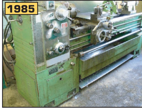
Enco Engine Lathe

LARGE QUANTITY 20 & 30 TAPER CNC TOOL HOLDERS ; Kurt Angle Vises, Kurt Block Vises, Insert Tool Holders, Stainless, Aluminum and Brass Bar Stock and Scrap Metal, Work Benches, Cabinets, Rolling Carts, Hand Tools, Tool Chests