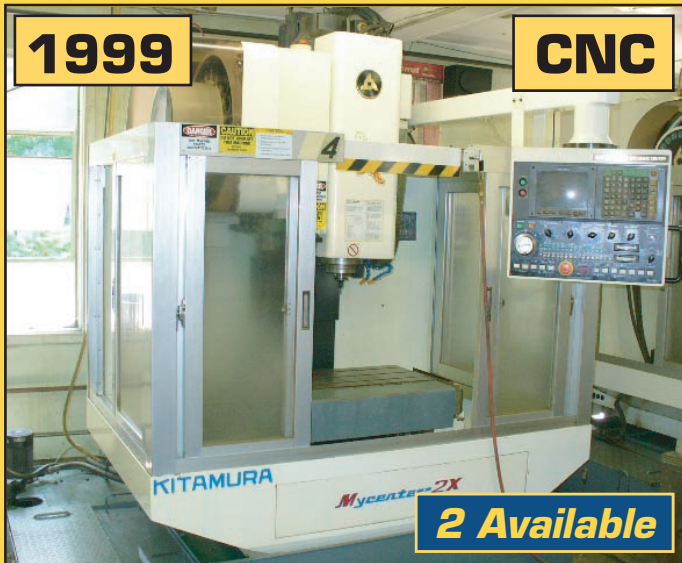
Kitamura Mycenter - 2X Vertical Machining Center