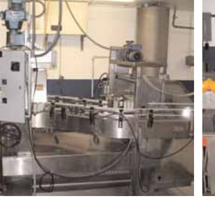
BFT Bottle Washer