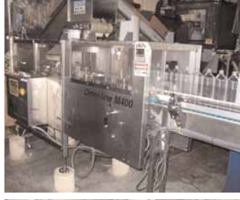
Pace Omni-Line M400 S/S Bottle Sorter and