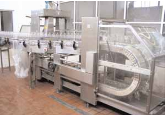
BFT S/S Bottle Inverted Bottle Washer

(2) Kaeser Refrigerated Air Dryers with Vertical Air Holding Tanks, Model KRD100 and TB26.