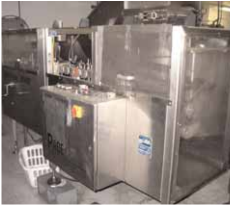
Pace Omni-Line 400 Bottle Orienter