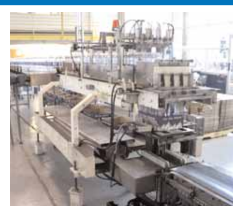
AccuPac Tray Packer