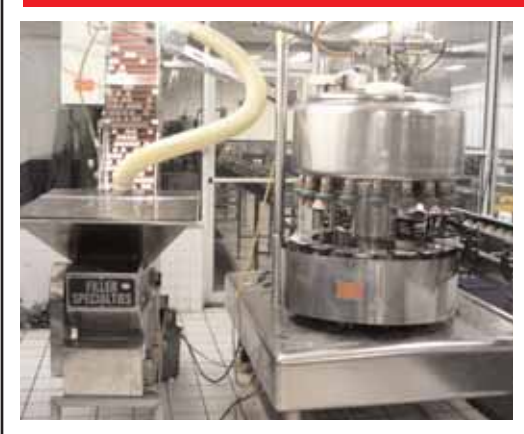
1997 Filler Specialties 18-Valve Filler & Capper