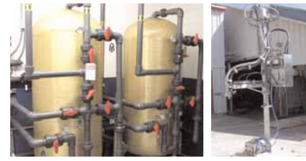
2001 Reverse Osmisis/Ultra Filtration System Above Right: Reynolds Liquid Nitrogen Dosing System