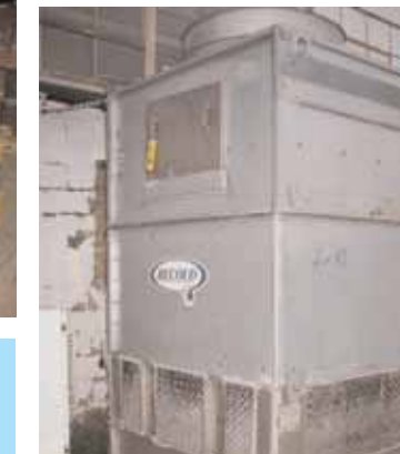
Top: (2) Kaeser 20hp Screw Air Comp. (2) 1999 Recold Cooling Towers