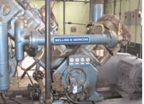
(2) Belliss & Morcom Air ompressors VEW in 200 1 k 1999)