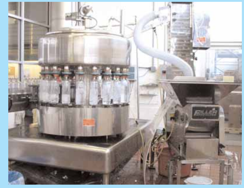
Filler Specialties 21-Head Filler, Capper & Feeder -Palmerton, PA

(2) Krones Canmatic Hot Glue Wrap Anound Labellers (PA & FL)