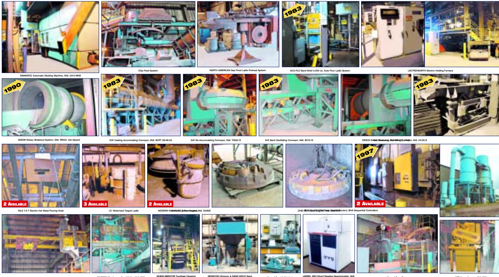
DISMATIC Automatic Molding Machine, Mdl. 2013 MMR Chip Feed System NORTH AMERICAN Gas Fired Ladle Preheat System ACU-FLO Sand Mold 4,000 Lb. Auto Pour Ladle System LECTROHEARTH Electric Holding Furnace DIDION Rotary Shakeout System, Mdl. RS100, Vari-Speed G/K Casting Accumulating Conveyor, Mdl. SCRT 36/48.50 G/K De-Accumulating Conveyor, Mdl. TM36.13 G/K Sand Oscillating Conveyor, Mdl. SC12.15 DIDION Rotary Shakeout Belt/Bag/Conveyor, Mdl. 2430.8 YALE 7.5-T Electric Hot Metal Pouring Hoist L.E. Motorized Teapot Ladle MODERN Motorized Lip Pour Ladles, Mdl. SSANX OHIO BUSHNELL Digital Photo/Dust Collectors, BHA Sequential Controllers SIMPSON Continuous Sand Muller, Mdl. 22G WHEELABRATOR Tumbler Cleaning Machine, Mdl. 22 C.F. NEWAYGO Driver & SAND MOLD Sand Transporter View of Sand & Met Lab JARREL ASH Direct Reading Spectrometer, Mdl. 8011E View of Core Room NFE Hyvac Vacuum, Mdl. 230