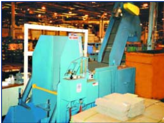
LANGLEY Tilt Feed Hopper