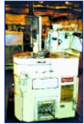
REED THREAD ROLLER, MDL. A22