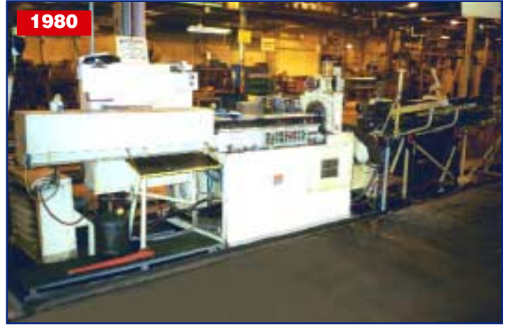
3 1/2" VULCAN BREHM TUBE RECUT LINE, MDL. VT31/2