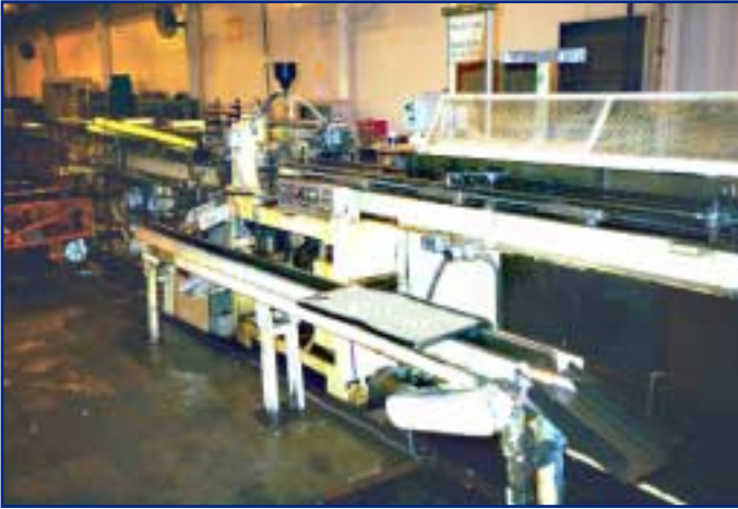
2 1/4" VULCAN BREHM TUBE RECUT LINE, MDL. 225 AC-6-22,