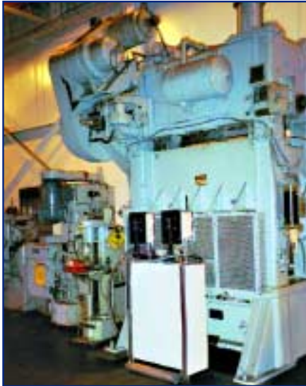
150 TON NIAGARA SSDC PRESS, MDL. SC2-150-60-48