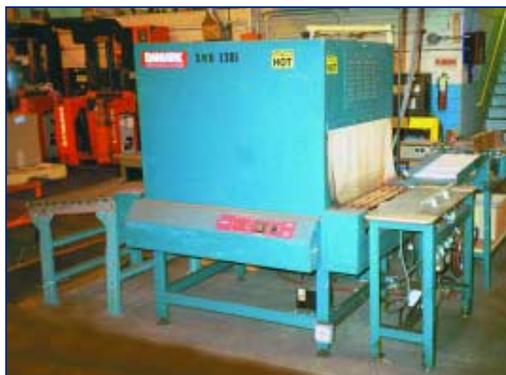
DAMARK, MDL. S34 SHRINK WRAPPER

60 PIECES OF OFFICE FURNITURE: Wood & Leather, Desks, Chairs, Lamps & Cabinets.