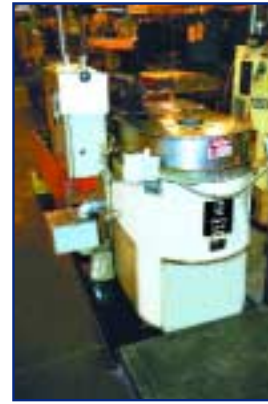
REED THREAD ROLLER, MDL. A22B