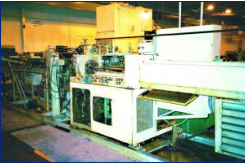
4 3/4" VULCAN BREHM RECUT LINE, MDL. WL-475