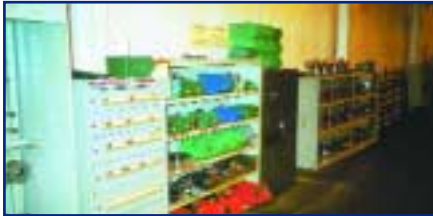
TOOLING & GAGES FOR THREAD ROLLERS