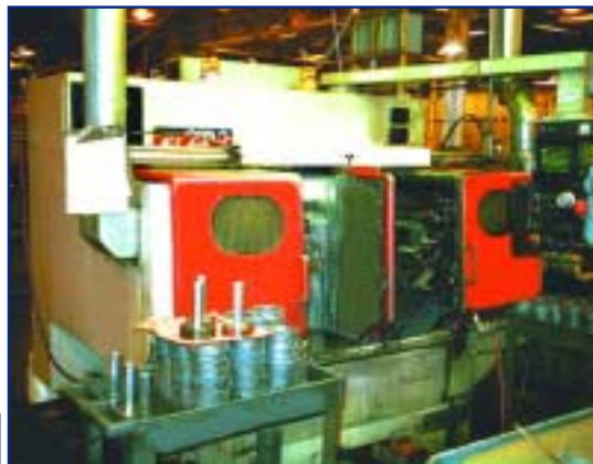
OKUMA HOWA DUAL SPINDLE TURNING CENTER