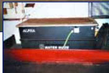
MAGNUS 5-STAGE PARTS WASHER W/ ALPHA OIL SEPARATION SYSTEM

Know the Value of Your Assets? Biditup Does! Call 818.508.7034