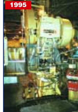
60 TON MINSTER OBI PRESS, MDL. 6