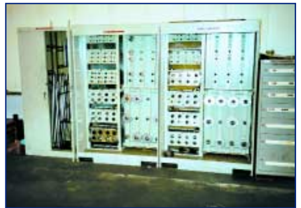
VIEW OF VULCAN BREHM TOOLING