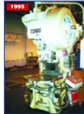
60 TON MINSTER GAP PRESS