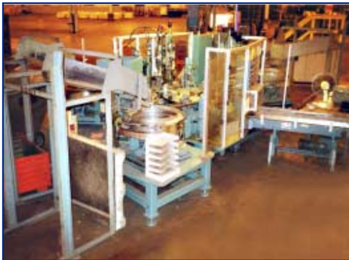
DIXON 12 Station Pneumatic Assembly Machine