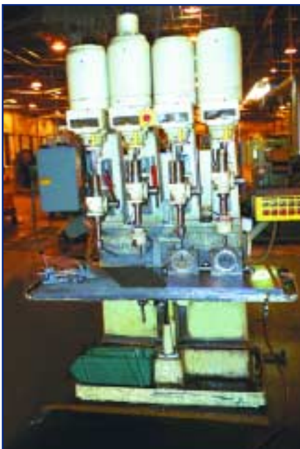
12" LELAND GIFFORD 4 SPINDLE DRILLS