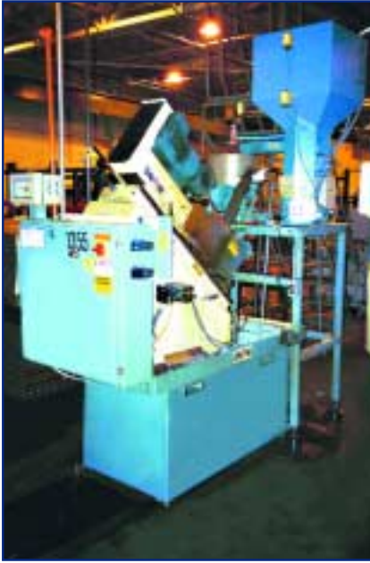
VIEW OF SNOW TAPPING SYSTEM WITH AUTO FEED