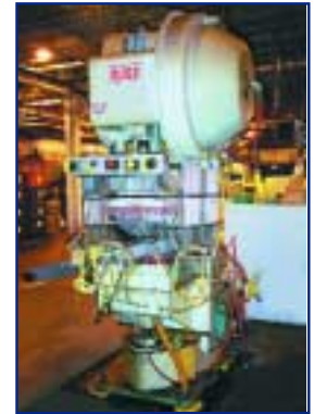
45 TON BLISS ADJUSTABLE BED HORN PRESS