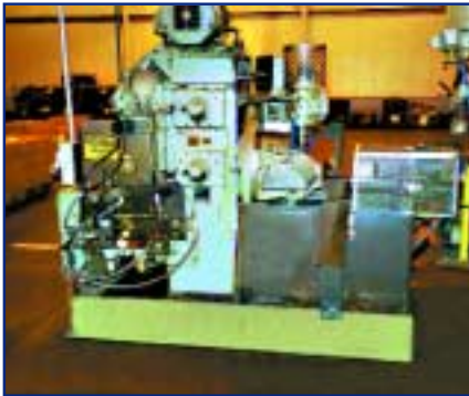
POTTSTOWN HORIZONTAL DRILL & TAP MACHINE.