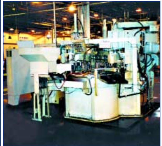
KAUFMAN DRILL & TAPPING MACHINE