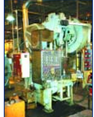
45 TON MINSTER OBI PRESS