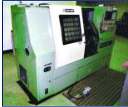
MORI SEIKI TURNING CENTER MDL. SL-15