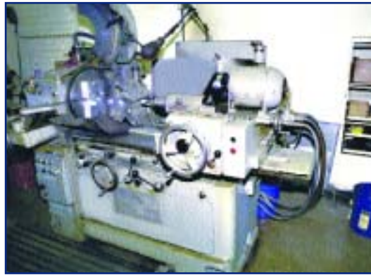
HEALD I.D. GRINDER MDL. 271,