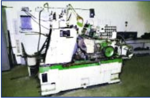
BRYANT CENTERLESS SURFACE GRINDER MDL. 2CH