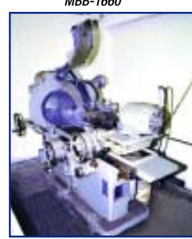
HEALD I.D. GRINDER MDL. 72A