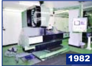
MORI SEIKI VERTICAL MACHINING CENTER MDL. MV 35/35