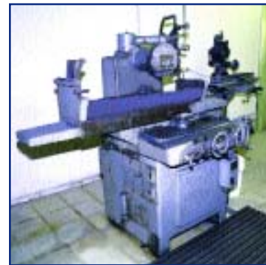
DOALL SURFACE GRINDER MDL. G-10-C