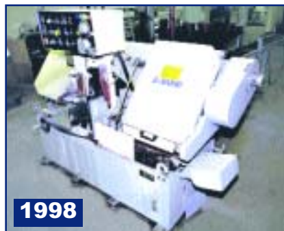
MASTER CUT SAW MDL. S-300 HB