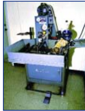
SUNNEN HONING MACHINE MDL. MBB-1660