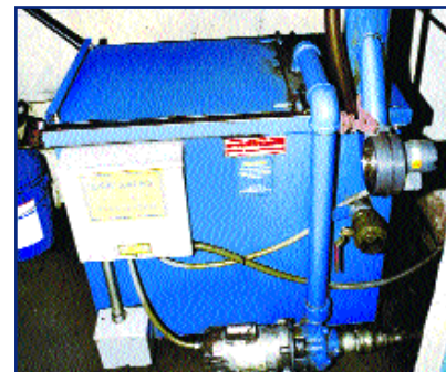
WASTE OIL COOKER MDL. 85E-88