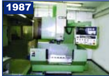
MORI SEIKI VERTICAL MACHINING CENTER MDL. MV-JR