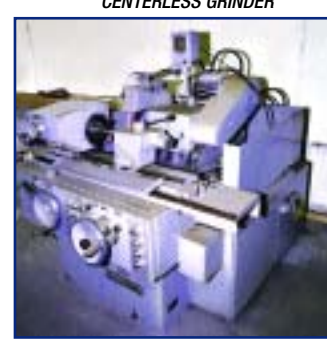
CINCINNATI MILACRON MDL. R-58