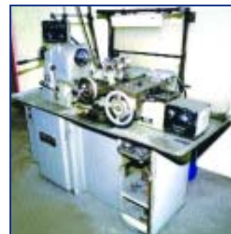
HARDINGE DOVETAIL CHUCKER MDL. HC