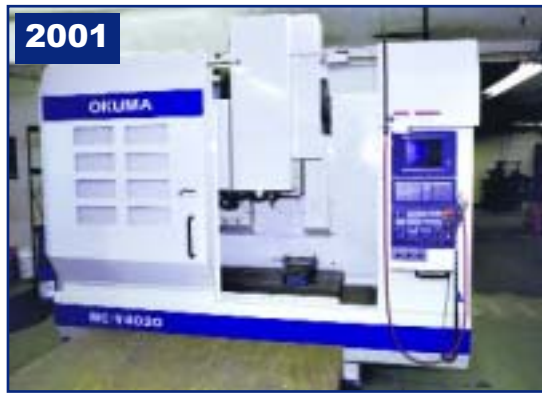
OKUMA VERTICAL MACHINING CENTER, MDL. MC-V4020

DAYS INN 2420 W. Thomas Rd. Phoenix, AZ 85015-5938 Phone (602) 257-0801