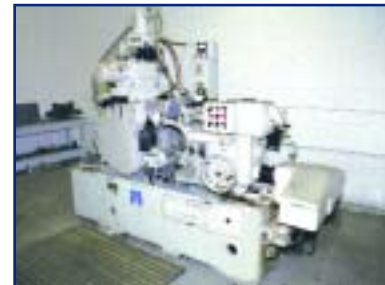
VAN NORMAN CENTERLESS GRINDER MDL. 2C