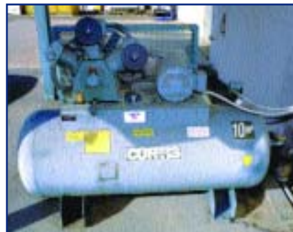
CURTIS AIR COMPRESSOR MDL. E-71