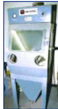
UNI-HONE SAND BLASTING CABINET