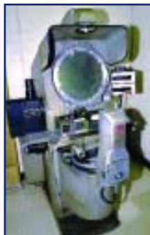
JONES & LAMSON MDL. FC-14