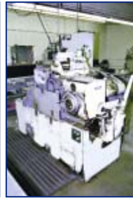
2/3 CINCINNATI MDL. 2, CENTERLESS GRINDER