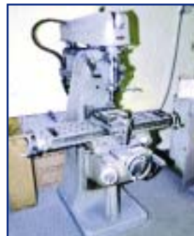
U.S. MACHINE TOOL VERTICAL MILL