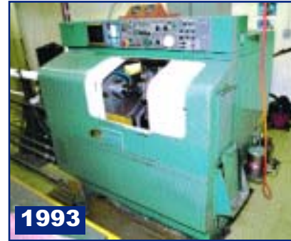
NAKAMURA-TOME TURNING CENTER MDL. TMC15