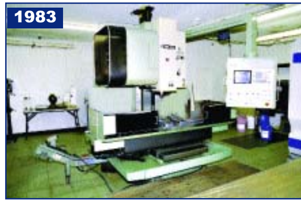
MORI SEIKI VERTICAL MACHINING CENTER MDL. MV 45/40