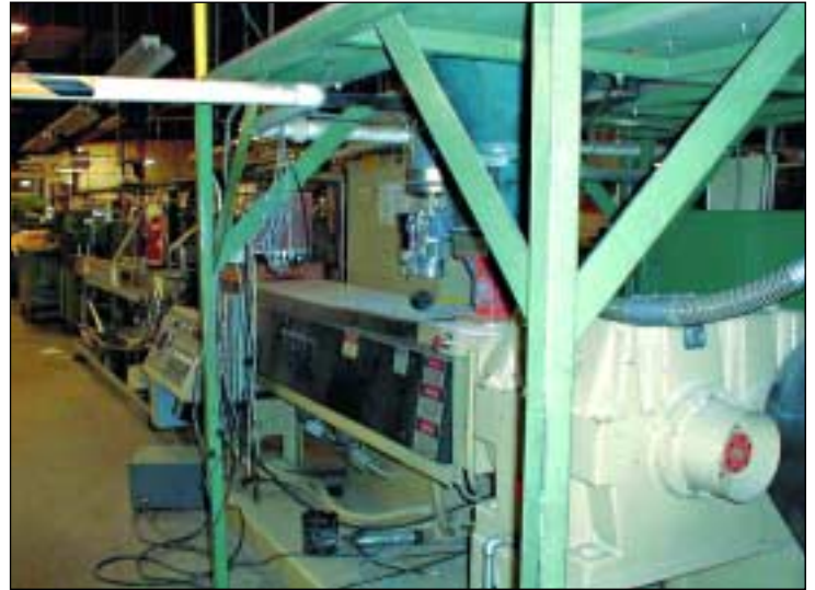
2-1/2" HPM PLASTIC EXTRUDER, MDL. 2.5TMC30.1