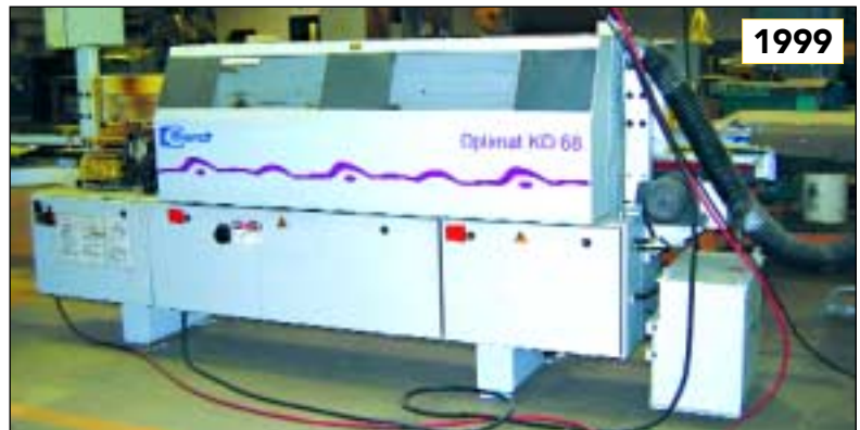
1999 BRANDT, MDL. OPTIMAT KD-68, AUTOMATIC IN-LINE BANDER