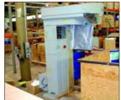
1997 INSTAPAK PACKAGING SYSTEM, MDL. 901