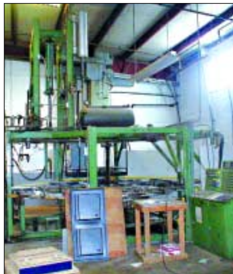
CUSTOM 4-STATION THERMOFORMER