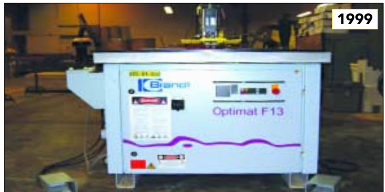
1998 BRANDT F-13 EDGE BAND/FLUSH TRIMMER