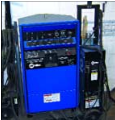
MILLER SYNCROWAVE 351 ARC WELDER