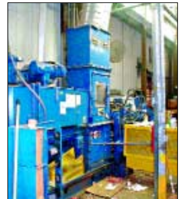
AMERICAN BALER COMPANY, 30' X 42' BALE