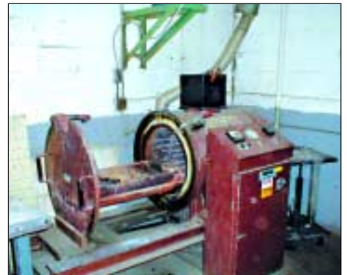
BERINGER ELECTRIC DRYING DIE CLEANING OVEN