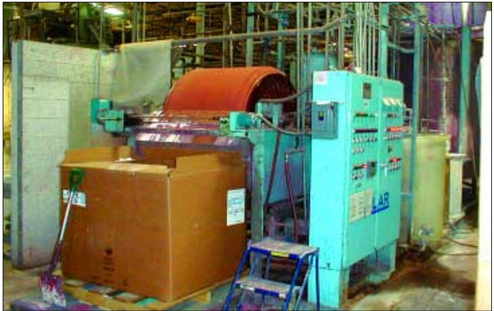
ALAR, MDL. 2000 PLUS FLEX-O-STAR SPLITTER WASTE WATER TREATMENT SYSTEM

Pallet Racking, Shelving, Banders, Tape Machine Tables, Conveyors, Self-Dumping Hoppers, Dust Collectors, Grass Ecopress, Fans, Double End Grinders, Vises, Clamps, Nail Guns, Stapler Guns, Drills, Die Cutters, Storage Cabinets, Carts, Hand Tools, Shop Vacs, Ladders, Saw Horses, Gluers, Fireproof Cabinets, Welding Carts, Port. Hot Saw, Port. Mag Drills, Machine Dollies, Welding Shields, Pressure Washer, Blue Print Cabinet, Lift Tables, Inspection Equip., Large Inventory of Fasteners, Honda Power Washer, Cardboard, Bench Gluers w/Guns, Marsh Tape Machines, Portable Stairs, Electric Tools, Staplers & Wood.