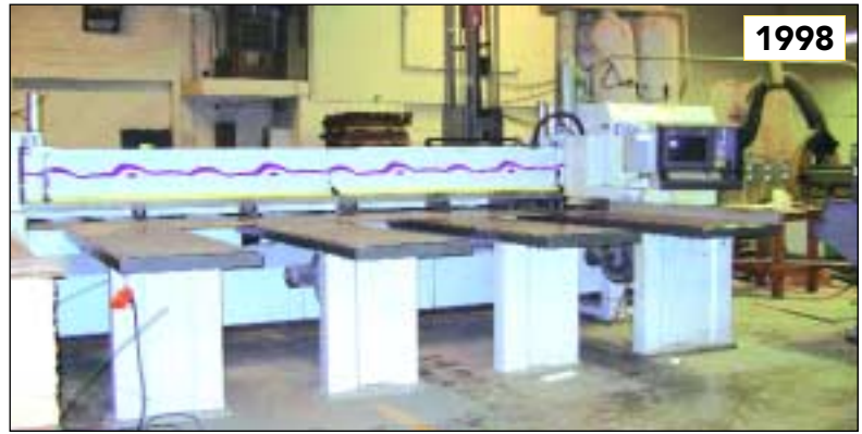
1998 HOLZMA OPTIMAT PANEL SAW, MDL. HPP81/42CAD