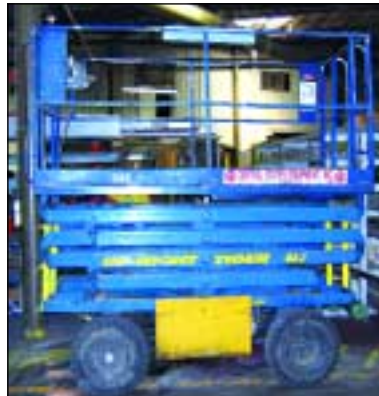
UPRIGHT "TIGER" MANLIFT, MDL. F512-00