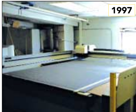
1997 DATA TECHNOLOGIES, MDL DT-2200 SAMPLE CUTTER