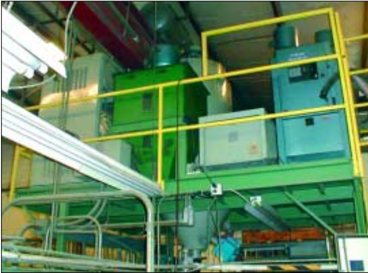
CONAIR HOPPER DRYER W/COLORTRONICS FEEDER