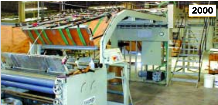
2000 STOCK MASCHINENBAU GMBH, TYPE 134R5 1250P FULL SHEET LITHOLAMINATOR LABEL MACHINE