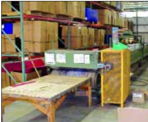
CUSTOM COMPRESSION BELT/FEED MACHINES