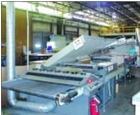
LAWSON, MDL "COMPANION" SENECA SILK SCREEN PRINTER