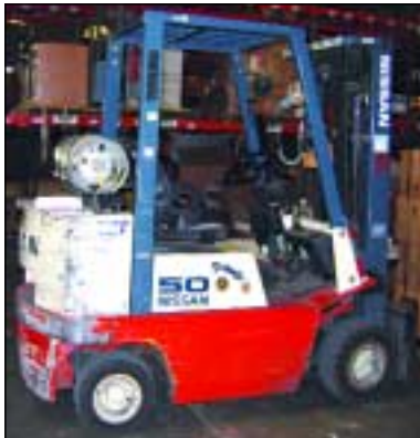
NISSAN FORKLIFT, MDL. APJ02A25PV, 5,000 LBS. CAP.