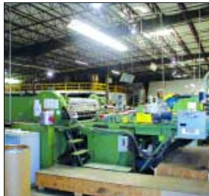
MIEHLE 5/0 DIE CUTTER