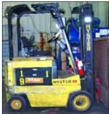
HYSTER FORKLIFT, MDL. E30XL, 3,000 LBS. CAP.