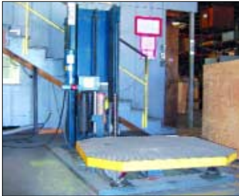
LAN WRAPPER SHRINK WRAP MACHINE