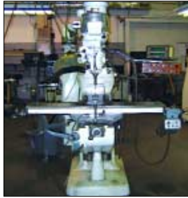
BRIDGEPORT VERTICAL MILLING MACHINE, SERIES I