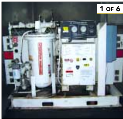
GARDNER ROTARY SCREW TYPE AIR COMPRESSOR