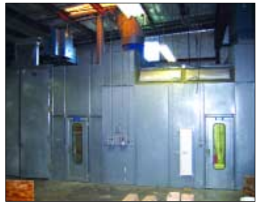
BINKS ENCLOSED PAINT BOOTH, MDL. CA-613-T-LO