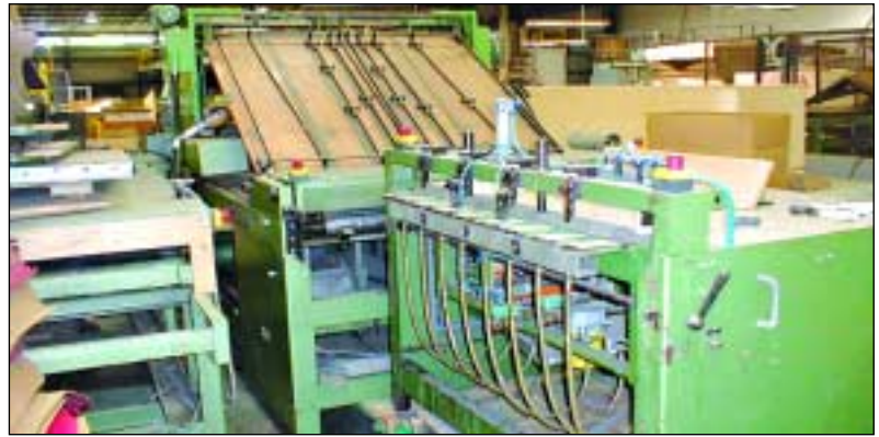
TUNKERS LAMINATOR TYPE VAB1400