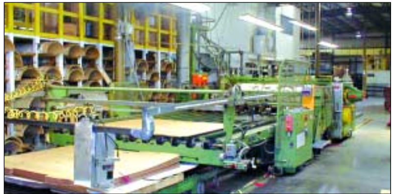
66" X 115" STALEY 114" DIE CUTTER