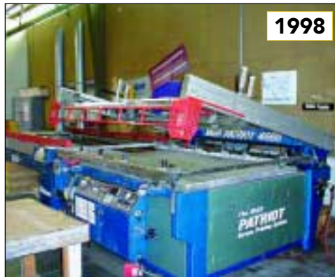
1998 M & R PATRIOT AUTOMATIC SILK SCREEN PRINTING SYSTEM