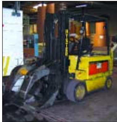
HYSTER FORKLIFT, MDL. E120XL2, 12,000 LBS. CAP.