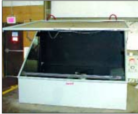
DOUTHITT MAGIC, #83/TYPE DMZ LIGHT INTEGRATOR