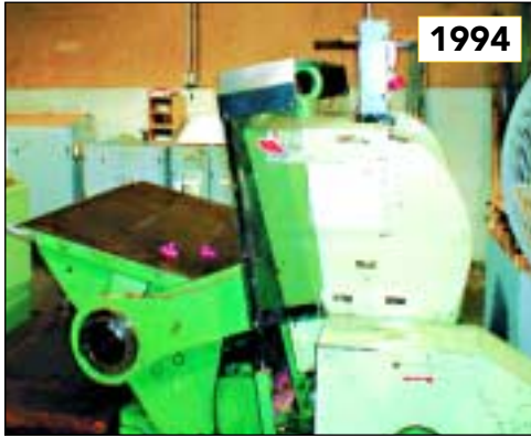
1994 THOMPSON DIE CUTTER