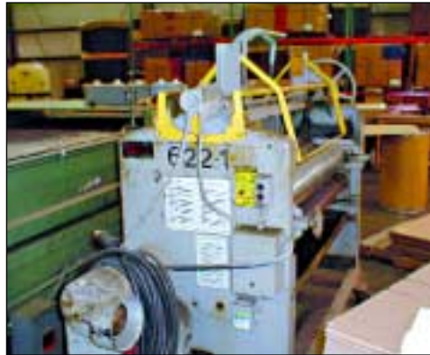
BLACK BROTHERS, 54" WIDTH GLUE/LAMINATING MACHINE