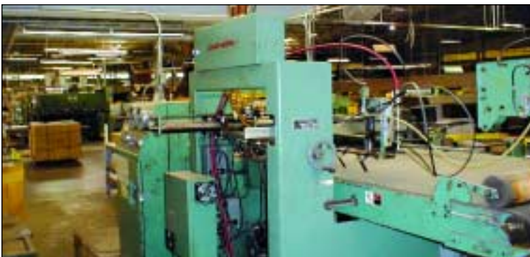
CRATHEN & SMITH LABEL MOUNTER