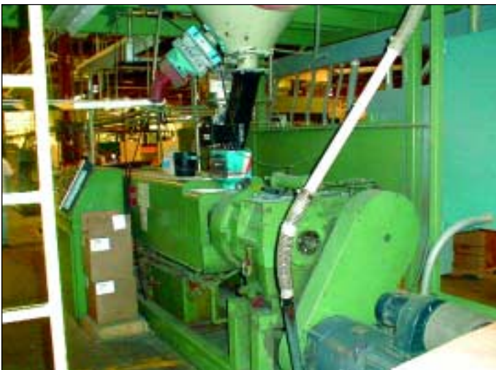
MPM PLASTIC EXTRUDER, MDL. 350/1626