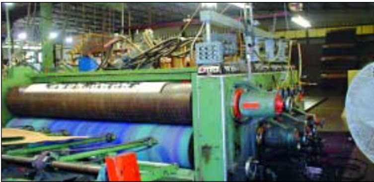
66" X 115" STALEY 114" DIE CUTTER, W/(3) COLOR FLEXO PRINTING STATION