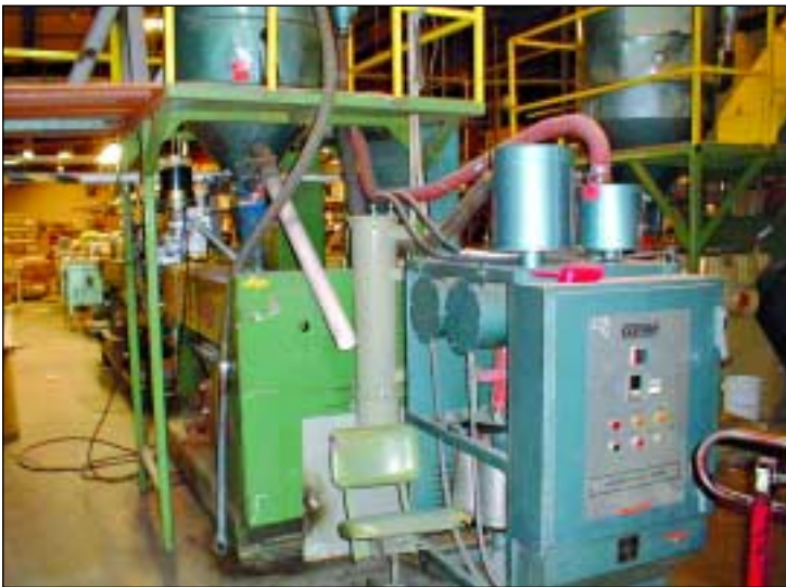
2-1/2" WELEX PLASTIC EXTRUDER, MDL. 250