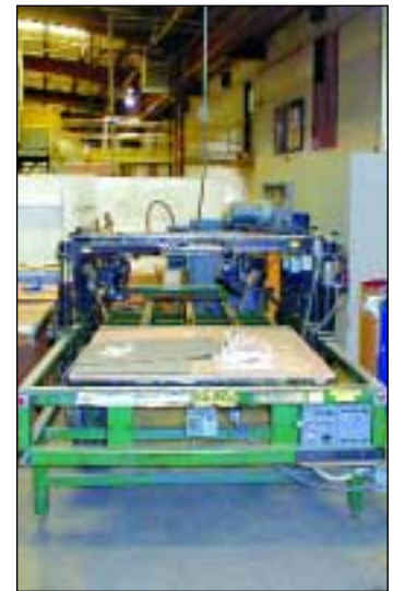
CUSTOM TRIM SAW