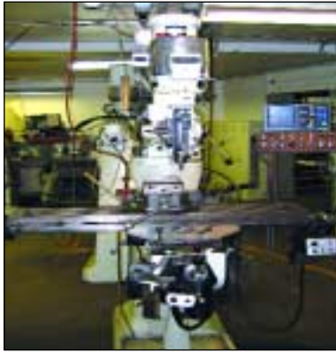
1989 BRIDGEPORT VERTICAL MILLING MACHINE