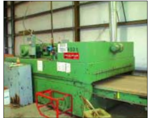
AMERICAN EQUIPMENT "VECTO JET DRYER"