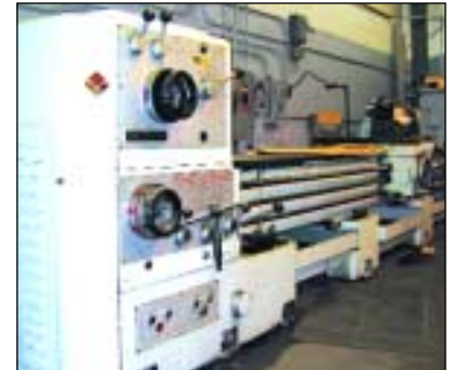
SUMMIT/UCIMO GEARED HEAD ENGINE LATHE