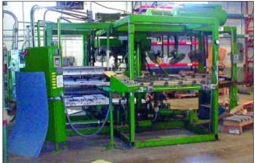
COMET 4-STATION THERMOFORMER