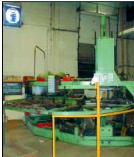
BROWN ROTARY 3-STATION THERMOFORMER, MDL. 233