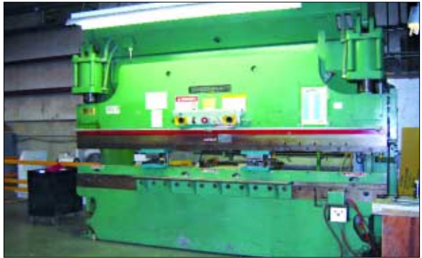
CINCINNATI HYDRAULIC PRESS BRAKE, MDL. 175CB, 175-TON