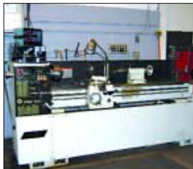
ROMI GEARED HEAD ENGINE LATHE, MDL. 13.5