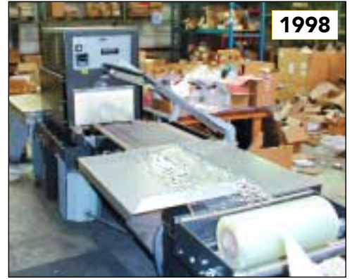
1998 EASTEY, MDL EM28TT TUNNEL SEALER SHRINK WRAP MACHINE