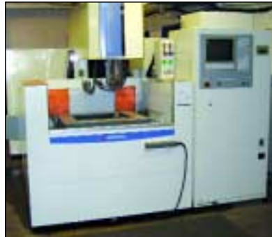
1998 MITSUBISHI EDM, MDL. FX-20K/W11FX2WIRE