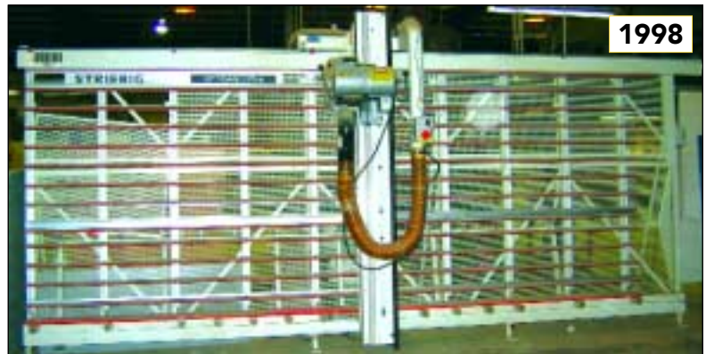
1998 STRIEBIG VERTICAL PANEL SAW, MDL. ECONOMY OPTISAW 1 PLUS