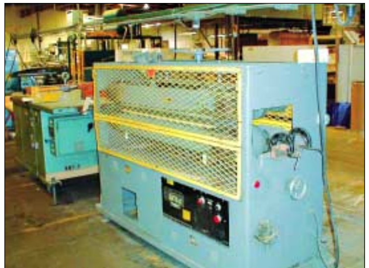
GATTO 208-8160 PULLER