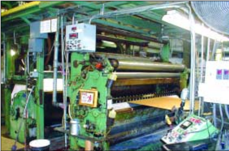
LANGSTON "C" FLUTE CORRUGATOR