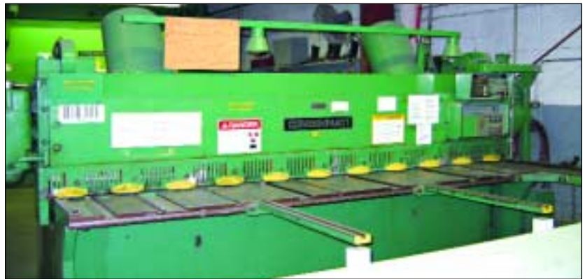
80'S CINCINNATI 10' X 1/4" MECHANICAL SQUARING SHEAR, MDL. 2CC10