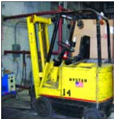
HYSTER FORKLIFT, MDL. E30BS, 3,000 LBS. CAP.