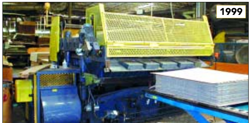
REBUILT SHERIDAN DIE CUTTER