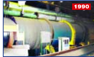
DIDION ROTARY SHAKEOUT, MDL. MD100