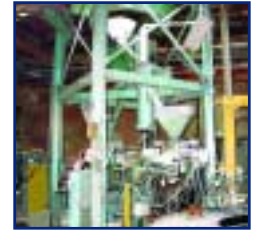
VIEW OF CE CAST ELECTRIC SAND HEATER, STRONG SCOTT CONTINUOUS MIXER, PALMER POWER FEEDER & PALMER COMPACTION TABLE