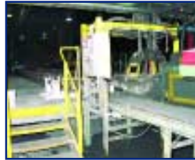
B&P 4-LINE CONTINUOMATIC MOLD HANDLING SYSTEM