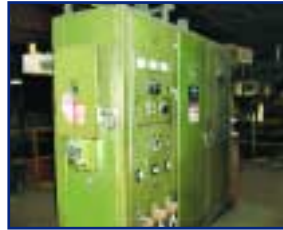
1000 LB. INDUCTOTHERM HYDRAULIC TILTING TRANSITE BOX FURNACE