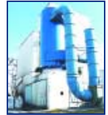
TORIT ROUND PULSE TYPE DUST COLLECTOR, MDL. 484RF10