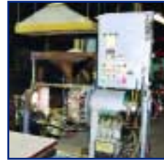
B&P SHELL CORE MACHINE, MDL. SF6CA