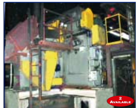
LAWSON/CWC 4 WHEEL CASTING GRINDERS