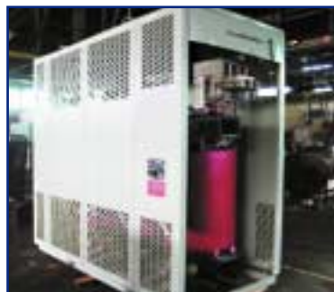
NEW ELECTRICAL SYSTEM