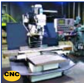
HURCO-DYNAPATH 750 CNC VERTICAL MILL