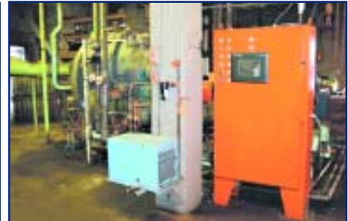
INGERSOL RAND CENTAC CENTRIFUGAL AIR COMPRESSOR MDL. 2C30M4

To Schedule an Auction or an Appraisal, Call Our Studio City, CA Office at 818.508.7034.