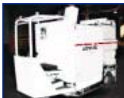
ULTRAVAC RIDING TYPE VACUUM