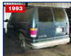
FORD CLUBWAGON XLT VAN