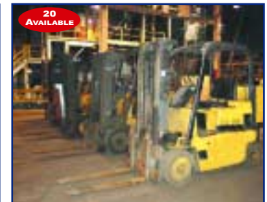
CATERPILLAR DIESEL & GAS OPERATED FORK LIFT TRUCKS MDL. T80