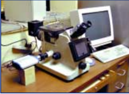
NIKON EPIPHOT TME TOP MOUNTED BINOCULAR MICROSCOPE