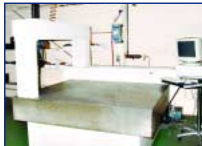
NUMEREX CMM MDL. CMC 6048-26