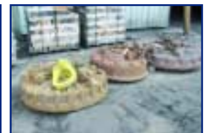
VIEW OF MAGNETS