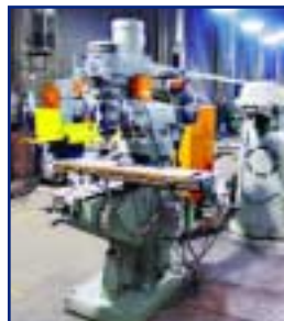
SUPERMAX VERTICAL MILL, MDL. YCM