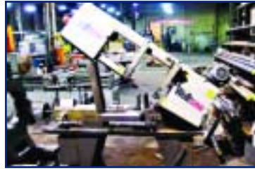
WELL-SAW, MDL. 1118