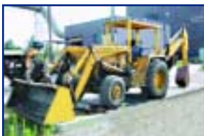
FORD BACKHOE & BUCKET LOADER MDL. 5500