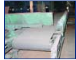
42"X100" LONG MESH BELT CONVEYOR