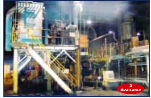
ARTISAND TURNTABLE TYPE COLD BOX CORE MACHINE