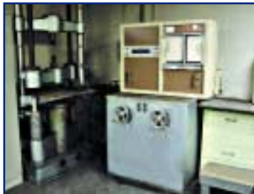
BALDWIN UNIVERSAL TENSILE TESTER