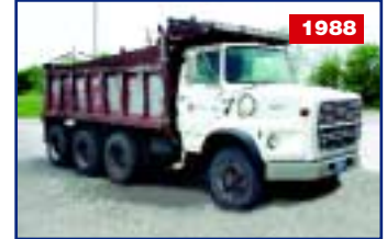
FORD L8000 3 AXLE DUMP TRUCK