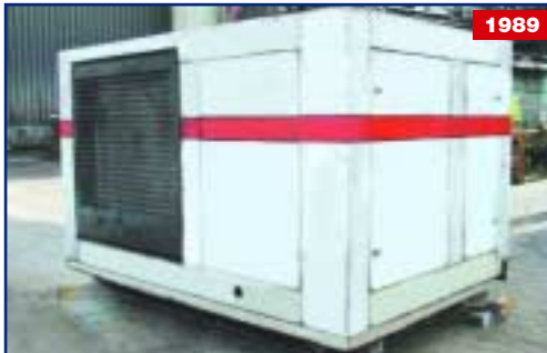
GARDNER DENVER ELECTRA-SAVER MDL. EAQQOE