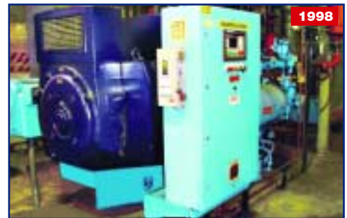
INGERSOL RAND CENTAC CENTRIFUGAL AIR COMPRESSOR MDL. 2CV35M3