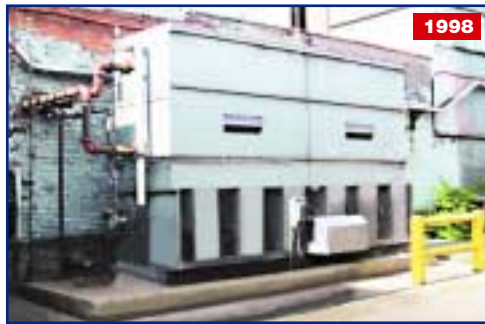
INGERSOL RAND ACE CLOSED LOOP COOLING SYSTEM MDL. ACE 200E-1