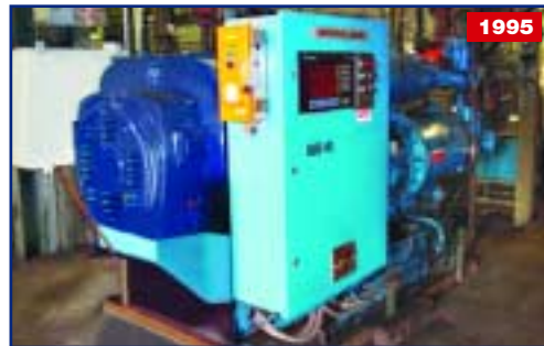
INGERSOL RAND CENTAC CENTRIFUGAL AIR COMPRESSOR MDL. 2CV29M3