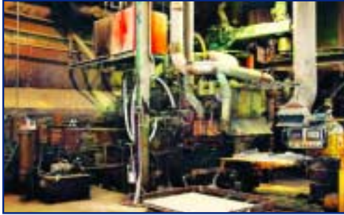
SHALCO AUTOMATIC EDGE BLOW COLD BOX CORE MACHINE MDL. 2G