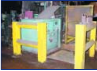
MAGNAFLUX INSPECTION STATION MDL. KSV-4407