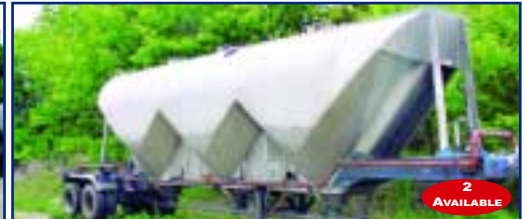
FRUEHAUF PNEUMATIC DRY BULK TRAILERS