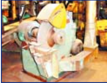
30" FOX SINGLE END SNAP TRAP GRINDERS MDL. 230, 1230, 230