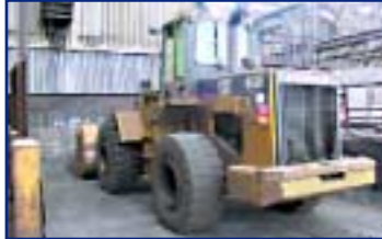
CATERPILLAR ARTICULATING FRONT END LOADER MDL. 950F