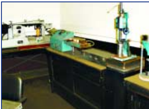
COMPLETE SAND LAB