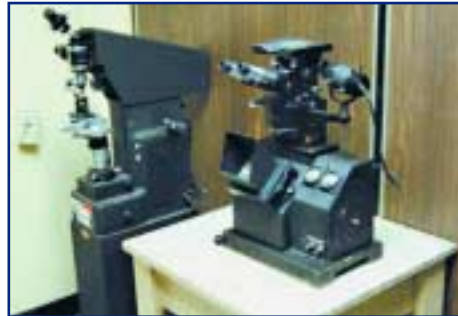
VIEW OF AUTOMATION CONTROLS GROUND FAULT LOCATOR, UNITRON TOP MOUNTED MICROSCOPE, WILSON MICROHARDNESS TESTER