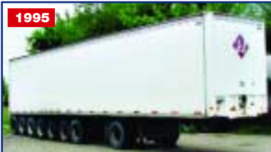
FRUEHAUF 8 AXLE 46' VAN TRAILER