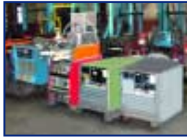
VIEW OF WELDERS