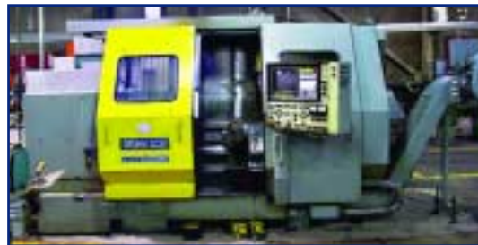
OKUMA LC30-2SC, 4 AXIS SIMULTURN CNC LATHE