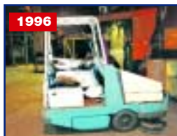
TENNANT FLOOR SWEEPER MDL. 385