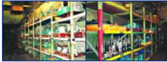
VIEW OF NEW MACHINE PARTS