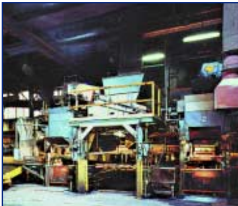
MATCHBLOMATIC MOLDING LINE