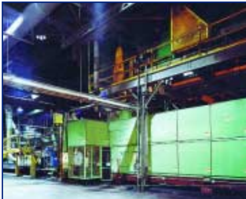
DISAMATIC MOLDING LINE