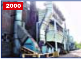
DCE DALAMATIC PULSE DUST COLLECTION SYSTEM MDL. DLM