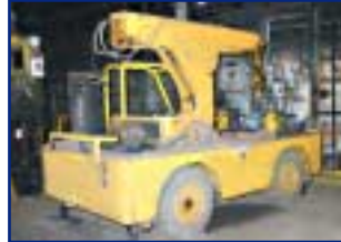
DROTT CARRY DECK CRANE MDL. 85RM2