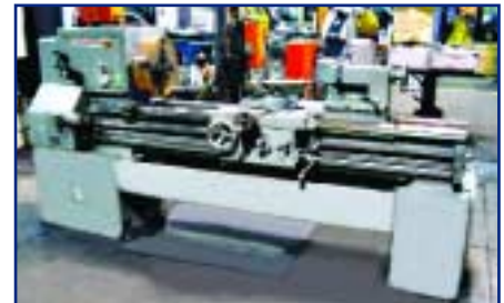
15" X 54" LEBLOND ENGINE LATHE