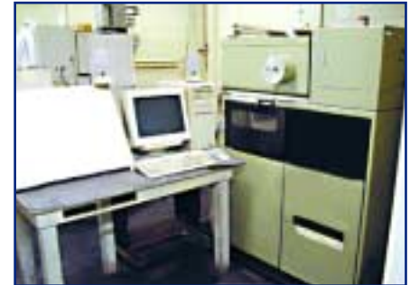
JARRELL ASH COMP 750 & 800 SPECTROMETERS MDL. ATOM