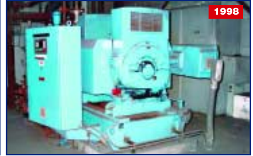
INGERSOL RAND CENTAC CENTRIFUGAL AIR COMPRESSOR MDL. 2AC1150M3HEAG