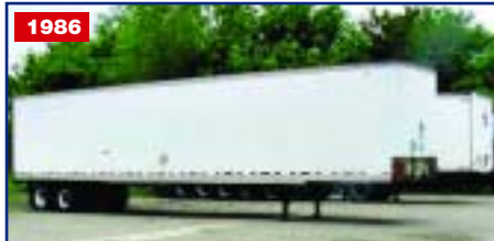
FRUEHAUF 2 AXLE VAN TRAILER