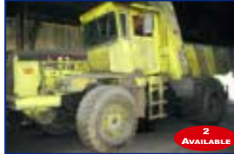
EUCLID OFF ROAD DUMP TRUCKS