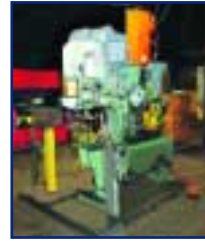
BUFFALO UNIVERSAL IRON WORKER