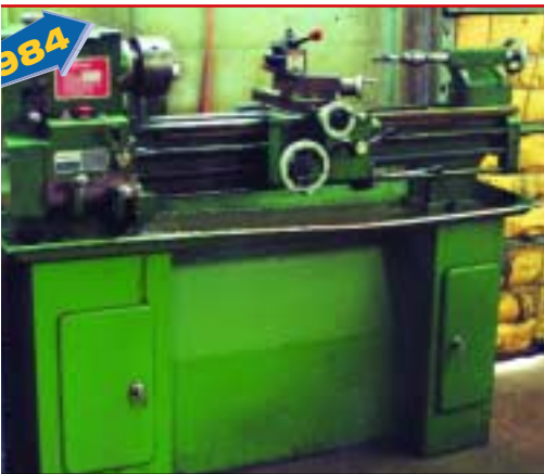
ENCO Precision Lathe, Mdl. 110-2030