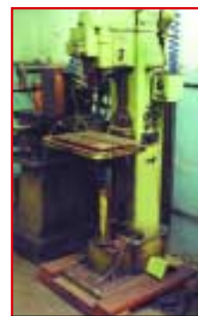
SNOW Deep Hole Drill, Mdl. DR-1-A