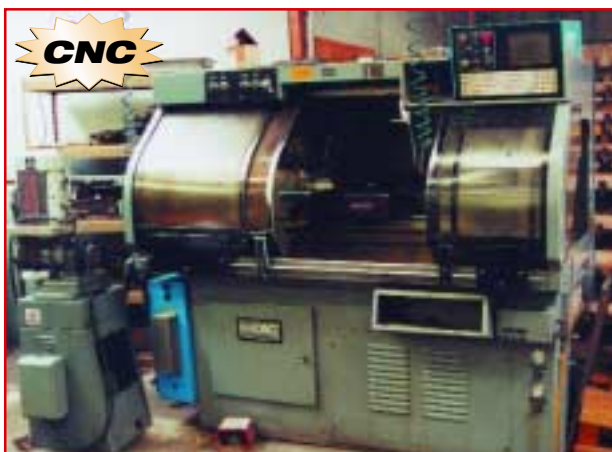
HARDINGE CNC Super Precision Chucker, Mdl. AHC