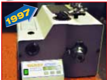
DAREX AP 5000 Auto Precision Drill Sharpener

INSPECTION: MONDAY, AUGUST 12 TH , 9 AM-4 PM & MORNING OF SALE