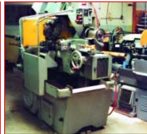
BROWN & SHARP Automatic Screw Machine, Mdl. 2