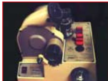
DAREX SP 2500 Auto Precision Drill Sharpener