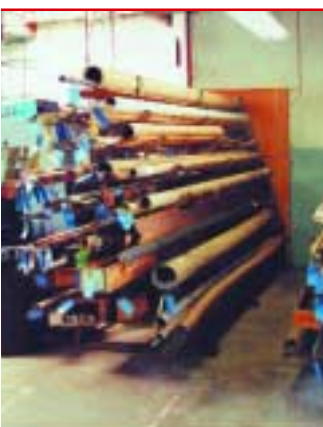
Large Quantity of Barstock