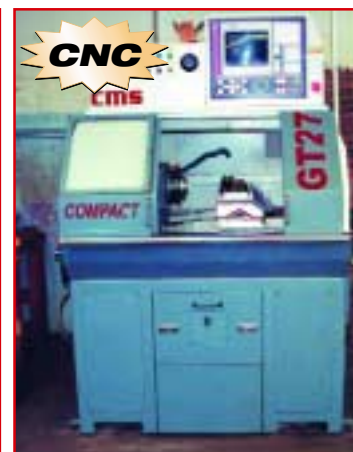
CMS Compact CNC Gangtool Turning Center, Mdl. GT27