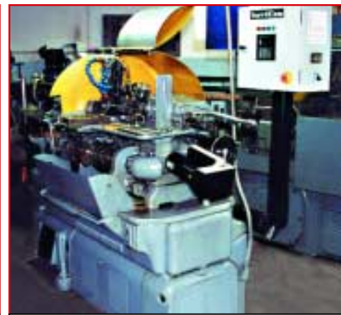
BROWN & SHARP Automatic Screw Machine, Mdl. 2G