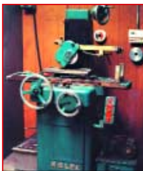
K O LEE Surface Grinder