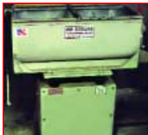
C & M Finishing Machine