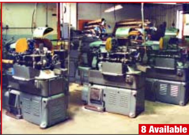
View of BROWN & SHARP Automatic Screw Machines, Mdl. 00G