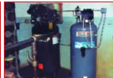
CAMPBELL HAUSFELD & DEVILBISS Air Compressors