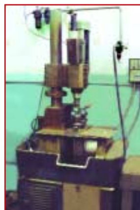
SUGINO Selffeeder Newtrick Drill