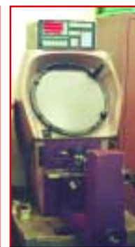
SCHERR TUMICO Optical Comparator