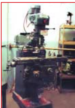
LAGUN Vertical Mill, Mdl. FT-1