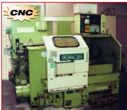
OKUMA CNC Lathe, Mdl. LB8