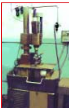
SUGINO Selffeeder Newtric Drill