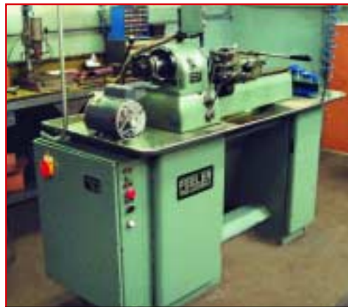
FEELER Turret Lathe, Mdl. FTS-27