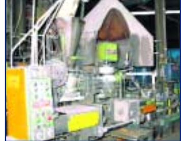
WITH DAKOTA GAS SCRUBBER