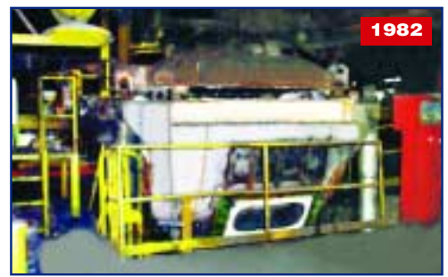
65 TON BBC VERTICAL CHANNEL HOLDING FURNACE MDL. IRV-11