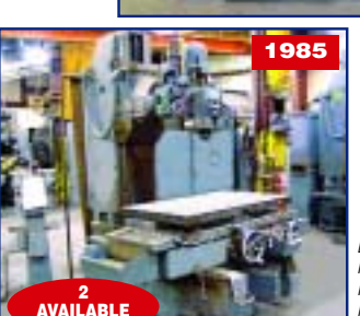
BOHNER & KUHI F BOKO MF1 WOOD MILLING MACHINES

. To Schedule an Auction or Appraisal, Call our Corporate Headquarters at: 818.508.7034