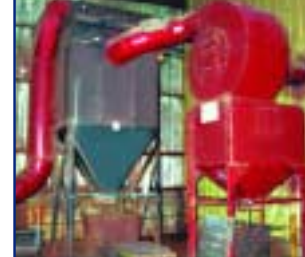
AAF PULSE DUST COLLECTOR

Know the Value of Your Assets? Biditup Does! Call 818.508.7034