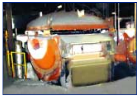
35 TON BBC VERTICAL CHANNEL HOLDING FURNACE MDL. IRV-8

To View our Upcoming Auctions, Visit our Website at: www.biditup.com