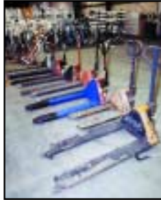
VIEW OF PALLET JACKS