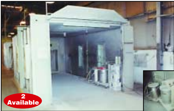
10' X 20' DEIMCO POWDER COATING BOOTH, MDL. PCB-5 W/POWDER COAT SPRAY GUN & CONTROL