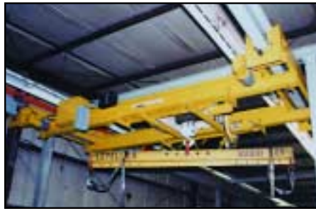
5 TON LETTELLIER BRIDGE CRANE W/SPREADER BAR