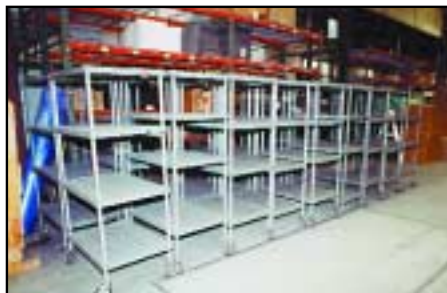
VIEW OF MATERIAL RACKS

(120) Stackable Chairs • (5) Microwaves • Tomach Double Door Stainless Freezer • (50) Mounted Shop • (20) Steelcase Office Cubes, Desks and Chairs • (108) Utility Carts • (2) Rolling Stair Cases • Barrel Carts • Stripping and Banding Carts • (70) Sections Pallet Racks • Racks • Miscellaneous Tools: Pneumatic Grinders, Air Tools, Hand tools, Scrap Metal & Much More!