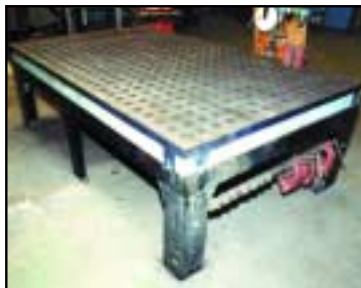
5' X 10' WELDSALE ACORN TABLE