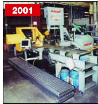
MODERN MACHINE TOOL INC. CUTOFF MARVEL VERTICAL BAND SAW, MDL. E2125TS LATHE, MDL. 2LD W/AUTOLOAD SYSTEM