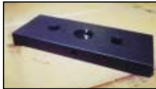
FINISHED PRODUCT AFTER POWDER COAT & CURING