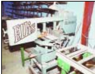
ELLIS HORIZONTAL BAND SAW, MDL. 1600 CONVEYOR