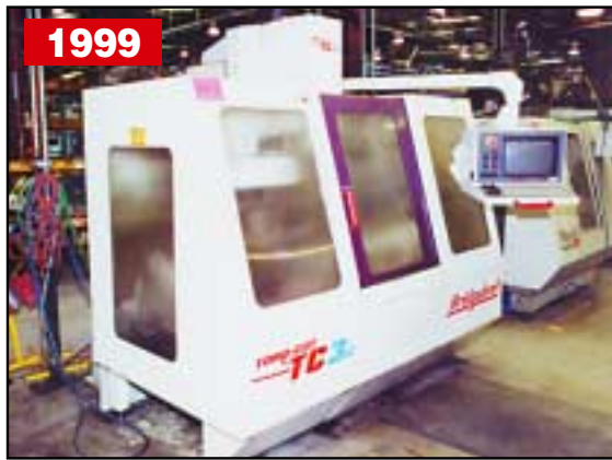
1999 BRIDGEPORT VERTICAL MACHINING CENTER, MDL. TC3G CNC