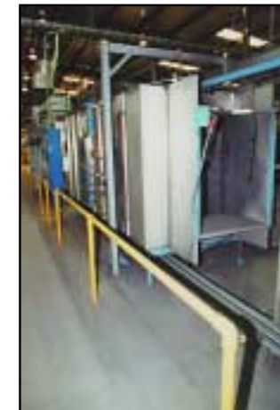
POWDER COAT SYSTEM FOR WEIGHT LINE