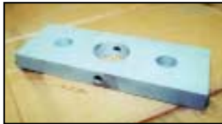
DRILL BORED, DEBURRED & SANDBLASTED