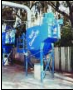
TORIT DUST COLLECTORS