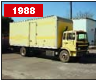
MACK 6-CYLINDER DIESEL TRUCK