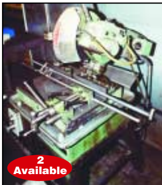
HABERLE COLD SAW, MDL. H-350