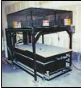
PLASTIC COATING MACHINE DIP PROCESS