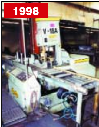
HYDMECH SAW, MDL. V-18A