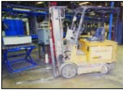
4000 LB CAT FORKLIFT, MDL. 2FG25