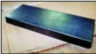
RAW METAL STOCK

1-LINE CONSISTING OF: (2) HAUSE MACHINES INC. Drilling & Boring Machines, Mdl. 23196-89, s/n 040312, w/Multi Spindle Head, ALLEN BRADLEY Panel View Control; OLS Deburring Machine, w/Total Control Quick Panel SR Control; ICM Sand Blast Machine, MOUL Conveyor #C-11000, s/n SJ4415M-090011, Year 2000; DEIMCO Powder Coat Booth, 6 Nozzle System; In-Frathern 10-Station Conveyorized Pass Through Curing Oven.