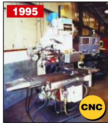
1995 PROMILL CNC VERTICAL MILL