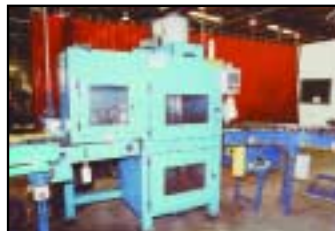
OLS DEBURRING MACHINE FOR WEIGHT LINE