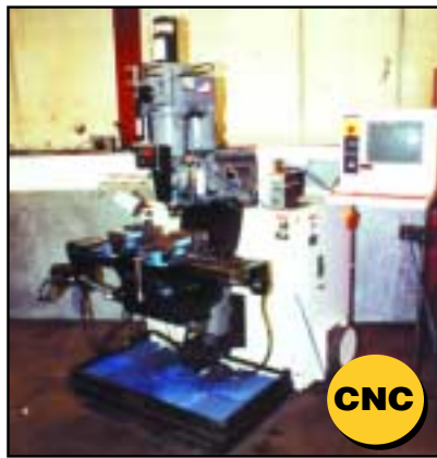
BRIDGEPORT CNC VERTICAL MILL, MDL. V2-XT,