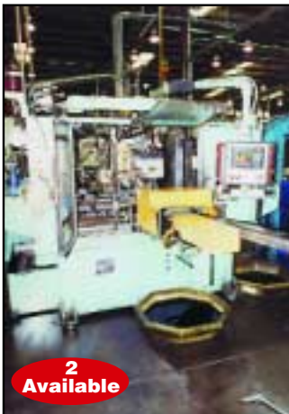
HAUSE MACHINES INC. DRILLING & BORING MACHINES, MDL. 23196-89 FOR WEIGHT LINE