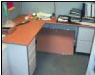
VIEW OF OFFICE FURNITURE

Complete Workout Gym • 50 HP LEROI Air Compressor • (4) TORIT Grinding Booths, 8' x 20', 4 Exhaust Filters • (3) Self Dump Hoppers, 3' x 4' • Plastic Coating Machine, Dip Process, 4' x 4" Tank • KUFO Mdl. UFO-102B, 3HP, 2-Bag Dust Collector • TORIT Dust Collector, Mdl. DFT2-8, s/n IG640264-002, 4 Filter, 10 HP • SONIC AIR SYSTEMS Dust Collector, # HP 10 Gal. Cap • INTEGRITY Cam Wrap System, w/Inset of Port • PAD PAK Paper Packaging System, Mdl. MPPDEPT 0075 s/n 2183141 • PRACTIX Hot Emblem Stamping Machine Mdl. OK390, s/n 503 • TOLEDO 2000Lb. Cap Floor Scale 6"x8" Platform • Mobile Metal Fixture Racks • Fixed Steel Cantilever Rack • Steel Tube and Bar Support Racks • Full Tool Crib • STANDRIDGE 48" x 72" Granite Surface Plate • MILWAUKEE Drills • Manual Lift Tables • 1 1/2 HP BALDOR Double End Buffer • RIGID 300 Pipe Threader • 25 Ton DAYTON H-Frame Press • 3 Ton DUKE Arbor Press • Parts Washer • FAIRBANKS Digital Scale • 2-Door Cabinet • LOC-TITE, Mdl. Hysol 175 Glue Gun • FABC layout Tables • 4'x 8' Sewing Layout Tables • Washing Machine and Dryer • Reels, Cordless Drills, Clamps, Powered Cord Reels • Dock Plate • Ice Maker • Shop Fans • (4) Sections of Lockers • Wilton Bench Vise • Bench Vises • Fire Cans • Heavy Duty Cabinets • Tool Boxes • Landa Pressure Washer • 4' x 8' Work Tables • 3' x 6' Steel Tables • Toledo Digital Scale • (12) Tables •