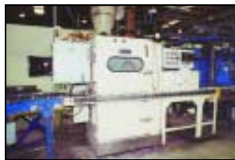
ICM SAND BLAST MACHINE FOR WEIGHT LINE