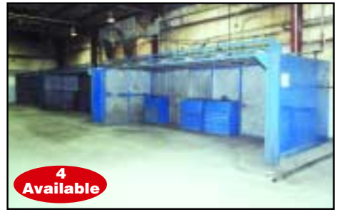
TORIT GRINDING BOOTHS