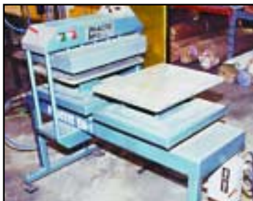
PRACTIX HOT EMBLEM STAMPING MACHINE MDL. OK390