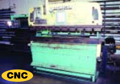
PROMECAM, MDL. RG5020 CNC HYDRAULIC PRESS BRAKE