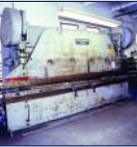
CINCINNATI, MDL. SERIES 9 PRESS BRAKE