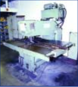
W.A. WHITNEY, 18 TON PORTABLE HYDRAULIC PUNCH