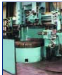
BULLARD 74" VERTICAL TURRET LATHE