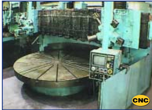
BETTS 120" CNC VERTICAL TURRET LATHE