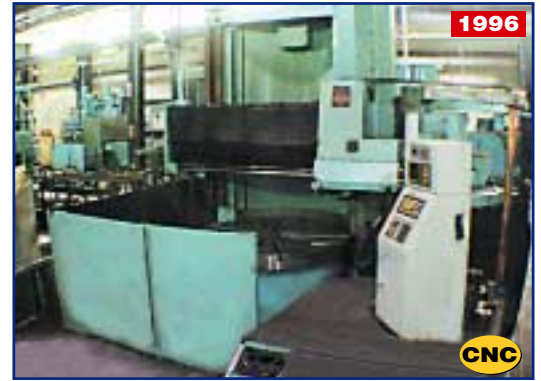
BULLARD 76" CNC DYN-AU-TAPE VERTICAL TURRET LATHE