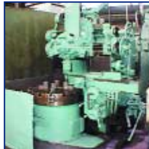
BULLARD 42" VERTICAL TURRET LATHE