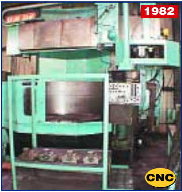
O-M LTD. MODEL V15-16N 63" CNC VERTICAL TURRET LATHE