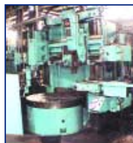
BULLARD 66" DYNATROL VERTICAL TURRET LATHE