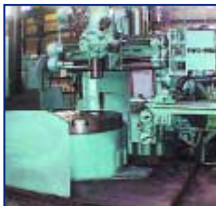
BULLARD 54" VERTICAL TURRET LATHE