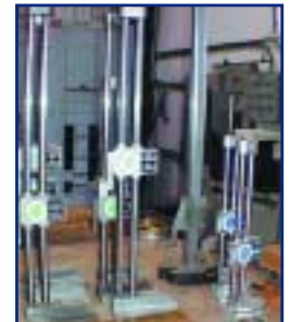
MISC. INSPECTION EQUIPMENT