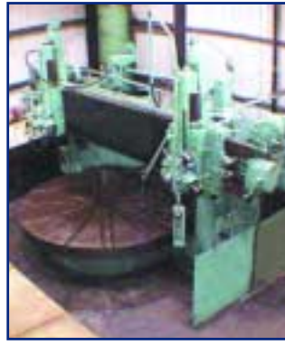
BETTS 120" VERTICAL TURRET LATHE