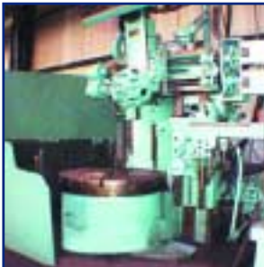
BULLARD 54" VERTICAL TURRET LATHE

Bench Grinders w/Stands, Vises, Bench Vises, Tool Cabinets, Shelving, Top Jaws For VTL's, Tool Holders, Large Boring Bars, Large Face Plates, Drills, Work Blocks, Bolts, Nuts, Electrical Boxes, Grease Guns, Slings & Strapping For Rigging, Banding Carts, Ladders, Electrical Wire, Portable Heaters, Chains, and Much, Much More.