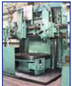
BULLARD 74" VERTICAL TURRET LATHE