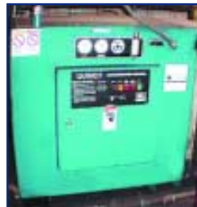
QUINCEY ROTARY SCREW AIR COMPRESSOR MDL. QMB30ACA32E