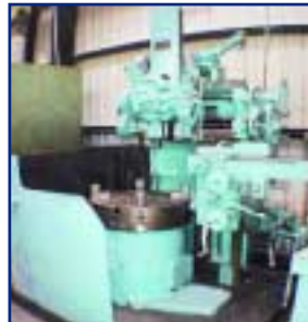
BULLARD 36" VERTICAL TURRET LATHE