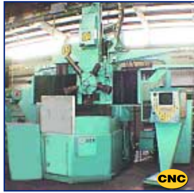
GIDDINGS & LEWIS 42" CNC VERTICAL TURRET LATHE