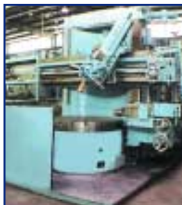
BULLARD 64" CUTMASTER VERTICAL TURRET LATHE