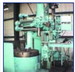
BULLARD 64" VERTICAL TURRET LATHE

To Schedule an Auction or an Appraisal, Call Our Studio City, CA Office at 818.508.7034.