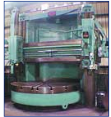
BULLARD 108" DYNATROL VERTICAL TURRET LATHE