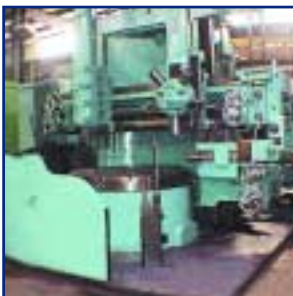
BULLARD 64" VERTICAL TURRET LATHE