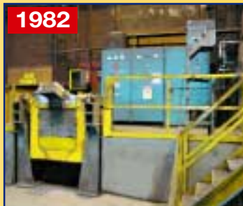
AJAX CORELESS MELTING SYSTEM