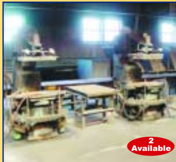
OSBORN MDL. 716 ARW-1 JOLT SQUEEZE PINLIFT MOLDING MACHINES