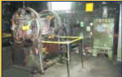
SHALCO GAS FIRED SHELL CORE MACHINE, MDL. U180