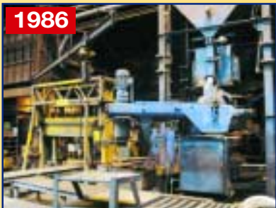
DEPENDABLE MDL. 10 NO BAKE MOLDING SYSTEM