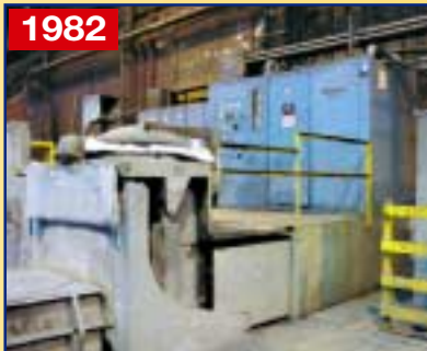
INDUCTOTHERM MODEL 1250-2 POWERMELT CORELESS INDUCTION MELTING SYSTEM

Company Check w/Bank Guarantee Letter, Cashier's Check, Wire Transfer. 10% Buyer's Premium. For Complete Terms & Conditions, Visit our Website.