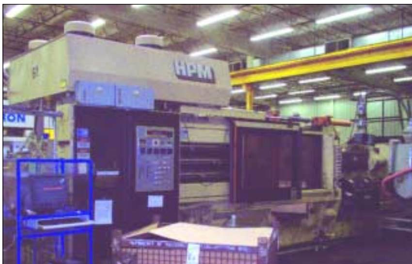
1985 700-TON HPM HORIZONTAL, MDL. 700MKIWP-75