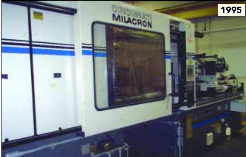
1995 440-TON CINCINNATI MILACRON, MDL. VT440-54