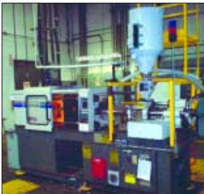
1991 85-TON CINCINNATI MILACRON