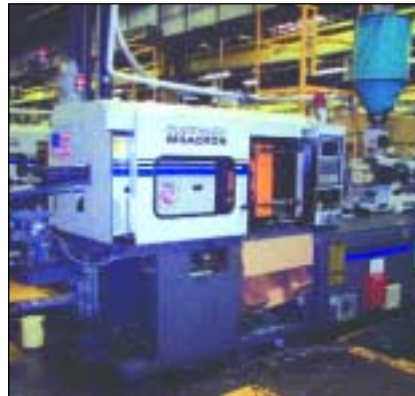
1993 110-TON CINCINNATI MILACRON