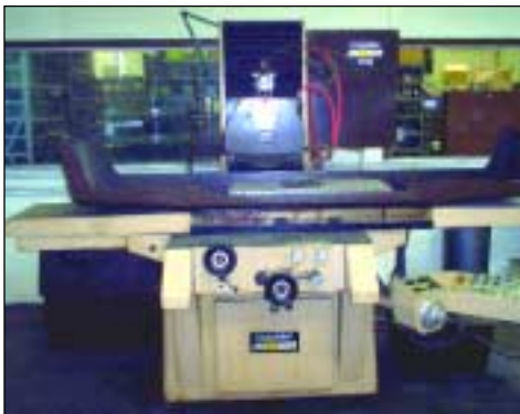
CLAUSING JACOBSON 14" x 32" SURFACE GRINDER