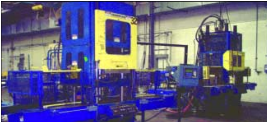
1991 & 1986 200-TON NEWBURY VERTICAL SHUTTLE