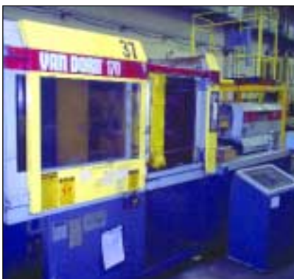
1992 110-TON CINCINNATI MILACRON