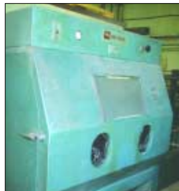
UCF SHOT BLAST CABINET