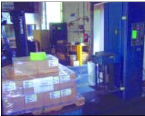
HALLOT PALLET WRAPPER