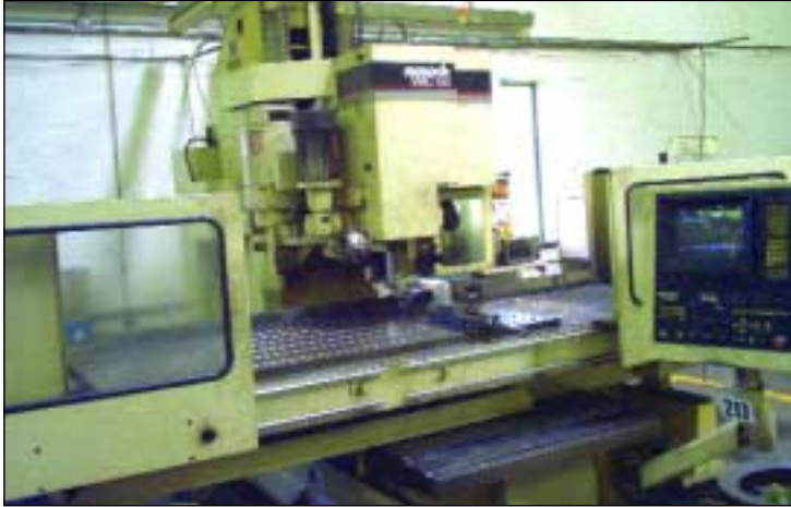
1989 MONARCH VERTICAL MACHINING CENTER, MDL. VMC-150