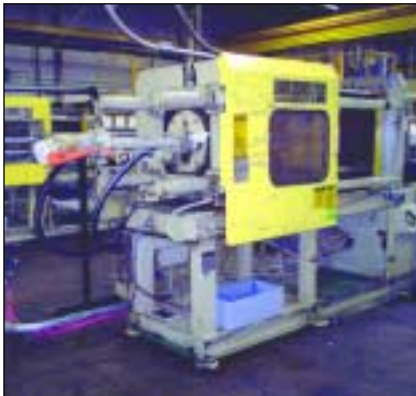
1984 200-TON VAN DORN