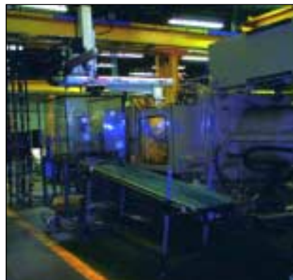
STAR AUTOMATION ROBOT, MDL. TW-800FM-3