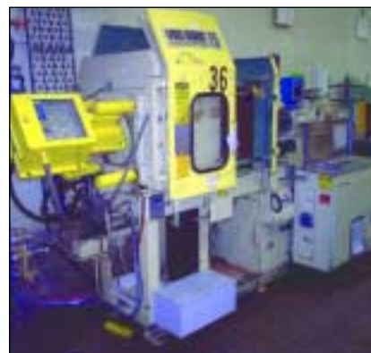
1979 75-TON VAN DORN