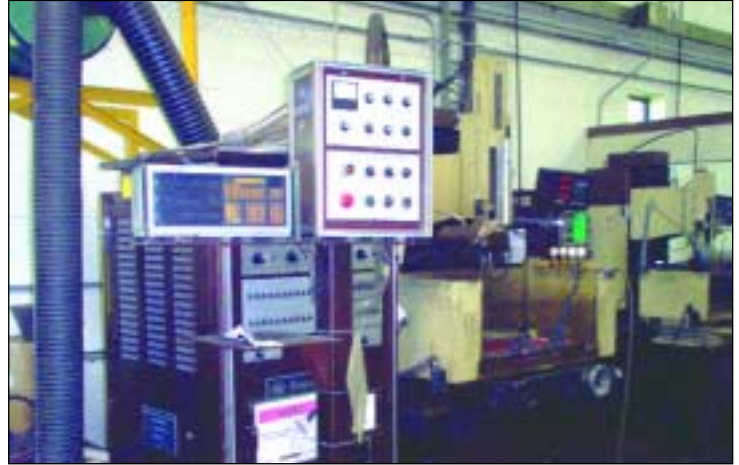
EASCO EDM MODEL EASCOT 1024 FMS RAM