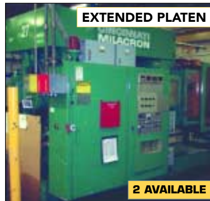
1984 375-TON CINCINNATI MILACRON