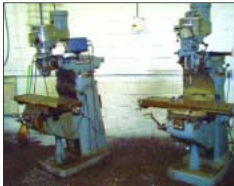
BRIDGEPORT MILLING MACHINES