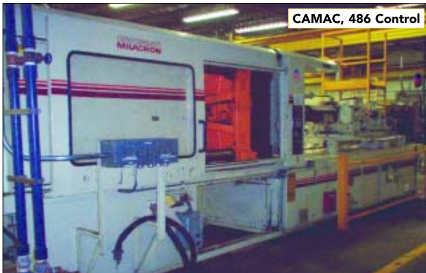
1989 500-TON CINCINNATI MILACRON, MDL. VH 500-54