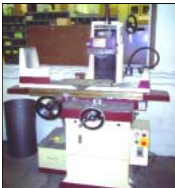
CHEVALIER 6" x 18" SURFACE GRINDER