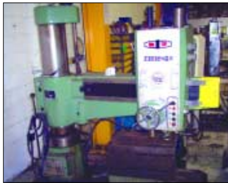
ZJ RADIAL DRILL