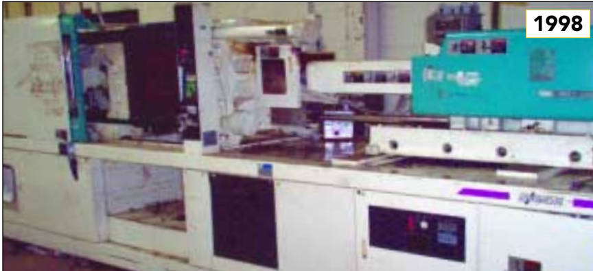
1998 200-TON NIIGATA, MDL. NE200UA4