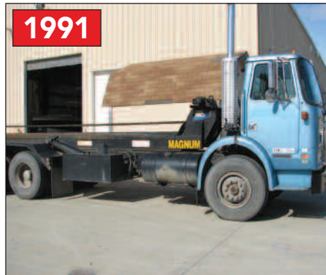
1991 WHITE/GMC HYD. ROLL-OFF TRUCK