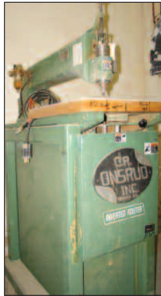
CR ONSUD INVERTED ROUTER, MDL. 3627