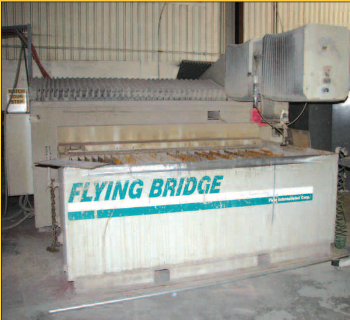
FLOW INTERNATIONAL "FLYING BRIDGE" MDL. I-4800 WATERJET

Including: Metal Fabrication, Woodworking, Plant Support and Much More!