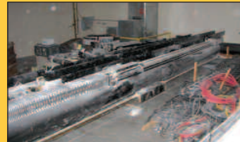
5-AXIS GANTRY MILL