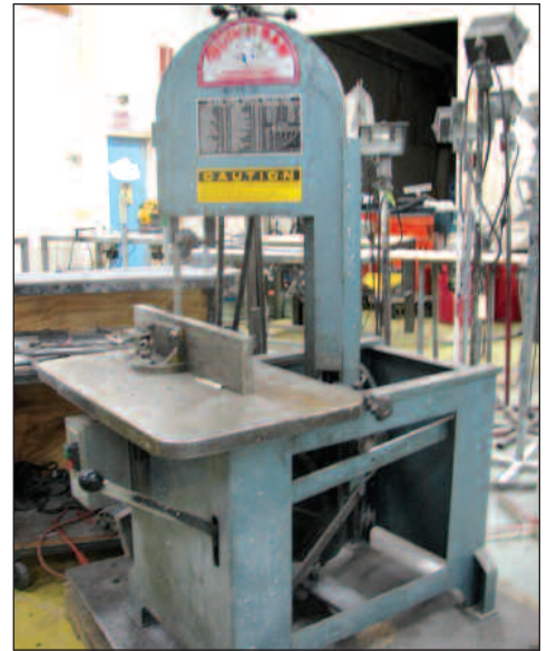
ROLL-IN SAW, MDL. EF1459 VERTICAL BAND SAW