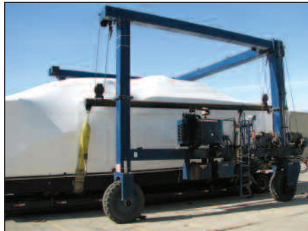
ACME MARINE HOIST, MDL. H35/2, 70,000# CAPACITY