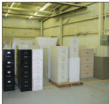
VIEW OF FILE CABINETS