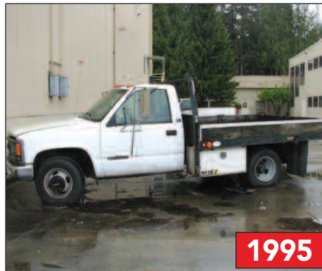
1995 GMC FLATBED