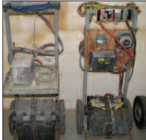
BATTERY PACKS W/CHARGERS