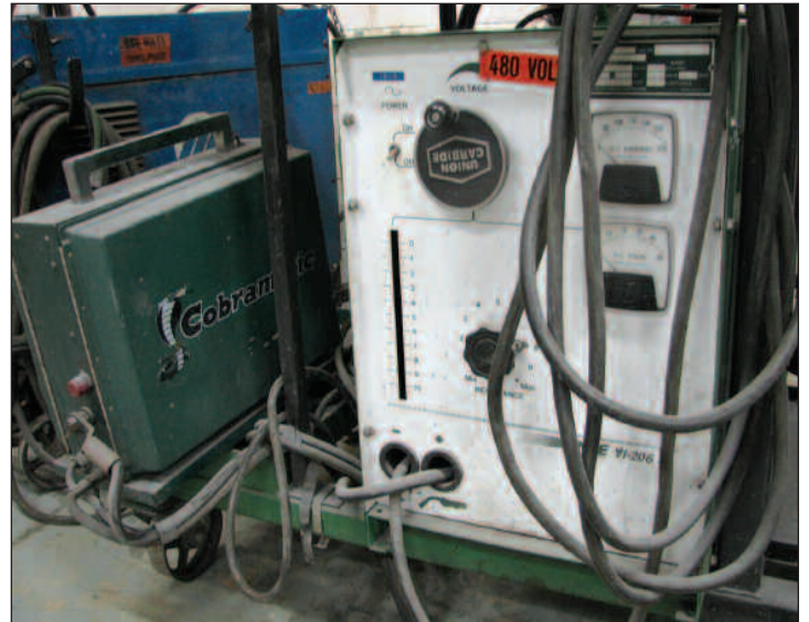
LINDE VI 206CV WELDER W/COBRAMATIC WIRE FEED