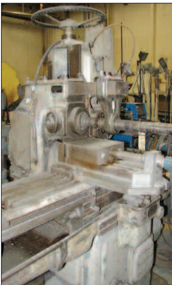
SUNSTRAND KEY CUTTER