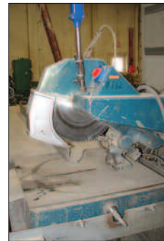
SABRE 10" UNISAW