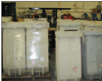
ROLLING TOOL CHESTS