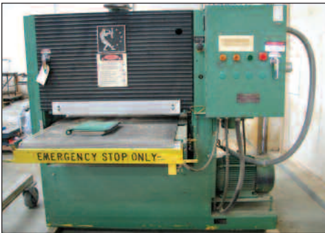
TIMESAVER MDL. 137-1-HD 36" BELT SANDER