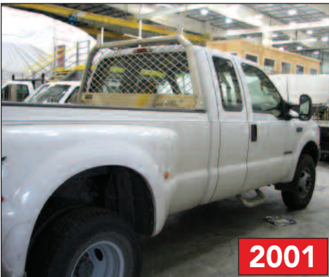
2001 F350 XL SUPER DUTY