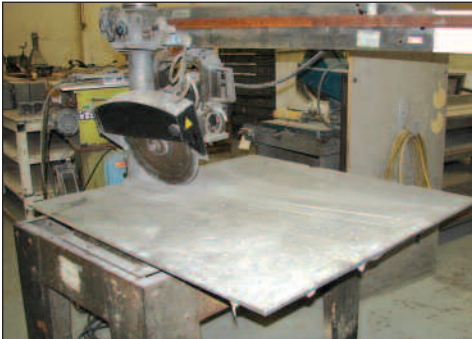
DEWALT RADIAL ARM SAW, MDL. 21