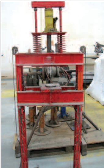
DAYTON MDL 3Z915 15-TON H FRAME HYDRAULIC PRESS