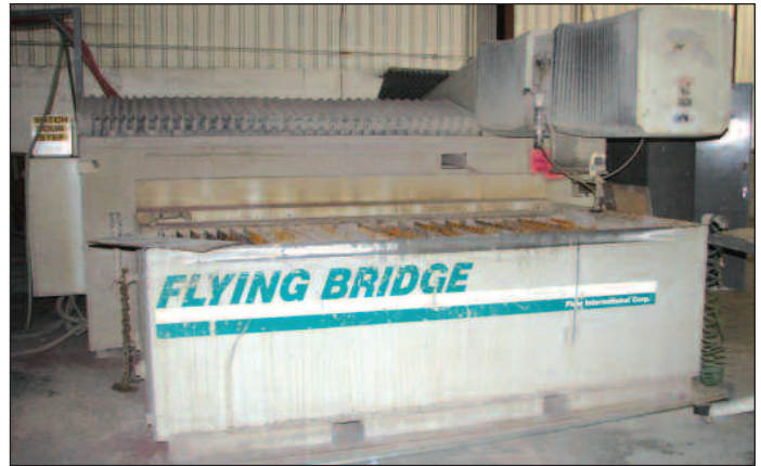
FLOW INTERNATIONAL "FLYING BRIDGE" MDL. I-4800 WATERJET