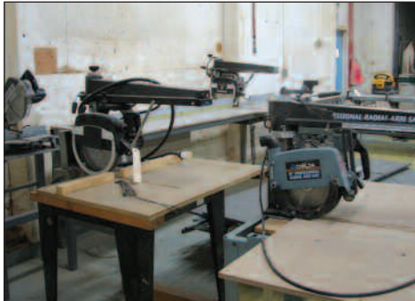
VIEW OF RADIAL ARM SAWS