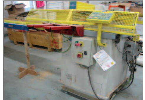
TUCKER & VERLENDER PACK SAW