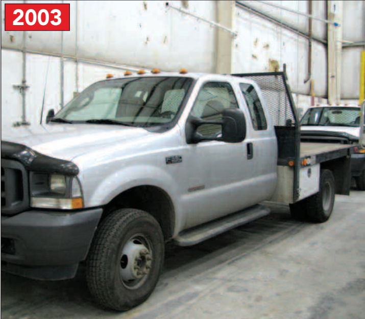
2003 F350 SUPER DUTY

1995 GMC 3500 FLATBED Diesel 4x4 1995 GMC 3500 FLATBED Diesel 1995 GMC FLATBED 1988 GMC PICKUP 2001 CHEVY CARGO VAN