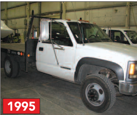
1995 GMC 3500 FLATBED