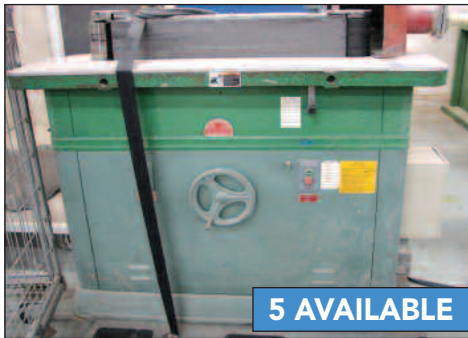
NEWTON MDL. E-30 OSCILLATING SANDER