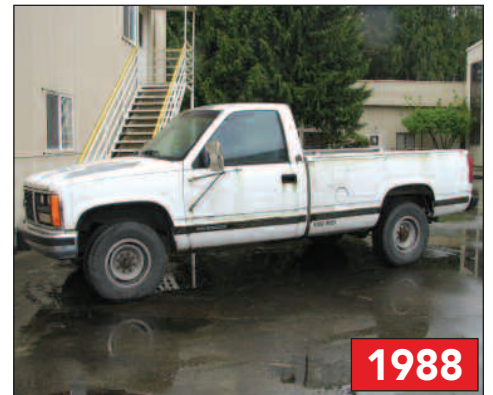
1988 GMC PICKUP