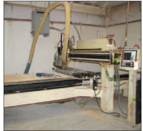
MOTION MASTER MDL. SB510 CNC ROUTER