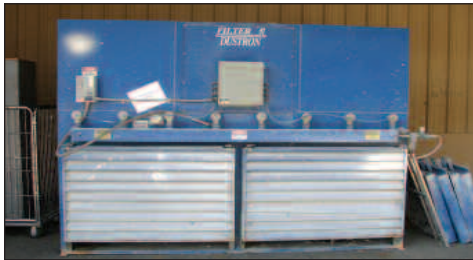
FILTER 1 DUSTRON DUST COLLECTION SYSTEM