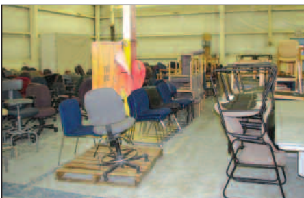
VIEW OF CHAIRS