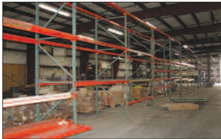
LARGE QTY. OF PALLET RACKING