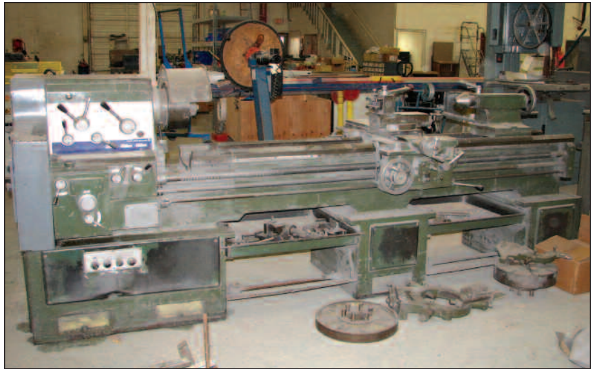
JET LATHE, 80" BED, 18" CHUCK, MDL. 1880TA