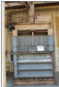
KILKON CARDBOARD BAILER