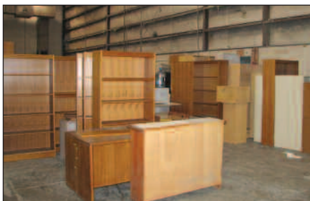
VIEW OF OFFICE FURNITURE