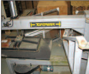
TOP MASTER HATCH TRIMMER