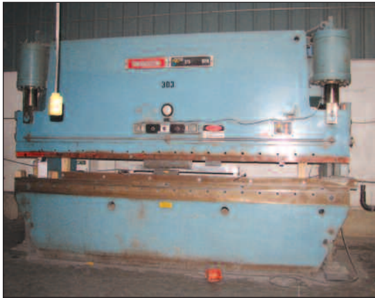
NIAGARA 175-TON PRESS BRAKE, MDL. HBM 17512