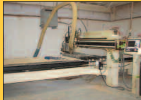
MOTION MASTER CNC ROUTER