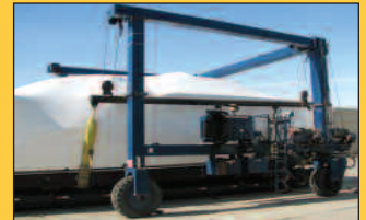
ACME MARINE HOIST, 70,000# CAP.

BIDITUP™ AUCTIONS & APPRAISALS WORLDWIDE 11426 Ventura Boulevard Studio City, California 91604 Phone: 818.508.7034 Fax: 818.508.3025 info@biditup.com