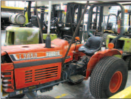
KUBOTA L2050 TRACTOR