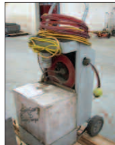
SEASTAR POWER PURGE