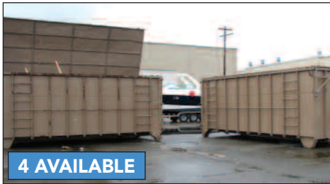
4 AVAILABLE 40 YARD DUMPSTERS