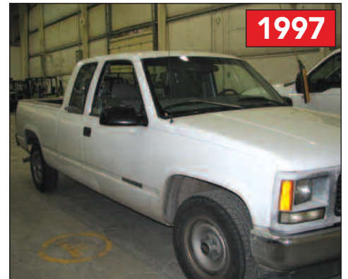
1997 GMC 2500 PICKUP