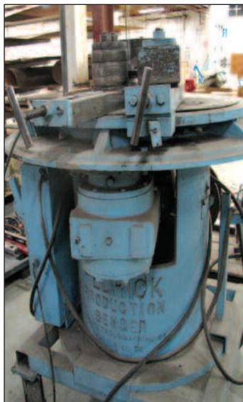
PEDRICK PRODUCTION BENDER W/DIES