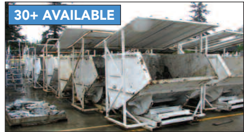
30+ AVAILABLE ARURA DUMPING HOPPERS