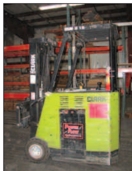
CLARK STANDUP FORK TRUCK