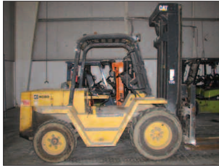
CAT RC60 6000# FORK TRUCK