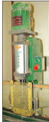
GRASS IMPERIAL HINGE ROUTER