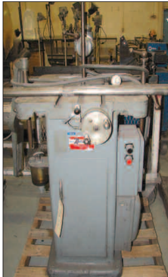
DC MORRISON KEY CUTTER