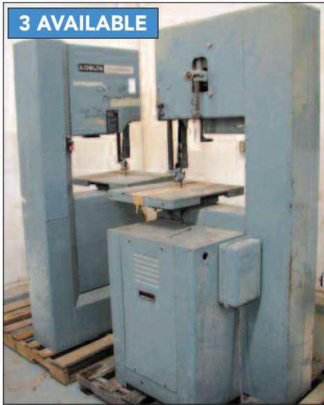
DELTA 20" VERTICAL BAND SAW