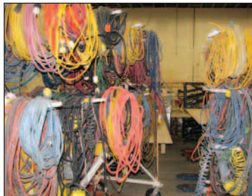
HYDRAULIC BARREL DUMPERS