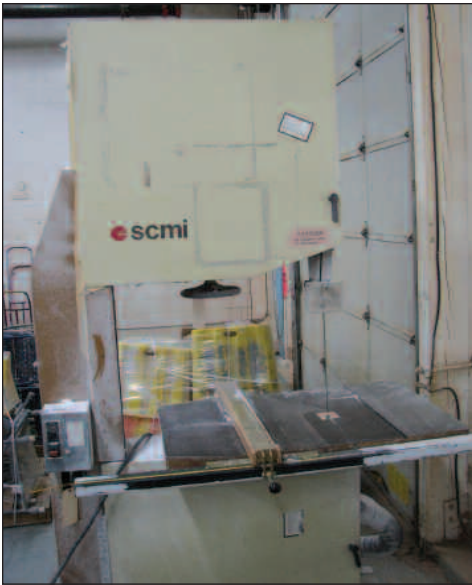
SCMI MDL. 900SC VERTICAL BAND SAW