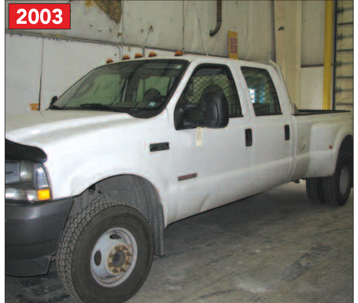
2003 F350 XL SUPER DUTY, 4-DOOR