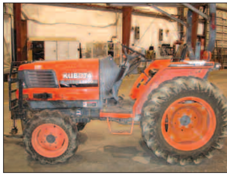
KUBOTA L2900 TRACTOR