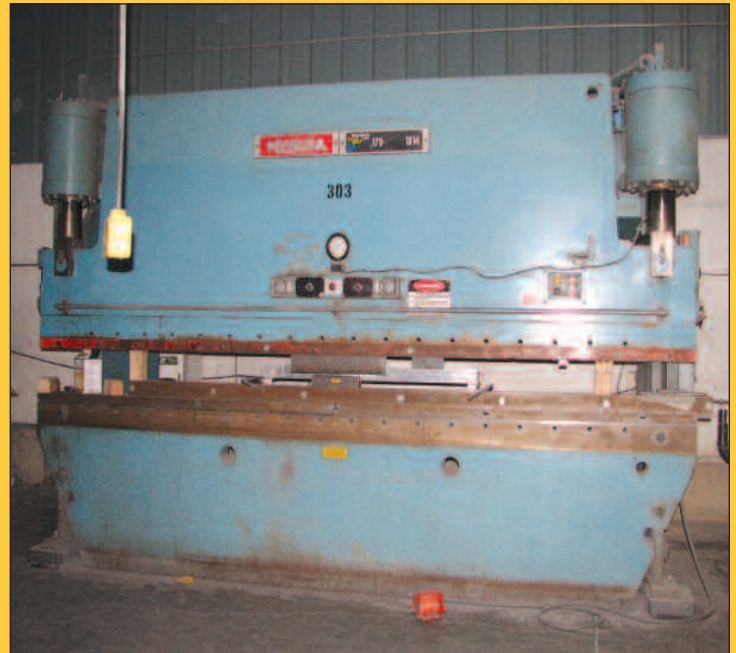
NIAGARA 175-TON PRESS BRAKE, MDL. HBM 17512