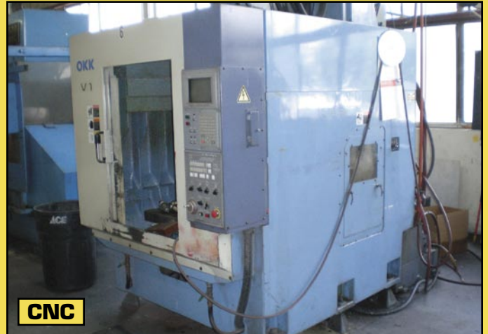
OKK CNC Machining Center, Mdl. VI