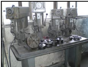
Clausing Drill Press