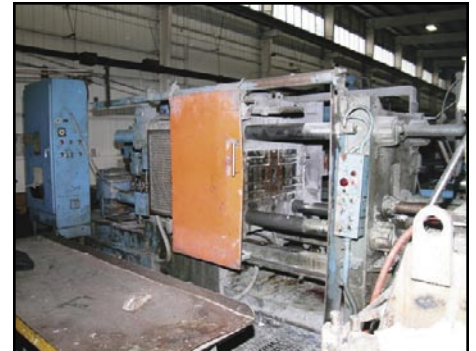
Harvill 650 Ton Machine, With Allen-Bradley Controls

HPM D-600-A (600 Ton) Cold Chamber Aluminum Die Cast Machine, Equipped With Allen-Bradley Controls, Electric Motorized Die Height Adjustment, Air Safety Ratchet Device, Bumper Plate Ejection System, 2 Core Circuits, Two Shot Positions (Center & -9"), Specifications: 46" Platens (Width & Height), 28" of Tie Bar Clearance, 18" of Die Stroke, 12"-28" of Die Thickness, 22" Plunger Stroke