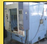
OKK CNC Machining Center, Mdl. VI