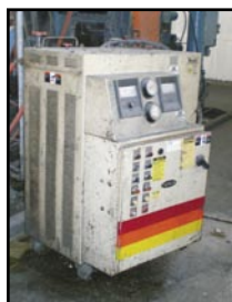
Sterlco Hot Oil Unit, Mdl. S60626-BX