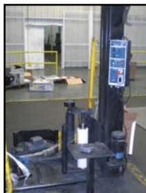
Lantech T Series Shrink Wrap