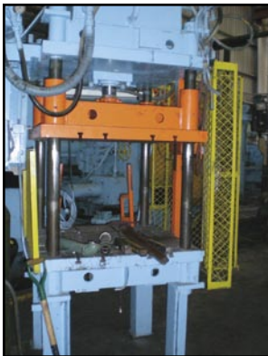
Trim Press 10 Ton