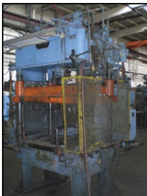
B&T Mdl. XLO Trim Press "Rapid Press" 30 Ton