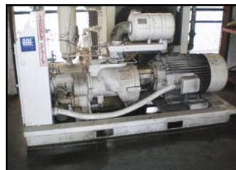
Gardner-Denver Air Compressor