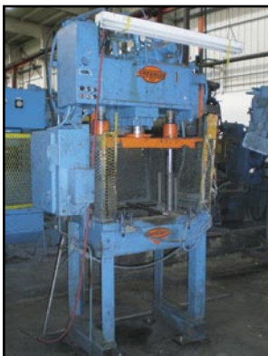
Greenlee 10 Ton, 18 x 24 Table