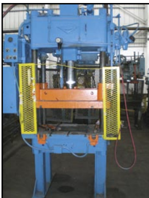
B&T Trim Press "Rapid Press," 15 Ton