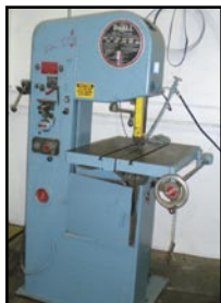
DoAll Vertical Band Saw, Mdl. 1611-H