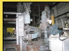
Ube 880G, With Factory Automation

COMPLETE ALUMINUM DIE CAST FACILITY WITH CNC MACHINING, MACHINE TOOLS, TRIM PRESSES, FURNACES, INSPECTION, ROLLING STOCK & MUCH MORE