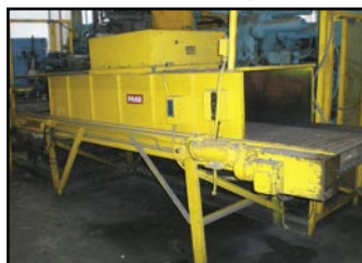
Prab Steel Belt Conveyor