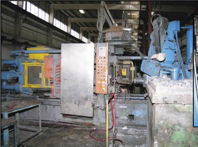
(1 OF 4) Ube 350G Machines, With Uni-FF Shot, Ube Auto-Ladle and Rimrock Sprayer