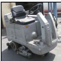
Advance Floor Sweeper, Mdl. HR2800