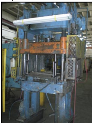
Greenlee 10-50 Ton Trim Press