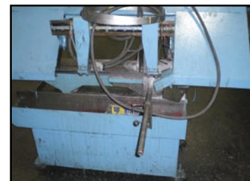
Horizontal Band Saw

FOR LEASE & FINANCE SERVICES - BIDITUP CAPITAL CORPORATION