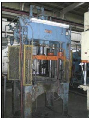
Kard Trim Press, 50 Ton