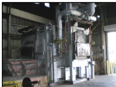
Shafer Aluminum Melt Furnace