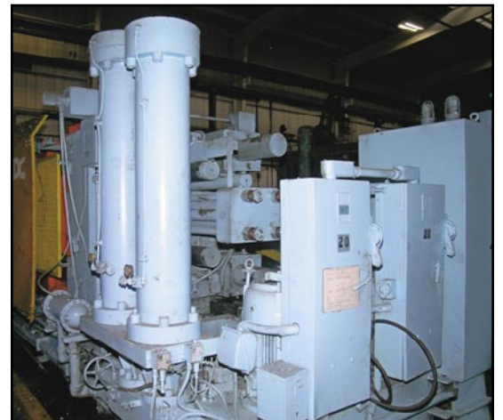
Harvill 1,000 Ton

Harvill 657 (650 Ton) Cold Chamber Aluminum Die Cast Machine , Equipped With Allen-Bradley PLC Controls, Electric Motorized Die Height Adjustment, Air Safety Ratchet Device, Hydraulic Bumper Plate Ejection System, 2 Core Circuits, Two Shot Positions (Center & -9"), Rimrock MDL. 305 Auto-Ladle and Rimrock 410 Sprayer With Rimrock Triangle Controls. Specifications: 51" Platens (Width & Height), 30" of Tie Bar Clearance, 18" of Die Stroke, 10"-36" of Die Thickness, 24" Plunger Stroke