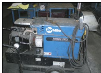
Miller Trailblazer AC/DC Gas Welder, Mdl. 250G