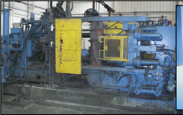
Ube 550 Ton Die Cast Machine