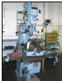
Lagun Vertical Mill, Mdl. FTV-2S