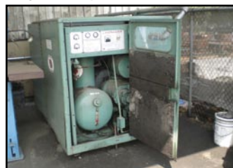
Gardner-Denver Electra Screw