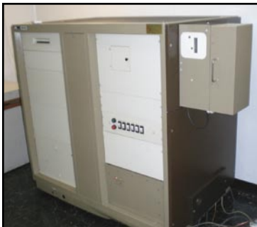
ARL Spectrometer, Mdl. 3560