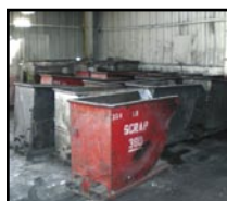
Roura Dump Hoppers