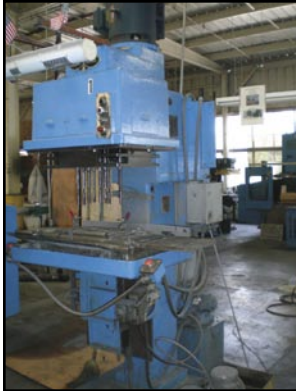
Deka High Speed Drill, Mdl. HRG-1222-28