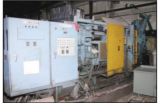
Ube 350G, With Uni-FF Shot End