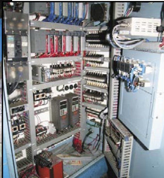
Ube 350G Control Panel, With Factory Installed Allen-Bradley SLC 5 Series Control