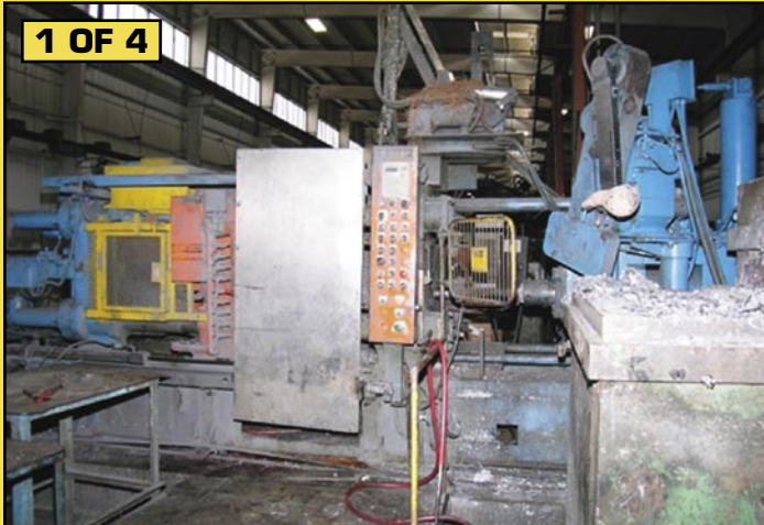
Ube 350G Machines, With Uni-FF Shot, Ube Auto-Ladle and Rimrock Sprayer