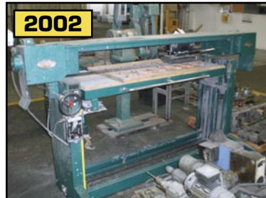
2002 Grizzly Stroke Sander, Mdl. 25394