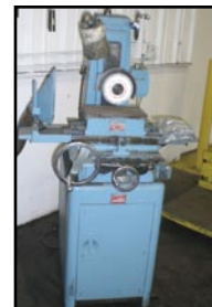
Boyar Schultz Surface Grinder, Mdl. 612