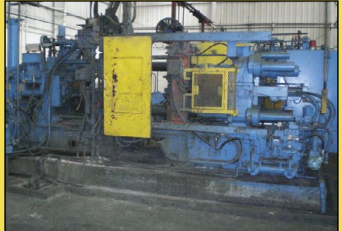
Ube 550 Ton Die Cast Machine