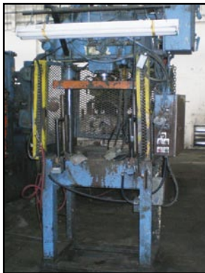
10 Ton Trim Press