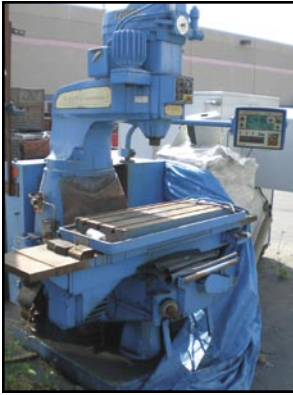
Bridgeport Vertical CNC Mill Series II