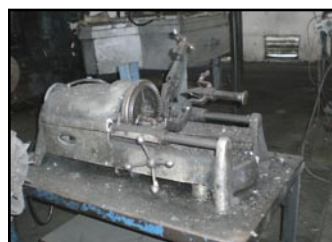
Ridgid 535 Pipe Bender