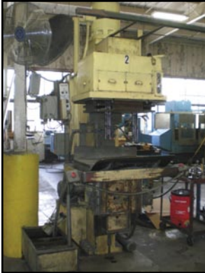
Deka High Speed Drill, Mdl. HRG-1222-28