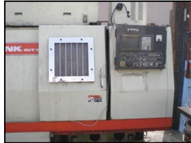
SNK CNC Lathe, Mdl. SUT-6