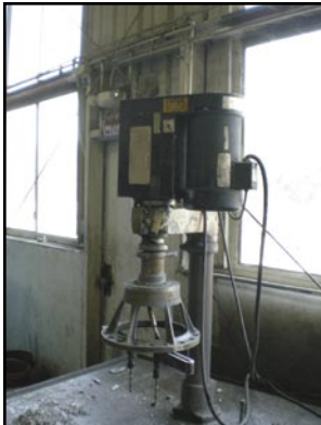
Dumore Series 28 Automatic Drill and Tap