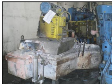
800 Lb. Stationary Holding Furnace