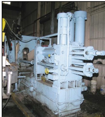
Harvill 1,000 Ton Shot End

Harvill 1057 (1,100 Ton) Cold Chamber Aluminum Die Cast Machine , Equipped With Allen-Bradley PLC Controls, Electric Motorized Die Height Adjustment, Air Safety Ratchet Device, Hydraulic Bumper Plate Ejection System, 2 Core Circuits, Two Shot Positions (Center & -12"), Rimrock MDL. 305 Auto-Ladle and Rimrock 410 Sprayer. Specifications: 71" Platens (Width & Height), 42" of Tie Bar Clearance, 24" of Die Stroke, 18"-50" of Die Thickness, 40" Plunger Stroke