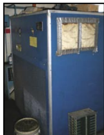
Zurn Air Dryer, Mdl. R-75A