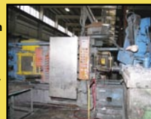
> (1 OF 4) Ube 350G Machines, With Uni-FF Shot, Ube Auto-Ladle and Rimrock Sprayer