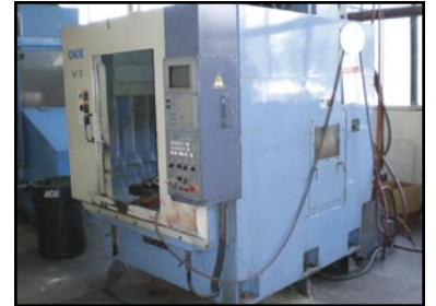
OKK CNC Machining Center, Mdl. VI