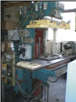
Zagar Openside Multi Head Tapping Machine