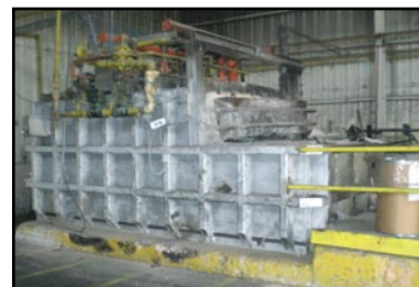
Goldcoast Aluminum Melt Furnace, With After Burner