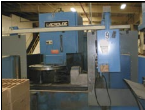
Acroloc High Speed Machining Center

OKK CNC Machining Center MDL. VI , Mach No.109, Mitsubishi Controls, S/N MA98241