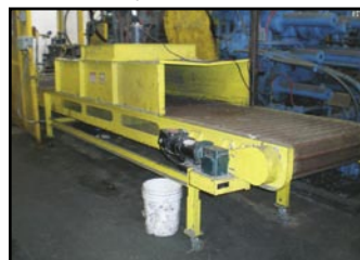
Erect-Veyor Steel Belt Conveyor