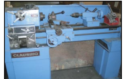
Clausing Lathe, Mdl. 1300