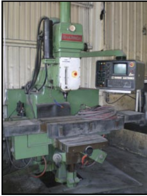
Sharnoa CNC Mill