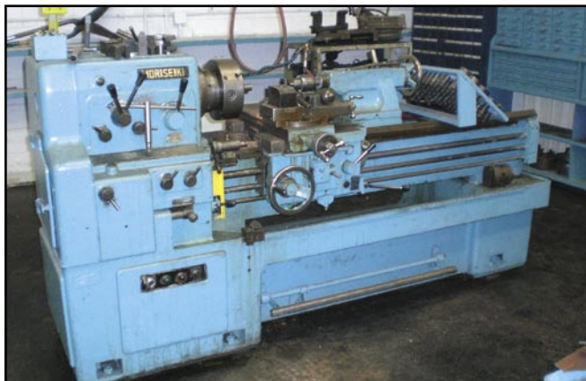
Mori Seiki Engine Lathe, Mdl. MS-1250G