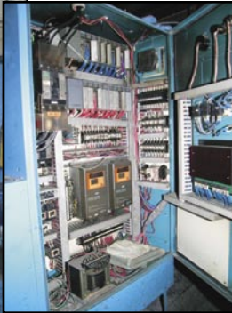
Ube 550G, With Allen-Bradley Controls