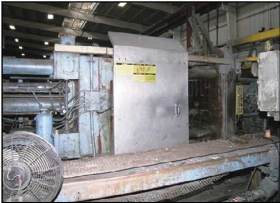
Harvill 850 Ton Machine