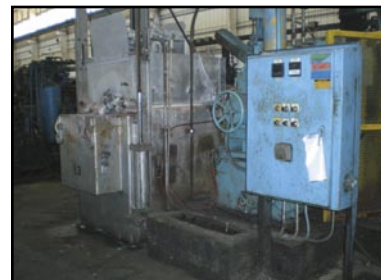
Lindberg/MPH Aluminum Melt Furnace