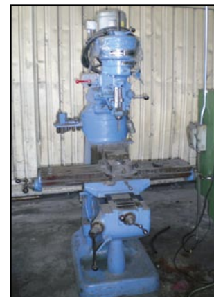
Bridgeport Vertical Milling Machine