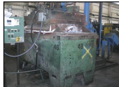
3500 Lb. Stationary Holding Furnace

Can't make it to the auction in person? Bid live online at