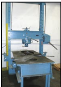
Dake Manual Hydraulic Press