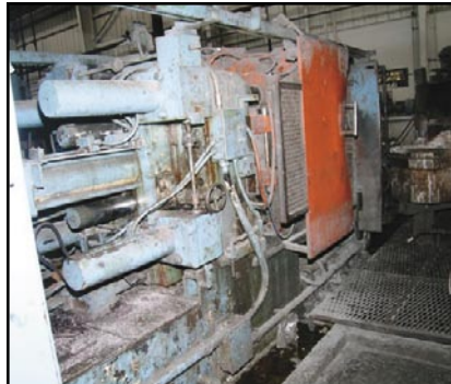
Harvill 600 Ton Machine