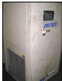
Deltech "Pyramid 2000" Air Dryer