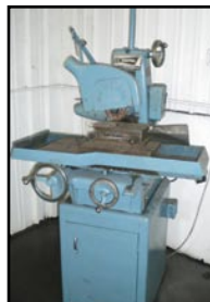
Dedtru Surface Grinder