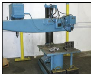
Cincinnati Bickford Radial Arm Drill