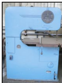
DoAll V-36 Vertical Band Saw