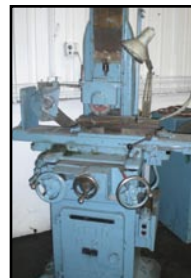
Reid Surface Grinder, Mdl. 2B