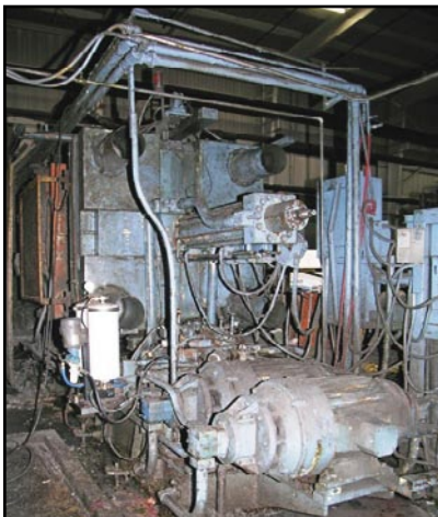
B&T 1,200 Ton