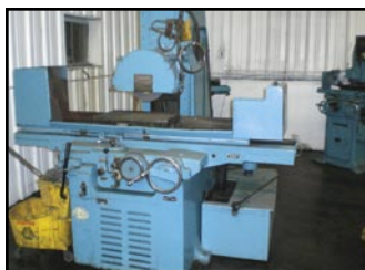
Gardner Surface Grinder, Mdl. 1230

Dake Manual Hydraulic Press , 3" x 6" table