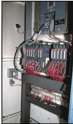
Harvill Control Panel, With Allen-Bradley PLC Controls