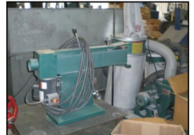
Grizzly Edge Sander, Mdl. G1531

LEASE/FINANCING AVAILABLE DIRECT FROM BIDITUP Capital Corporation