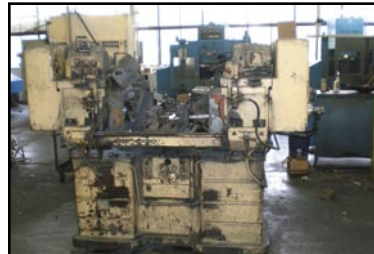
Excello 2-Spindle Horizontal Drill