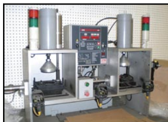
Ateq Pressure Test, Mdl. F2P