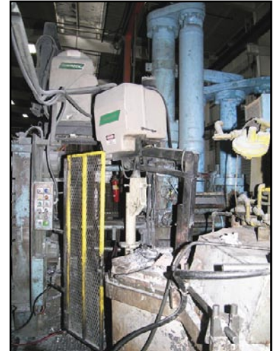
Harvill 650, With Rimrock 305 Ladle and 410 Sprayer