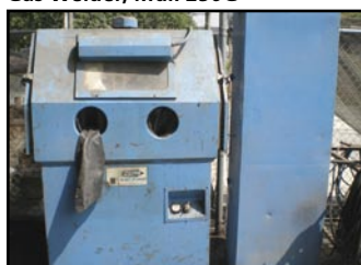
Zero "Blast-N-Peen" Mdl. BNP 55G