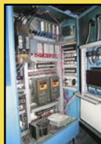
< Ube 550G, With Allen-Bradley Controls