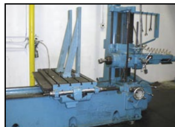
Giddings & Lewis Horizontal Boring Mill, Mdl. 25