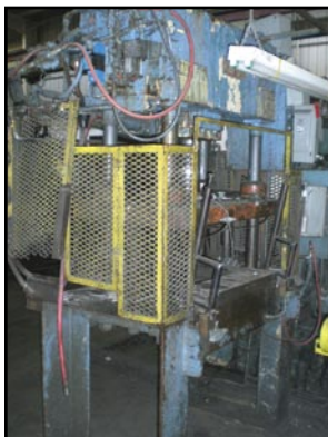
Kard Trim Press, 30 Ton