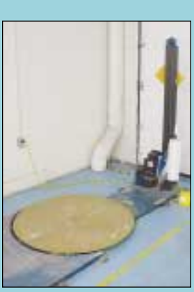
Vestil Rotary Pallet Stretch Wrap Machine