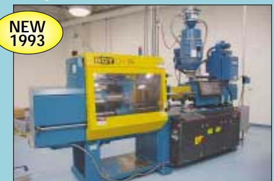
88 Ton X 6.3 Oz. Boy Model 80M Horizontal Hydraulic Clamp Injection <u>Molding Machine</u>