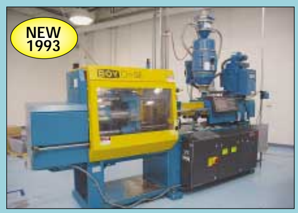
88 Ton X 6.3 Oz. Boy Model 80M Horizontal Hydraulic Clamp Injection Molding Machine