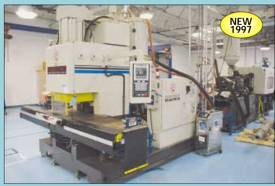
150 Ton X 17 Oz. Cincinnati Model CH-150 Vertical Hydraulic C-Frame Clamp Shuttle Table Plastic Injection Molding Machine

70 Ton X 4.44 Oz. Cincinnati Model CH-70-S Vertical Hydraulic C-Frame Clamp Shuttle Table Plastic Injection Molding Machine; S/N 3956A01/97-5, Camac VSX Control, 10" X 16" Upper Platen Size, Missing Control Keypad/Display (New 1997)