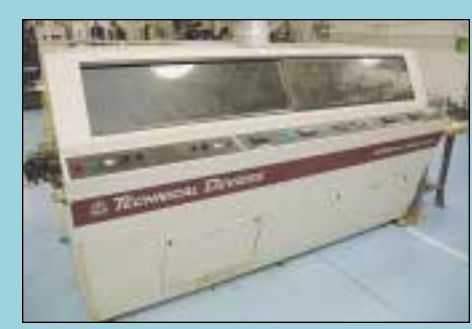
Nu/Era Wave Soldering Machine