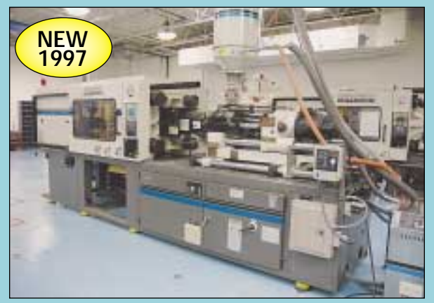
165 Ton X 11 Oz. Cincinnati Model VT-165-11 Horizontal Toggle Clamp Injection Molding Machine