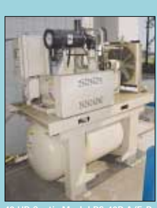
40 HP Curtis Model RS-40B A/E-B 160 Air Cooled Rotary Screw Horizontal Tank Mounted Air Compressor