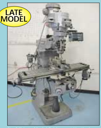
(1 of 3) Late Model Bridgeport Vertical Milling Machines