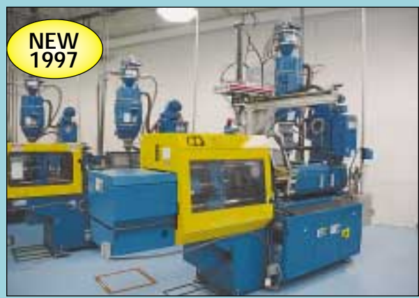
55 Ton X 3 Oz. Boy Model 50M Pro-Cann Horizontal Hydraulic Clamp Injection Molding Machine