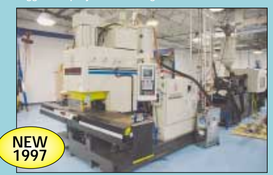
50 Ton X 17 Oz. Cincinnati Model CH-150 Vertical ydraulic C-Frame Clamp Shuttle Table Plastic Injection olding Machine