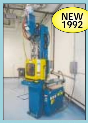
22 Ton X .63 Oz. Boy Model 22S-VV Vertical Hydraulic Clamp Injection Molding Machine