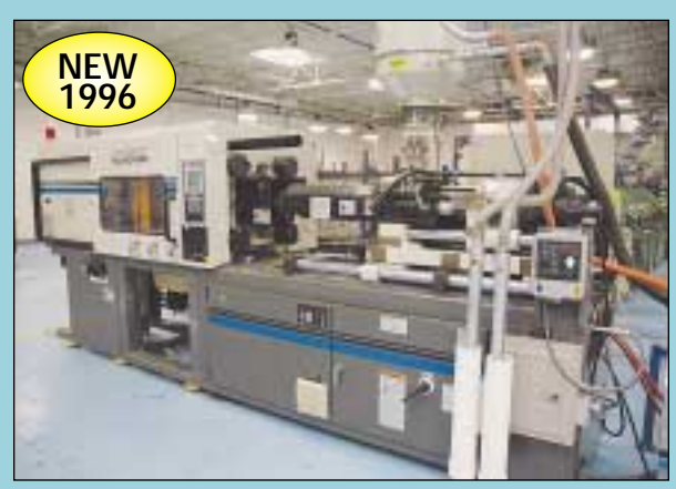
220 Ton X 17 Oz. Cincinnati Model VT-220-17 Horizontal Toggle Clamp Injection Molding Machine