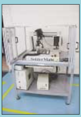
Soldermate Robot Soldering System