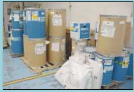
Partial View Surplus Plastic Resin

Hand & Power Tools Including: Drill Doctor Sharpener, Circular Saw, Angle Grinders, Drills, Sanders, Pneumatic Tools, Wrenches, Clamps, Snips Oxy Torch Set, Ultrasonic Cleaner