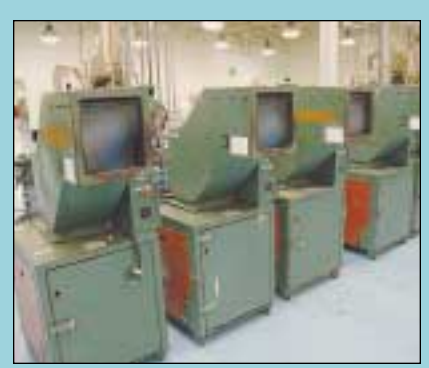
(5) 8" X 10" Granutec Model TFG810-5 Plastic Granulators