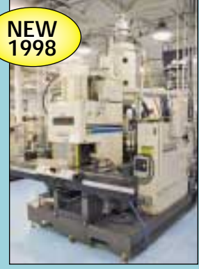
70 Ton X 4.44 Oz. Cincinnati Model CH-70-S Vertical

Surplus Plastic Resin Consisting of; 575 LB Resin Lexan Acrylic Clear, 660 LB Resin Nylon Gray, 423 LB Resin Poly Pro Teal, 373 LB Nylon Concentrate Very Dark Pewter, 677 LB Nylon Concentrate Medium Gray, 249 LB Poly Pro Concentrate Black, 388 LB Nylon Concentrate Light Neutral, 85 LB Nylon Concentrate Medium Dark Neutral, 400 LB Řesin Polyester 15% Glass Natural, 966 LB Nylon Concentrate Very Dark Gray, 200 LB Resin Nylon Very Dark Gray, 150 LB Nylon Concentrate Ebony, 33 LB Nylon Concentrate Black, 165 LB Polyester 20% Glass Black, 110 LB Polyester 20% Glass Natural in 50 LB Sealed Bags & Other Related