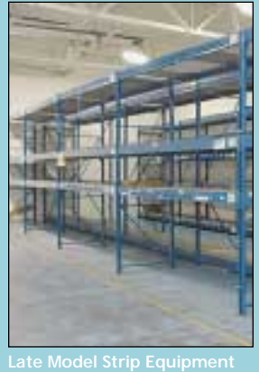
Late Model Strip Equipment Consisting of (50) Sections of Pallet Rack