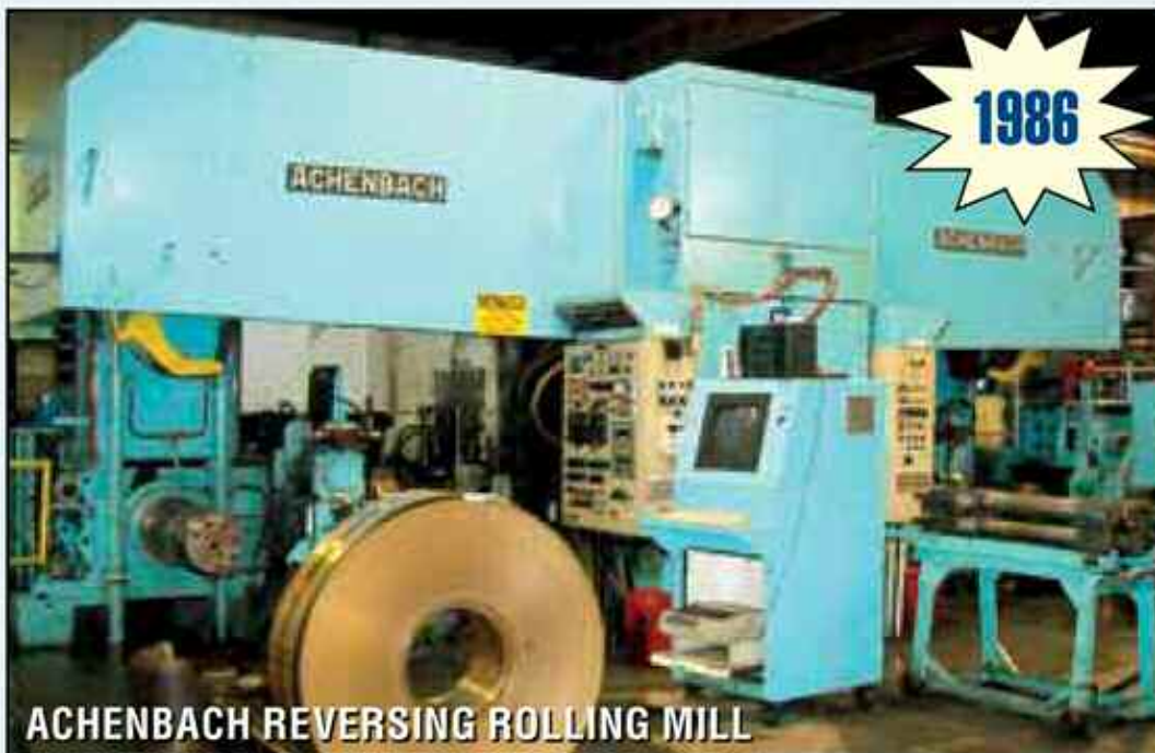
ACHENBACH REVERSING ROLLING MILL