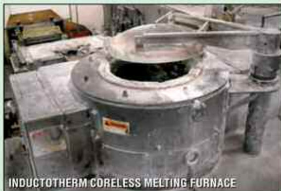
INDUCTOTHERM CORELESS MELTING FURNACE