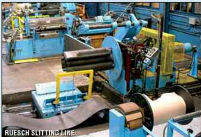
RUESCH SLITTING LINE