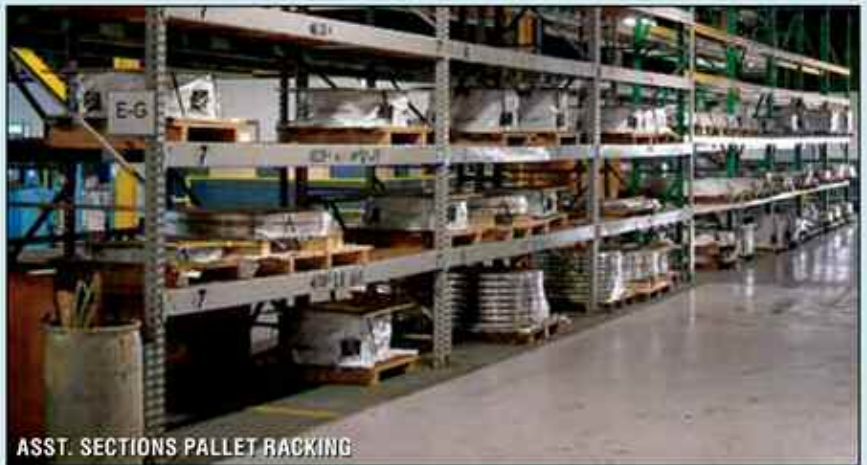
ASST. SECTIONS PALLET RACKING