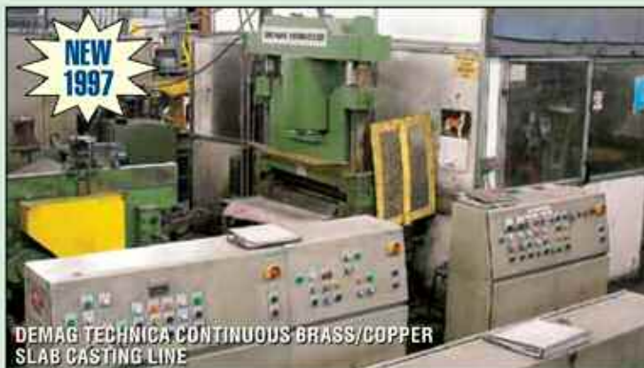
DEMAG TECHNICA CONTINUOUS BRASS/COPPER SLAB CASTING LINE