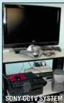
SONY CCTV SYSTEM