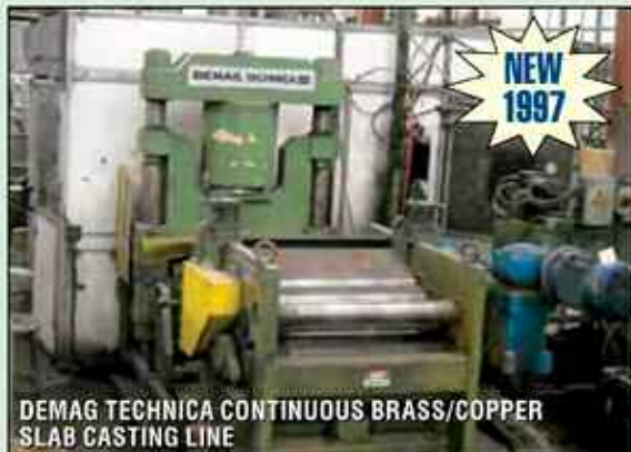
DEMAG TECHNICA CONTINUOUS BRASS/COPPER SLAB CASTING LINE