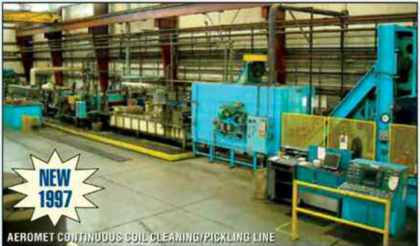
AEROMET CONTINUOUS COIL CLEANING/PICKLING LINE

(1986) ACHENBACH COIL CLEANING LINE - 300 FPM, 30", 15,000 LB. CAP., HYDRAULIC SHEAR & STRAIGHTENING PRESS, OSCILLATING BRUSH UNITS, POLY DIP TANKS, WISCONSIN GAS DRYER, IN FLOOR COIL HANDLING SYSTEM