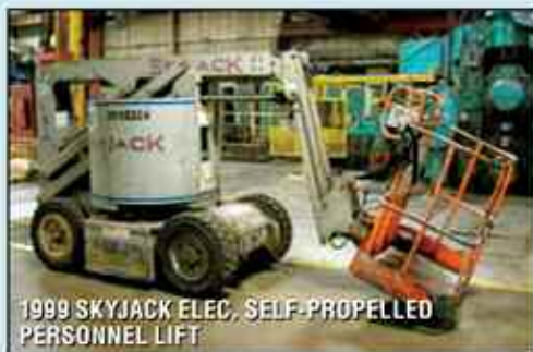
1999 SKYJACK ELEC. SELF-PROPELLED PERSONNEL LIFT