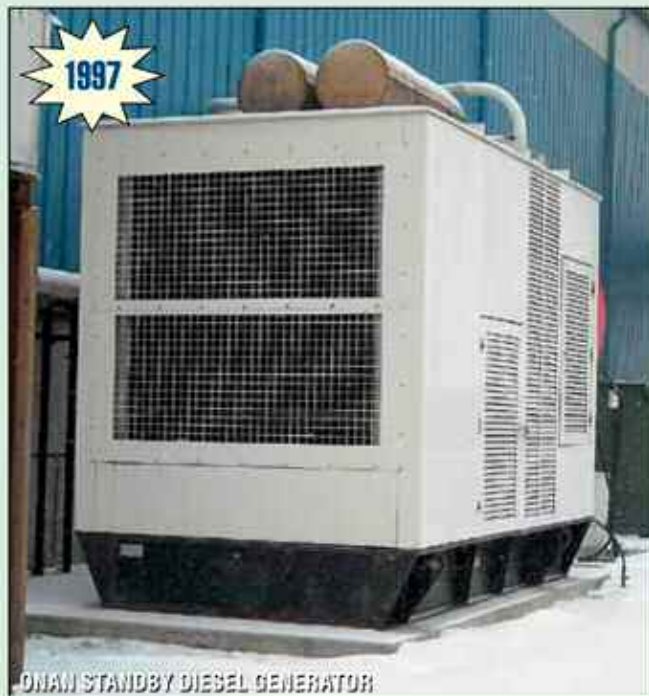
ONAN STANDBY DIESEL GENERATOR