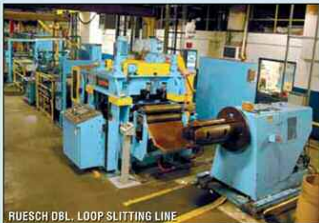
RUESCH DBL. LOOP SLITTING LINE

YODER LOOP "BULL" SLITTING LINE - 1,000 FPM, 24", 15,000 LB. CAP., 75 HP, UNCOILER, SCRAP WINDER, REWINDER, EQUIPMENT TURNSTILE, CONTROLS