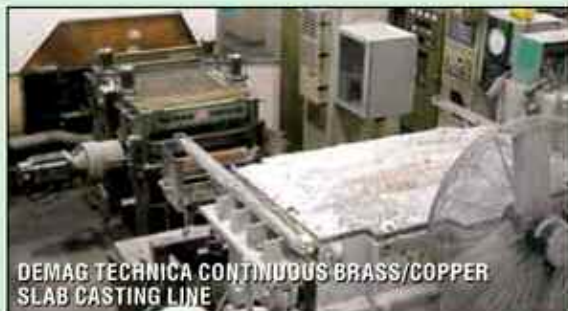
DEMAG TECHNICA CONTINUOUS BRASS/COPPER SLAB CASTING LINE

(2) CARRIER FCS-31/70420 RAIL MTD. VIBRATORY CHARGING HOPPERS 4' X 8' X 30"