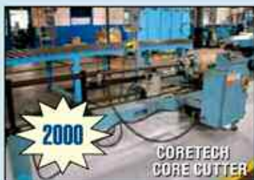
CORETECH CORE CUTTER

(1985) CONTROL COOLING SYSTEM FOR ALL FURNACES AND COVERS W/(2) EVAPCO LST-5-91 COOLING TOWERS - APPROX. 200 TON CAP., 10' X 6' X 10'H; (3) BLOWERS; (2) COOLING TOWERS - APPROX. 75 TON CAP. STEEL HOUSING ON STEEL LEGS (2) CHILL TANKS - APPROX. 1,000 GAL. CAP. AND PUMPS