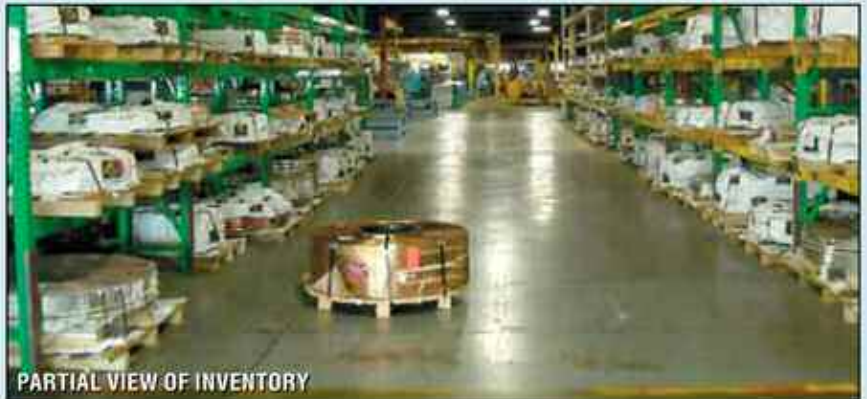
PARTIAL VIEW OF INVENTORY