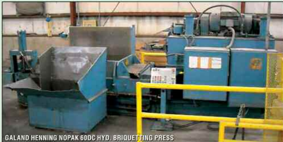
GALLAND HENNING NOPAK 60DC HYD. BRIQUETTING PRESS

(1980) GALLAND HENNING NOPAK 60DC HYDRAULIC BRIQUETTING PRESS - 14' X 14' X VARIABLE BALE SIZE