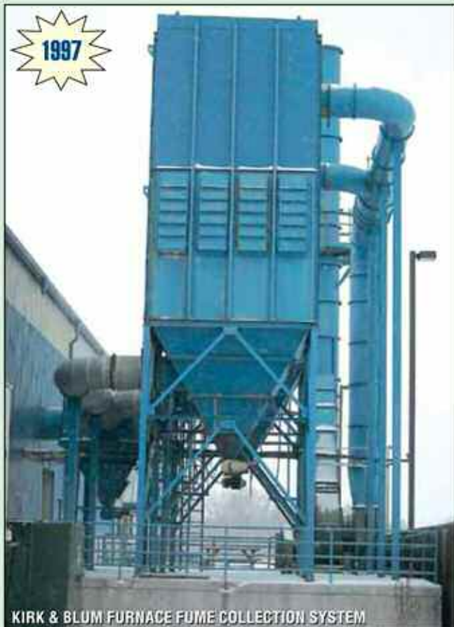
KIRK & BLUM FURNACE FUME COLLECTION SYSTEM