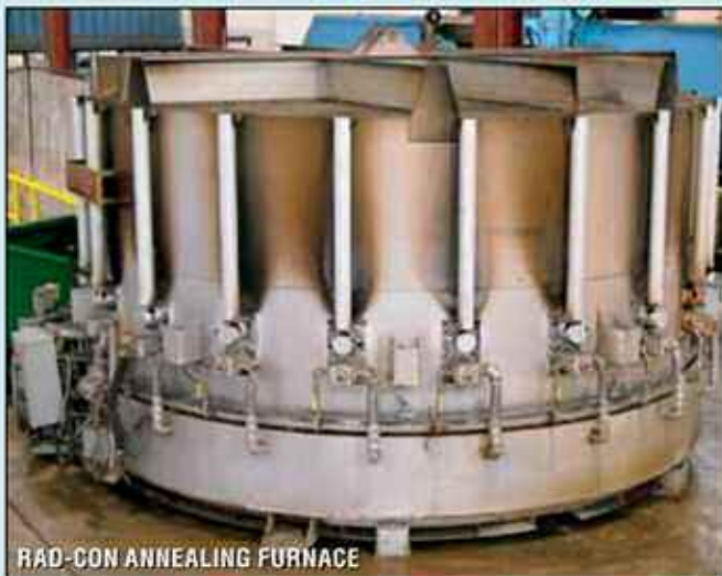
RAD-CON ANNEALING FURNACE

(1986) ANNEALING FURNACE W/GAS FIRED BELL FURNACE - 1,400°F, 132" DIA. X 66"H W/(3) COVERS; (3) BASES; PROGRAMMABLE TEMPERATURE CONTROLS