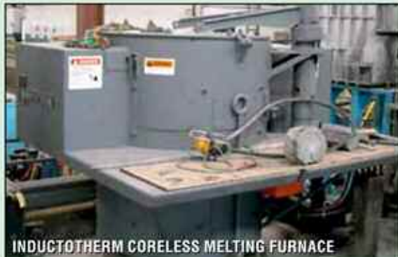
INDUCTOTHERM CORELESS MELTING FURNACE