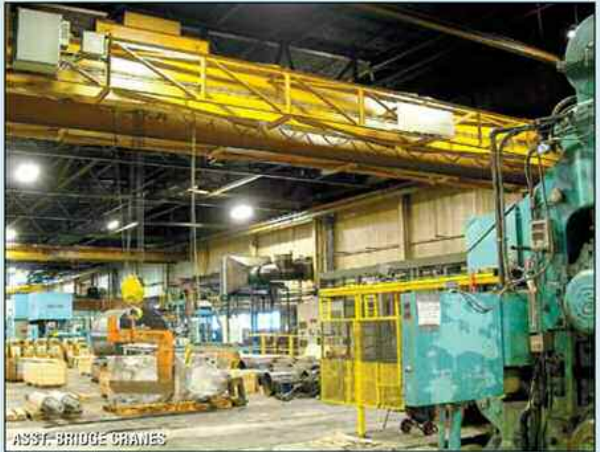
ASST. BRIDGE CRANES