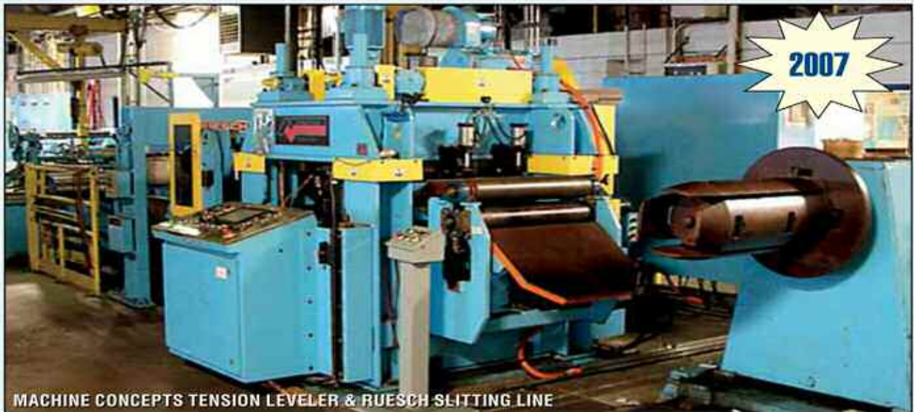
MACHINE CONCEPTS TENSION LEVELER & RUESCH SLITTING LINE