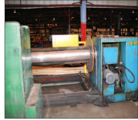
60" X 10,000 LBS. AMERICAN STEEL LINE UNCOILER

60" X 10,000 LBS. AMERICAN STEEL LINE UNCOILER HYDRAULIC EXPANSION