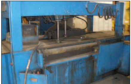
36" TRENNJAEGER COLD SAW