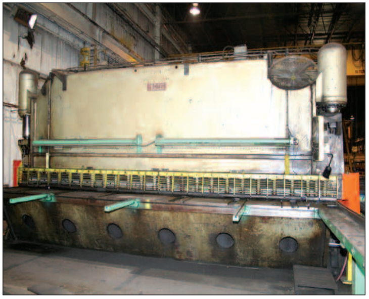
22' X 3/4" PACIFIC HYDRAULIC SHEAR