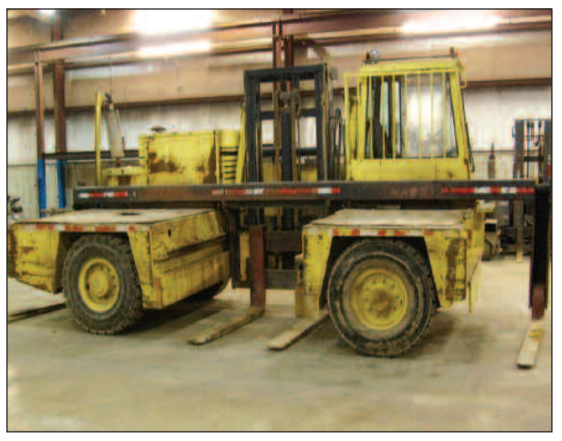
8000 LBS BAUMAN DIESEL SIDE LOADER