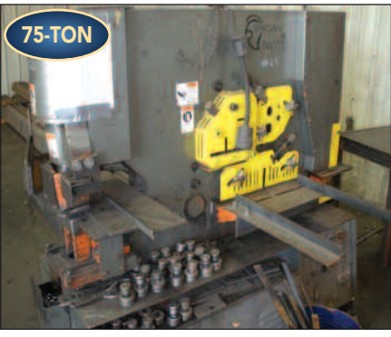
SPARTAN IW77D 75 TON HYDRAULIC IRON WORKER

The North Carolina Items will be sold via webcast from Turlock, CA. If you do not have internet capabilities, please call our office at 818.508.7034 to make arrangements