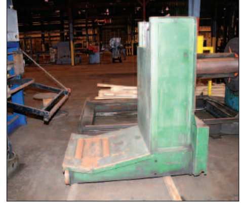
REVELATOR COIL CAR

Register at www.BIDITUP.com and receive auction updates via email