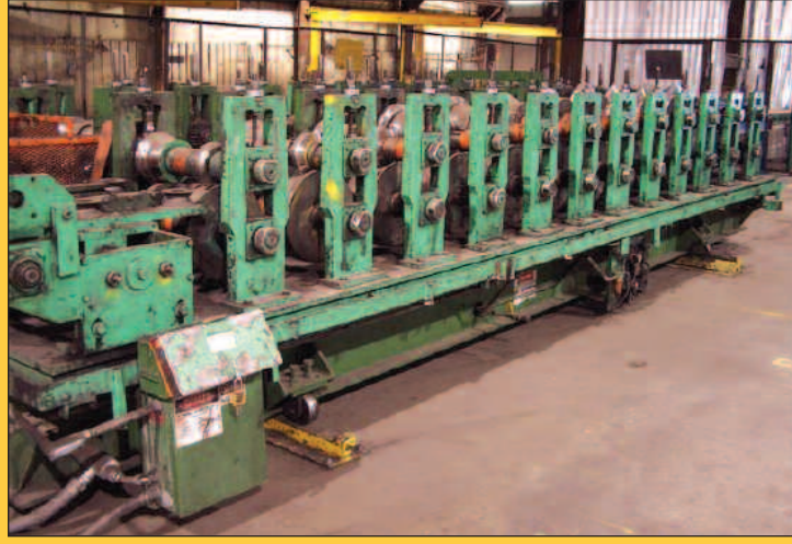
BRADBURY 12 STAND DBL. WIDE SIDE BY SIDE C/Z COMBINATION PURLIN FORMING LINE, .156 GAUGE