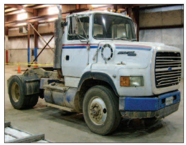
FORD SINGLE AXLE SEMI TRUCK

The North Carolina Items will be sold via webcast from Turlock, CA. If you do not have internet capabilities, please call our office at 818.508.7034 to make arrangements