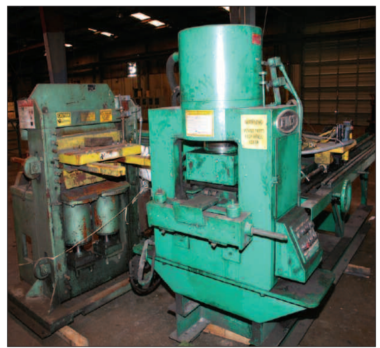
75 TON X 12" FRANKLIN DUPLICATOR PUNCH UNIT