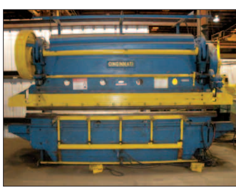
50 TON X 12' CINCINNATI MECHANICAL BRAKE