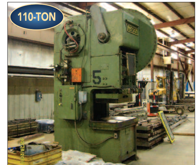
110 TON VERSON GAP FRAME OPEN BACK PRESS

(26) MILLER POWER SUPPLIES, MDL. MD4 MICRO BUTT WELDER BAND SAW, DRILL PRESS, (2) RADIAL ARM DRILLS, (5) BENCH GRINDERS, SMALL IRON WORKER, CINCINNATI MILL, 2' BETTON BENDER SHEAR