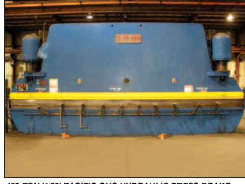
400 TON X 22' PACIFIC CNC HYDRAULIC PRESS BRAKE

VIEWS OF MANCO MFG. CO. FABRILINE, MDL. 3454786, 5-HEAD HYDRAULIC BEAM PUNCH