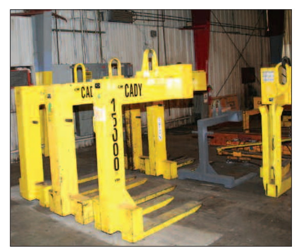
MISC C HOOKS AND PLATE LIFTERS