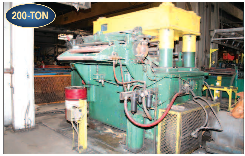
200 TON ALPHA 4 POST HIGH SPEED RIB PRESS

The North Carolina Items will be sold via webcast from Turlock, CA. If you do not have internet capabilities, please call our office at 818.508.7034 to make arrangements