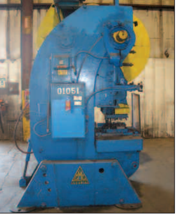
100 TON FRANKLIN PUNCH, MDL. F5100X6-2 75 TON X 4" CMC CLEARING OBI PRESS