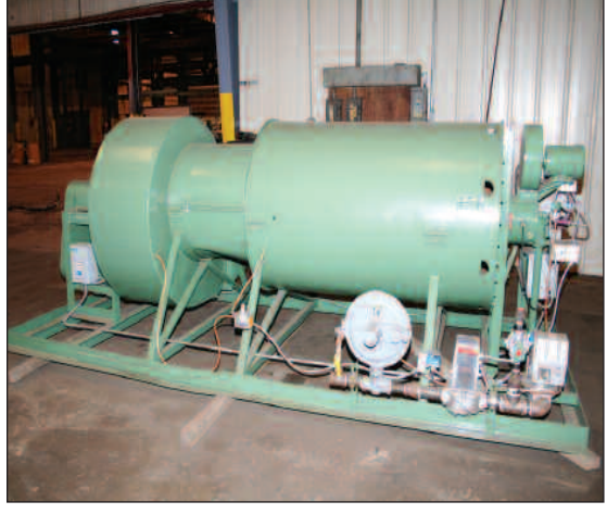
MAXIM BURNER PACK 3,000,000 BTU

The North Carolina Items will be sold via webcast from Turlock, CA. If you do not have internet capabilities, please call our office at 818.508.7034 to make arrangements