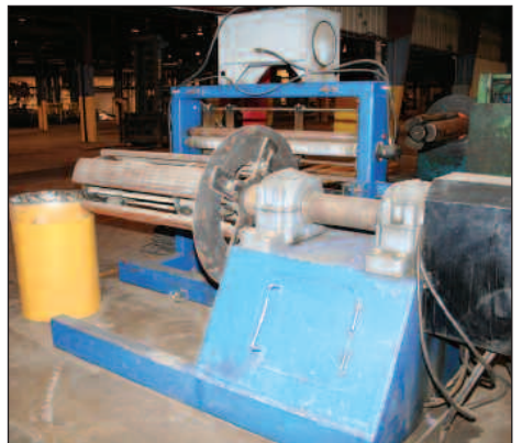
48" YODER UNCOILER CONVERTED TO RECOILER