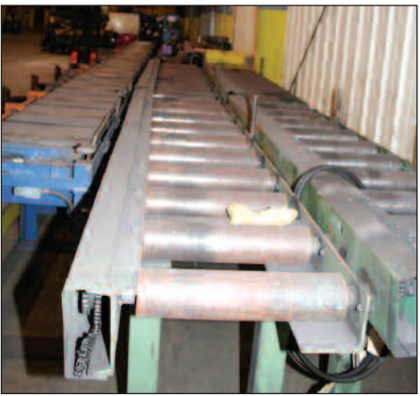
400/177 TON PEDDINGHOUSE PLATE FABRICATOR

The North Carolina Items will be sold via webcast from Turlock, CA. If you do not have internet capabilities, please call our office at 818.508.7034 to make arrangements