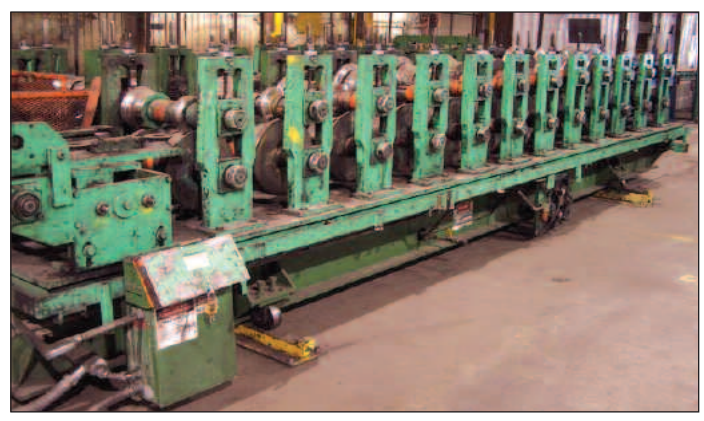
BRADBURY 12 STAND ROLLFORMER

The North Carolina Items will be sold via webcast from Turlock, CA. If you do not have internet capabilities, please call our office at 818.508.7034 to make arrangements