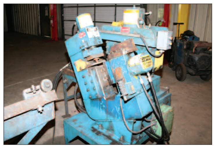
8-1/2" FRANKLIN PURLIN PUNCH & SHEAR LINE PUNCH SHEAR

TO SCHEDULE AN AUCTION OR APPRAISAL, CALL 818.508.7034