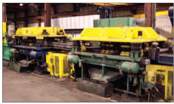
ASC PURLIN PRESS AND CUTOFF

BRADBURY 12 STAND DOUBLE WIDE SIDE BY SIDE C/Z COMBINATION PURLIN FORMING LINE, 8"-11 ½" "Z" AND 6"-11" "C" CAPACITY, .156 GAUGE, CONSISTING OF: Bradbury Uncoiler Mdl. Sb-20, 48" Wide, S/N 16636 • ASC 24" L.H. Straightener Feeder • ASC Special 120 Ton Purlin Press • ASC 80 Ton Mechanical Press • Bradbury 12 Stand Double Sided Roll Former, 3" Diameter Shafts, Adjustment 6-14, 24" Wide