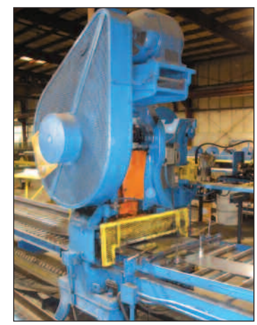
NIAGARA, MDL. A3PL