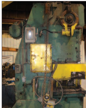
VERSON PRESS, MDL. 75