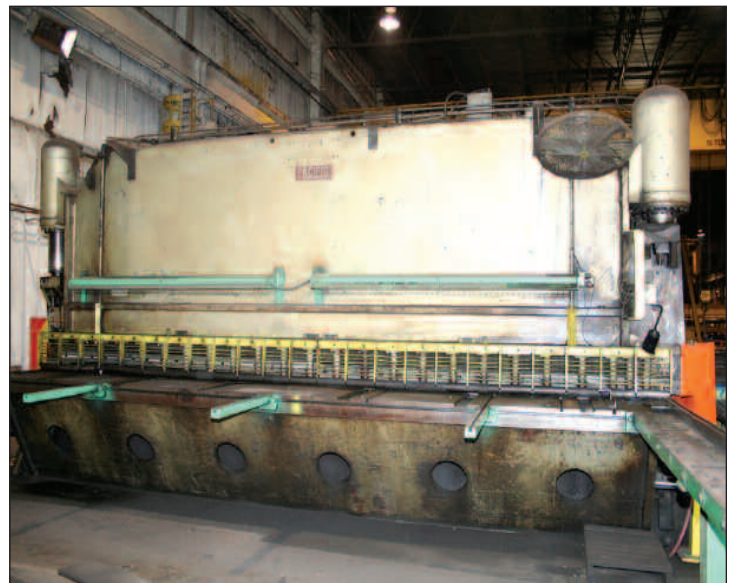
22' X 3/4" PACIFIC HYDRAULIC SHEAR