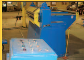
ARBOR PROGRESSIVE MACHINERY #548, SLITTING LINE

For more information, visit www.BIDITUP.com