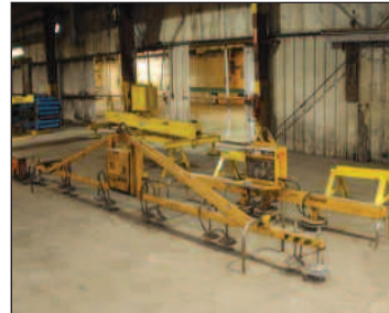
MISC. SPREADER BARS AND SHEET LIFTERS