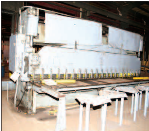
20' X 3/4" CINCINNATI HYD. POWER SQUARING SHEAR

The North Carolina Items will be sold via webcast from Turlock, CA. If you do not have internet capabilities, please call our office at 818.508.7034 to make arrangements