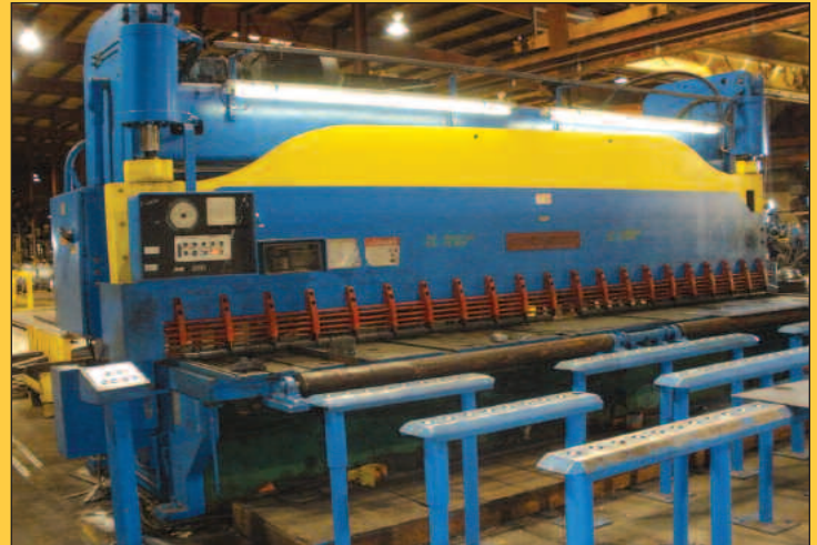
22' X 3/4" CINCINNATI HYDRAULIC SHEAR