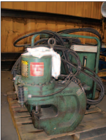
100 TON FRANKLIN PUNCH, MDL. F5100X6-2