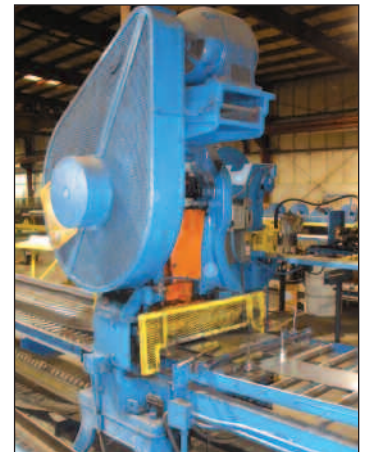
NIAGARA, MDL. A3PL