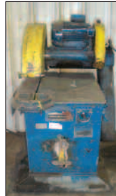
TRENNJAEGER CUT OFF SAW