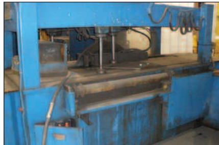
36" TRENNJAEGER COLD SAW