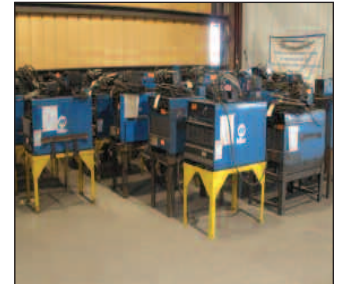
(24) MILLER LINCOLN WELDERS