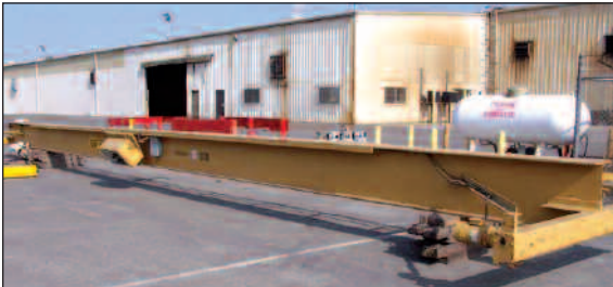
3 TON X 60' GAFFNEY BRIDGE CRANE

MISC. SPREADER BARS AND SHEET LIFTERS • AUTOMEC CONTROL CNC 1000 CONTROL, Light Curtains • ROD OVEN • STRAIGHTENER • 10' HAND BRAKE • (2) TORIT 6 CARTRIDGE DUST COLLECTORS • POWER SUPPLIES AND NA5 CONTROLLERS • G & L BICKFORD CHIPMASTER RADIAL DRILL • BRIDGEPORT MILL • 6" X 18" COVEL SURFACE GRINDER • (2) 12 TON AND 50 TON H FRAME PRESSES • CUTTER MASTER TOOL SHARPENER • PURE INC PARTS WASHER • STEAM CLEANER