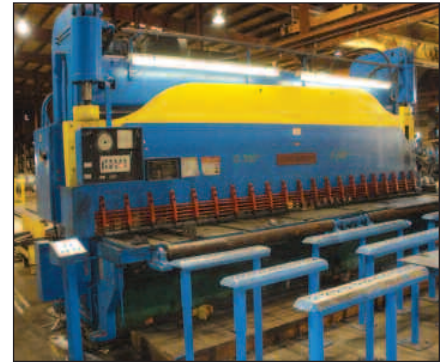
22' X 3/4" CINCINNATI HYDRAULIC SHEAR