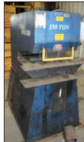
150 TON PRESS MASTER HYD. IRON WORKER