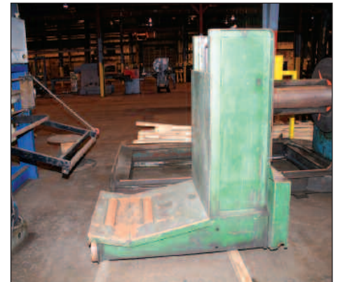
REVELATOR COIL CAR