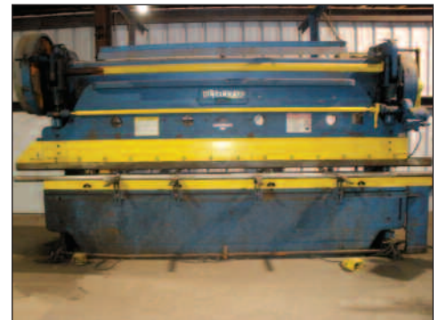
90 TON X 12' CINCINNATI MECHANICAL PRESS BRAKE