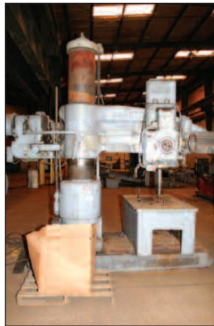
5' X 17" CARLTON RADIAL DRILL