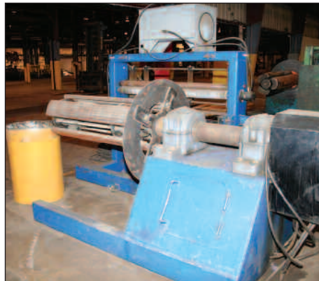
48" YODER UNCOILER CONVERTED TO RECOILER

48" YODER UNCOILER CONVERTED TO RECOILER w/Drive