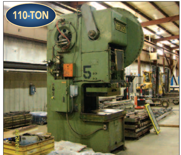
110 TON VERSON GAP FRAME OPEN BACK PRESS

The North Carolina Items will be sold via webcast from Turlock, CA. If you do not have internet capabilities, please call our office at 818.508.7034 to make arrangements