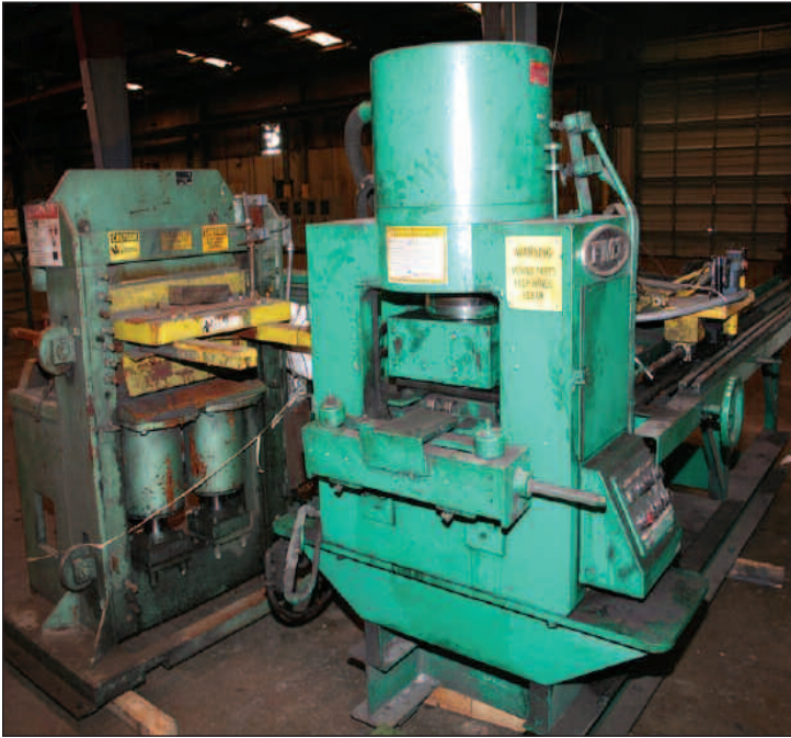
75 TON X 12" FRANKLIN DUPLICATOR PUNCH UNIT