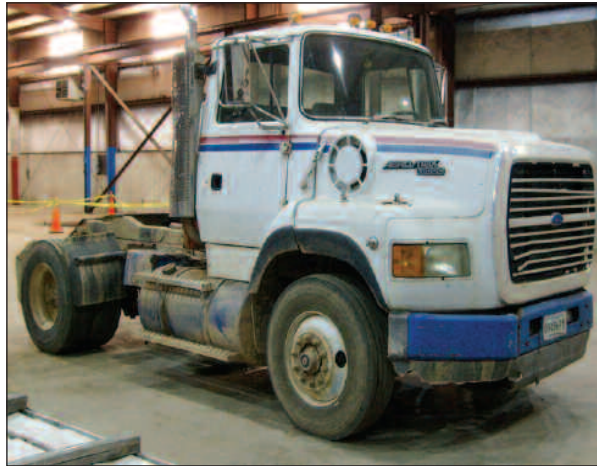
FORD SINGLE AXLE SEMI TRUCK

The North Carolina Items will be sold via webcast from Turlock, CA. If you do not have internet capabilities, please call our office at 818.508.7034 to make arrangements