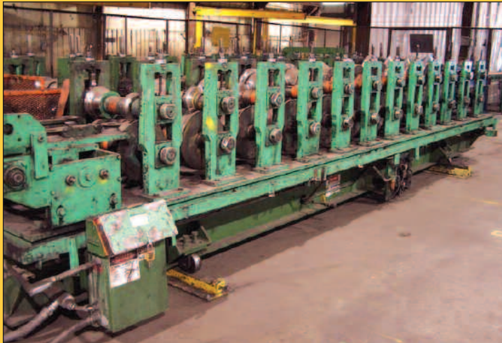
BRADBURY 12 STAND DBL. WIDE SIDE BY SIDE C/Z COMBINATION PURLIN FORMING LINE, .156 GAUGE