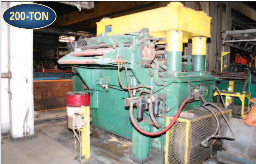
200 TON ALPHA 4 POST HIGH SPEED RIB PRESS