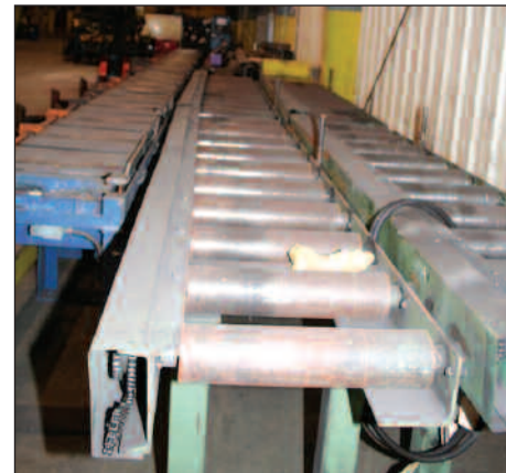
400/177 TON PEDDINGHOUSE PLATE FABRICATOR

The North Carolina Items will be sold via webcast from Turlock, CA. If you do not have internet capabilities, please call our office at 818.508.7034 to make arrangements