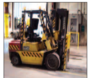
VIEW OF FORKLIFTS

The North Carolina Items will be sold via webcast from Turlock, CA. If you do not have internet capabilities, please call our office at 818.508.7034 to make arrangements