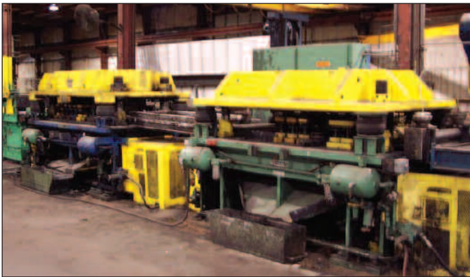
ASC PURLIN PRESS AND CUTOFF

BRADBURY 12 STAND DOUBLE WIDE SIDE BY SIDE C/Z COMBINATION PURLIN FORMING LINE, 8"-11 1/2" "Z" AND 6"-11" "C" CAPACITY, .156 GAUGE, CONSISTING OF: Bradbury Uncoiler Mdl. Sb-20, 48" Wide, S/N 16636 • ASC 24" L.H. Straightener Feeder • ASC Special 120 Ton Purlin Press • ASC 80 Ton Mechanical Press • Bradbury 12 Stand Double Sided Roll Former, 3" Diameter Shafts, Adjustment 6-14, 24" Wide