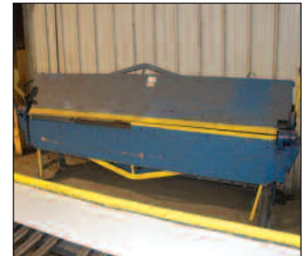
10' HAND BRAKE