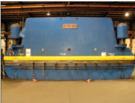
400 TON X 22' PACIFIC CNC HYDRAULIC PRESS BRAKE