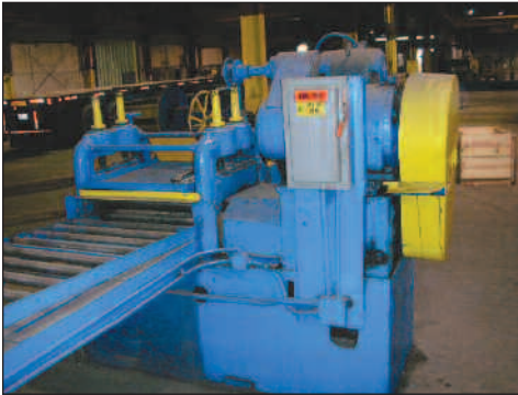
HEAVY GAGE STRAIGHTENER