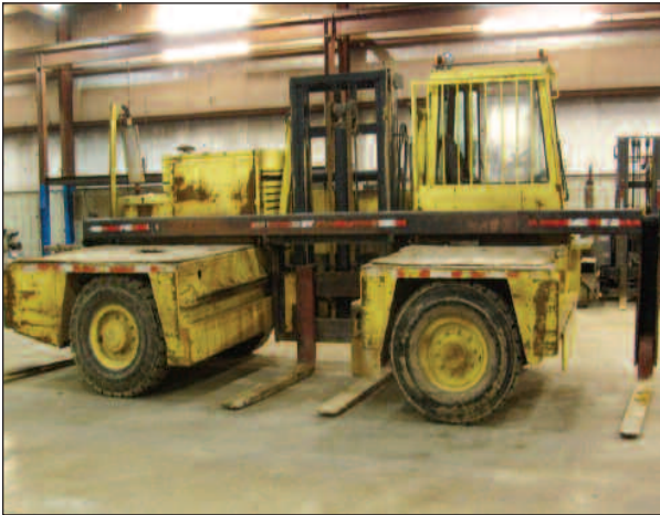
8000 LBS BAUMAN DIESEL SIDE LOADER