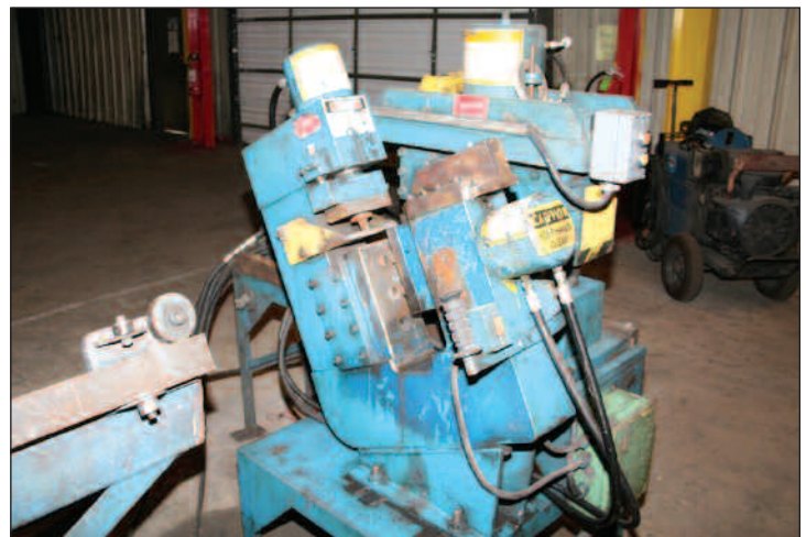
8-1/2" FRANKLIN PURLIN PUNCH & SHEAR LINE PUNCH SHEAR

BAND SAW, DRILL PRESS, (2) RADIAL ARM DRILLS, (5) BENCH GRINDERS, SMALL IRON WORKER, CINCINNATI MILL, 2' BETTON BENDER SHEAR