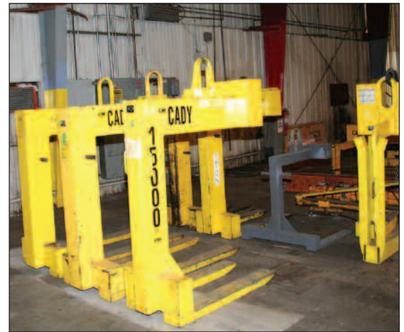
MISC C HOOKS AND PLATE LIFTERS