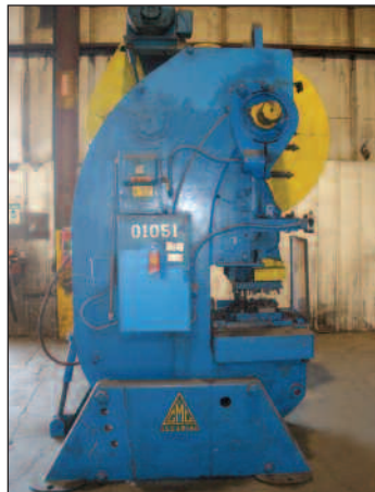
75 TON X 4" CMC CLEARING OBI PRESS