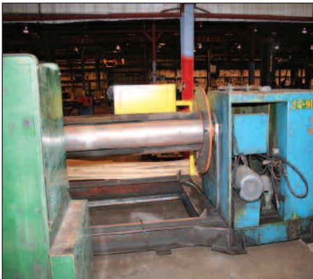
60" X 10,000 LBS. AMERICAN STEEL LINE UNCOILER

60" X 10,000 LBS. AMERICAN STEEL LINE UNCOILER HYDRAULIC EXPANSION