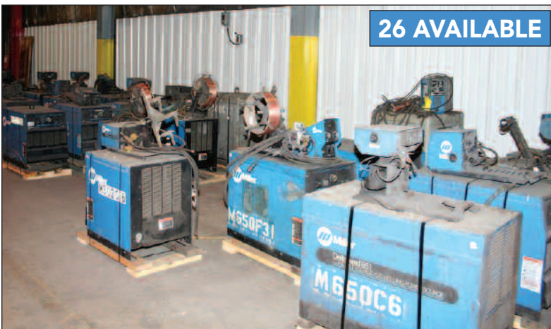
(26) MILLER POWER SUPPLIES