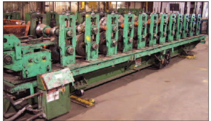
BRADBURY 12 STAND ROLLFORMER

The North Carolina Items will be sold via webcast from Turlock, CA. If you do not have internet capabilities, please call our office at 818.508.7034 to make arrangements