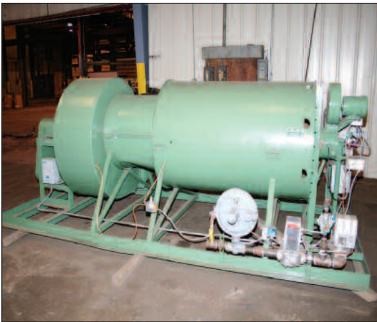
MAXIM BURNER PACK 3,000,000 BTU

The North Carolina Items will be sold via webcast from Turlock, CA. If you do not have internet capabilities, please call our office at 818.508.7034 to make arrangements