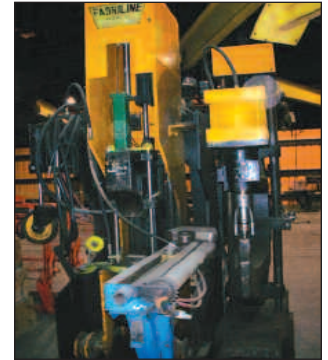
VIEWS OF MANCO MFG. CO. FABRILINE, MDL. 3454786, 5-HEAD HYDRAULIC BEAM PUNCH