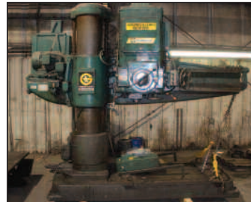
G & L BICKFORD CHIPMASTER RADIAL DRILL