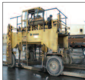
30,000 LB GERHLINGER STRADDLE CARRIER