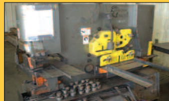
SPARTAN IW77D HYDRAULIC IRON WORKER