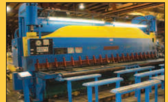
22' X 3/4" CINCINNATI HYDRAULIC SHEAR

BIDITUP™ AUCTIONS & APPRAISALS WORLDWIDE 11426 Ventura Boulevard Studio City, California 91604 Phone: 818.508.7034 Fax: 818.508.3025 info@biditup.com Auctioneer, Steven Mattes CA Bond #CSC3062775