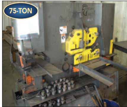
SPARTAN IW77D 75 TON HYDRAULIC IRON WORKER