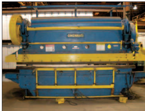
50 TON X 12' CINCINNATI MECHANICAL BRAKE