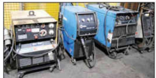
Partial view of welders available

This brochure is only a partial listing. PLEASE VISIT OUR WEBSITE