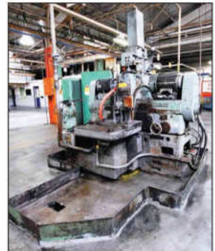
GARDNER 2H30 double disk grinder