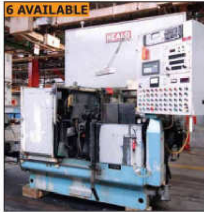
6 AVAILABLE HEALD ICF 90 centri-matic grinder