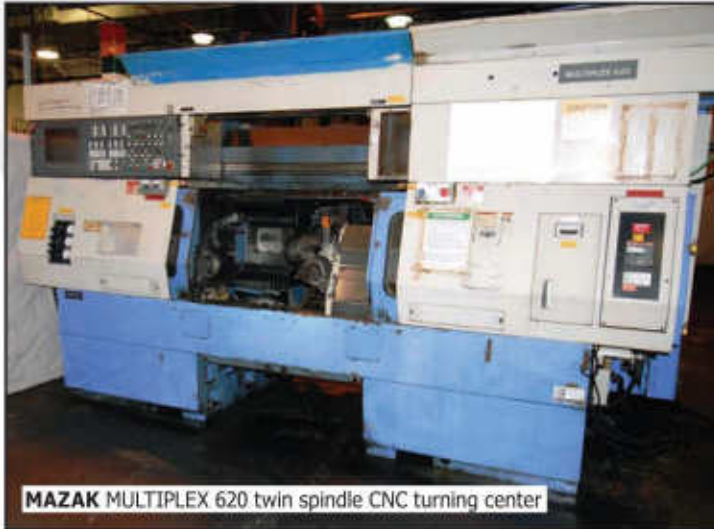
MAZAK MULTIPLEX 620 twin spindle CNC turning center

Surplus Assets from the TIMKEN CANADA LP ST. THOMAS FACILITY