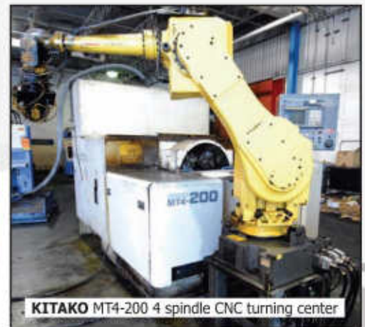
KITAKO MT4-200 4 spindle CNC turning center