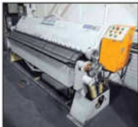
SAMPSON pan brake