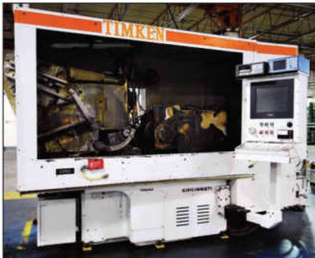
CINCINNATI #2 micro centric centerless grinder