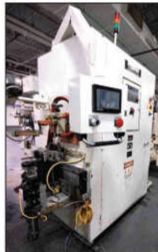
AJAX MAGNETHERMIC induction bearing tempering machine