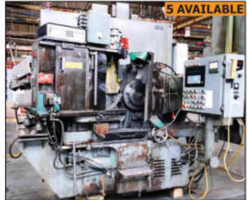
5 AVAILABLE CINCINNATI #1 centerless grinder