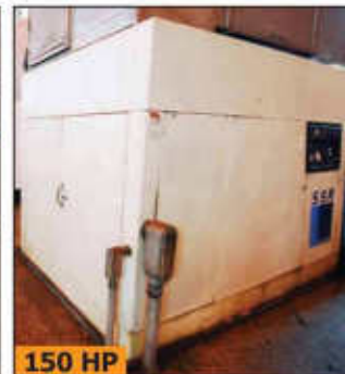
150 HP INGERSOLL RAND air compressor