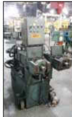
3" EAGLE C-E DUAL HEAD