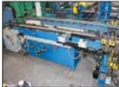
1-1/2" PINES MDL. 1 HORIZ. HYD. TUBE BENDER