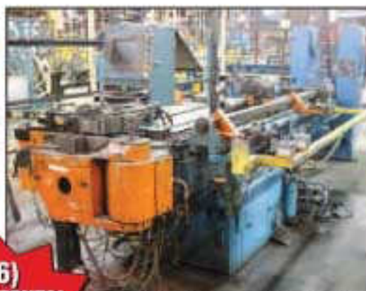
2" EATON LEONARD VB300HP RH CNC BENDER