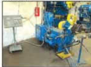
1-1/4" PINES MDL. 3T VERT. HYD. TUBE BENDER