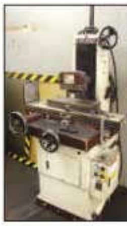
6" X 18" CHEVALIER F5G-818M HOIST GRINDER