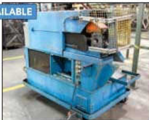
PARTIAL VIEWS OF TC80 TRIM & CUT MACHINES