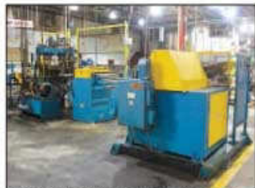
BLANKING LINE, CONSISTING OF: 10,000 LB UNCOILER X 36" HYD. MOTORIZED CWP 36" WIDE COMBINATION STRAIGHTENER