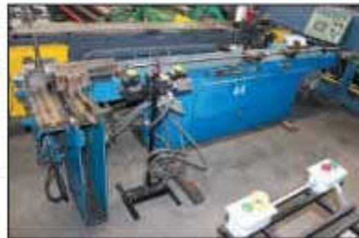
1-3/8" PINES MDL. 3/4 HORIZ. HYD. TUBE BENDER