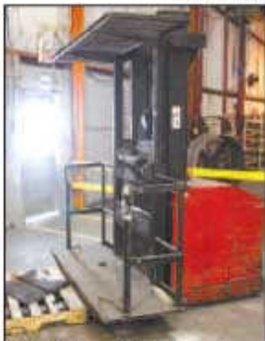
PARTIAL VIEW OF ORDER PICKERS