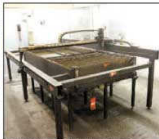
5' X 12' TORCHMATE CNC PLASMA CUTTING SYSTEM