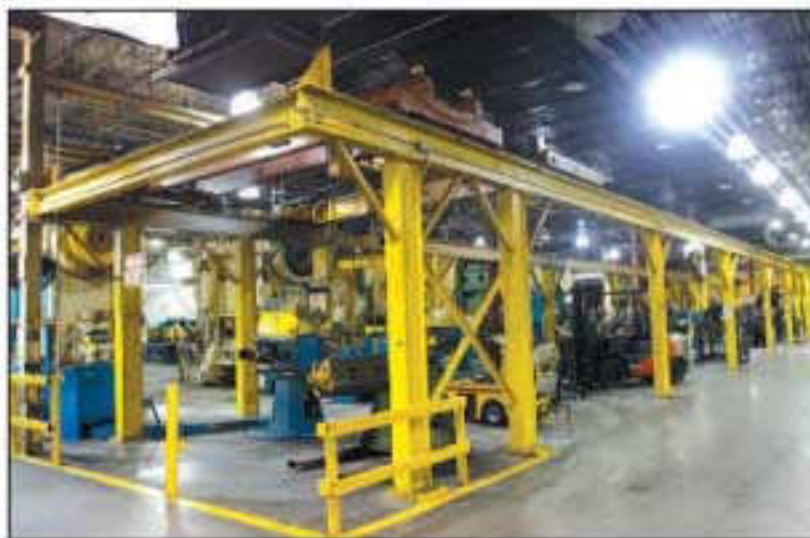
DUAL 5 TON HARRINGTON FREE STANDING CRANE SYSTEM