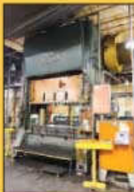
300 TON VERNON SSDC PRESS