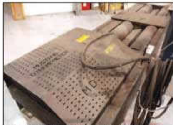
MUSTANG #MD250 FLOOR MOUNTED CHASSI DYNAMOMETER