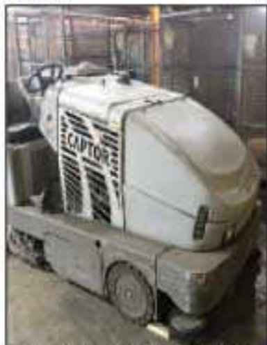
FLOOR SWEEPERS/ SCRUBBERS - ADVANCE 4800