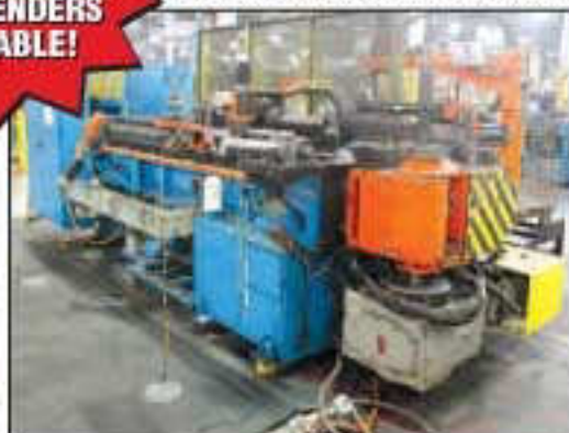
3" AMCS ADAPTIVE MOTION CONTROL EB100EPAR