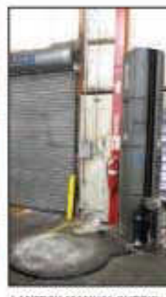
LANTECH MANUAL SHRINK WRAP MACHINE