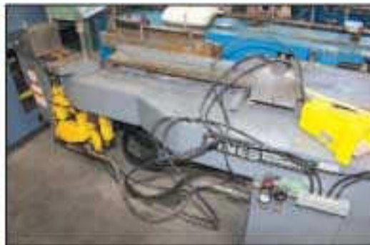
1-3/8" PINES MDL. 3/4 HORIZ. HYD. TUBE BENDER