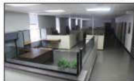
PARTIAL VIEW OF OFFICE FURNITURE