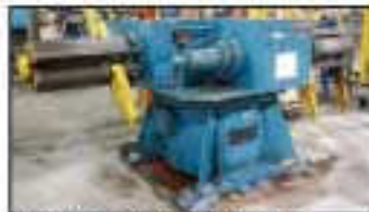
PERFECTO DOUBLE END UNCOILER