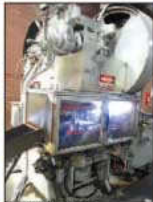
75 TON WARCO PRESS