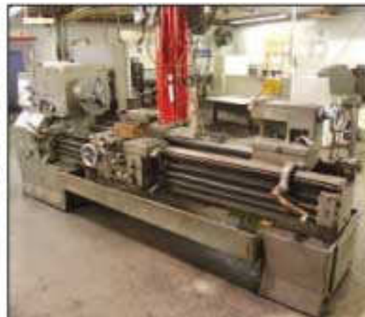
26" X 72" LEBLOND ENGINE LATHE