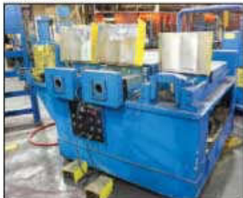
3" GWS IO-E-E