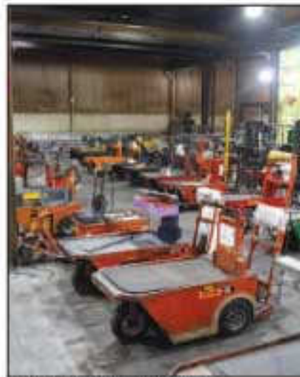
VIEW OF PERSONAL SHOP CARTS