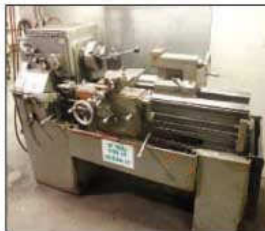
14" X 30" LEBLOND ENGINE LATHE