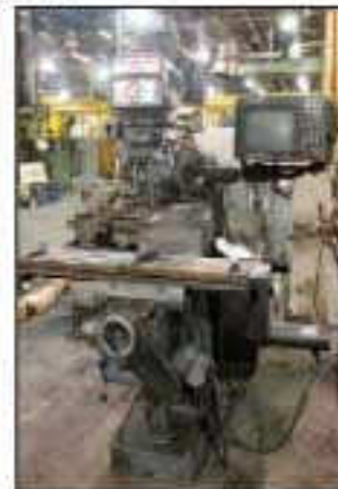
CLAUSING TOMBIA MP-1 VERT. CNC MILL