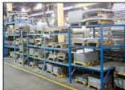
VIEW OF STEEL SHEETS