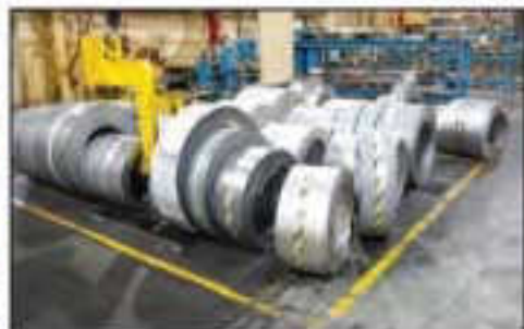
VIEW OF STEEL COILS