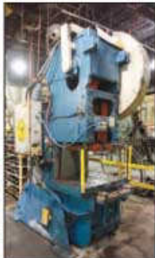
105 TON #7-1/2 VERNON OBI PRESS