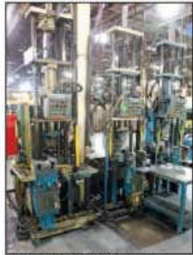
EAGLE VRLK TRIPLE ASSEMBLY MACHINE