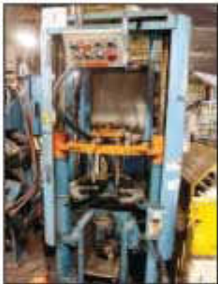
VIEW OF VENT FLARING & ASSEMBLY