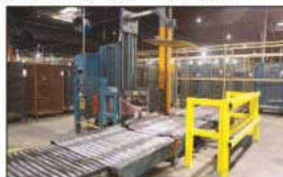
LANTECH AUTO. SHRINK WRAPPING CELL