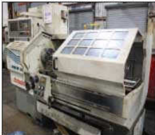
BRIDGEPORT MDL. EZ-PATH SD, YEAR NEW 09/2000