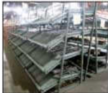
GRAVITY PARTS RACKS