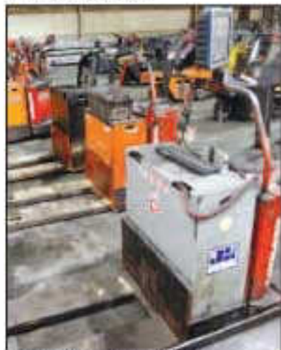
VIEW OF MOTORIZED PALLET JACKS