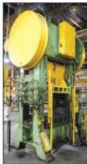
150 TON CLEVELAND SSSDC PRESS