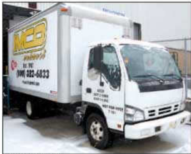
IZUSU VAN BODY TRUCK