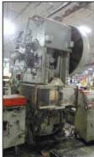
100 TON WARCO PRESS