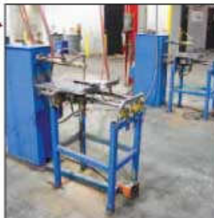
VIEW OF SPOT WELDERS