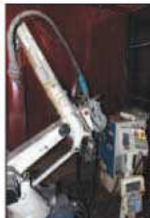
VIEW OF CNC ROBOT WELDING CELLS