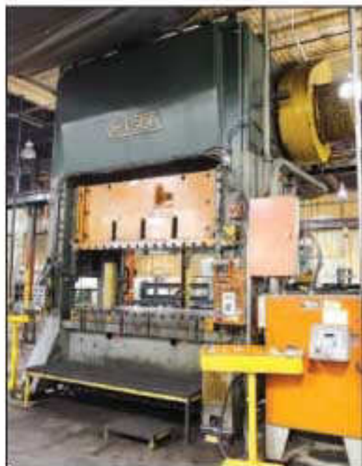
300 TON VERNON S2-300-96-54 SSSDC PRESS

INTERNATIONAL BLANK STAMPER , CONSISTING OF: Rack & Feed, 24" Roller Conveyor, PLC Control