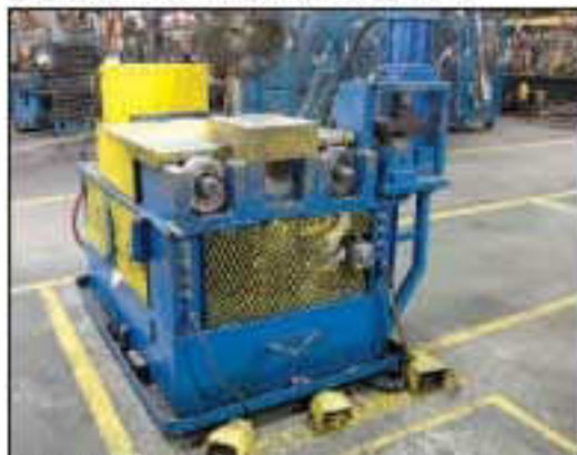
3" EAGLE C-C-C TRIPLE HEAD