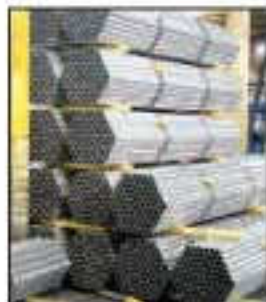
VIEW OF STEEL TUBES