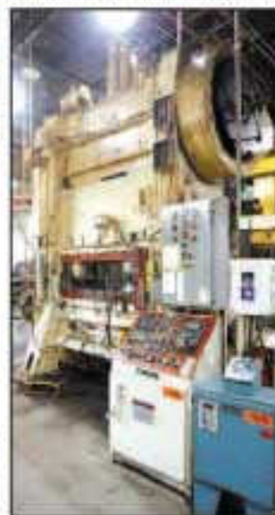
150 TON DANLY SSSDC PRESS