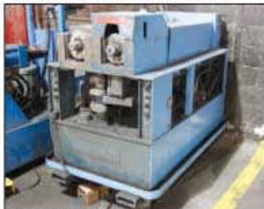
3" EAGLE C-E DUAL HEAD