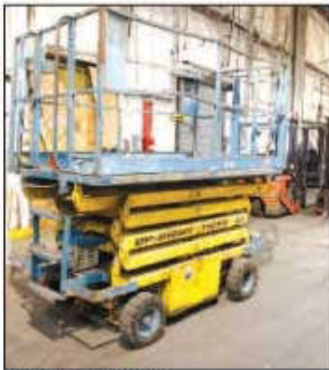
SKITECH PLATFORM MANLIFT