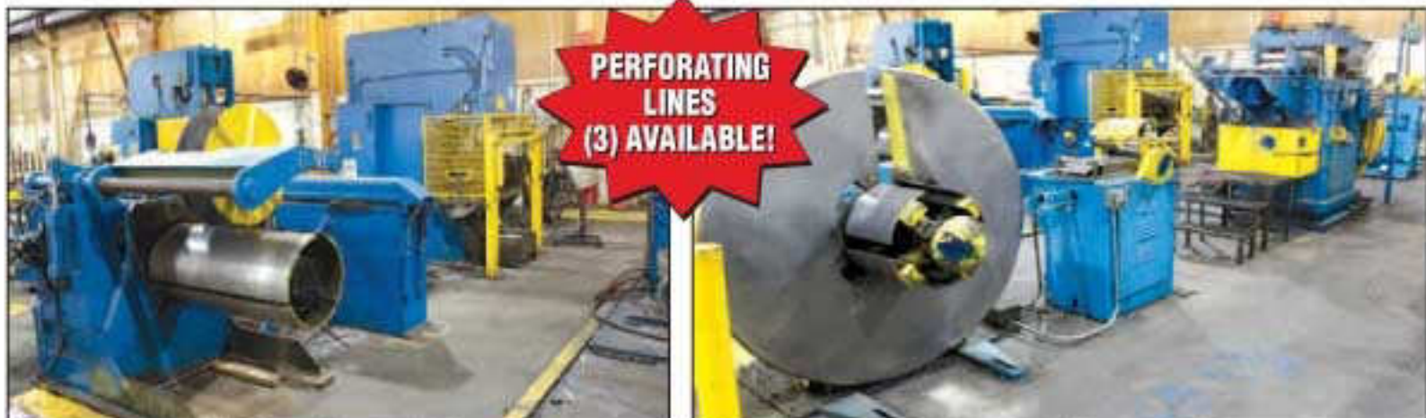
PERFORATING LINE, CONSISTING OF: 2500 LB LITTELL UNCOILER

PERFORATING LINE, CONSISTING OF: 6000 Lb x 24" Mdl. 6024 Littell Reel • 12" Littell Straightener • 60 Ton High Speed Cutoff Press, with Perfecto Single Roll Speed • Littell Straightener • Littell Recoiler