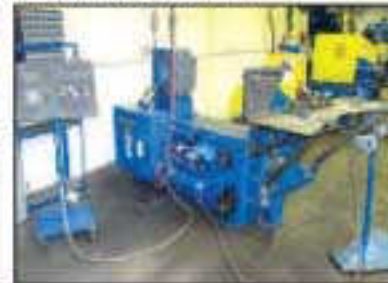
1-1/4" PINES MDL. 3T VERT. HYD. TUBE BENDER