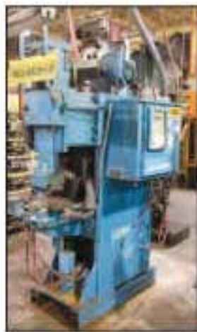
200 KVA MCKAY/FEDERAL PROJECTION WELDER