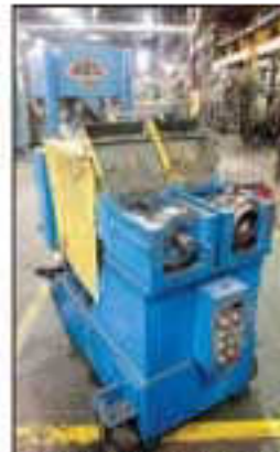
3" MCKEE FM60ER DUAL HEAD