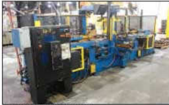
EAGLE XP-CA-85 DOUBLE END STUFFER