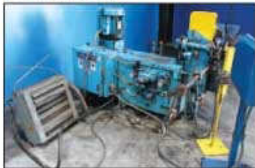
1-1/4" PINES MDL. 3T VERT. HYD. TUBE BENDER