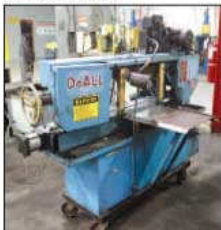
DOALL HORIZONTAL BAND SAW