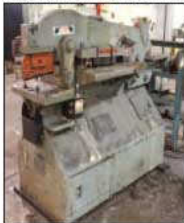
70 TON PIRANNA IRONWORKER