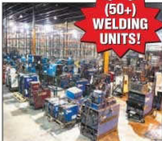
MILLER & LINCOLN WELDING UNITS