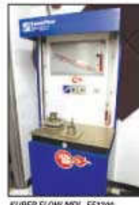
SUPER FLOW MDL. FF1200 FLOW VENT