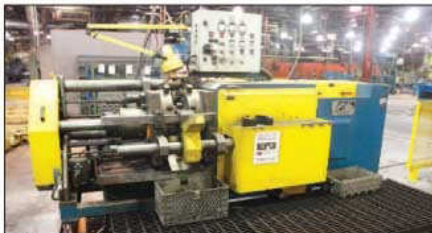
VIDEX U BOLT FORMER