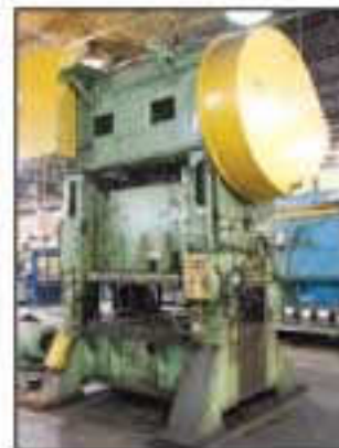
150 TON VERNON PRESS