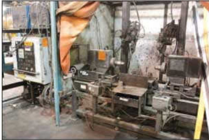
VIEW OF EXHAUST WELDERS