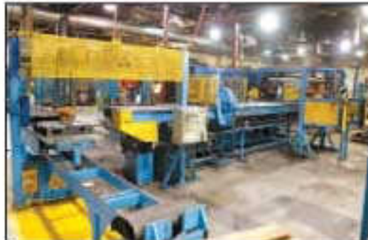
EAGLE WRAPPING MACHINE