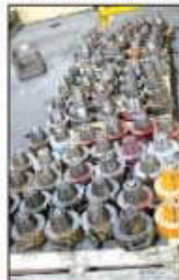
END FORMER TOOLING