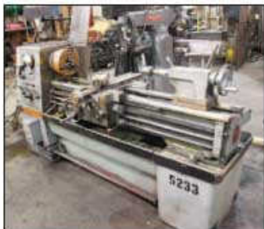
16" X 48" CLAUSING COLCHESTER ENGINE LATHE