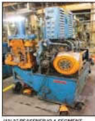
(13) 3" REASENER IO 4-SEGMENT END FORMERS