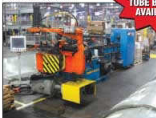
4" AMCS ADAPTIVE MOTION CONTROL EB100EPAR