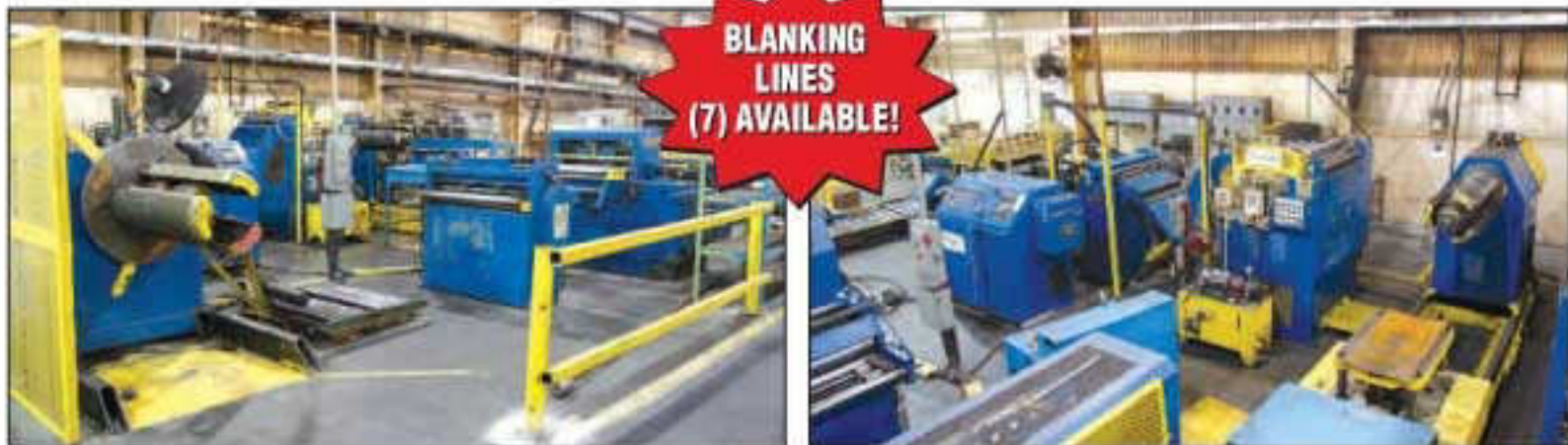
BLANKING LINE, CONSISTING OF: 10,000 LB X 48" W AMERICAN STEEL LINE #1000 DRIVEN UNCOILER

BLANKING LINE, CONSISTING OF: 16,000 Lb x 30" W Powered Uncoiler, S/N 26198, Mdl. 1630DSL, 60" O.D. • 30" Straightener Servo Feed Combination Roll • Combination Embosser Shear • Runout & Stacker