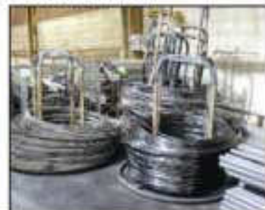
VIEW OF STEEL WIRE

ONSITE BIDDER INSTRUCTIONS: $500 cash minimum registration deposit or 25% of approximately bid amount (whichever is greater) via wire transfer, cashier's check or company check accompanied by a bank letter of guarantee all prior the auction. Please refer to www.bid4up.com for complete registration information.