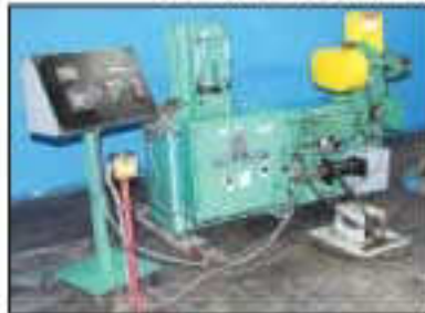
1-1/4" PINES MDL. 3T HYD. VERT. TUBE BENDER