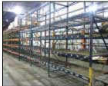
VEWS OF PALLET RACKING