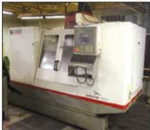
ARROW 1000 VERTICAL MACHINING CENTER