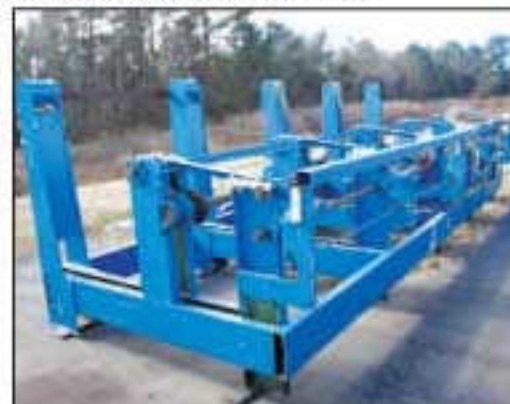
HAVEN FEED RACK