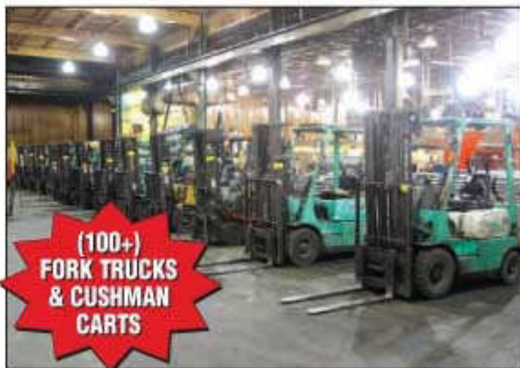
4000-8000 LB MITSUBISHI, TOYOTA, CATERPILLAR KALMAR ELECTRIC & LPG FORKTRUCKS