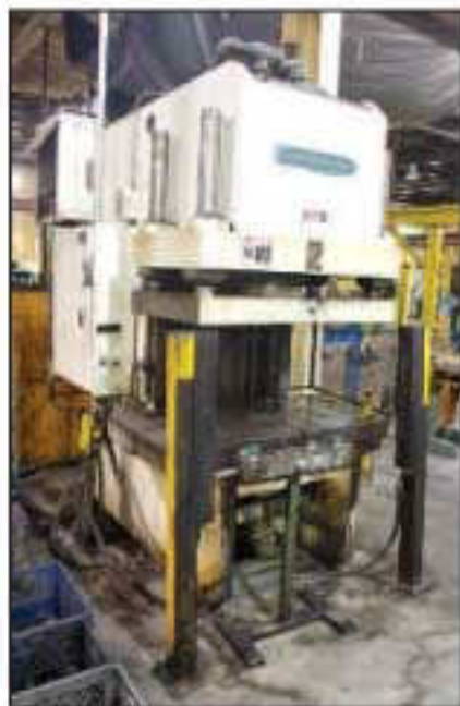
200 TON GREENERD HC-200-60-38 HYDRAULIC GAP FRAME PRESS