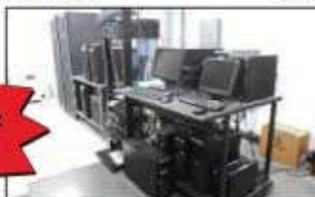
COMPUTER SYSTEM, WITH SERVERS