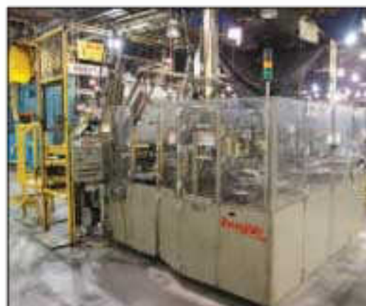
DOUGLAS MACHINE CO BOXER

10,000 LBS TEMINI AUTO LIFT, S/N 04-55281-02-054, Mdl. TP10AF