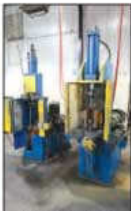
EAGLE VERTICAL FORMING