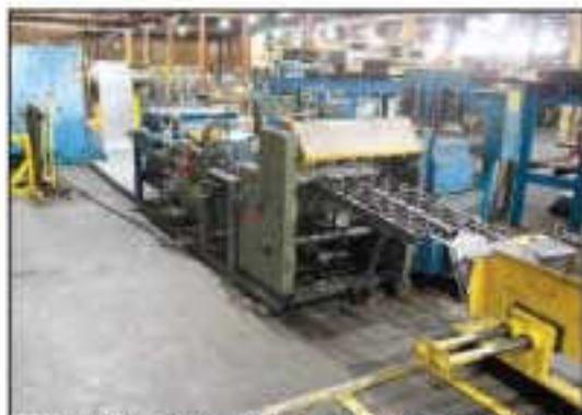
BLANKING LINE, CONSISTING OF: 10,000 LB X 36" COE #CPR 136 DRIVEN UNCOILER