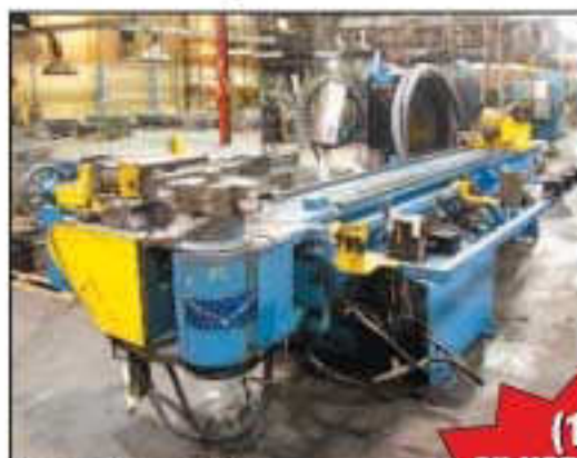
3" EAGLE EPT75 CNC BENDER