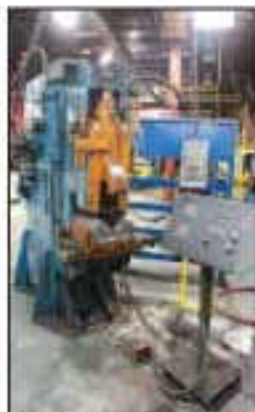
(5) PINES VERTICAL BENDERS