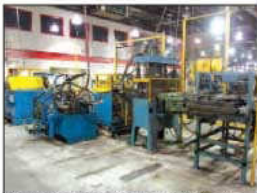
BLANKING LINE, CONSISTING OF: 16,000 LB X 30" W ROWE DRIVEN UNCOILER