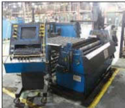
48" X 10 GA. DAVI HYD 4 ROLL DBL. INITIAL PINCH BENDING ROLL