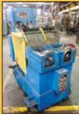
3" MCKEE FWRGR DUAL HEAD