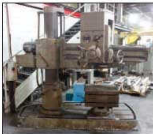
3' X 11" CINCINNATI GILBERT RADIAL ARM DRILL