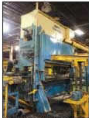
100 TON WEAN UNITED SSSDC PRESS