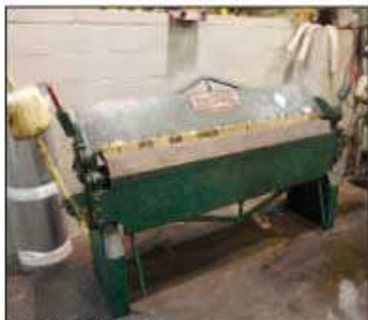
4' NATIONAL FINGER BRAKE