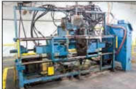
VIEW OF EAGLE FLARING MACHINE