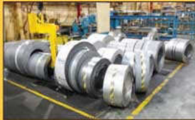
VIEW OF STEEL COILS

MILLIONS OF DOLLARS OF FINISHED GOODS AND RAW MATERIALS TO BE OFFERED