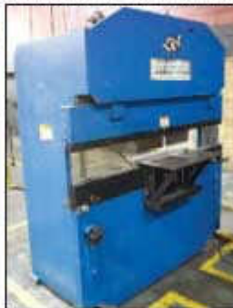
35 TON X 6" PIRANNA HYDRAULIC PRESS