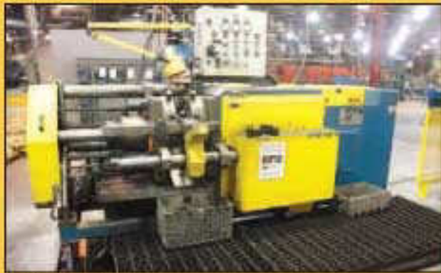
VIDEX U BOLT FORMER