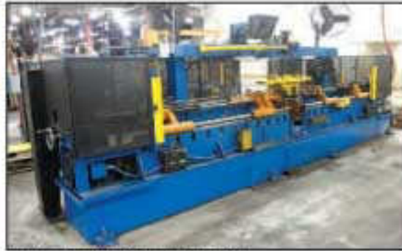
EAGLE SPDBASG23 DOUBLE END STUFFER