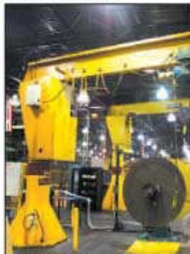
VIEW OF 4 TON JIB CRANES