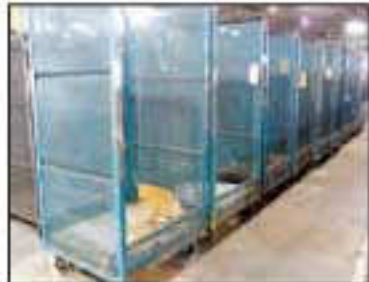
ROLLING PARTS CONTAINERS