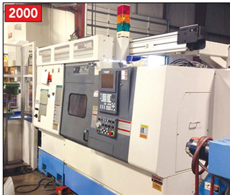
MAZAK 250MSY CNC TURNING CENTER