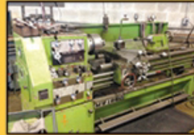
TA SHING/CALEB ENGINE LATHE