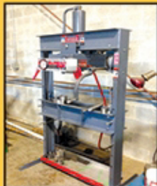
DAKE HYD. H-FRAME PRESS