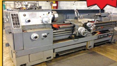
SHENYANG 20" X 80" ENGINE LATHE