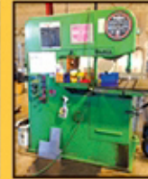
DOALL VERT. SAW