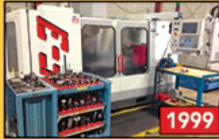
HAAS VF3 CNC VMC