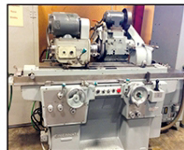
CINCINNATI UNIVERSAL ID/OD GRINDER