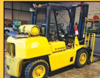
HYSTER H80XL 7900 LBS. CAP. FORKLIFT