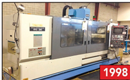
MAZAK VTC-20C CNC MACHINING CENTER

Online Bidding Only, go to: www.biditup.com