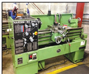
NARDINI 14" X 40" ENGINE LATHE