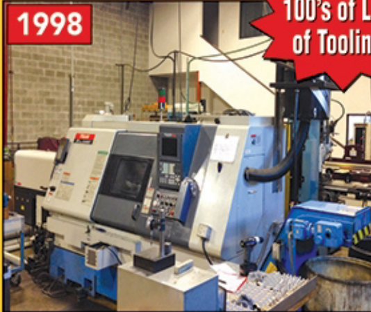
MAZAK 200MSY CNC TURNING CENTER