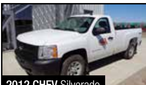
2012 CHEV Silverado