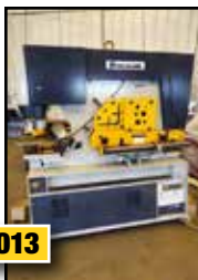
LATE MODEL FAB EQUIPMENT TO 2013