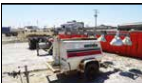
AMIDA Light Trailer