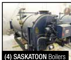
(4) SASKATOON Boilers