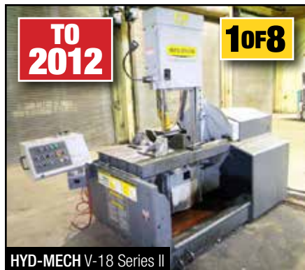
HYD-MECH V-18 Series II