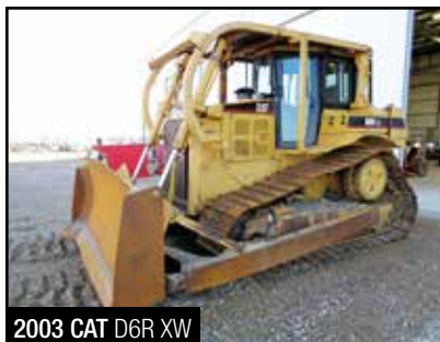
2003 CAT D6R XW