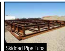
Skidded Pipe Tubs