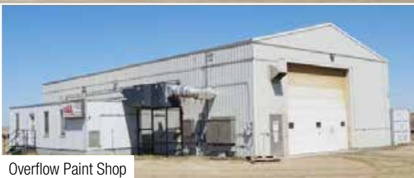
Overflow Paint Shop