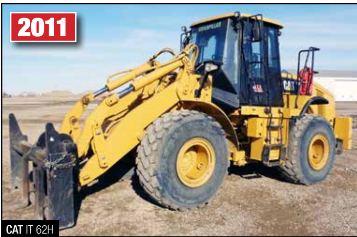
CAT IT 62H