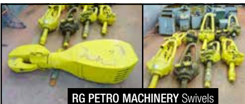
RG PETRO MACHINERY Swivels