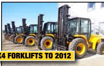
CAT LOADERS / JCB 4X4 FORKLIFTS TO 2012