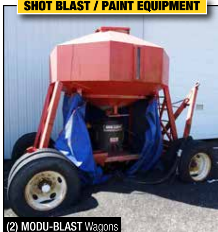
(2) MODU-BLAST Wagons