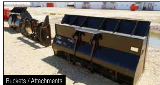
Buckets / Attachments