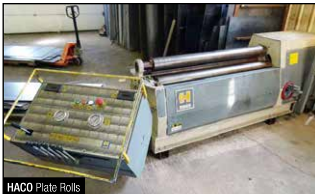
HACO Plate Rolls