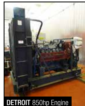
DETROIT 850hp Engine