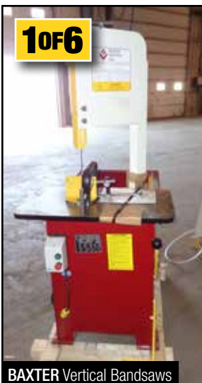
BAXTER Vertical Bandsaws