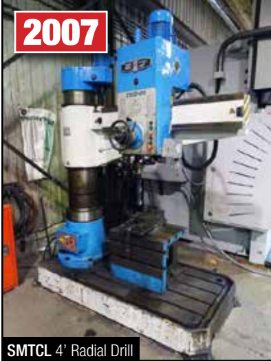
SMTCL 4' Radial Drill