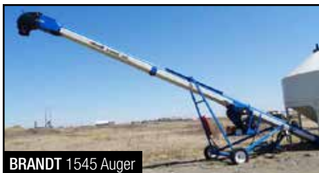
BRANDT 1545 Auger