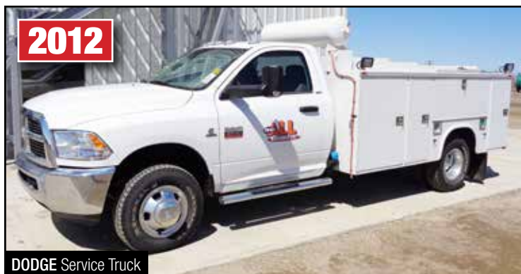
DODGE Service Truck