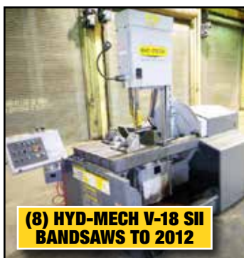
(8) HYD-MECH V-18 SII BANDSAWS TO 2012