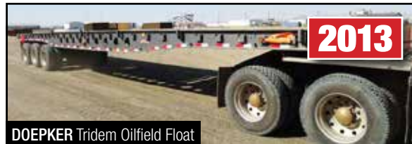
DOEPKER Tridem Oilfield Float