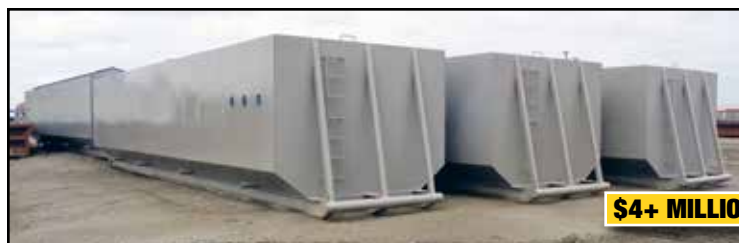
$4+ MILLION INVENTORY