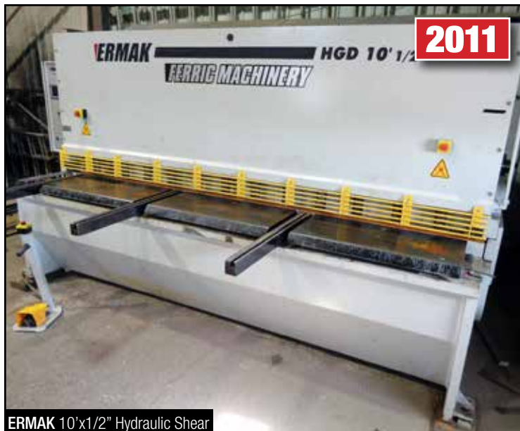
ERMAK 10'x1/2" Hydraulic Shear