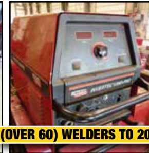
(OVER 60) WELDERS TO 2011