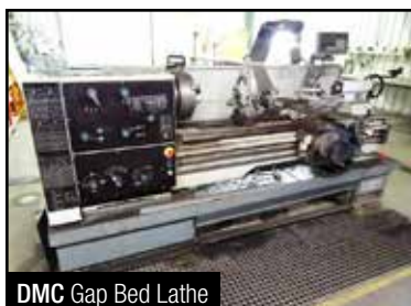
DMC Gap Bed Lathe