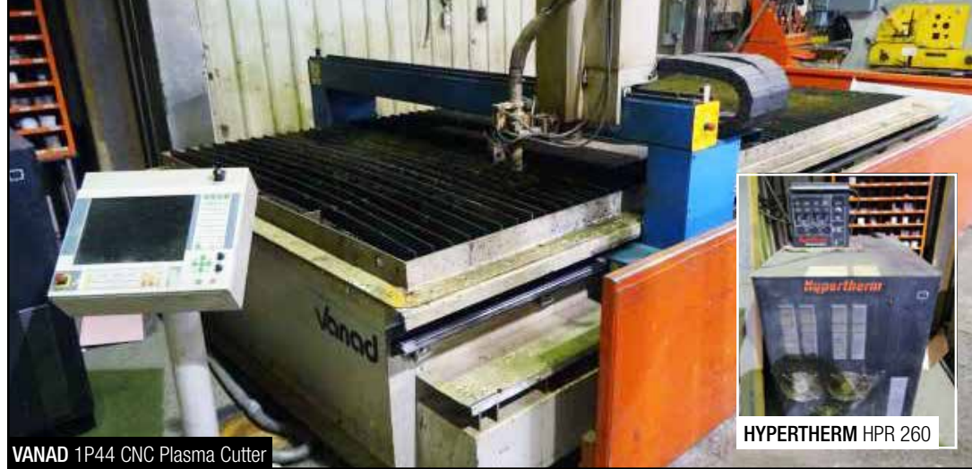
VANAD 1P44 CNC Plasma Cutter