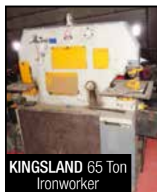
KINGSLAND 65 Ton Ironworker