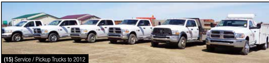
(15) Service / Pickup Trucks to 2012