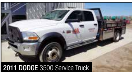
2011 DODGE 3500 Service Truck