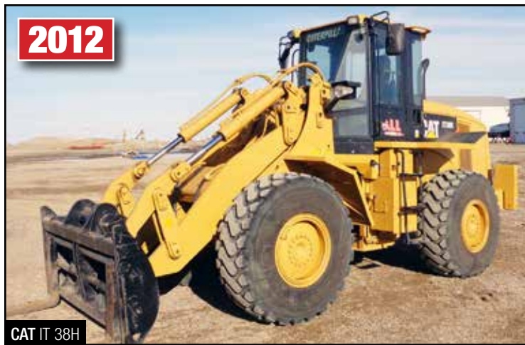
CAT IT 38H