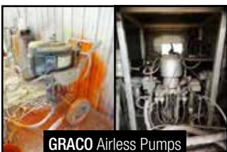
GRACO Airless Pumps