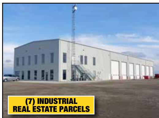
(7) INDUSTRIAL REAL ESTATE PARCELS