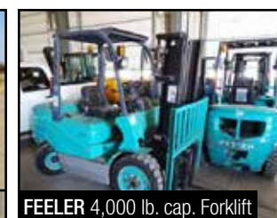
FEELER 4,000 lb. cap. Forklift