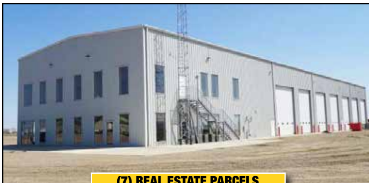
(7) REAL ESTATE PARCELS AVAILABLE FOR IMMEDIATE SALE