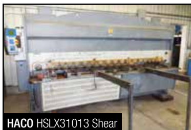
HACO HSLX31013 Shear