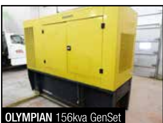
OLYMPIAN 156kva GenSet