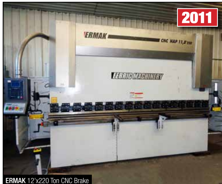
ERMAK 12'x220 Ton CNC Brake