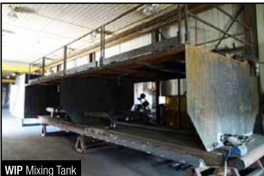
WIP Mixing Tank