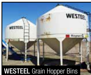
WESTEEL Grain Hopper Bins