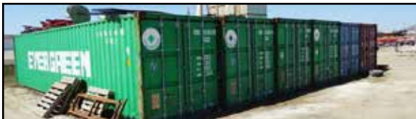
40' / 20' Sea Containers