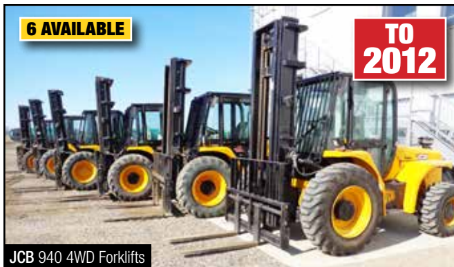
JCB 940 4WD Forklifts