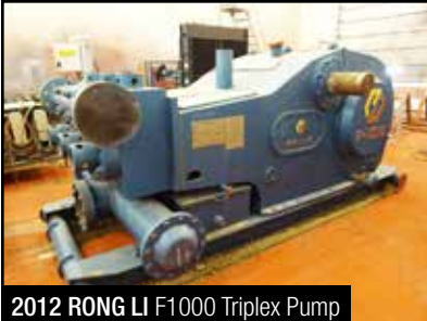
2012 RONG LI F1000 Triplex Pump