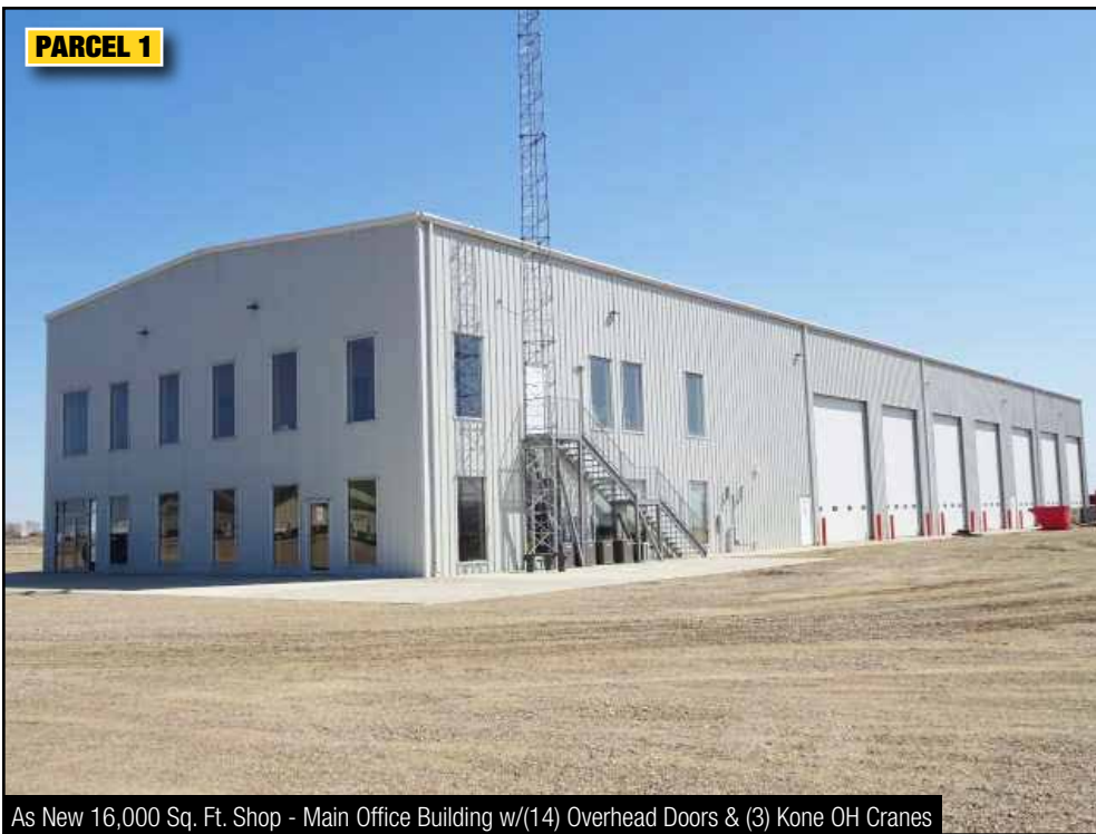
As New 16,000 Sq. Ft. Shop - Main Office Building w/(14) Overhead Doors & (3) Kone OH Cranes