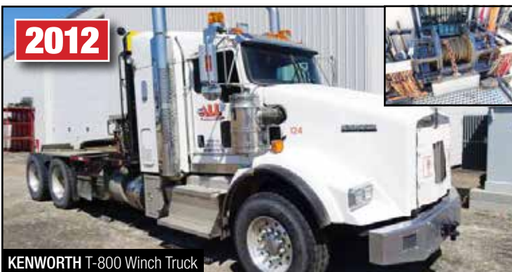
KENWORTH T-800 Winch Truck