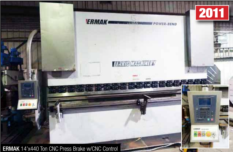
ERMak 14'x440 Ton CNC Press Brake w/CNC Control