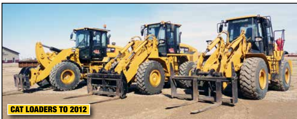
CAT LOADERS TO 2012