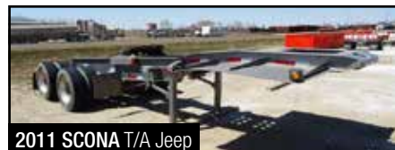
2011 SCONA T/A Jeep