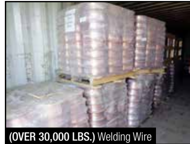
(OVER 30,000 LBS.) Welding Wire