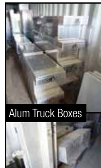
Alum Truck Boxes