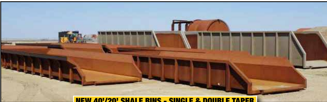
NEW 40'/20' SHALE BINS - SINGLE & DOUBLE TAPER