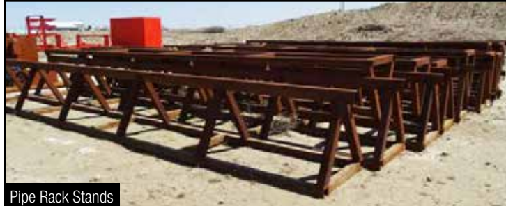
Pipe Rack Stands