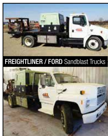
FREIGHTLINER / FORD Sandblast Trucks