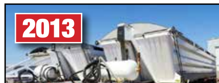
(2) ARNES 38' End Dump