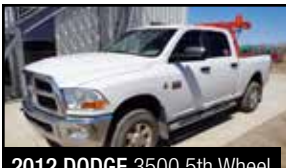
2012 DODGE 3500 5th Wheel