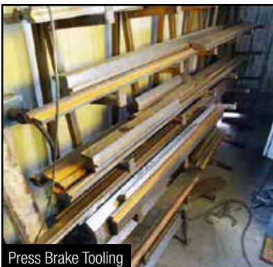
Press Brake Tooling