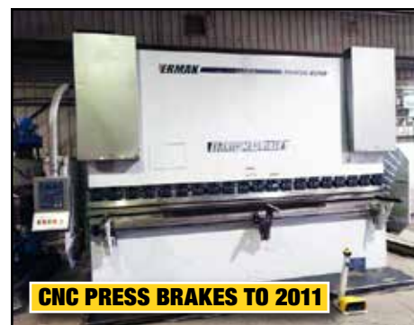
CNC PRESS BRAKES TO 2011