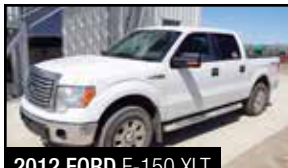
2012 FORD F-150 XLT