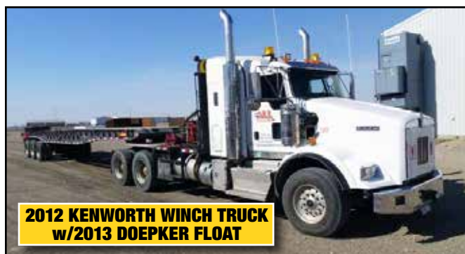
2012 KENWORTH WINCH TRUCK w/2013 DOEPKER FLOAT