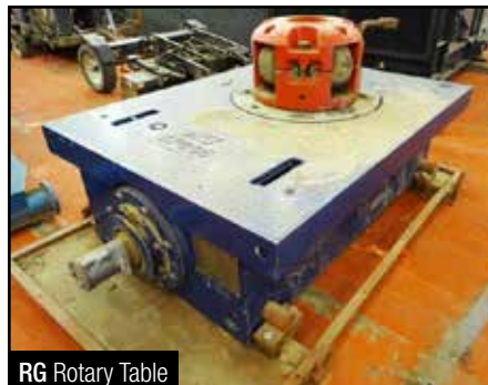
RG Rotary Table