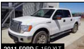
2011 FORD F-150 XLT