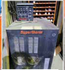
HYPERTHERM HPR 260