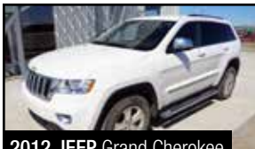
2012 JEEP Grand Cherokee