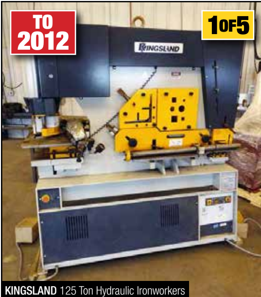
KINGSLAND 125 Ton Hydraulic Ironworkers