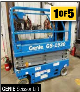
GENIE Scissor Lift