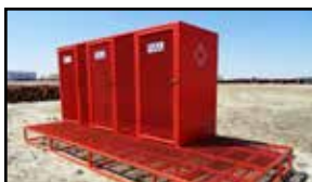
Several Fuel Cases