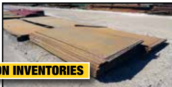
OVER $4 MILLION INVENTORIES