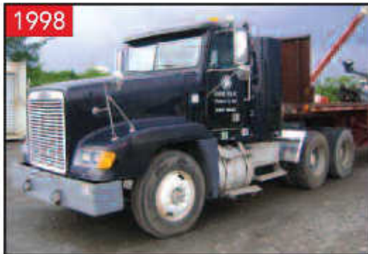
1998 FREIGHTLINER TRACTOR