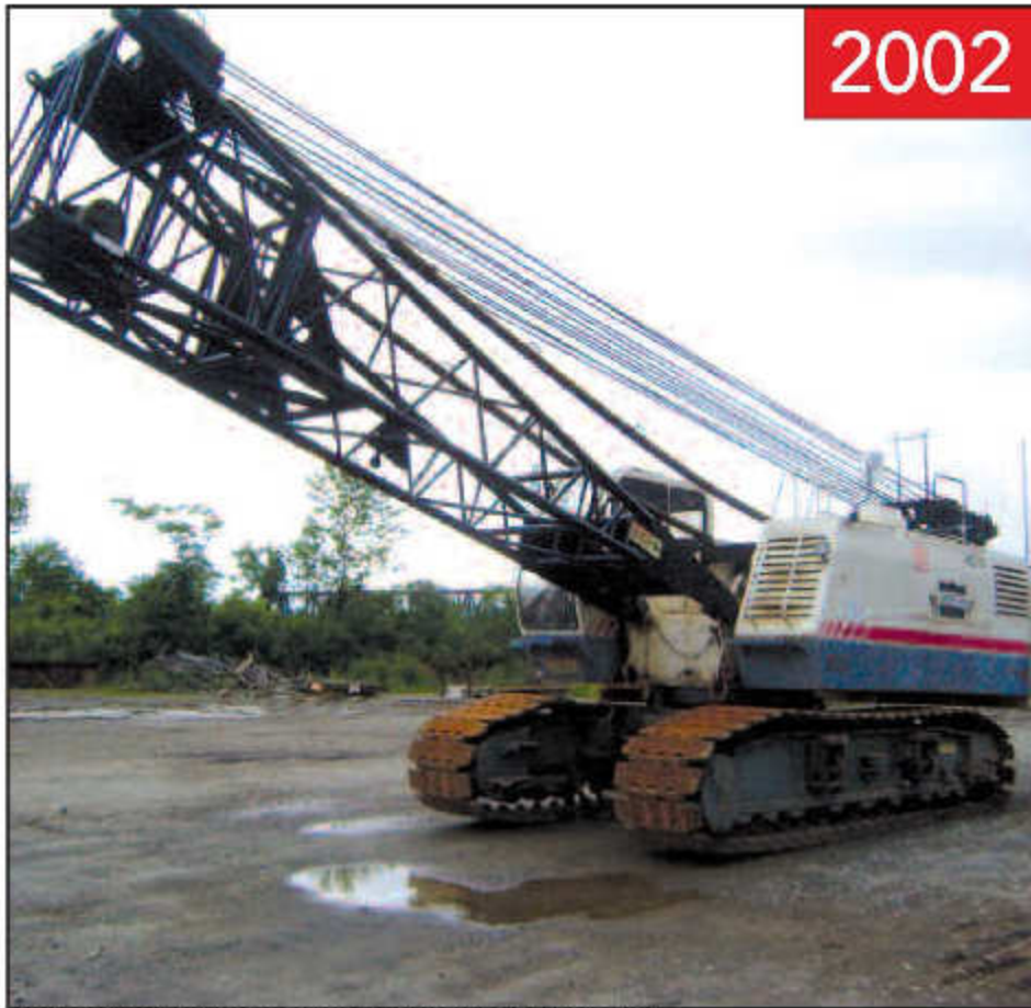
AMERICAN (TEREX) MDL. HC-110 100/110-TON HYDRAULIC CRAWLER CRANE