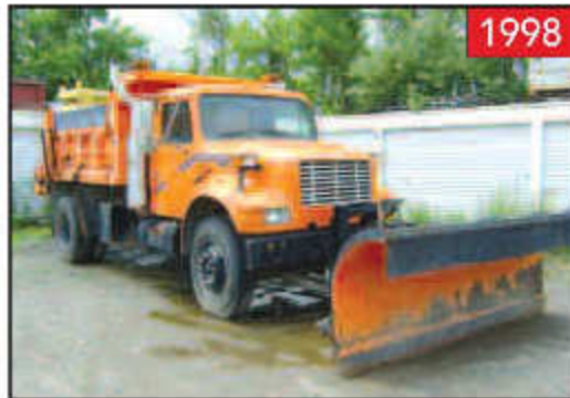
1998 INTERNATIONAL DUMP/PLOW TRUCK