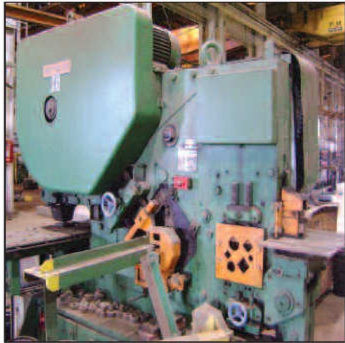
1977 PEDDINGHAUS Mdl. 210 Super 25G, S/N 4417952777005, 5-Station Mechanical Iron Worker