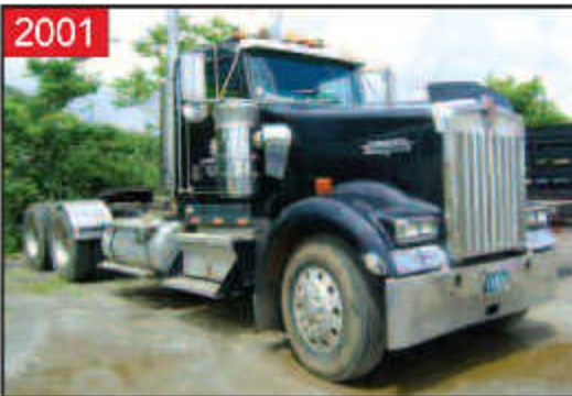
2001 KENWORTH W-900-L TRACTOR