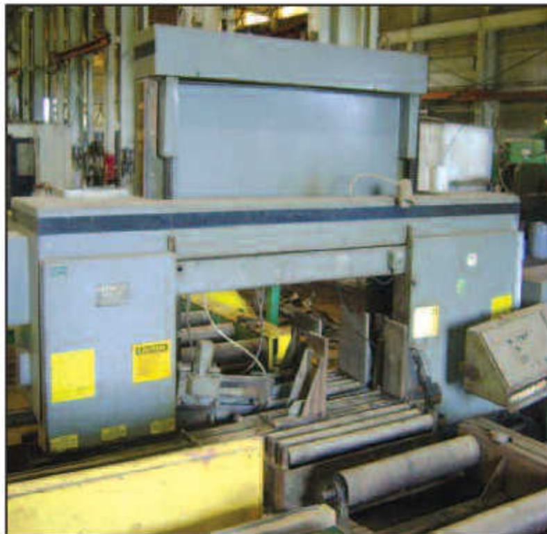
HEM MDL. WFL90LM-DC LRG. CAP. HORIZ. BAND SAW

HEM Mdl. WFL90LM-DC, S/N 656599 Large Capacity Manual Double Column Horizontal Metal Cutting Band Saw, 24" Rounds, 44" Flats