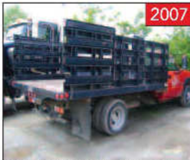
2007 CHEVROLET SILVERADO 3500 STAKE BODY