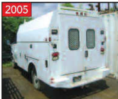
2005 CHEVROLET G3500 MECHANIC/SERVICE TRUCK