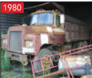
1980 MACK DUMP TRUCK