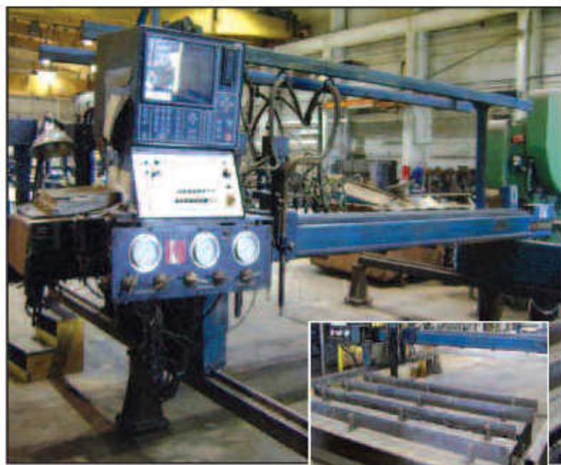
K.M. ARONSON 6-HEAD PLASMA CUTTING SYSTEM

(2) MILLER Submerged Arc Welding Systems (Interconnected as one), 4-Wire Feed Reels, Controller - M/N HDC1500DX, New 2010 w/(2) Weld Eng. "The Mighty-Mac" Flux Recovery / Vac Systems, M/N PS-3000, New 2013