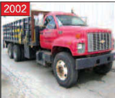
2002 CHEVROLET C-8500 STEEL BED STAKE BODY