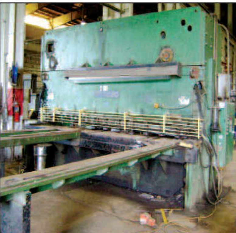
WYSONG MDL. 7512 3/4" MECH. POWER SQUARING SHEAR

EQUIPMENT TECH. INC. Wheelabrator System, M/N PAC (Portable Abrasive Cleaning Sys., S/N 2B007, New 1981, w/Dust-Reclaim Unit Portable Pneumatic Shot Blast System