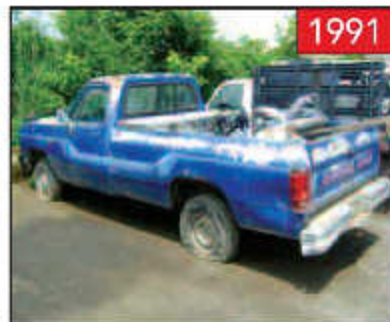
1991 DODGE W15 PICKUP TRUCK