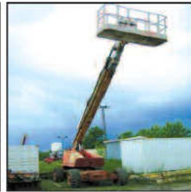
SNORKEL 60' BOOM LIFT