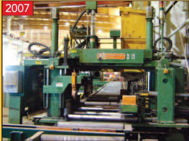
2007 PEDDINGHAUS MDL. ABCM1250 AUTOMATED BURNING & COPING MACHINE