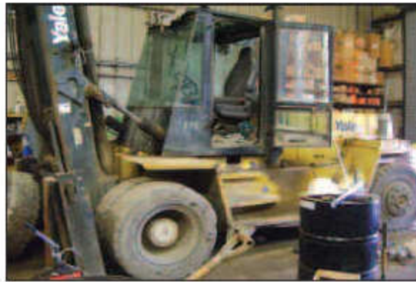
YALE 30,000 LB. CAP FORKLIFT