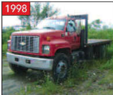
1998 CHEVROLET C8500 24' FLATBED TRUCK