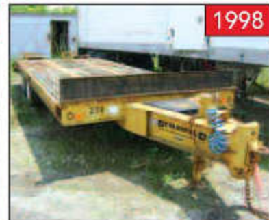
BROWN 40' FLATBED TRAILER