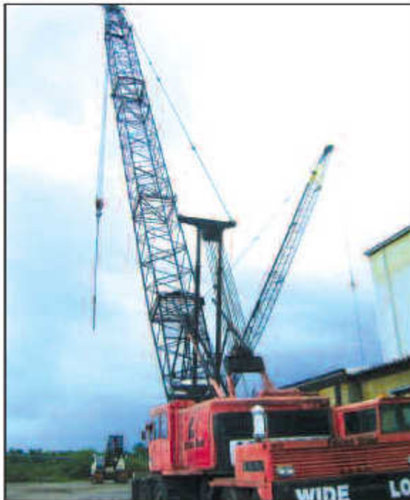
LINKBELT MDL. HC-218 CRANE, APPROX. 100-TON CAP