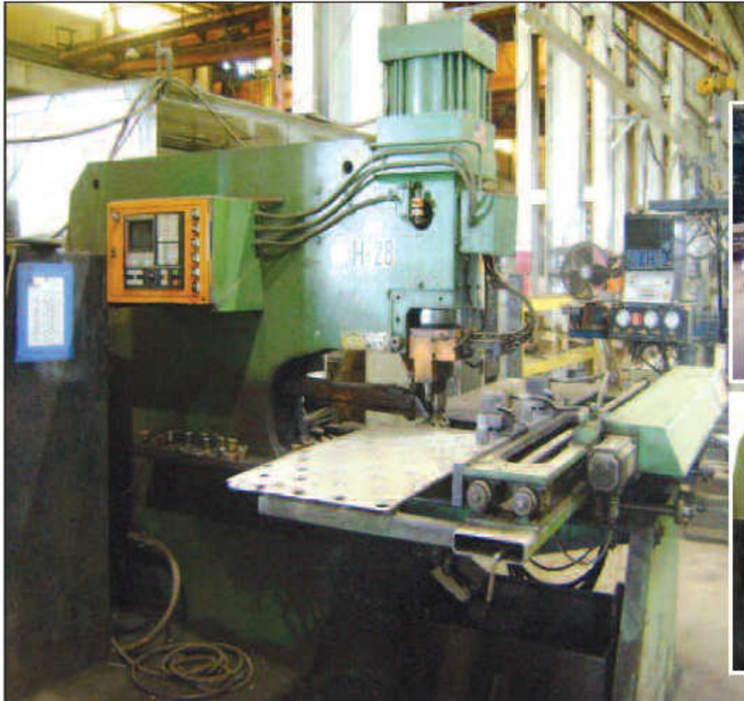
1990 PEDDINGHAUS Mdl. F-1154 30-Ton, S/N C-172, 30-Ton CNC Fabrication Center, Material Size 30" x 120" w/3-Position Fixed Tooling & Fagor CNC Controls