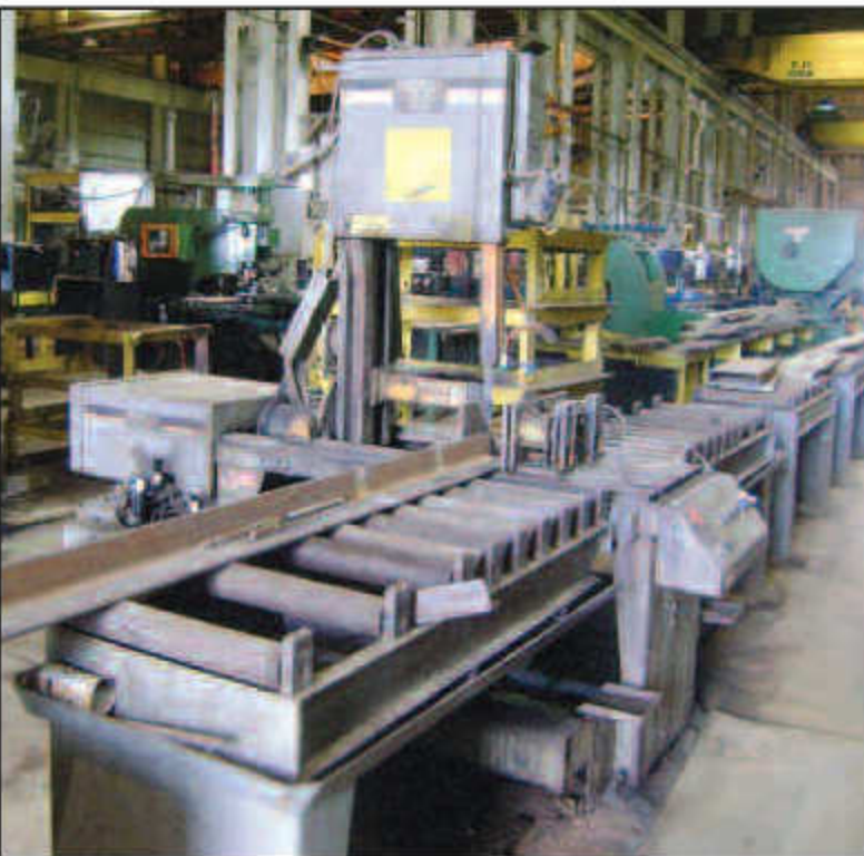
HEM MDL. V100 LM-3 VERT. TRAV. CARRIAGE BAND SAW

HEM Mdl. V100 LM-3, S/N 784501, Vertical Traveling Carriage Metal Cutting Band Saw, Hydraulic, Coolant, In-feed & Out-feed Conveyors