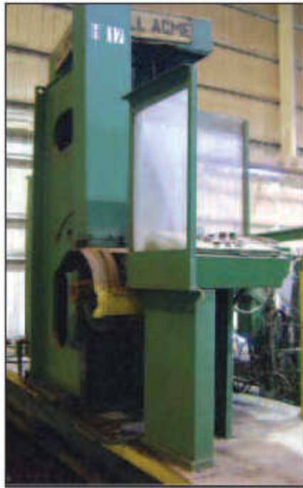
HILL ACME Mdl. L102-C, Portable Horizontal Column Type Boring Mill