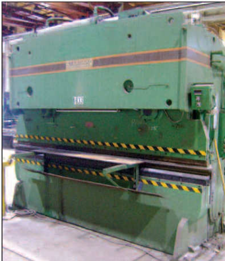
STANDARD INDUSTRIAL Mdl. 325T HYD./MECH. PRESS BRAKE