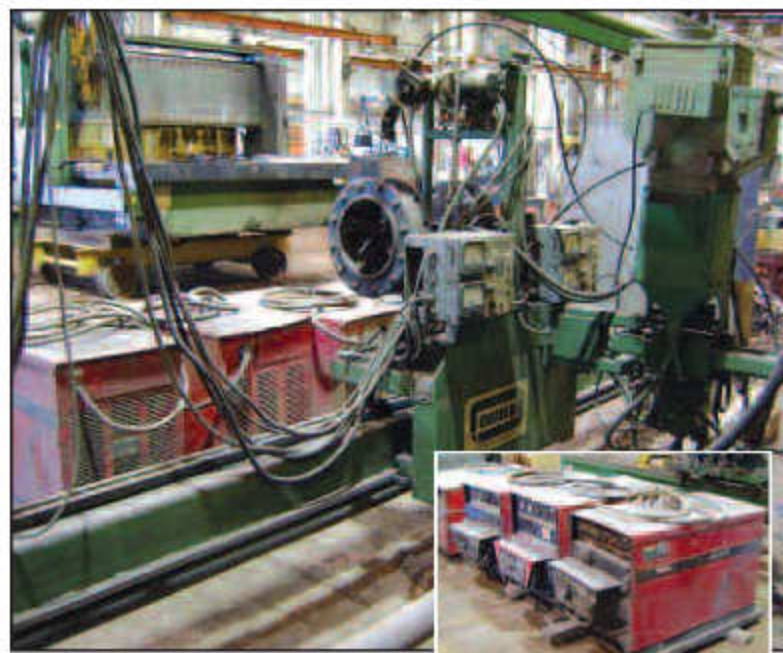
OGDEN GANTRY WELDER WITH (4) POWER SOURCES