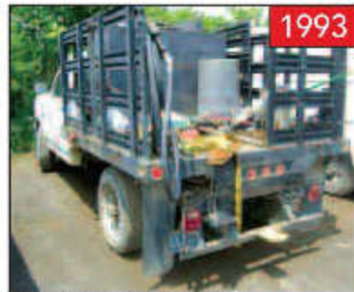
1993 FORD F250 8' STAKE BODY TRUCK