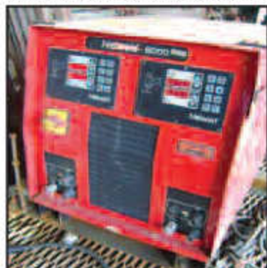
NELSON STUD WELDER