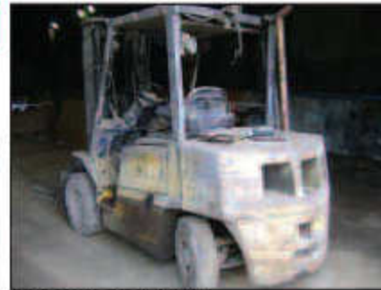
YALE 8,000 LB. CAP FORKLIFT