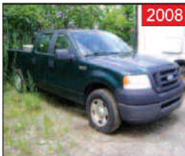
2008 FORD MDL F150 SUPER CREW 4X4 PICKUP