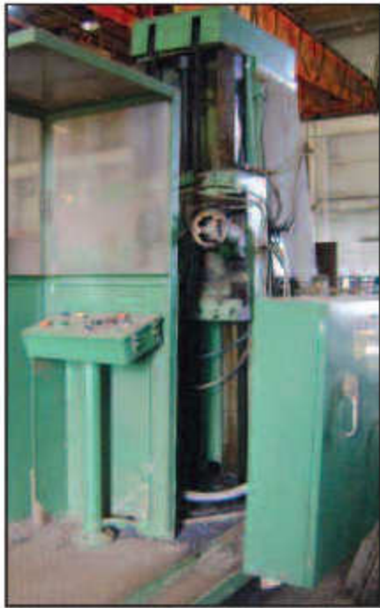
KLING Mdl. Mill All, S/N 442760, Portable Horizontal Column Type Boring Mill