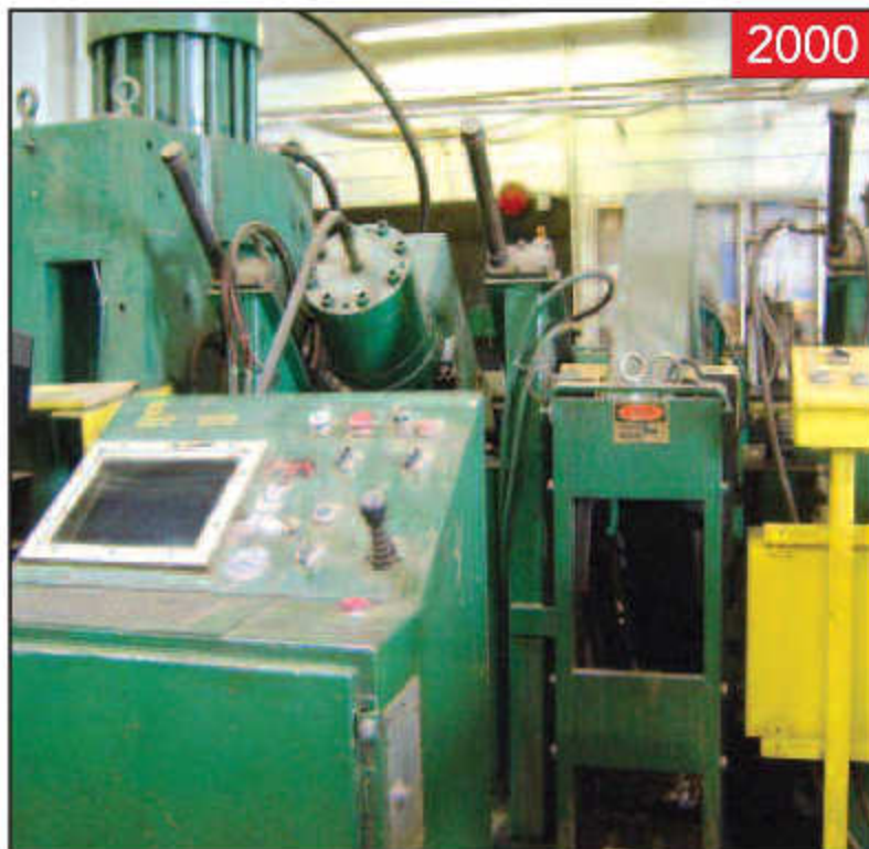
CONTROLLED AUTOMATION MDL. ABL100 ANGLE & FLAT BAR PUNCHING & SHEARING MACHINE

2000 CONTROLLED AUTOMATION Mdl. ABI100, S/N 00-47, Angle & Flat Bar Punching & Shearing Machine: • Maximum Processing Length: 40' Standard (60' Optional) • Minimum Processing Length: 6' Angle • Maximum Angle Size: 8" x 8" x 1" • Minimum Angle Size: 1-1/2" x 1-1/2" x 3/16" • Minimum Material Thickness: 20 Gauge Flat Bar • Maximum Bar Size: 1" x 12" • Minimum Bar Size: 3/16" x 2-1/4" • (Maximum 20' Length) Channels (Web Punching Only) • Maximum Channel Size: 12" • Minimum Channel Size: 6"