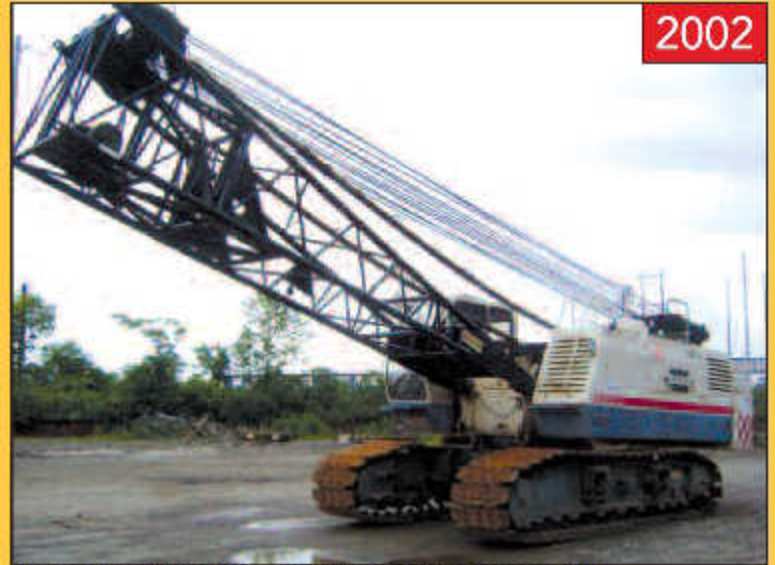
AMERICAN (TEREX) MDL. HC-110 100/110-TON HYDRAULIC CRAWLER CRANE