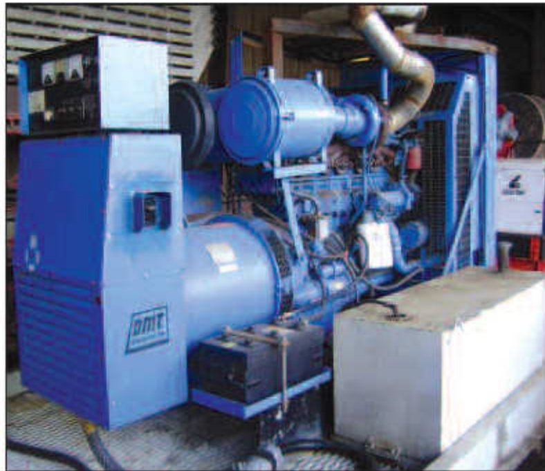
DMT 200KW DIESEL GENERATOR