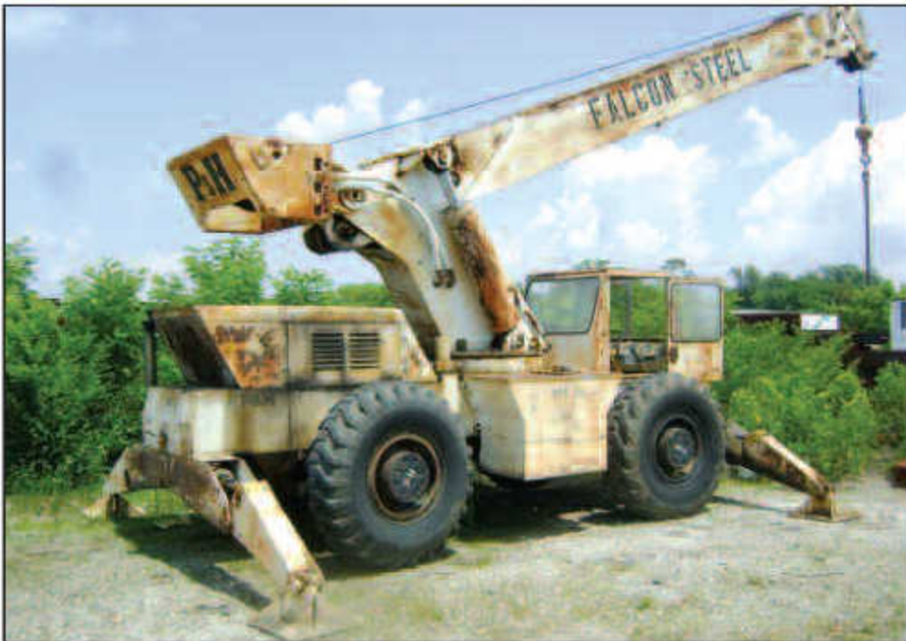
P&H 12-1/2-TON ROUGH TERRAIN HYD. CRANE