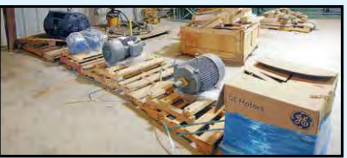
NEW ELECTRIC MOTORS

(3) PORTABLE AIR CONDITIONING UNITS, w/condenser and air handler, (Days 3 & 4).