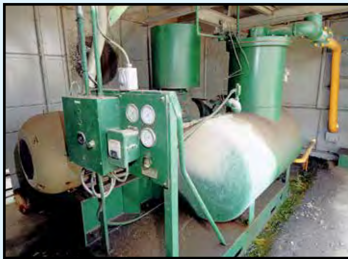
SULLAIR 300 HP ROTARY SCREW AIR COMPRESSOR

MANCHESTER AIR RECEIVER TANK, new 2006, 1,550 gal. cap., 200 PSI, MAWP, (Day 4).