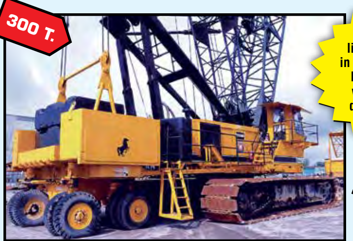
AMERICAN 11250 "SKYHORSE" CRAWLER CRANE