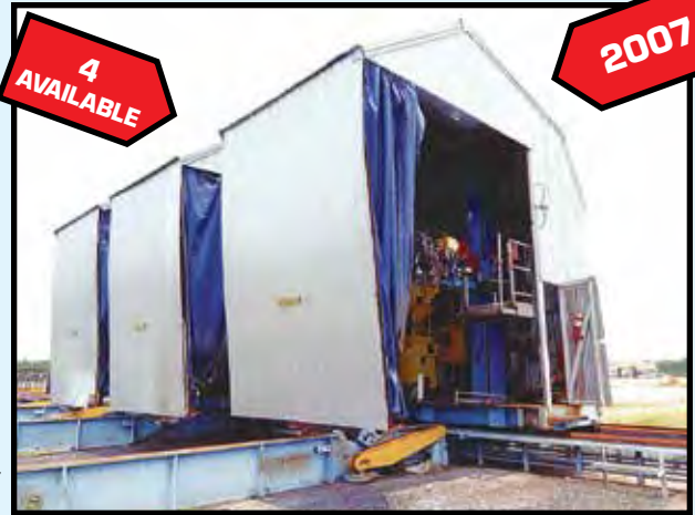
ROMAR MOBILE SUBARC MANIPULATORS