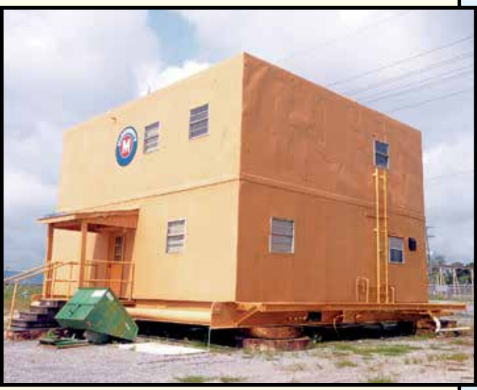
PORTABLE OFFICE BUILDING