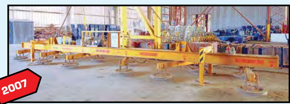
ANVER VACUUM SHEET LIFTER