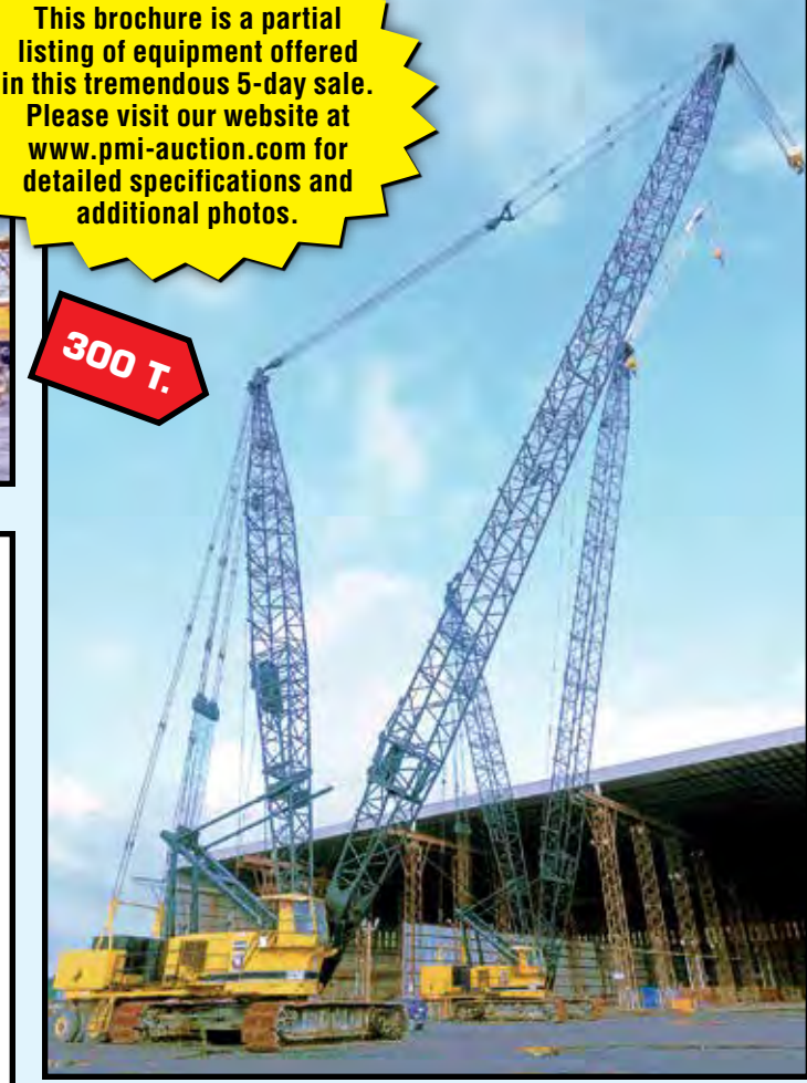
AMERICAN 11250 "SKYHORSE" CRAWLER CRANE