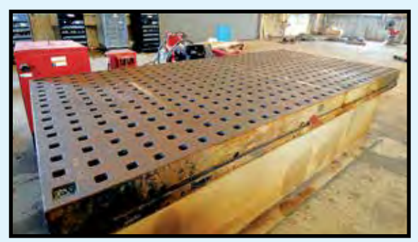
ACORN WELDING PLATENS