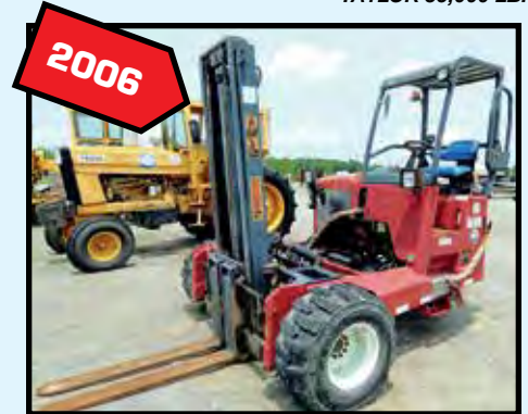
MOFFETT 8,000 LB. CAP. TRUCK MOUNTED FORKLIFT

(4) HYSTER 5,000 LB. CAP., Mdl. H50FT, new 2006–2007, LPG, 3-stage mast, 189" lift height, (Day 4). (4) HYSTER 5,000 LB. CAP., Mdl. S50FT, new 2005–2006, LPG, 3-stage mast, 189" lift height, (Day 4). (2) DREXEL 4,000 LB. CAP. ELECTRIC, Mdl. SL-44-3-ESS, 36 v., swing mast, 198" max. lift, (Day 4). CATERPILLAR 4,000 LB. CAP. Mdl. V-60C (Day 5). HYSTER 3,000 LB. CAP. ELECTRIC, Mdl. E30BS, 36 V, (Day 3).