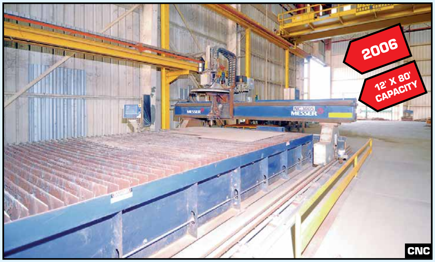
MESSER 5-AXIS CNC PLASMA CUTTER