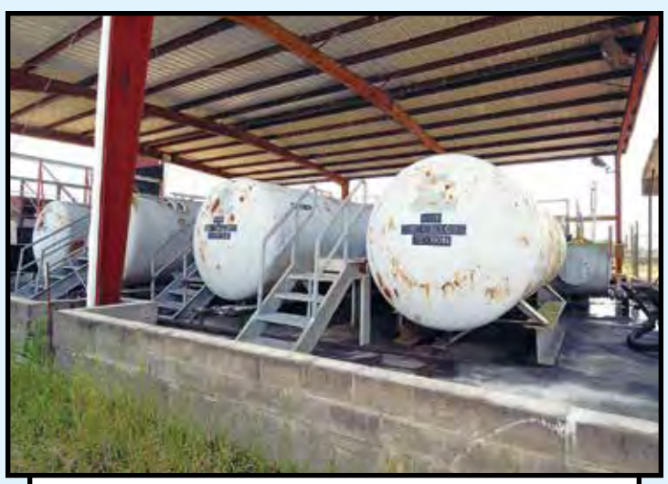
OIL STORAGE AND RECOVERY FACILITY

WIDE ARRAY OF SHOP SUPPORT EQUIPMENT, including: floor jacks, creepers, pole vises, hand tools, ladders, storage racks, workbenches, (Day 3).