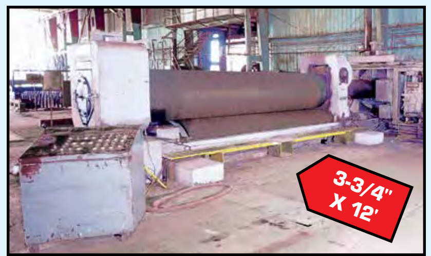
BERTSCH #34 INITIAL PINCH PLATE ROLL