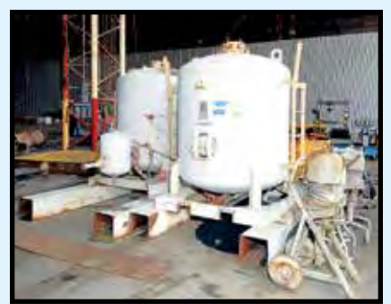
SANDBLAST POTS AND AIRLESS PAINT EQUIPMENT