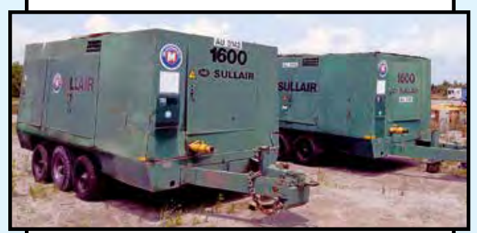
SULLAIR 1600DTCCA PORTABLE DIESEL AIR COMPRESSOR