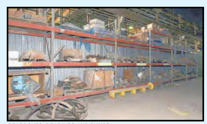
GEARBOXES, BEARINGS AND PUMPS

(350) MOTOROLA HT750 16-CHANNEL RADIOS AND CHARGES, (3) MOTOROLA VETEX 410 16 CHANNEL RADIOS, (Day 1).