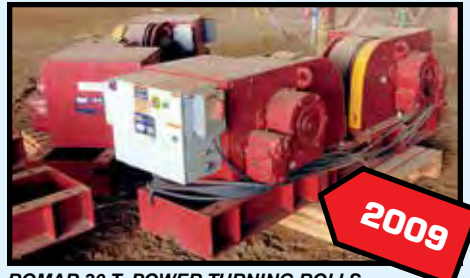
ROMAR 30 T. POWER TURNING ROLLS