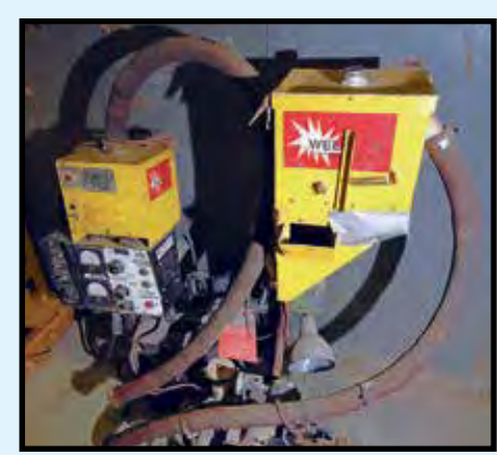
LINCOLN SUBARC WELDING TRACTOR