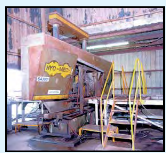
HYD-MECH TS-40 STRUCTURAL BANDSAW

HYD-MECH MDL. TS-40 STRUCTURAL HORIZONTAL, twin column design, 36" rd. cap., 36" x 40" rect. cap., 2" blade size, 70' pwr. roller infeed conveyor w/(6) 30'L. side magazine drag conveyor, 70' outfeed conveyor w/(6) 30' drag conveyor, 15 HP drive motor, (Day 4).