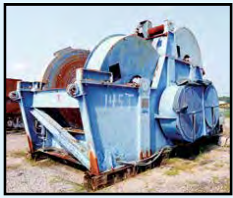
SKAGIT DOUBLE-DRUM DIESEL WINCH