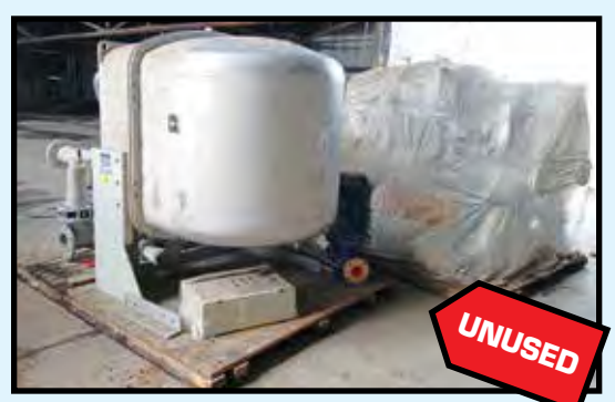
(2) UNUSED ALFA LAVAL WATER-MAKER SYSTEMS