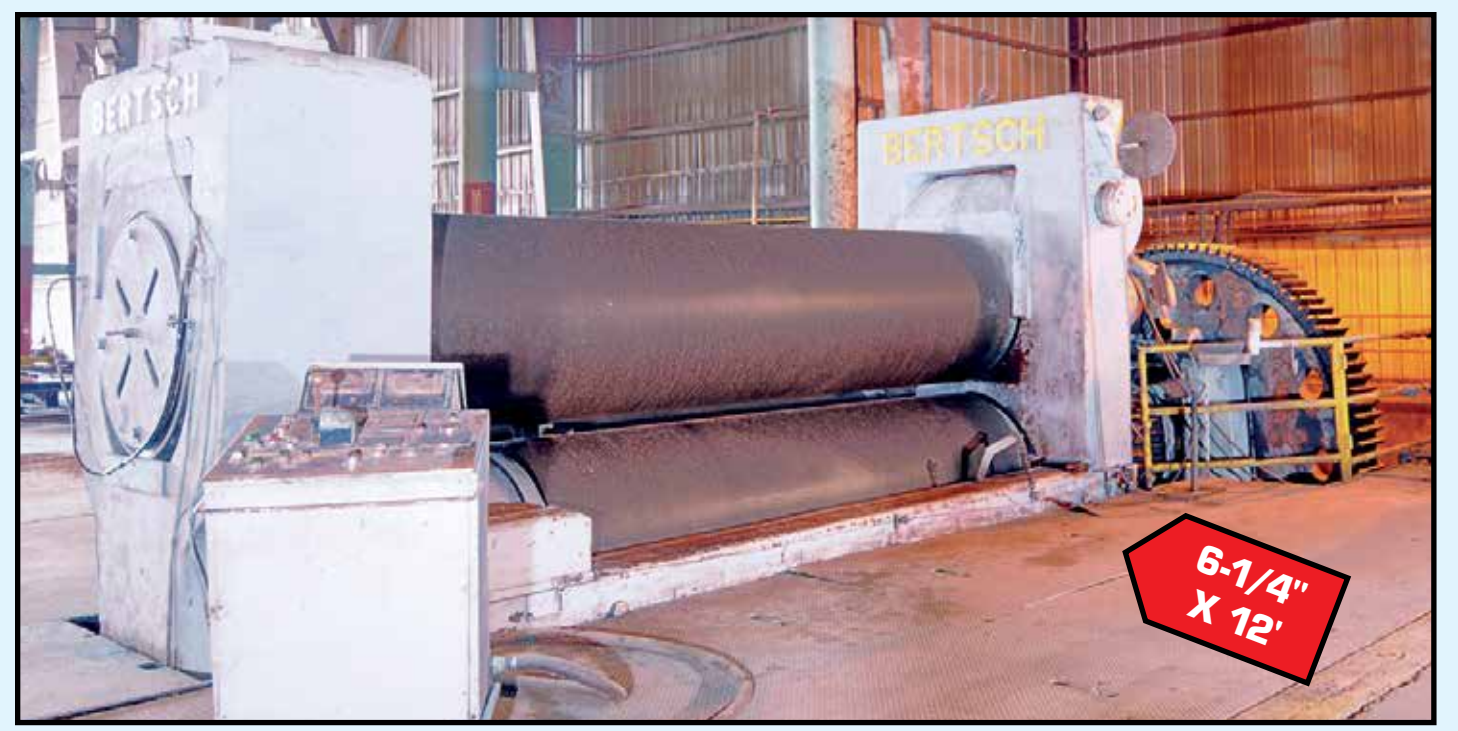
BERTSCH #44 INITIAL PINCH PLATE ROLL