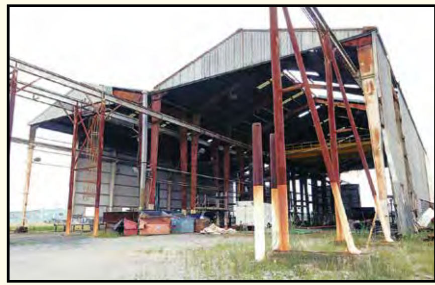
MODULAR CRANE BUILDING FOR REMOVAL

SHAW-BOX 20 T. CAP., dbl. girder, 40' span, 18' ht. under hook, pendant control, (Day 3).