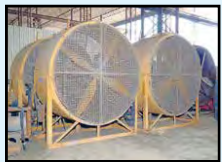
60" RECIRCULATING FANS