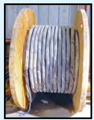
HEAVY ELECTRICAL CABLE