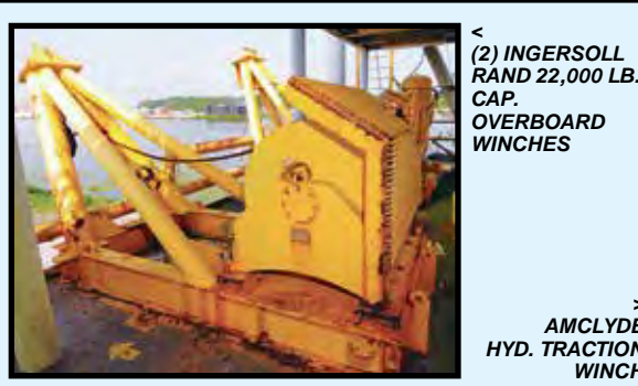
AMCLYDE HYD. TRACTION WINCH