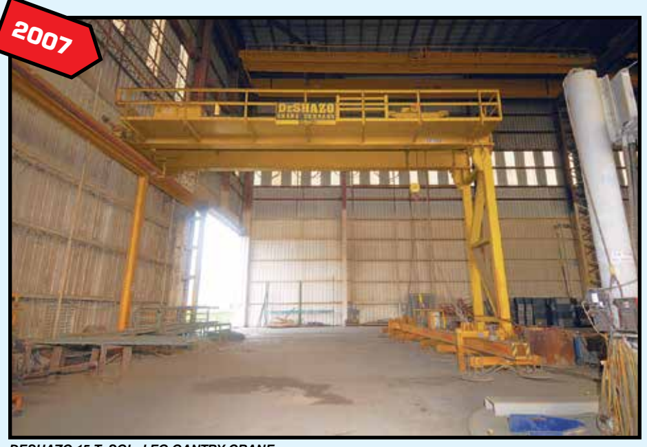
DESHAZO 15 T. SGL. LEG GANTRY CRANE