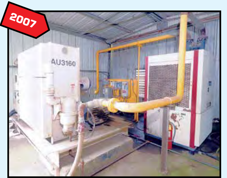
GARDNER DENVER 300 HP COMPRESSOR AND DRYER