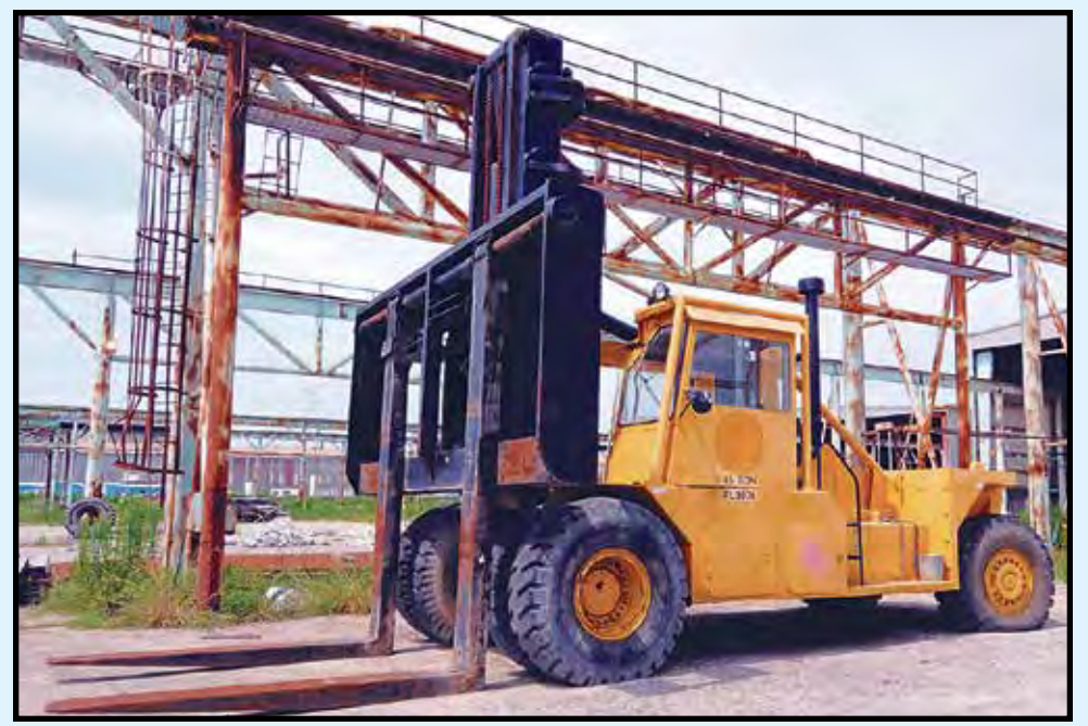
CATERPILLAR 30,000 LB. CAP. DIESEL FORKLIFT