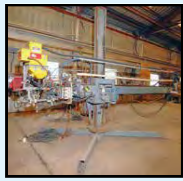
KOIKE ARONSON SUBARC MANIPULATOR