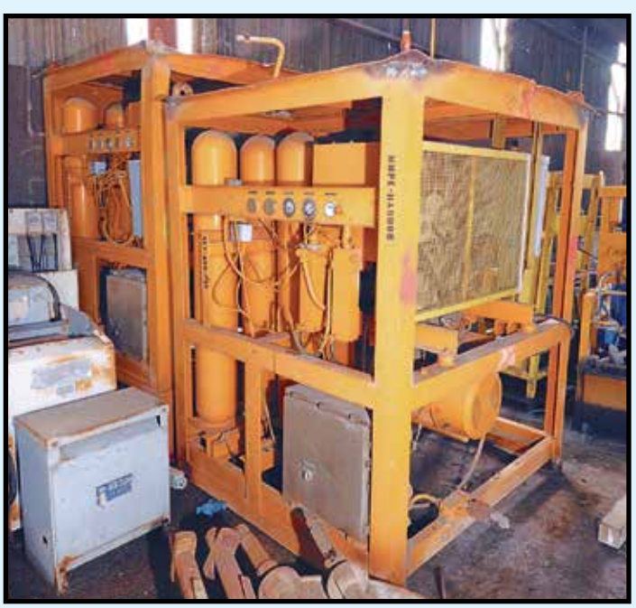
(2) HIGH PRESSURE RECIPROCATING AIR COMPRESSOR SYSTEMS

(2) BAUER MDL. E21.8-90-22.0SZ HIGH PRESSURE RECIPROCATING TYPE, 1,300 PSI output, 40.3 CFM, (8) tubular receivers, (Day 3).