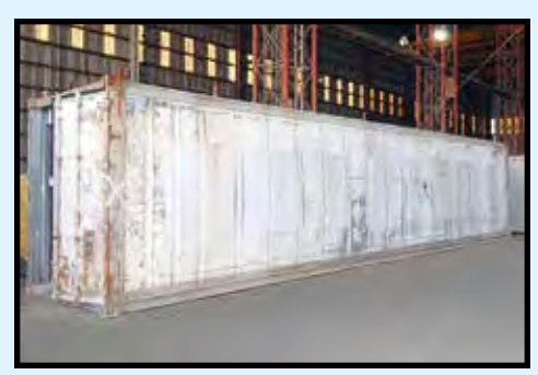
(OVER 70) CONEX STORAGE CONTAINERS