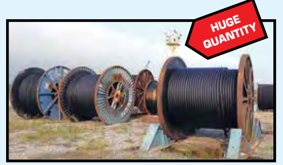
(38) SPOOLS OF MARINE CABLE