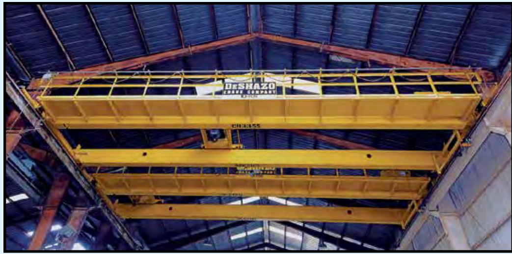
DESHAZO 10 T. DBL. BOX GIRDER BRIDGE CRANE

(2) UNKNOWN MANUFACTURER 10 T. CAP., 38' span, 22' ht. under hook, pendant control, (Day 2).