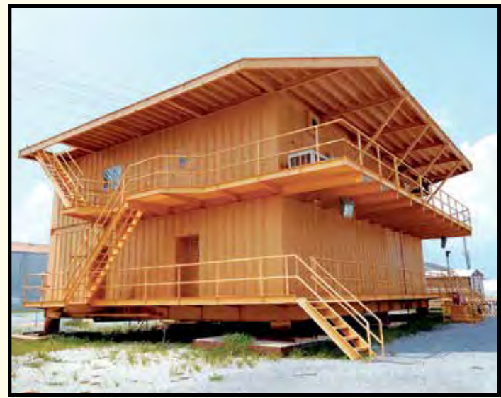
PORTABLE OFFICE BUILDING

SHAW-BOX 1 T. CAP., sgl. girder, 39' span, 19' ht. under hook, pendant control, (Day 3).