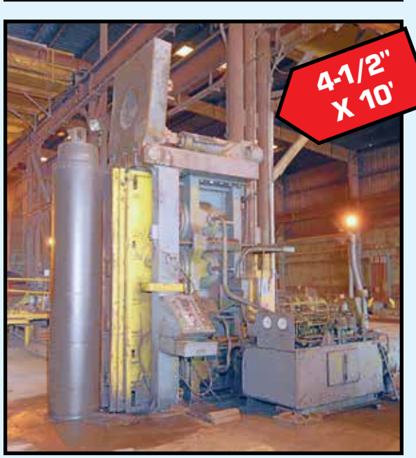
HUGH SMITH 2,000 T. VERTICAL BENDING ROLL

HUGH SMITH 6' VERTICAL HYDRAULIC, new 1971, 400 T. cap., S/N C-27257, (Day 2).