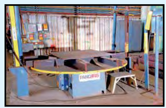
PANDJIRIS MDL. MT200-12VS, 20,000 LB. CAP. WELDING TURNTABLE