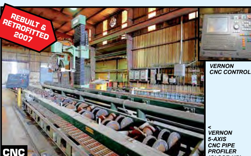
VERNON 5-AXIS CNC PIPE PROFILER (CLOSE-UP)