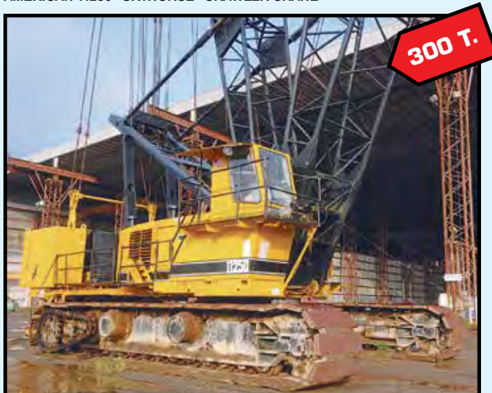
AMERICAN 11250 "SKYHORSE" CRAWLER CRANE