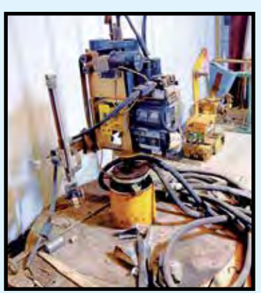
(1 OF 3) CYPRESS ROTARY SUBARC WELDERS

LINCOLN SUBARC WELDING TRACTOR, (Day 3).