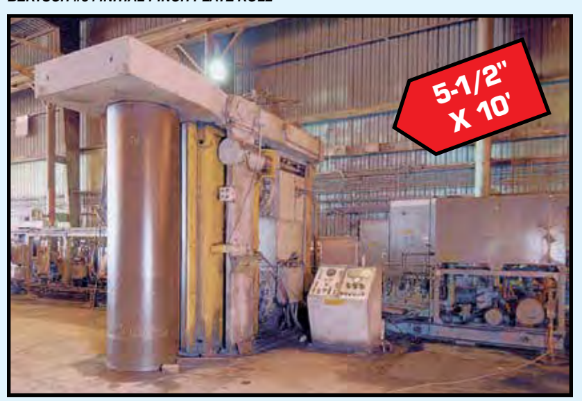
HUGH SMITH 3,000 T. VERTICAL PLATE ROLL