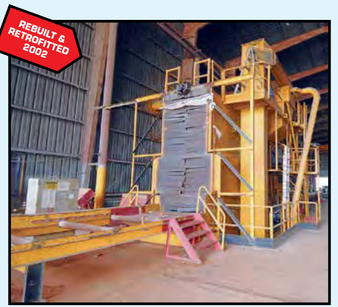
PANGBORN/BLASTEC STRUCTURAL BLAST MACHINE