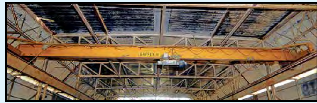
GAFFEY 10 T. SGL. GIRDER OVERHEAD BRIDGE CRANE

GAFFEY 5 T. CAP., sgl. girder, 38' span, 24' ht. under hook, pendant control w/ Shaw-Box hoist,. (Day 2).