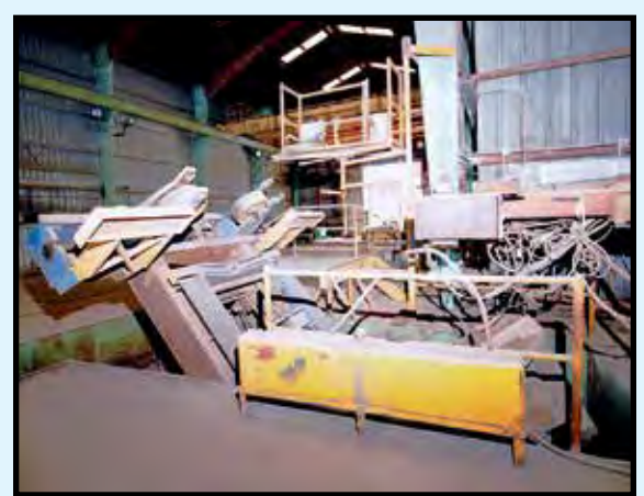
CONE WELDING TILT FIXTURE