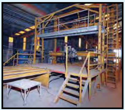
CUSTOM BUILT SIDE BEAM SUBARC WELDER