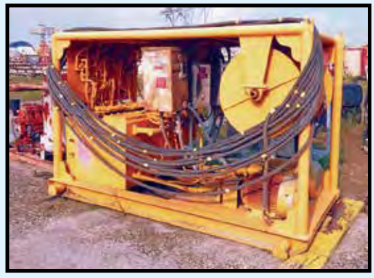
HYDRAULIC POWER UNIT FOR JACKING SYSTEMS