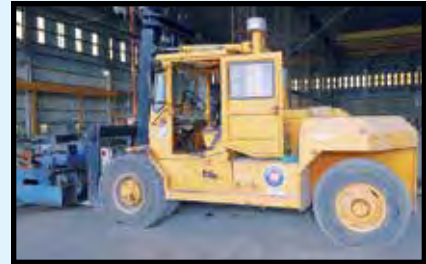
TAYLOR 30,000 LB. CAP. DIESEL FORKLIFT