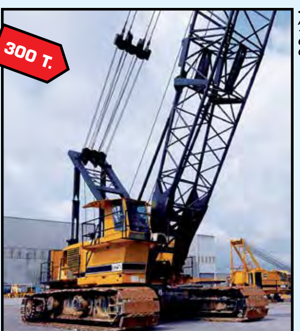
AMERICAN 11250 CRAWLER CRANE

TREMENDOUS SELECTION OF REPAIR PARTS FOR AMERICAN 11250 AND 9260 CRAWLER CRANES, including complete crawler pad assemblies (for rebuild), side frames, sprockets, bearings, elec. and hyd. components, belts, hoses and fittings, valves, motors, engine parts, repair tools, blocks, sheaves and ball blocks, (Day 3).