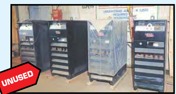
UNUSED LINCOLN AC-1200 POWER SUPPLIES