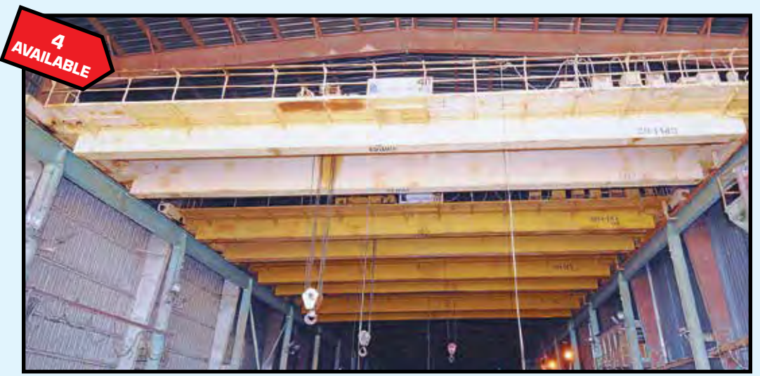
LANDEL 40 T. OVERHEAD BRIDGE CRANES

This brochure is a partial listing of equipment offered in this tremendous 5-day sale. Please visit our website at www.pmi-auction.com for detailed specifications and additional photos.