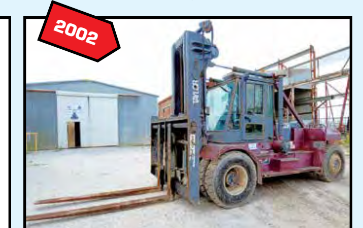
TAYLOR 35,000 LB. CAP. DIESEL FORKLIFT

CLARK 5,600 LB. CAP. , Mdl. C500Y-S60, gasoline, 2-stage mast, 140" max. lift, (Day 5) .