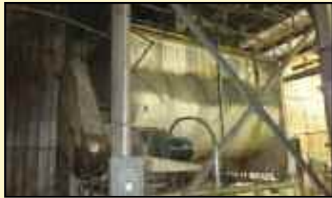
SCOTT 100-HP PADDLE / RIBBON DRY MATERIAL MIXER