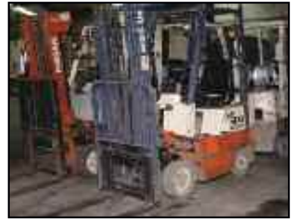
(20+) NISSAN, HYSTER & CLARK FORKLIFTS TO 12,000-LBS.