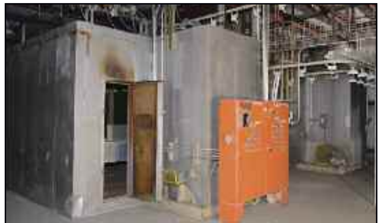
RANSBERG / INDUSTRIAL HEAT & FINISH 350° FLOW COAT LINE TOP COAT OVEN