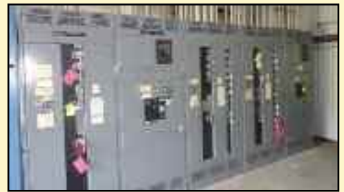
MAIN ELECTRICAL SERVICE EQUIPMENT & WIRE