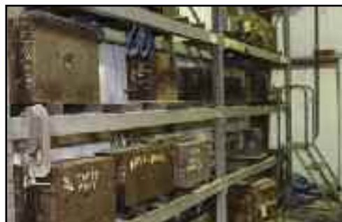
OVER 1,000,000-LBS. SCRAP DIES, MACHINES, ELECTRIC MOTORS

Drafting Tables • Print Files • Furniture • Computers • Printers • Copiers • Kitchen Equipment