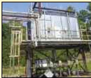
MARLEY NC SERIES WATER TOWER