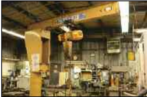
CONTRX 3-TON PEDESTAL JIB CRANE