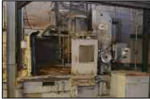
BLANCHARD ROTARY SURFACE GRINDER