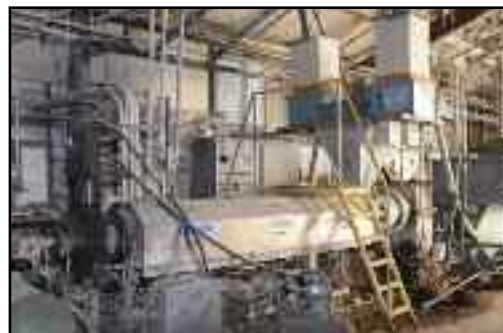
HARTIG SCREW TYPE EXTRUDER