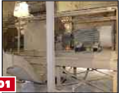
(4) BLISS ELIMINATOR 300-HP HAMMER MILLS