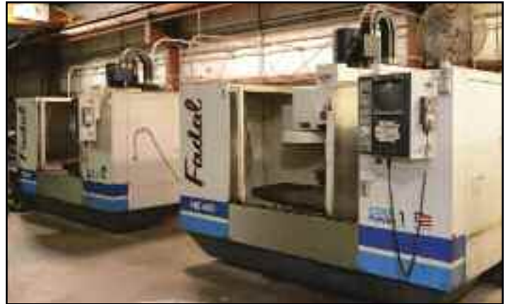
EXTENSIVE TOOLROOM FACILITIES