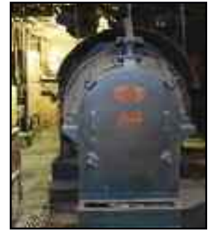
DENVER HI-FLO BLENDER