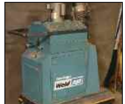
AERCOLOGY WELD AIR FUME COLLECTOR