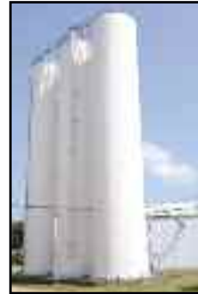
(3) PLASTIC PELLET STORAGE SILOS