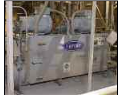
CARRIER ECOLOGIE CHILLER

(4) WULFTEC WHP-200 Auto Stretch Wrappers, 50" x 50" Platform (2) SIGNODE SG-210 Spiral Grip Stretch Wrappers, 48" x 48" Platform DOUGLAS MACHINE Automated Cartoner & Case Sealing Machine, 17"L x 15"W Gated Plastic Conveyor, Automatic Box Loading & Sealing, Case Stacking & Sealing, Labeler,