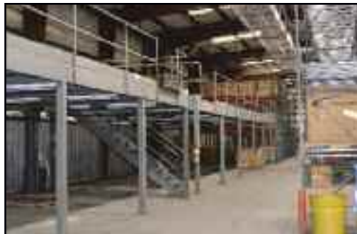
WILDECK 108' X 17'W MEZZANINE