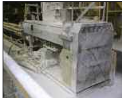
NRM PACEMAKER III EXTRUDER