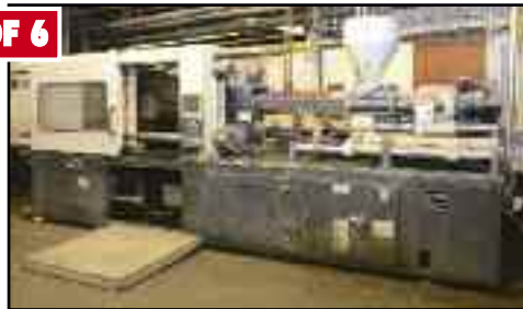
(6) CINCINNATI MILACRON 300-TON / 29 OZ.