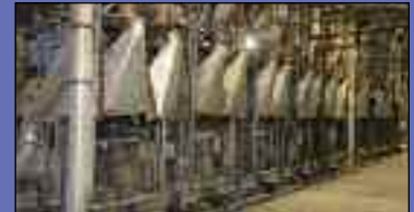
(175+) WABASH, WILLIAM WHITE & FRENCH COMPRESSION MOLDING PRESSES

PRE-SORT FIRST CLASS U.S. POSTAGE PAID CINCINNATI, OHIO PERMIT NO. 5714 FIRST CLASS MAIL!