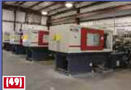
(49) PLASTIC INJECTION MOLDING MACHINES TO 1000-TON / 165 OZ.

Myron Bowling Auctioneers P.O. BOX 369 ROSS, OHIO 45061