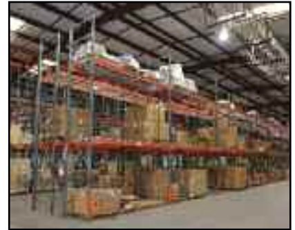
40-SECTIONS 12' X 42" X 18' PALLET RACK