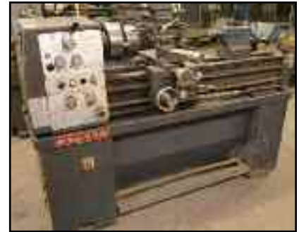
ENCO 13" X 36" ENGINE LATHE