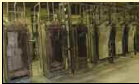
(96) HYDRAULIC COMPRESSION MOLDING PRESSES