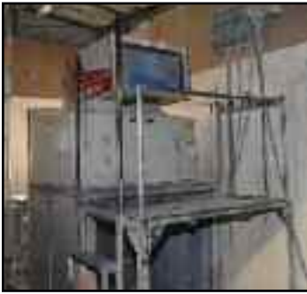
CUMBERLAND 100-HP GRANULATOR