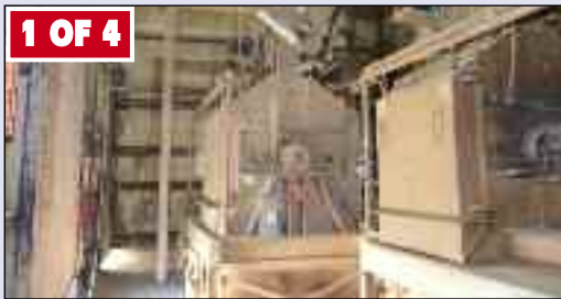
(4) BLISS ELIMINATOR 300-HP HAMMER MILLS

Inspection: Day Prior to Auction from 9AM-4PM