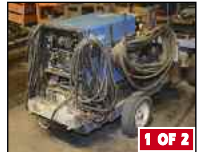
(2) MILLER BOBCAT 225G WELDERS