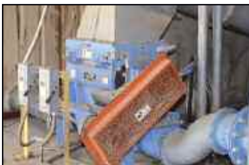
RADER BLOWER SYSTEM