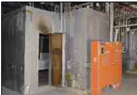
RANSBERG / INDUSTRIAL HEAT & FINISH 350° FLOW COAT LINE TOP COAT OVEN