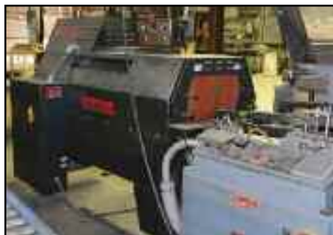
EXTREME SHRINK TUNNEL