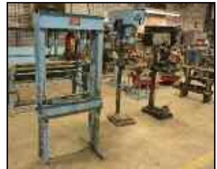
LARGE ASSORTMENT OF SHOP TOOLS