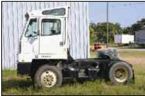
CAPACITY YARD TRACTOR