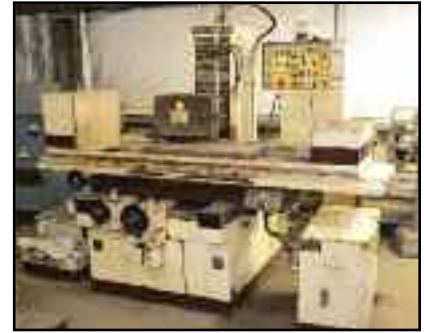
CHEVALIER 16" X 32" SURFACE GRINDER