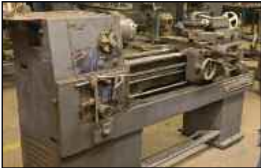
ENTERPRISE 15" X 40" ENGINE LATHE