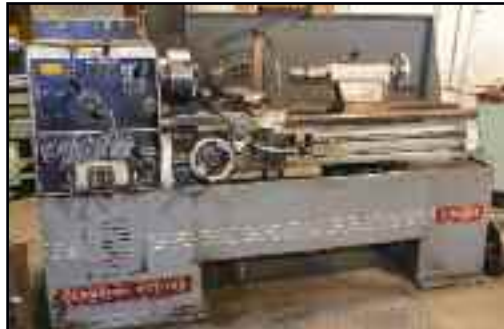
CLAUSING-METOSA 15" X 45" ENGINE LATHE