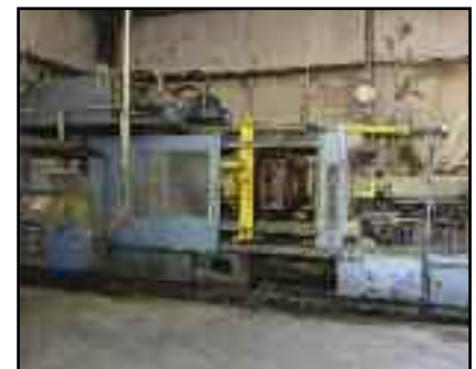
LARGE SCRAP OPPORTUNITY OF OLDER PLASTIC INJECTION MOLDERS