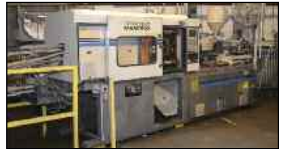
CINCINNATI MILACRON VISTA SENTRY 165-TON / 13 OZ.