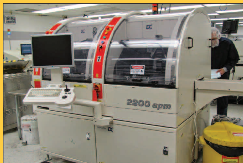
Datacon PPS2200apm Dual Gantry Fully Auto. Die Bonder. S/N 95022230878, Mfg. Date 2001