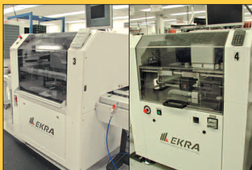
(1) EKRA X4 S/N X4010057, (2) X5 Screen Printers., S/N's 801101, 801103. All 2005 Vintages