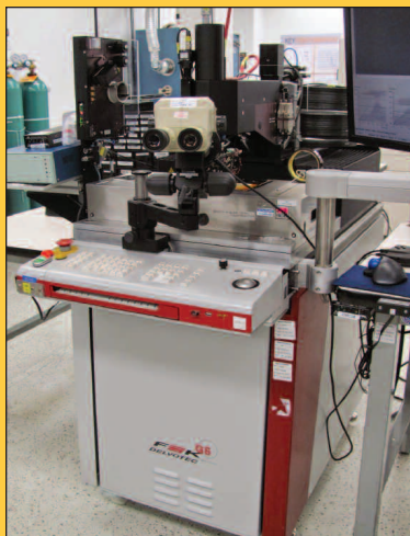
F&K DELVOTEC G5 Fully Auto. Hybrid Wire Bonder. S/N 5155, Mfg. Date 2008