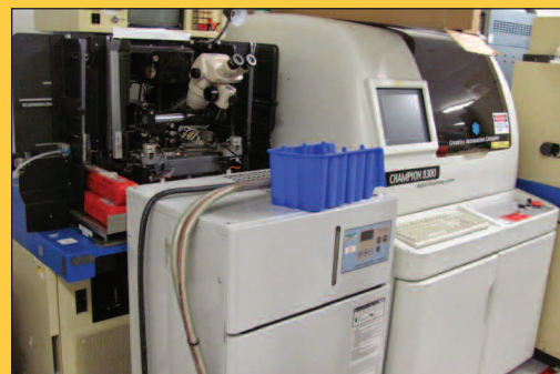
Creative Automation Company Champion 8300 Digital Epoxy Dispensing System

Online Bidding Available, Visit www.biditup.com for Complete Registration Information