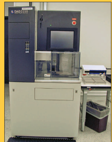
Disco DAD3350 Fully Automatic 200mm Wafer Dicing Saw. S/N KB2577, Mfg. Date 2012