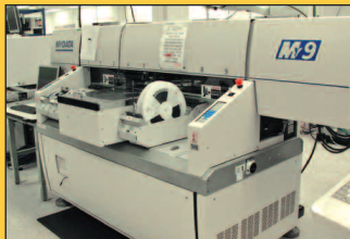
MYDATA MY9 Chip Placement System, S/N 5412, Mfg. Date 11/2004

FEATURING: Disco Saw, Dataconn Bonders, Ekra Screen Printers, K&S Bonders, MYDATA Chip Placement Systems, BTU Reflow Furnace, Sikama Reflow/Cure Systems and Much More