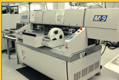
MYDATA MY9 Chip Placement System, S/N 5412, Mfg. Date 11/2004

OVER $1 MILLION OF INVENTORY & CUSTOMER LISTS AVAILABLE