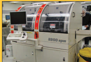
Dataconn PP52200apm Dual Gantry Fully Auto. Die Bonder. S/N 95022230878, 2001