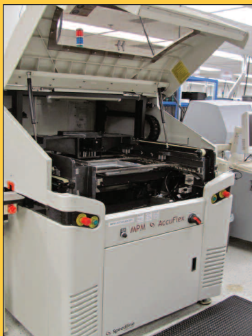
MPM Accuflex Automatic Screen Printer, S/N AFMMI-100217