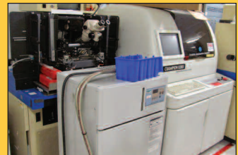
Creative Automation Company Champion 8300 Digital Epoxy Dispensing System

BIDITUP BIDITUP AUCTIONS WORLDWIDE AN INDUSTRIAL ASSETS COMPANY 11426 Ventura Boulevard Studio City, California 91604 Phone: 818.508.7034 Fax: 818.508.3025 info@biditup.com