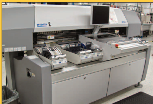
MYDATA MY100-SX Auto. Chip Placement System, S/N 100044, Mfg. Date 2010