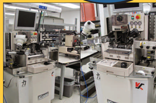
Kulicke and Soffa Iconn Auto. Gold Ball Bonder w/all options. S/N SAHS-ST 32094, Mfg. 2/2013