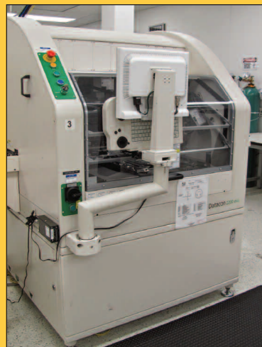
Dataconn 2200APM+ Single Gantry Auto. Die Bonder. S/N 95022141103, Mfg. Date 2003