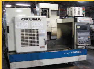
Okuma MX-45VBE CNC VMC