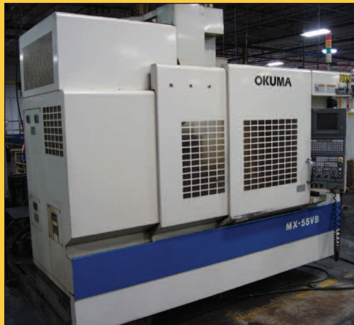
Okuma MX-55VB CNC Vertical Milling Machine