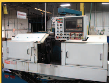
Toyoda GL6P-32 CNC Cylindrical Grinder