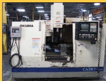
Okuma Cadet ES-V4020 Vertical CNC Milling Machine