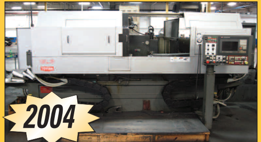
Toyota GL6P-100 CNC Cylindrical Grinder

Online Bidding Available, Visit www.biditup.com for Complete Registration Information