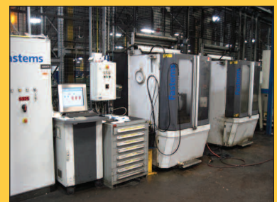
View of Fastems Automatic Loading System