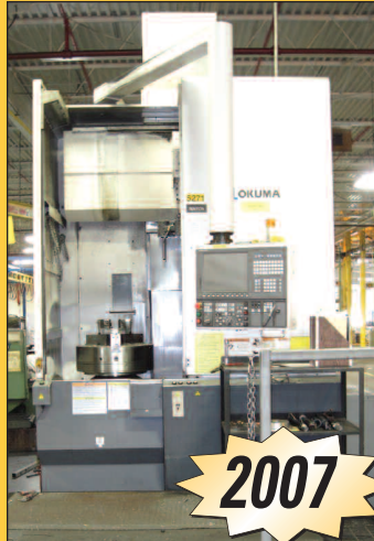
Okuma V80R CNC Vertical Lathe