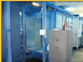
Nordson Powder Coat Line