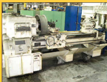
Monarch 20inch Lathe