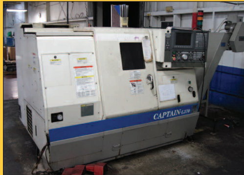
Okuma Captain-L370 CNC Turning Center