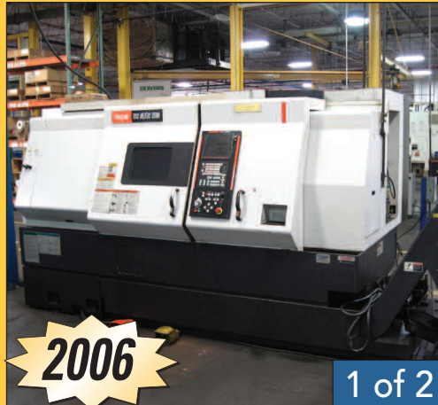
Mazak QTN-350M CNC Turning Center