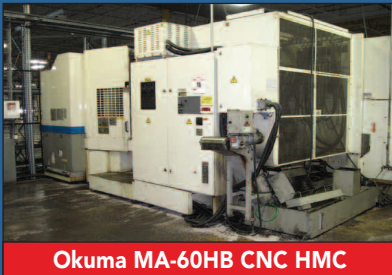
Okuma MA-60HB CNC HMC