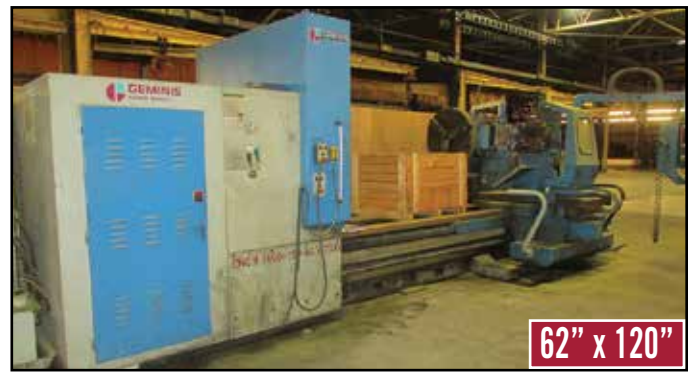
GEMINIS 62" x 120" CNC Turning Center