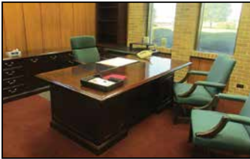
Assorted Office & Conference Room Furniture