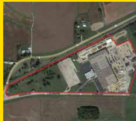
Real Estate Offered for Sale at Noon 236,500 SF Manufacturing Facility on 40.13 Acres