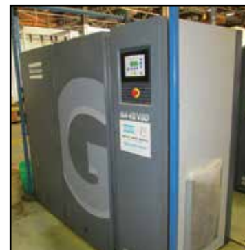
ATLAS COPCO FD300 Air Dryer Unit