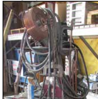
THERMAL ARC Fabstar 4030 MIG Welder