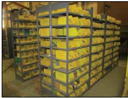
Large Assortment of Hand, Air & Power Tools, Nuts, Bolts, Fittings & More