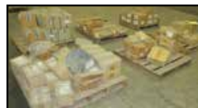
1,000s of New BOMAG Equipment Parts — Never Installed