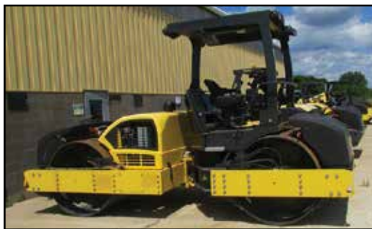
BOMAG BW278AD-5 Tandem Vibratory Roller