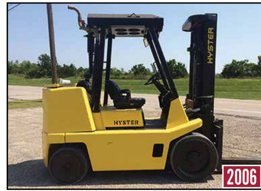
2006 HYSTER S155XL2 15,500-lb. Forklift