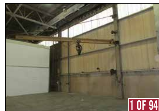
(94) 1-Ton & 2-Ton Column-Mount Jib Cranes