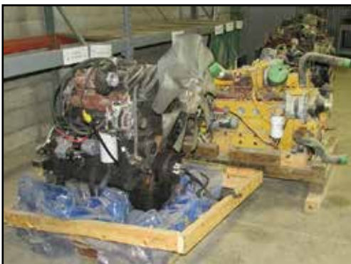
(7) CUMMINS Engines to 205-HP