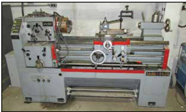
VICTOR 1640 Engine Lathe