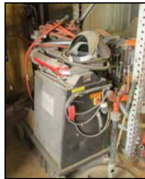
JANCY JB2400 Tube Bender