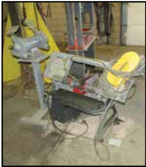
WELLSAW 9" x 12" Horizontal Band Saw