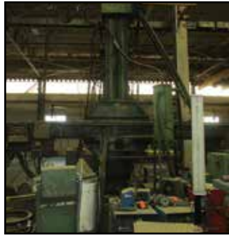
RANSOME Welding Positioner / Manipulator