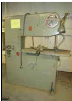
DOALL 36" Vertical Band Saw