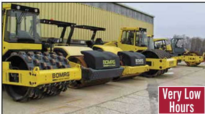
(5) BOMAG Vibratory Tandem & Single Drum Rollers