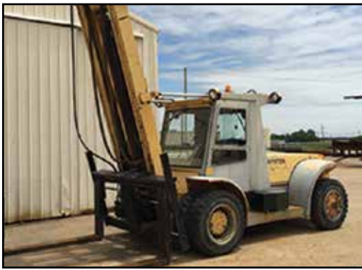
HYSTER H250H 24,000-lb. Forklift