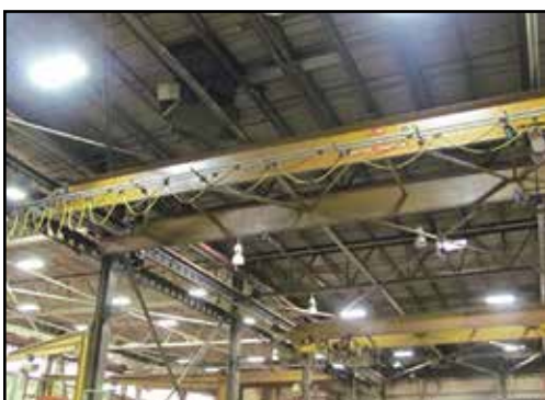
(2) CONCO 15-Ton x 60' Span Bridge Cranes