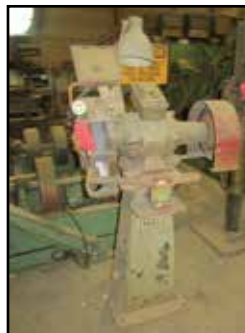
8" Pedestal Grinder