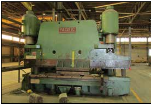
PACIFIC 1,000-Ton x 16' Hydraulic Press Brake