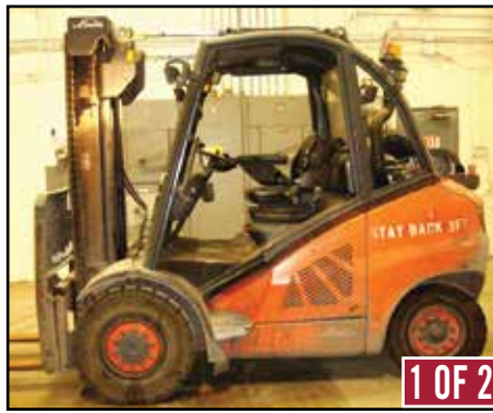
(2) 2009 LINDE H45T 9,000-lb. Forklifts