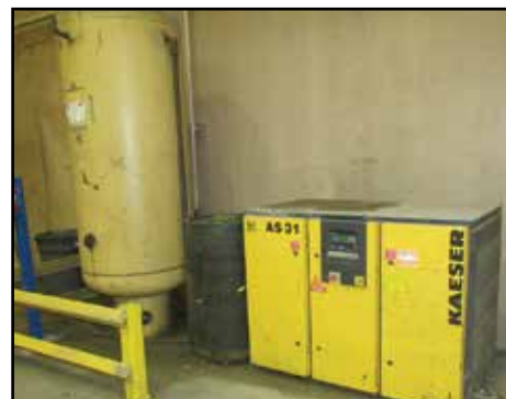
KAESER AS31 Rotary Screw Air Compressor