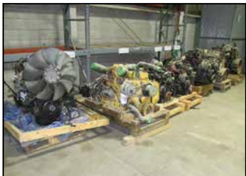
(7) CUMMINS Engines to 205-HP