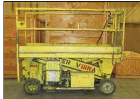
HYSTER V18NA Electric Manlift Platform