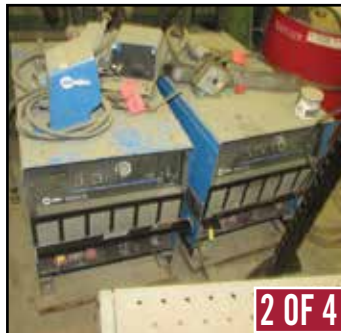
(4) MILLER Deltaweld 652 & 651 Welders