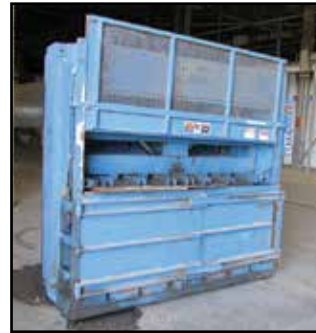
GPI 3' x 6' Hydraulic Cardboard Compactor