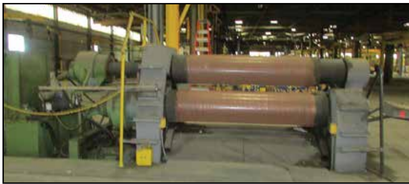
STOLTING 3-Roll Hydraulic Plate Bending Roll