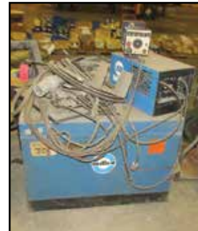
MILLER MP65E Welder & Wire Feed