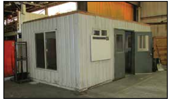
(7) Portable Shop Offices, various sizes