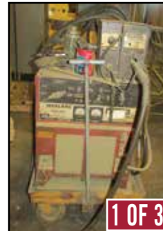
(3) LINCOLN Idealarc R35 DC Welders