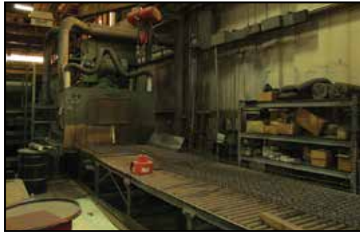
WHEELABRATOR Plate Shot Blast Unit