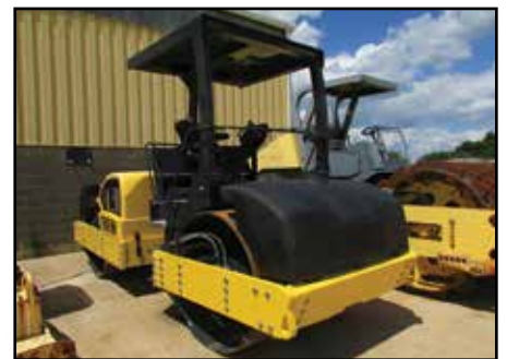
BOMAG BW266AD-5 Tandem Vibratory Roller