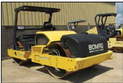
BOMAG BW278AD-4 Tandem Vibratory Roller