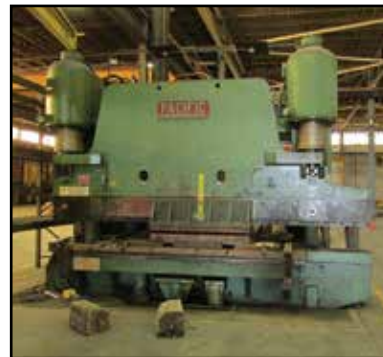
PACIFIC 1,000-Ton x 16' Hydraulic Press Brake