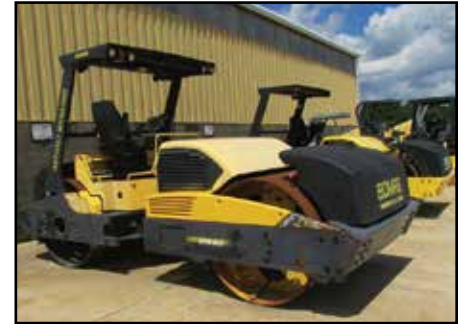
BOMAG BW278AD-4AM Tandem Vibratory Roller