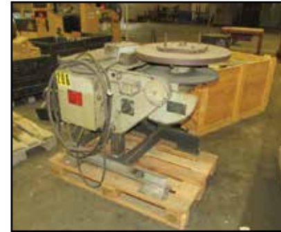
ARONSON 2,000-lb. Welding Positioner