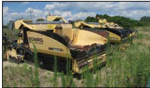
(5) BOMAG BF6615 Asphalt Pavers