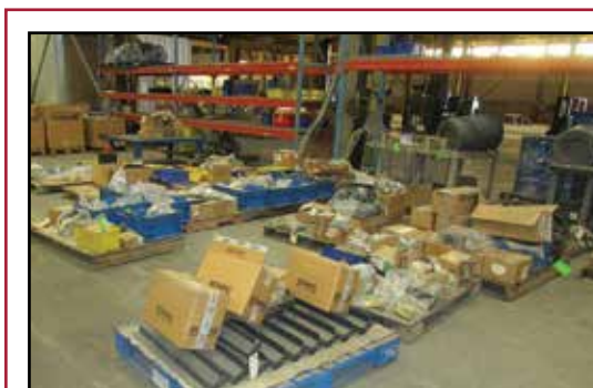
1,000s of New BOMAG Equipment Parts — Never Installed