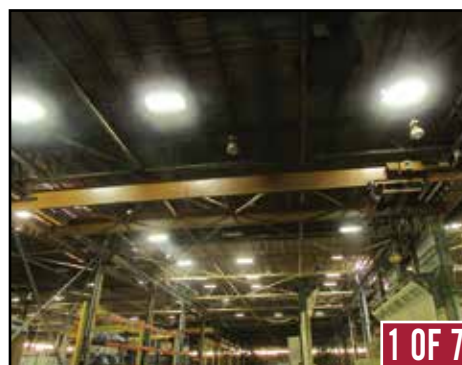
(7) WHITING-TRAM BEAM 7-1/2 Ton x 50' Span Bridge Cranes