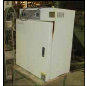
DESPATCH LBB Series 24" x 22" x 12" ID Oven