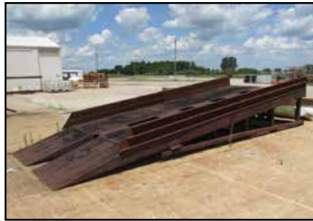
(2) 10' x 20' Portable Loading Docks