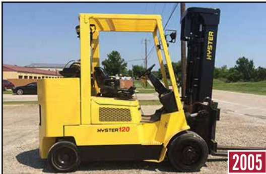
2005 HYSTER S120XM 12,000-lb. Forklift