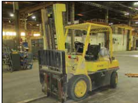
HYSTER 6,000-lb. Forklift