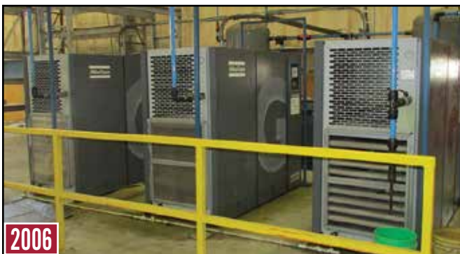
(3) 2006 ATLAS COPCO GA45 VSD Rotary Screw Air Compressors