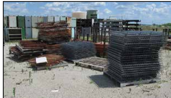
Lots of Miscellaneous Pallet Racks