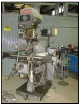
BRIDGEPORT 5-HP Series II Vertical Mill