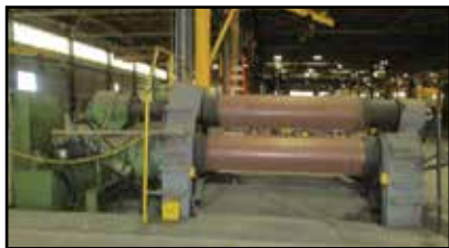
STOLTING 3-Roll Hydraulic Plate Bending Roll

PERSORTED FIRST CLASS MAIL U.S. POSTAGE PAID CINCINNATI, OH PERMIT NO. 5714