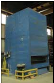
REMSTAR Industrier 251 Vertical Storage Unit