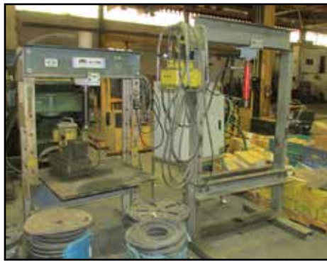
OTC 55-Ton & ENERPAC 10-Ton H-Frame Presses