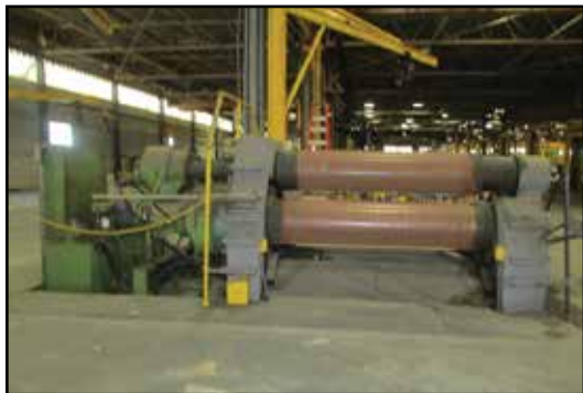
STOLTZ 3-Roll Hydraulic Plate Bending Roll

236,500 SF Manufacturing Facility on 40.13 Acres