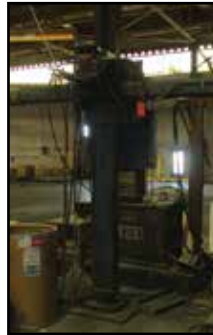
PANDJIRIS Welding Manipulator