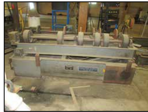
PRESTON-EASTIN Tank Turning Rolls