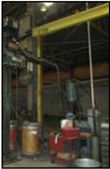
RANSOME Welding Manipulator/Seam Welder