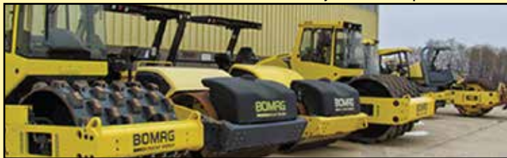
(5) BOMAG Vibratory Tandem & Single Drum Rollers, (New Machines, Never Used)