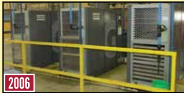
(3) 2006 ATLAS COPCO GA45 VSD Rotary Screw Air Compressors