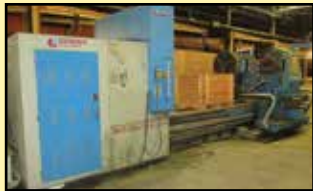
GEMINIS 62" x 120" CNC Turning Center