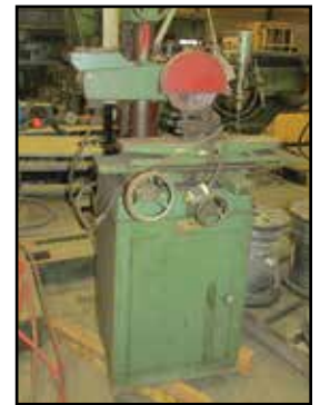
DELTA ROCKWELL Cutoff Saw