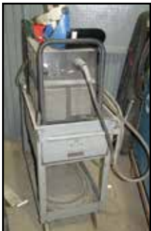
THERMAL DYNAMICS Cutmaster 81 Plasma Cutter