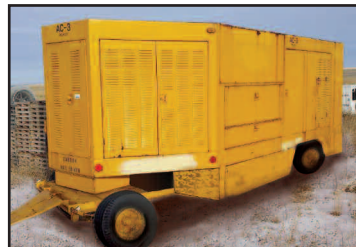
ACE Air Condition Cart, Mdl. 406-322