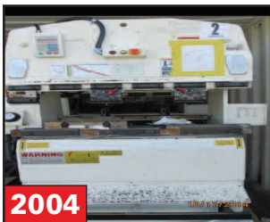
Amada RG35S Press Brake