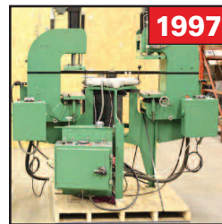
MPI 12T Paste Wax Press