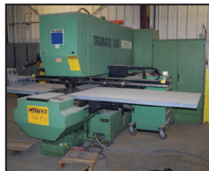
Trumpf 28 ton Rotary Punch Press