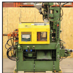
Newberry 50 ton Plastic Press