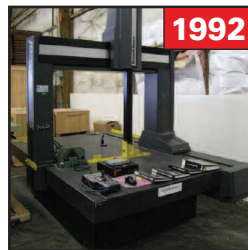
Brown & Sharpe CMM, Mdl. XCEL

Views of ALD Vacuum Arc Titanium Skull Casting Furnace, Model L50SM