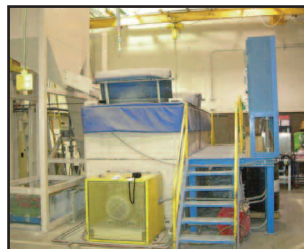
Royson 115BT Vibratory Finisher