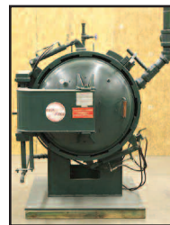
WSF Industries Autoclave