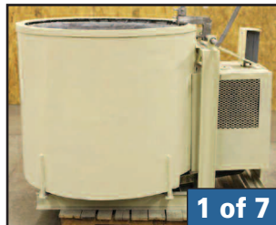
Shell-O-Matic Slurry Tanks