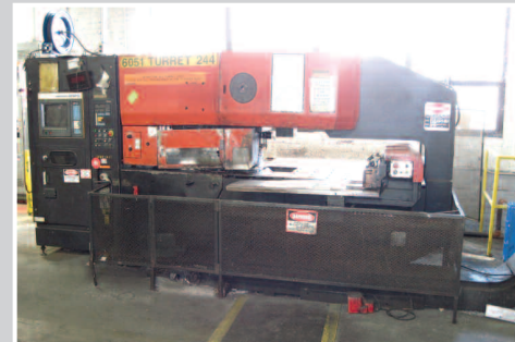
AMADA Turret Punch