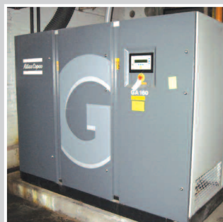
ATLAS COPCO Air Compressor