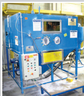
LAMEF Shot Blast