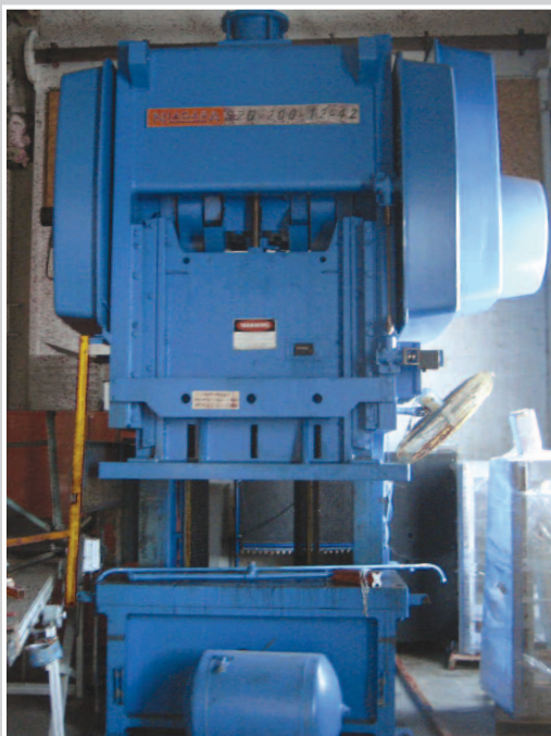
NIAGARA S2G-200-12-42 Gap Frame Press