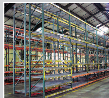
View of Pallet Racking