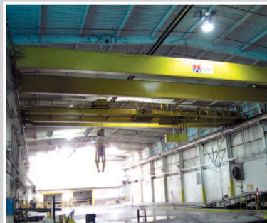
View of Cranes