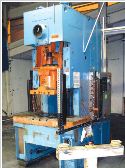
AIDA 80-Ton C1-8 Gap Frame Press