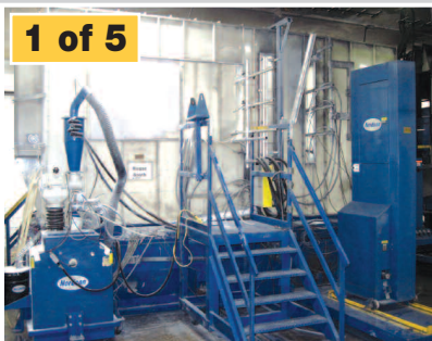
1 of 5 NORDSON Paint Booth