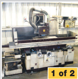
1 of 2 CHEVALIER Surface Grinder