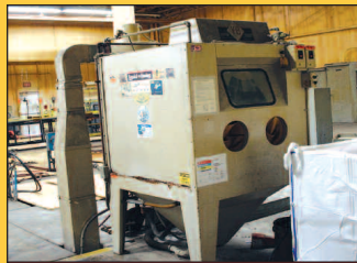
Vapor Blast Cabinet

Furnaces, Ovens, Kilns, Boilers, Welders, Disintegrators, Riveters, Cranes, Rolling Stock, Toolroom & Inspection & Lab Equipment & Much More!