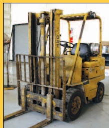
Hyster Forklift 15k Cap.

Online Bidding Only, Visit www.biditup.com for Complete Registration Information