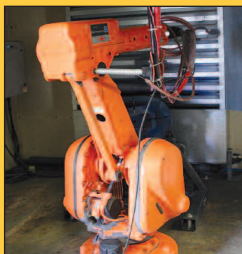
ABB Robotic Welding Cell