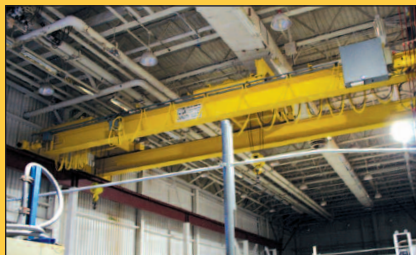
National Hoist & Equip. Dual 7.5 Ton Hoist

MISCELLANEOUS EQUIPMENT: Over 1200' of R8-Vinyl Insulated (Inswall) Curtain Wall System 25' High x 5' Panels • 4 Power Roll Up Doors (Over $250k New) • Office Furnishings • Restaurant Style Kitchen Equipment • Racking • Vidmar Cabinets • Large Quantity of Bearings • Plating Tanks • Steel Stock • X-Ray Room • Marathon Compactor • Large Quantity of Maintenance/Spares Parts Inventory • Waste Water Treatment System & Much More