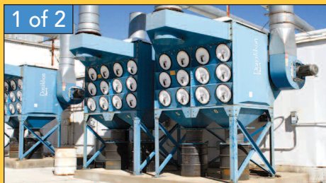
Donaldson Torit Dust Collectors