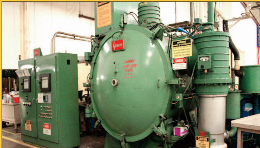
Ipsen Vacuum Furnace, Mdl. VFC-924-R

Surplus Assets of: Premier TURBINES BBA Aviation