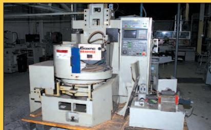
Okamoto CNC Rotary Grinder