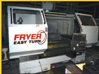
Fryer CNC Gap Bed Lathe