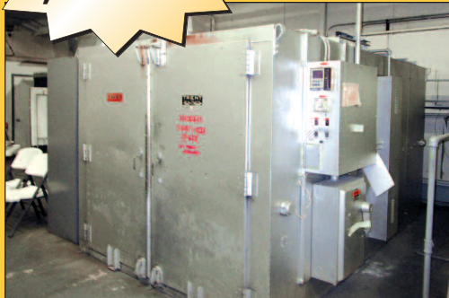
6' x 10' x 6' Trent Burn-Off Oven