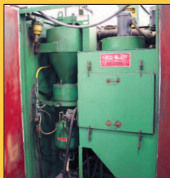
Vacu Blast Cabinet