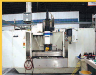
Fadal VMC, Mdl. 6030

Online Bidding Only, Visit www.biditup.com