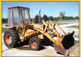
Case CK 580 B Tractor

BIDITUP BIDITUP AUCTIONS WORLDWIDE AN INDUSTRIAL ASSETS COMPANY 11426 Ventura Boulevard Studio City, California 91604 Phone: 818.508.7034 Fax: 818.508.3025 info@biditup.com