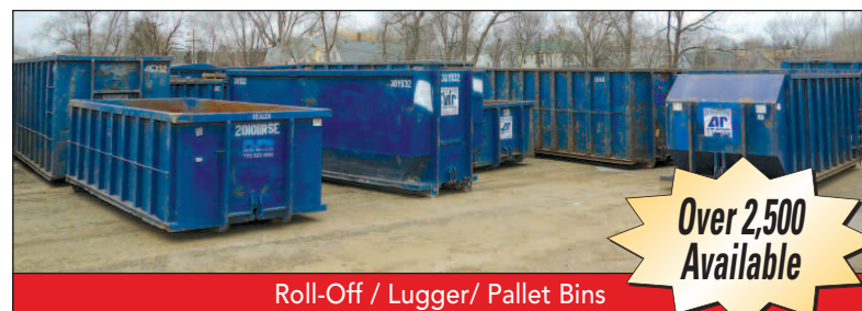
Roll-Off / Lugger / Pallet Bins