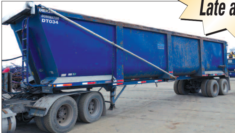
End Dump Trailers