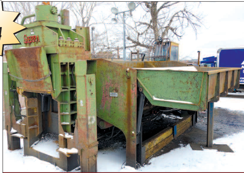
Sierra Shear Baler