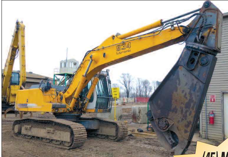
Liebherr 934 w/Shear