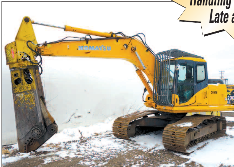
Komatsu DL 200 w/Shear

(45) Material Handling Excavators Late as 2010