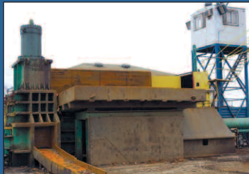
Harris TG 229 Baler