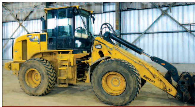
2008 CAT 930H Wheel Loader