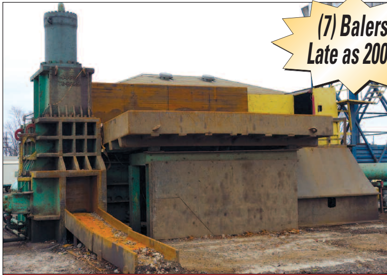
Harris TG 229 Baler