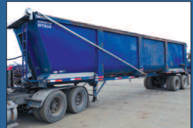
End Dump Trailers to 2012