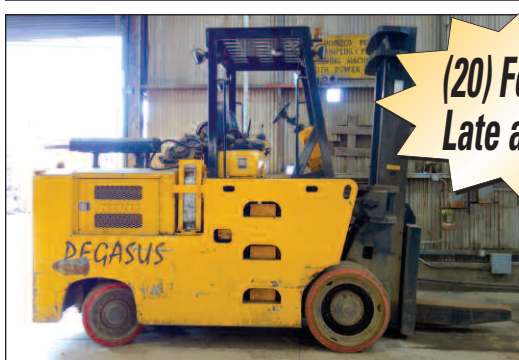
Rico Pegasus 500 50,000-Lb. Cap. Forklift