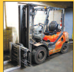
(20) Forklifts Available