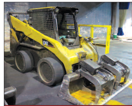
(13) Skid Steer Loaders Available

TO SCHEDULE AN AUCTION OR APPRAISAL CALL 818.508.7034