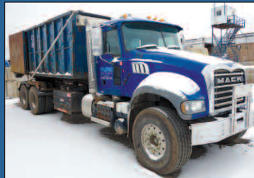
Mack Roll-Off Truck to 2013