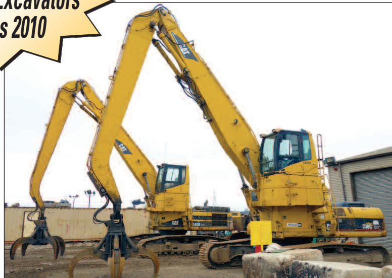
View of Material Handling Excavators w/Grapples, Magnets & Shears