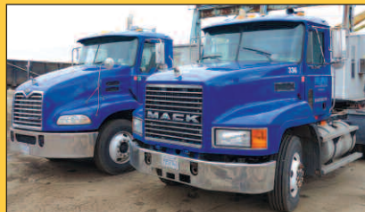
Mack Truck Tractors to 2009