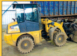
2009 CAT 940H Wheel Loader