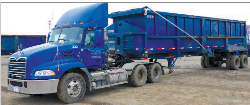
Mack Truck Tractor / Gondola Trailer