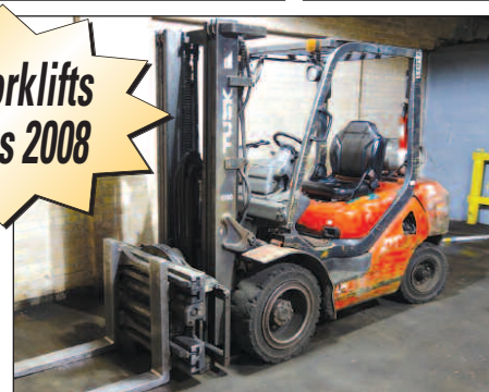
Tusk 600-PGH-16 6,000-Lb. LPG Forklift