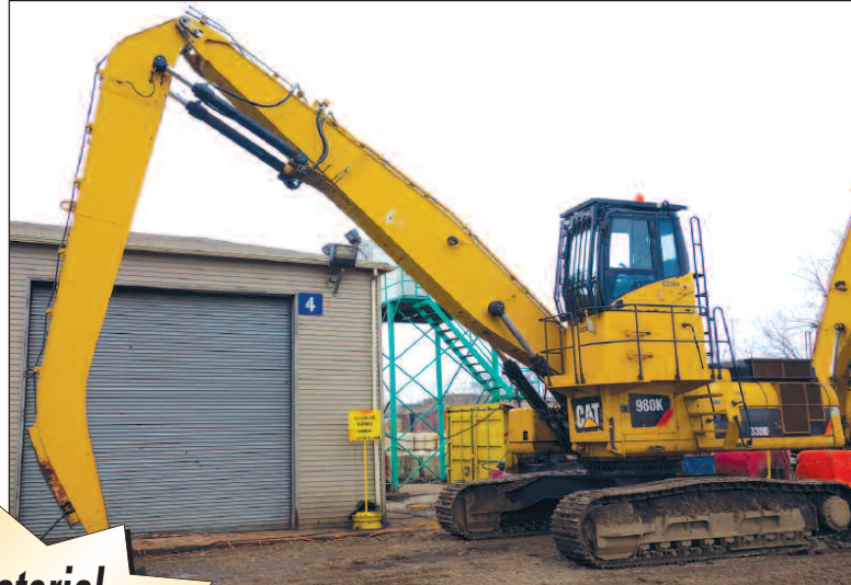
CAT 330D Material Handling Excavator

(45) Material Handling Excavators Late as 2010