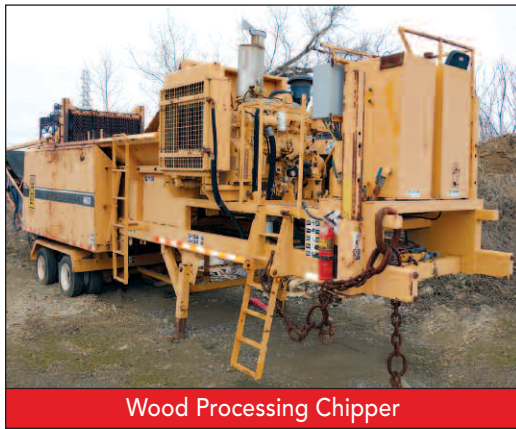
Wood Processing Chipper