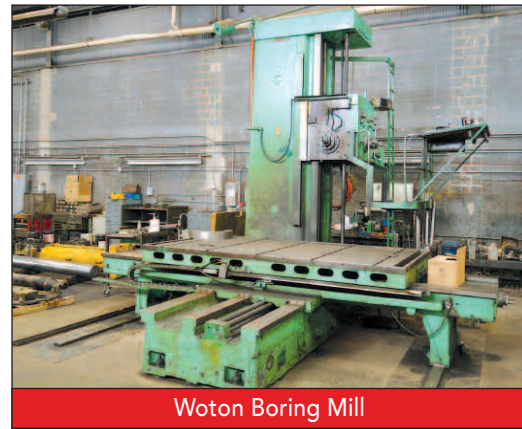
Woton Boring Mill