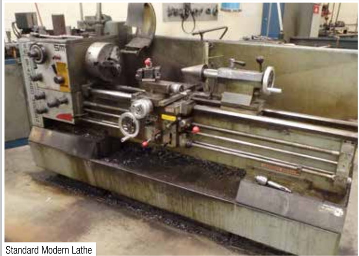
Standard Modern Lathe