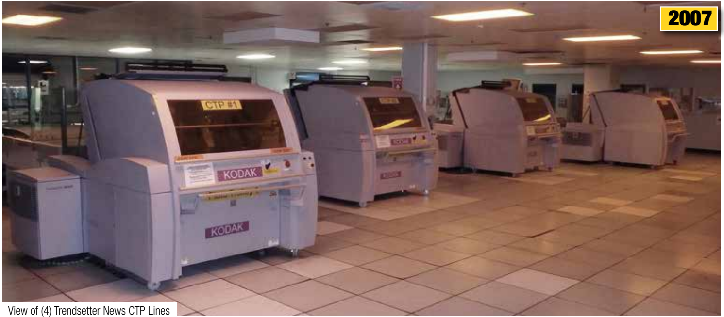
View of (4) Trendsetter News CTP Lines