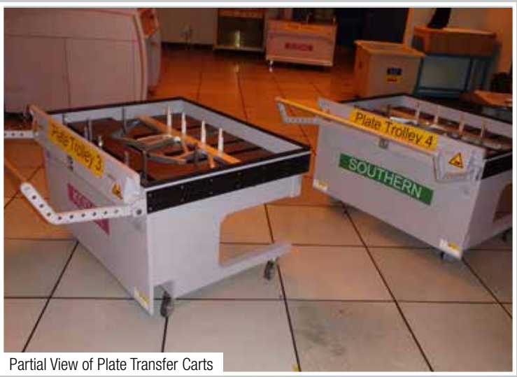
Partial View of Plate Transfer Carts