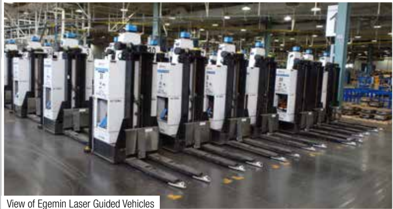
View of Egemin Laser Guided Vehicles