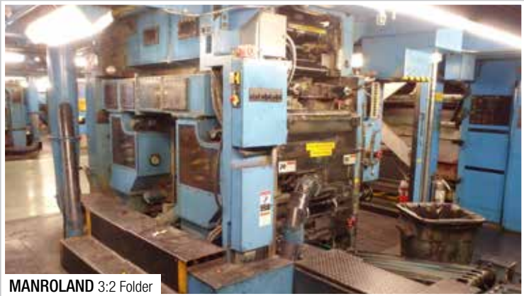
MANROLAND 3:2 Folder