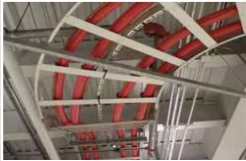
Partial View of Tech Cable and Spare High Voltage Switch Gear