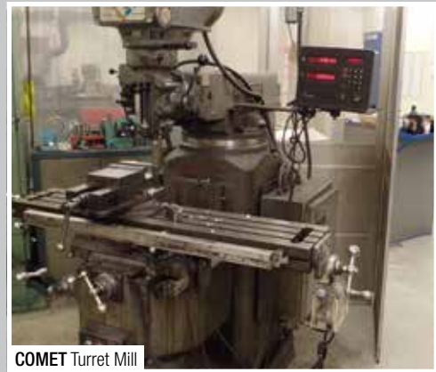
COMET Turret Mill