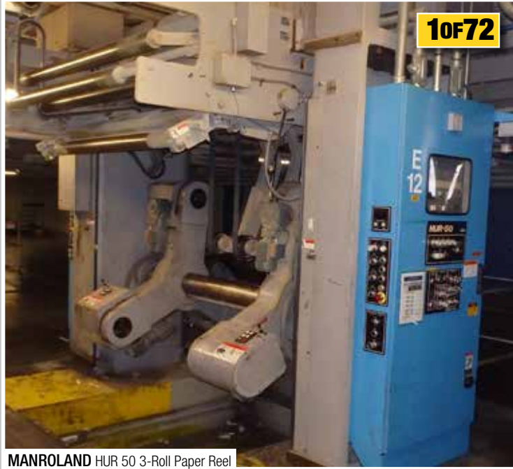
MANROLAND HUR 50 3-Roll Paper Reel