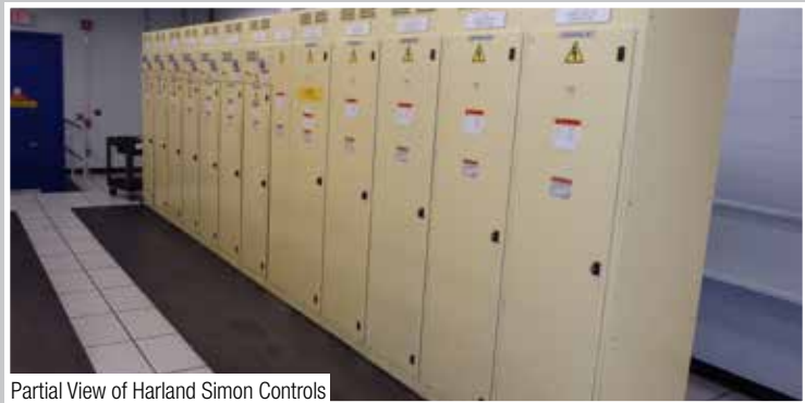
Partial View of Harland Simon Controls