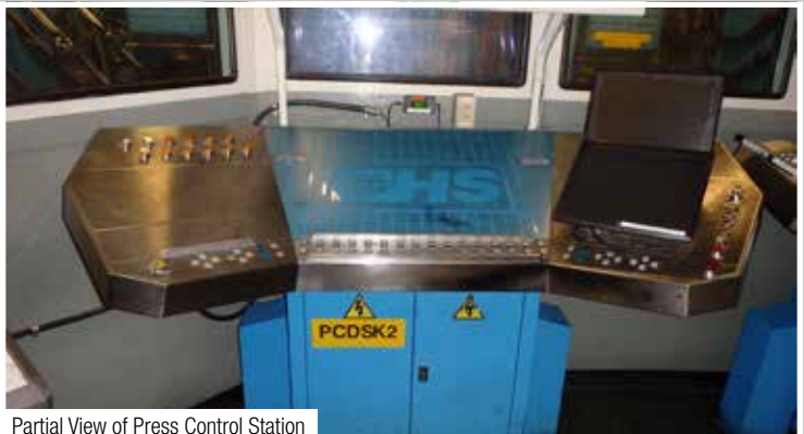
Partial View of Press Control Station