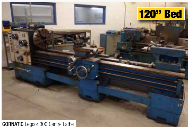
GORNATIC Legoor 300 Centre Lathe