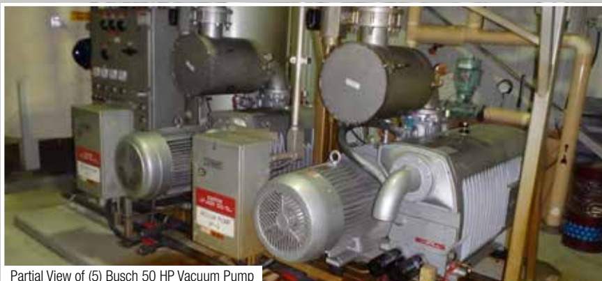
Partial View of (5) Busch 50 HP Vacuum Pump