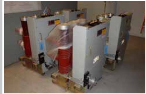
Partial View of Tech Cable and Spare High Voltage Switch Gear