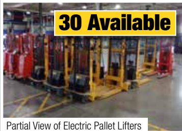
Partial View of Electric Pallet Lifters