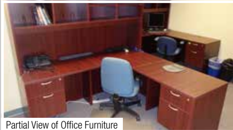
Partial View of Office Furniture