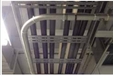
Partial View of Tech Cable and Spare High Voltage Switch Gear