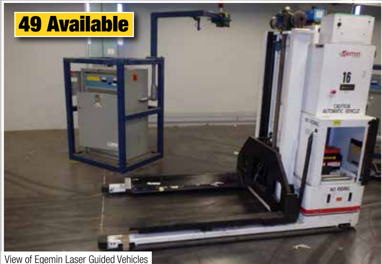
View of Egemin Laser Guided Vehicles

One Century Place Woodbridge (Toronto), ON