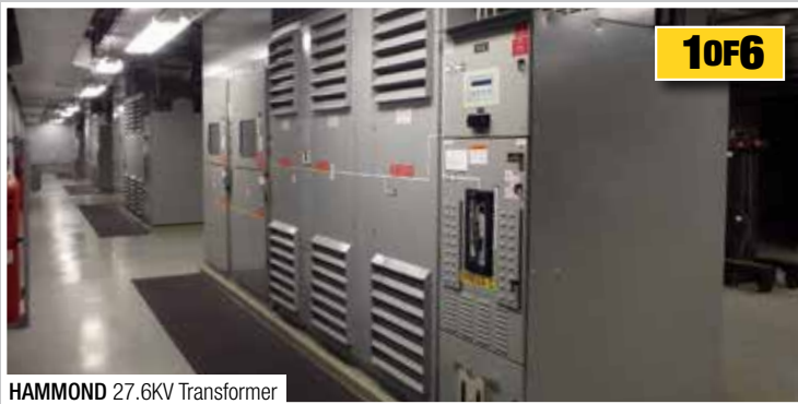
HAMMOND 27.6KV Transformer