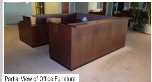
Partial View of Office Furniture

TERMS & CONDITIONS | PAYMENT: 25% NON-REFUNDABLE DEPOSIT ON AWARD OF BID, BALANCE WITHIN 24 HOURS. PAYMENT IS CASH, CASHIER'S CHECK, CERTIFIED CHECK, WIRE TRANSFER, COMPANY CHECK ONLY IF ACCOMPANIED BY A LETTER FROM YOUR BANK GUARANTEEING AMOUNT OF CHECK FOR DEPOSIT AND/OR PAYMENT IN FULL. NO PERSONAL CHECKS. FULL PAYMENT MUST BE MADE BEFORE REMOVAL OF PURCHASE. REMOVAL: LAST DAY OF REMOVAL IS FRIDAY, OCTOBER 28, 2016, AND AS FURTHER DEFINED IN THE SALE CATALOGUE, EVERYTHING IS SOLD "AS IS, WHERE IS". ALL SALES FINAL. COST AND RESPONSIBILITY FOR REMOVAL OF PURCHASE REMAINS WITH THE PURCHASER. EVERY EFFORT WILL BE MADE TO FACILITATE REMOVAL. WHILE QUANTITIES AND DESCRIPTIONS ARE BELIEVED TO BE ACCURATE, THE AUCTIONEER, OWNERS OR COUNSEL MAKE NO WARRANTIES OR GUARANTEES EITHER EXPRESSED OR IMPLIED AS TO AUTHENTICITY, GENUINENESS OF, OR DEFECTS IN ANY LOT AND WILL NOT BE HELD RESPONSIBLE FOR ANY ADVERTISING DISCREPANCIES OR INACCURACIES. NO WARRANTIES WHATSOEVER ARE MADE AS TO CONDITION, MERCHANTABILITY OR FITNESS FOR USE OF ANY ITEM. MAY WE SUGGEST YOU TAKE FULL ADVANTAGE OF THE PREVIEW AND INSPECTION PERIOD. SALE SUBJECT TO ADDITIONS, DELETIONS & PRIOR SALES. PLEASE CHECK AVAILABILITY OF EQUIPMENT. BUYERS PREMIUMS: 15% ON-SITE, 18% ONLINE