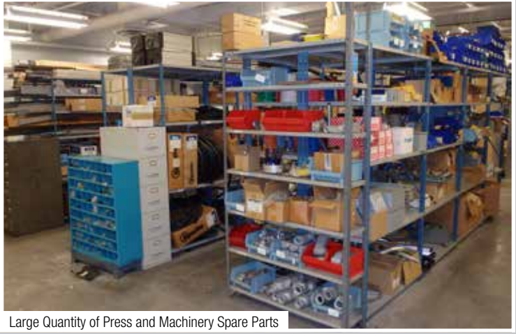
Large Quantity of Press and Machinery Spare Parts