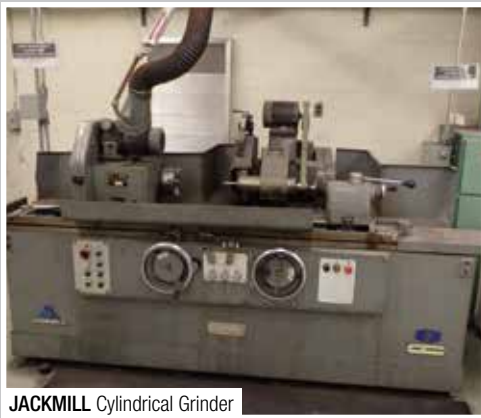
JACKMILL Cylindrical Grinder