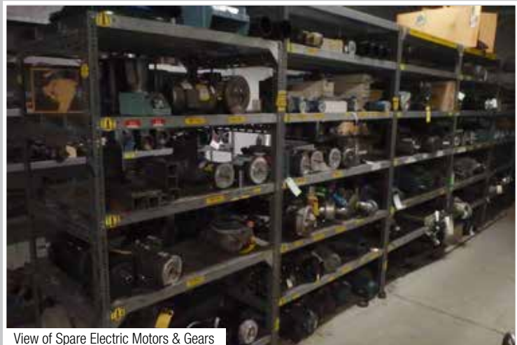
View of Spare Electric Motors & Gears