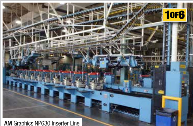
AM Graphics NP630 Inserter Line