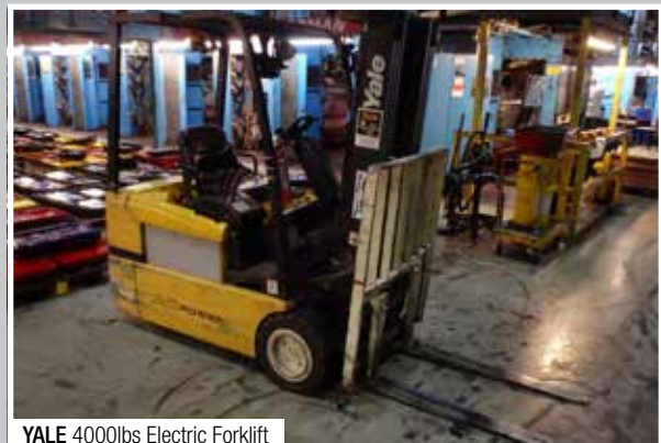
YALE 4000lbs Electric Forklift