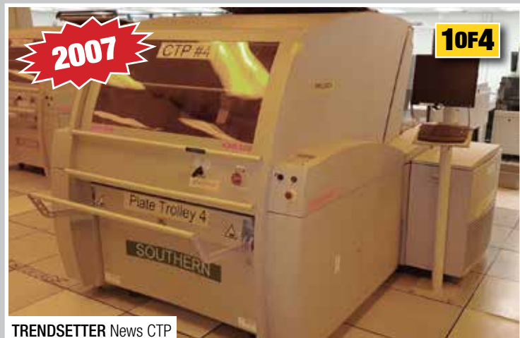
TRENDSETTER News CTP