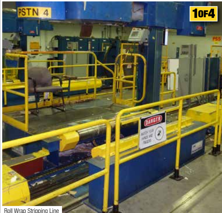
Roll Wrap Stripping Line