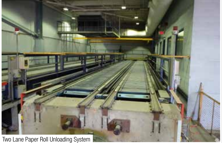
Two Lane Paper Roll Unloading System