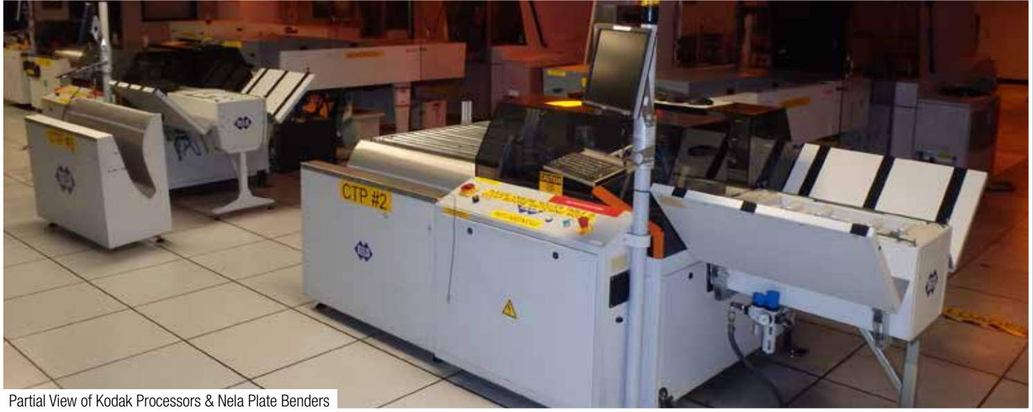
Partial View of Kodak Processors & Nela Plate Benders