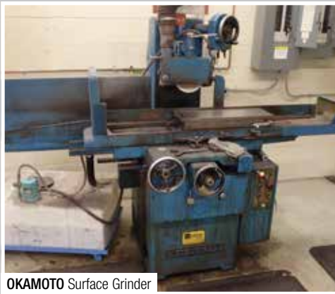
OKAMOTO Surface Grinder