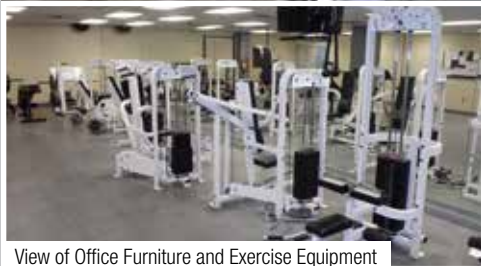
View of Office Furniture and Exercise Equipment