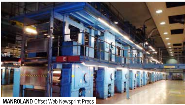
MANROLAND Offset Web Newsprint Press