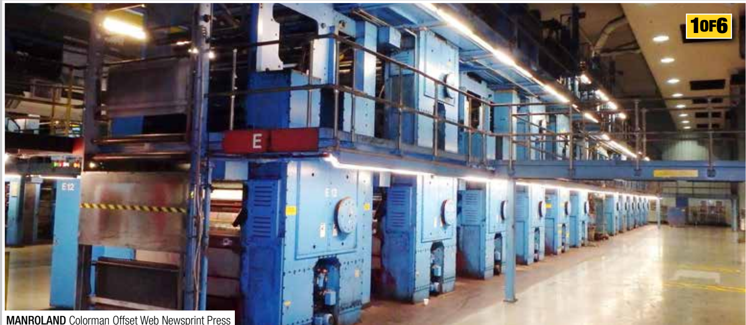
MANROLAND Colorman Offset Web Newsprint Press