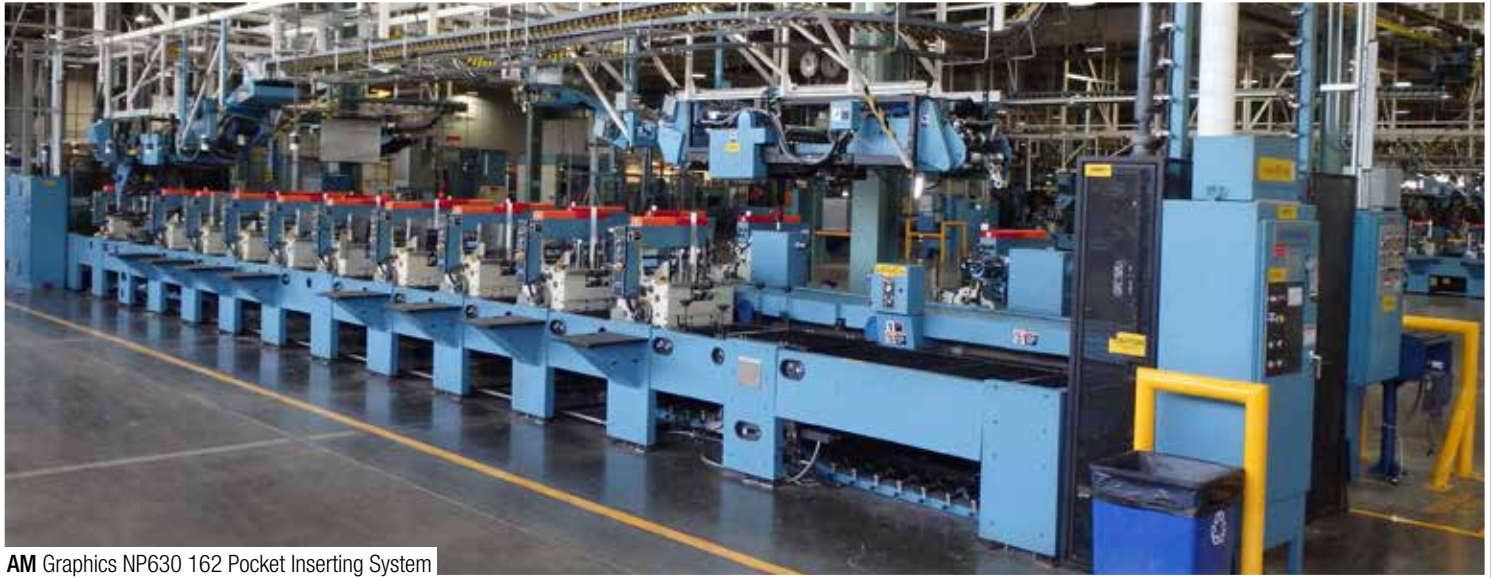
AM Graphics NP630 162 Pocket Inserting System