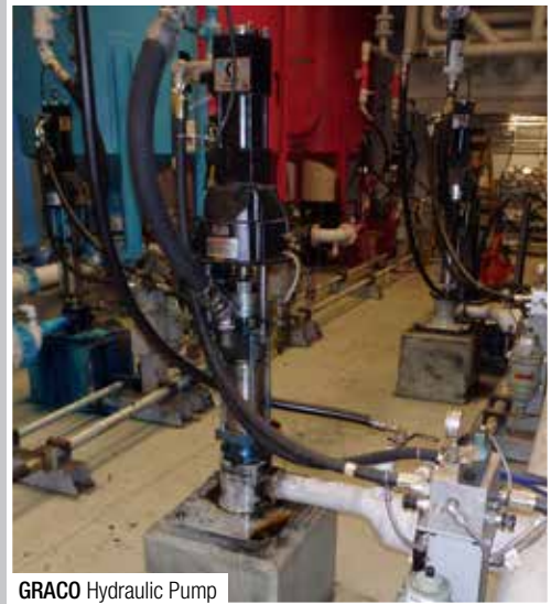
View of Ink Room Equipment