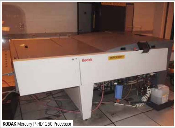
KODAK Mercury P-HD1250 Processor