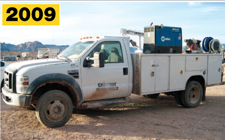
FORD F550XL SERVICE TRUCK