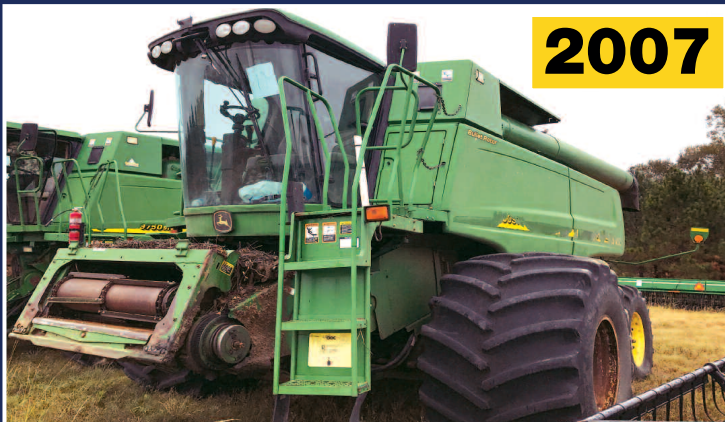
JOHN DEERE MODEL 9860STS COMBINE

FOR FURTHER INFO. CONTACT: Taso Sofikitis at (248) 569-9781 or email taso@maynards.com