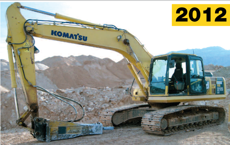
KOMATSU HB215LC-1 HYBRID EXCAVATOR