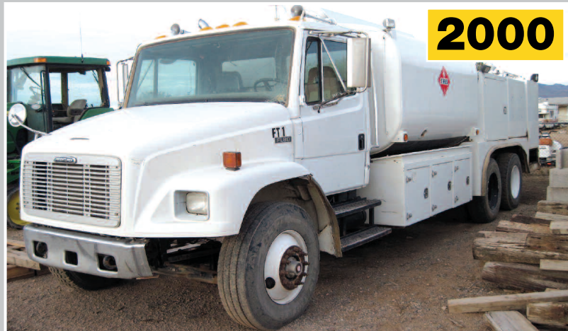
FREIGHTLINER FL80 FUEL TRUCK

For further info. contact: Taso Sofikitis at (248) 569-9781 or email taso@maynards.com