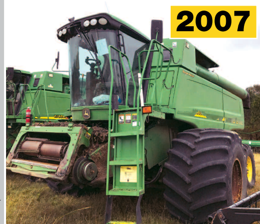
JOHN DEERE MODEL 9860STS COMBINE