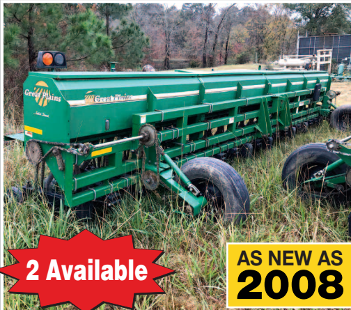
GREAT PLAINS MODEL 2700 GRAIN DRILL