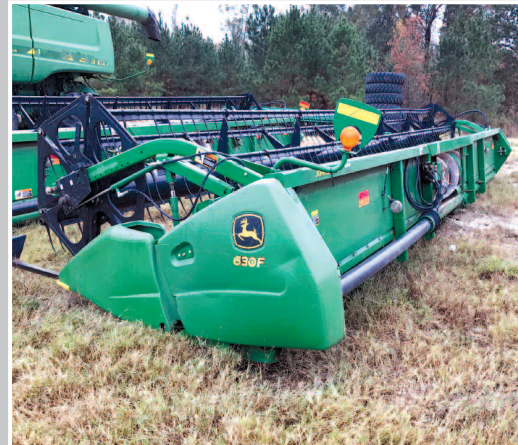
JOHN DEERE MODEL 630F COMBINE ATTACHMENT