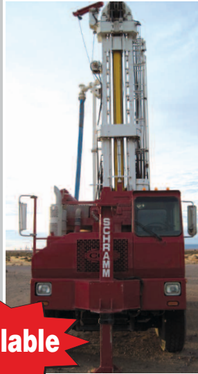
SCHRAMM T-130XD & TM-130XD WELL DRILLING RIGS

EQUIPMENT LOCATED IN GOLDEN VALLEY FARM 4536 W. Dora Drive, Golden Valley, AZ