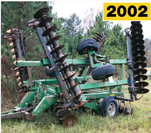
JOHN DEERE MODEL 637 DISC