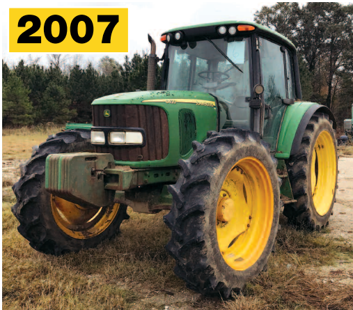
JOHN DEERE MODEL 6420 TRACTOR