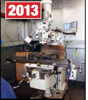
ENCO Milling Machine